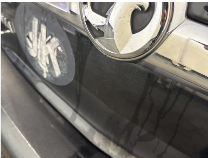
13: Tailgate Scratched Up To 25mm Thru Paint