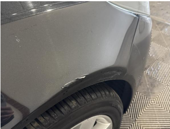
17: Wing osf Dented With Paint Damage