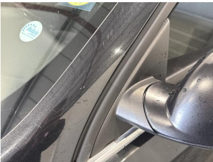
7: A Post ns Scratched Over 25mm Thru Paint