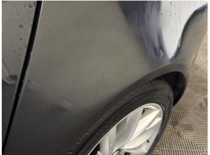
10: Qtr Panel nsr Poor Previous Repair Poor Paint