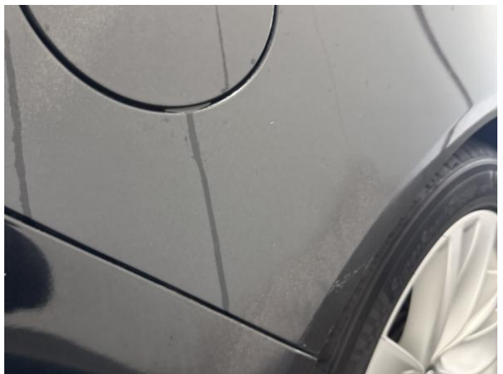
14: Qtr Panel osr Poor Previous Repair Poor Paint