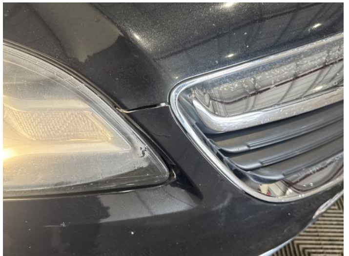
2: Bumper Front Cracked Over 25mm