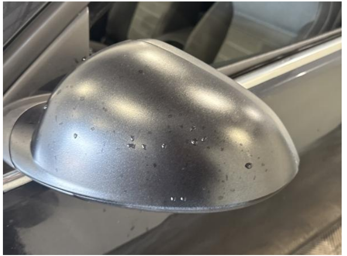
6: Door Mirror Assy nsf Scratched (Painted) Over 25mm Thru Paint