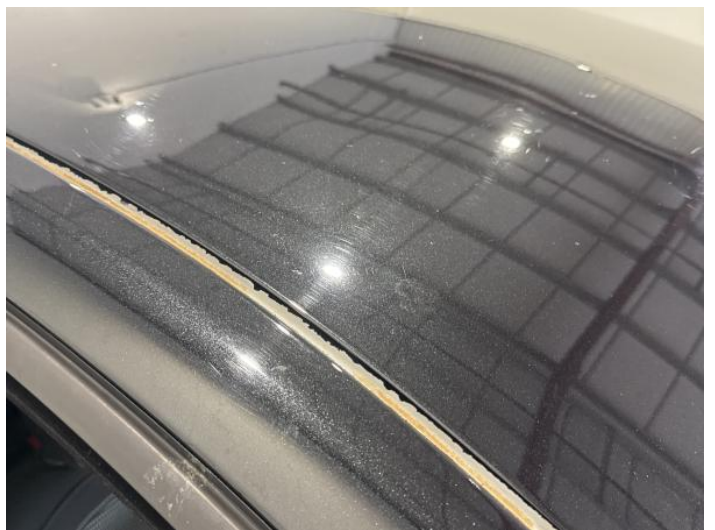
20: Roof Scratched Rusted