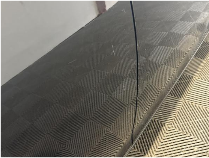
15: Door osr Scratched Over 25mm Thru Paint