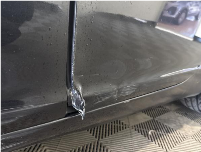
9: Door nsr Dented With Paint Damage