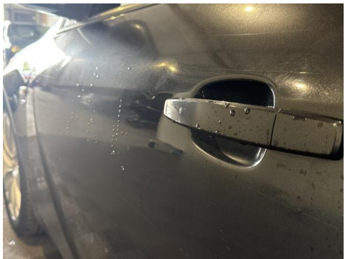
8: Door nsf Poor Previous Repair Rippled Up To 30%