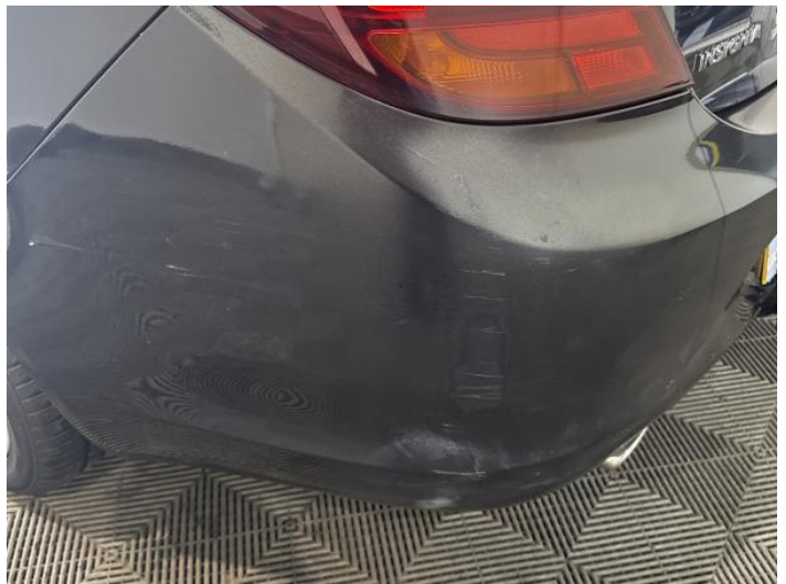
12: Bumper Rear Poor Previous Repair Poor Paint