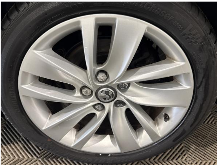
11: Wheel nsr Scratched Up To 50mm