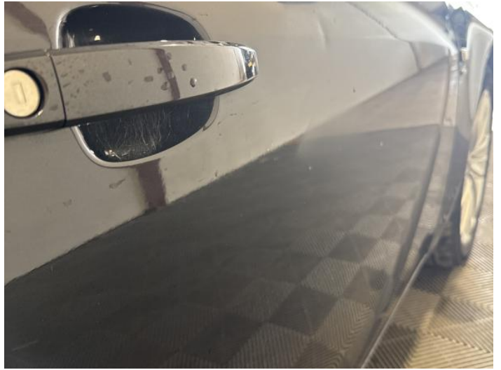
16: Door osf Dented With Paint Damage