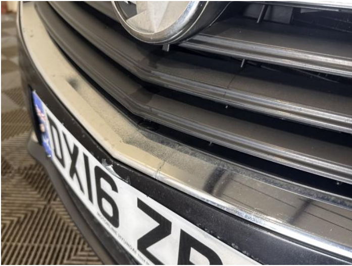
3: Bumper Front Grill Broken Replace