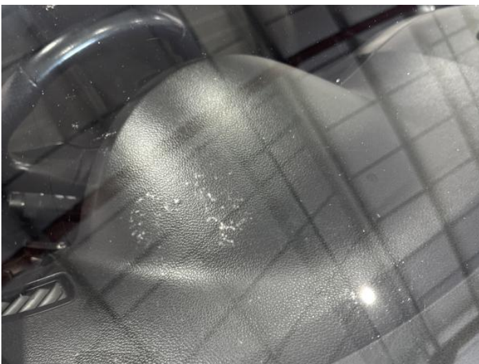
19: Screen Front Chipped UpTo 10mm