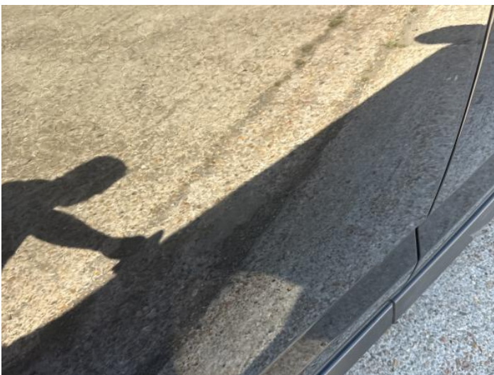
13: Door osr Scratched Over 25mm Thru Paint