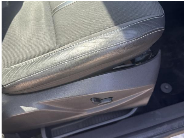
18: Fascia Trim Damaged Replace