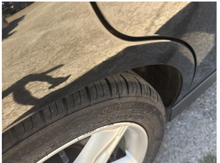
12: Qtr Panel osr Scratched Over 25mm Thru Paint