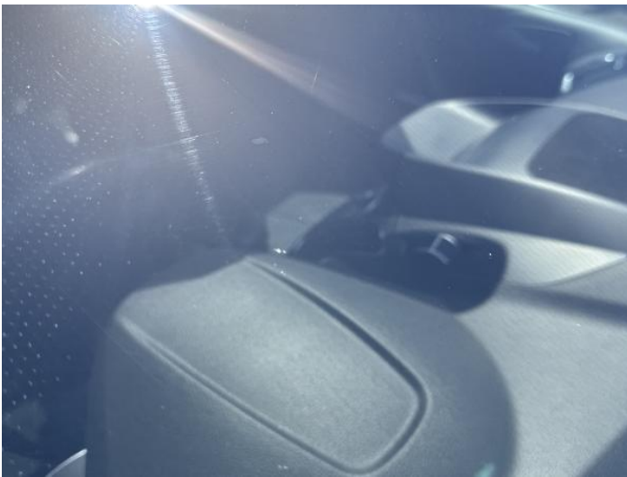
17: Screen Front Chipped Up To 10mm