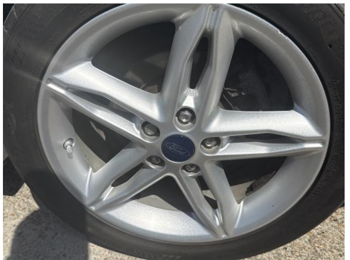
8: Wheel nsr Scratched Up To 50mm