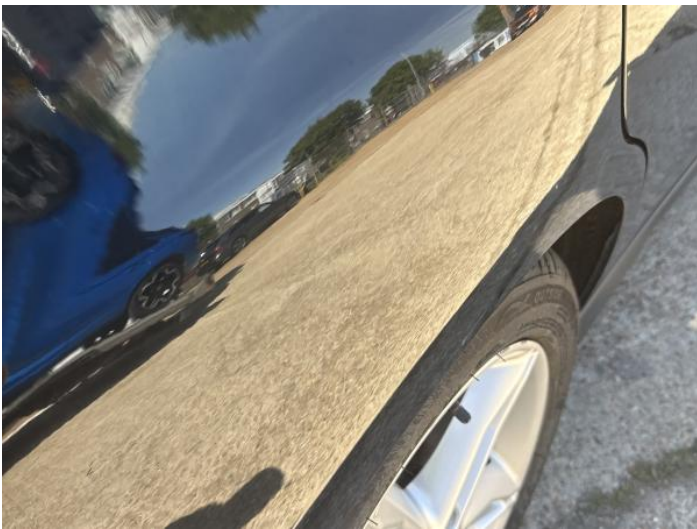
11: Qtr Panel osr Dented 2 Or Less UpTo 10mm