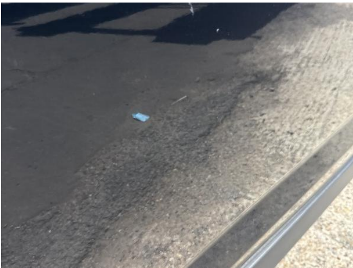
5: Door nsf Scratched Up To 25mm Thru Paint