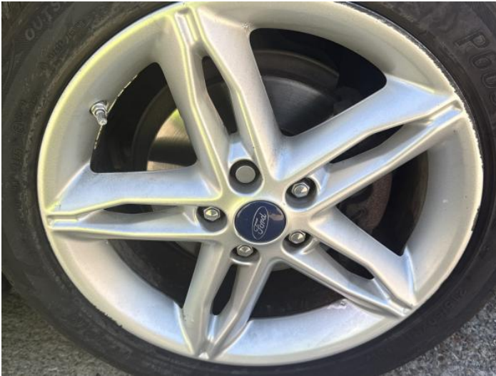
15: Wheel of Scratched Over 50mm