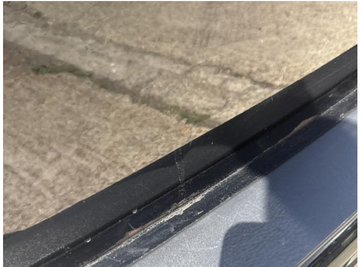
10: Tailgate Scratched Rusted