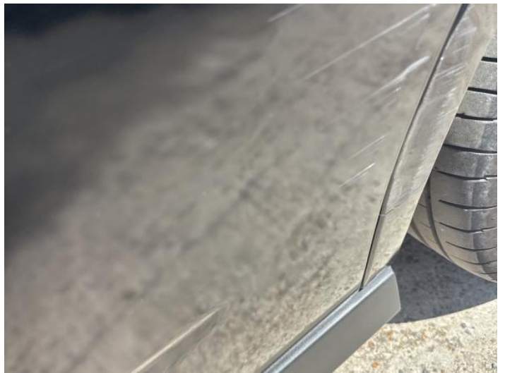
6: Door nsr Scratched Over 25mm Thru Paint