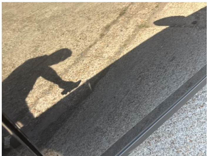
14: Door osf Scratched UpTo 25mm Thru Paint