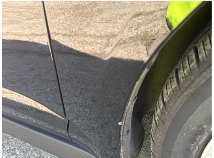
16: Wing of Scratched Up To 25mm Thru Paint