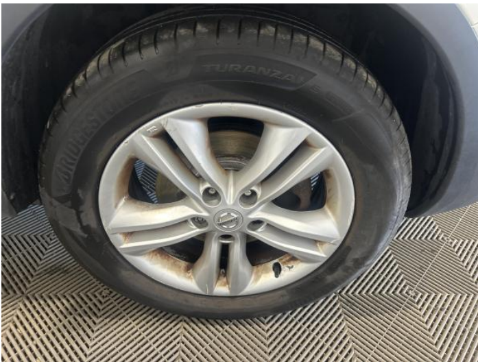
1: Wheel of Scratched Over 50mm