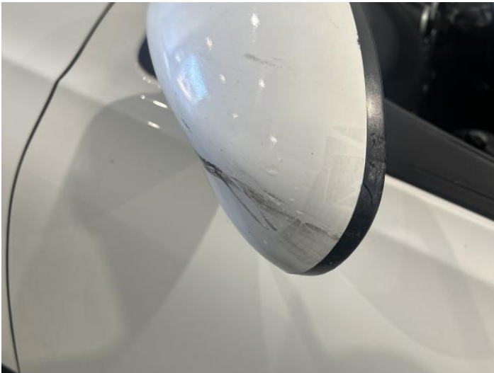
11: Door nsf Scratched Over 25mm Thru Paint