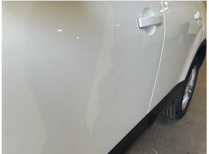
16: Door nsf Poor Previous Repair Poor Paint