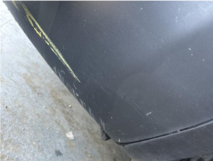
15: Bumper Front Moulding Scuffed (Unpainted) Over 100mm