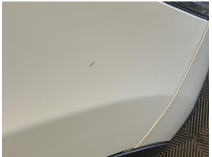
2: Wing of Chipped 1 To 5