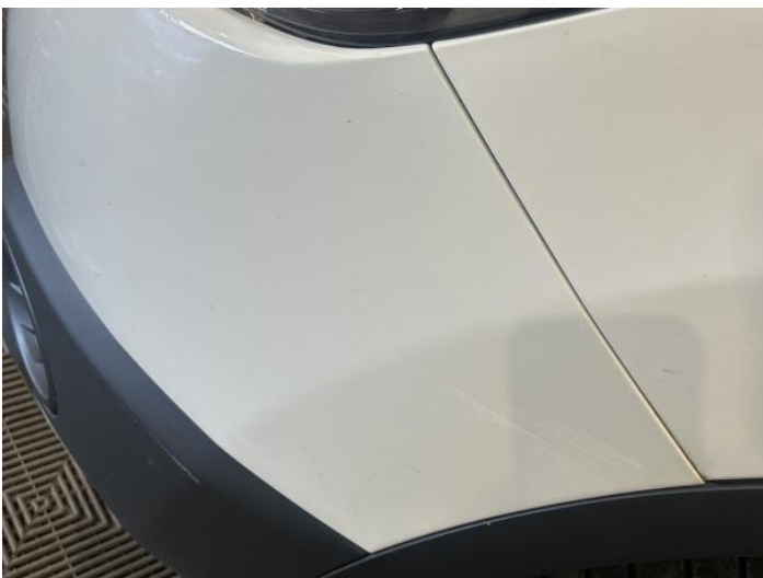
13: Bumper Front Scratched 25 to 100mm Thru Paint