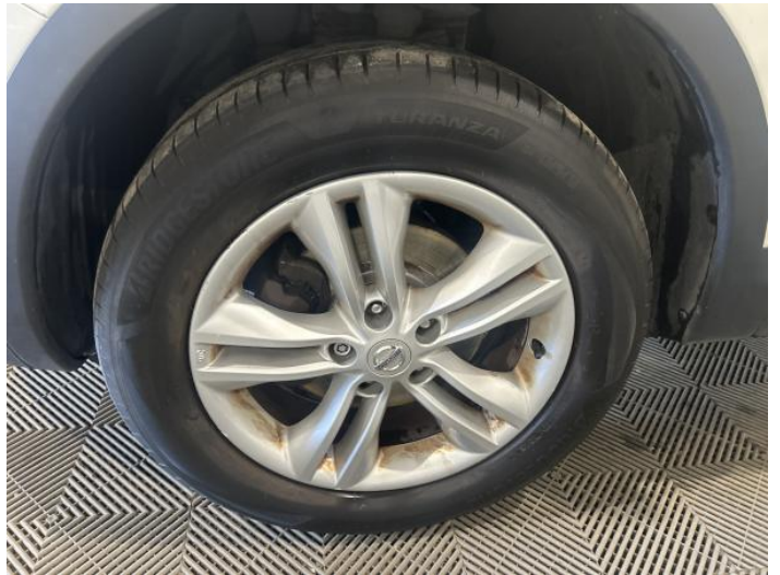
12: Wheel nsf Scratched Up To 50mm