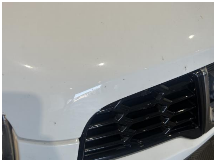
14: Bonnet Chipped 1 To 5