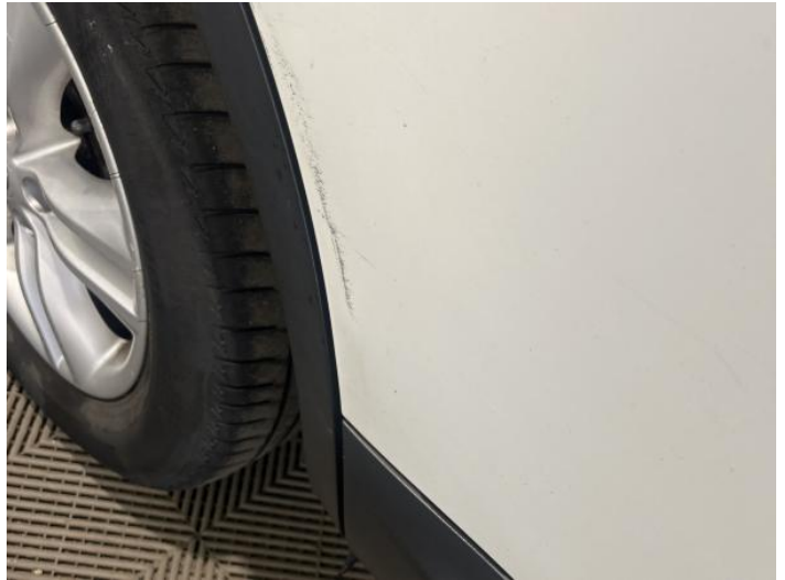
4: Door osr Scratched Over 25mm Thru Paint