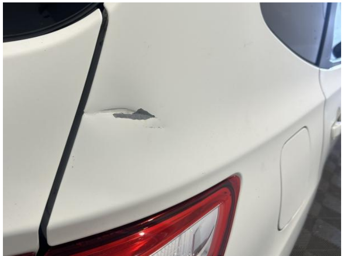
6: Qtr Panel osr Dented With Paint Damage