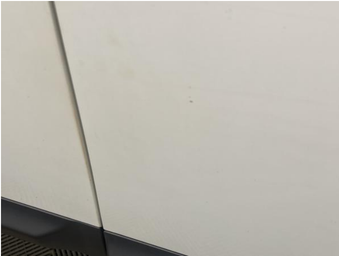
3: Door osf Chipped 1 To 5