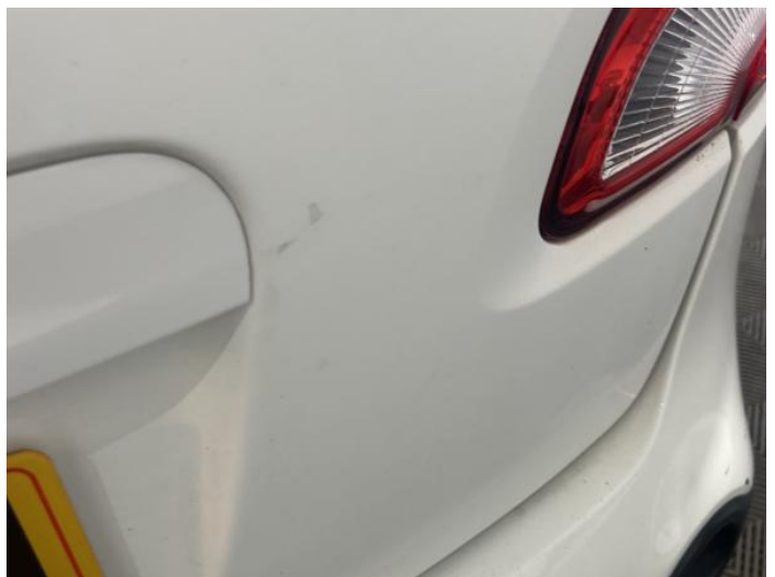
8: Tailgate Chipped 1 To 5