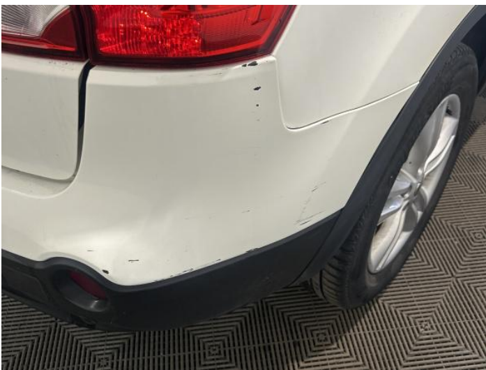
7: Bumper Rear Scratched Over 100mm Thru Paint