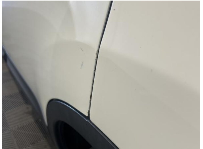
10: Door nsr Chipped Edge Chip