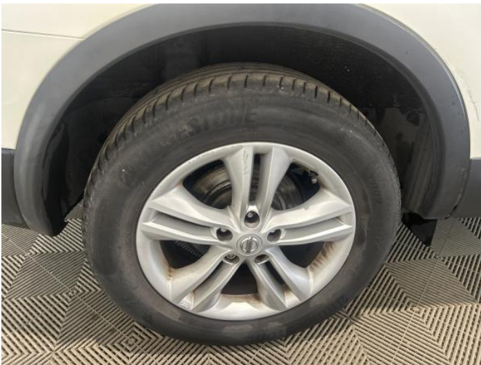
5: Wheel osr Scratched Over 50mm