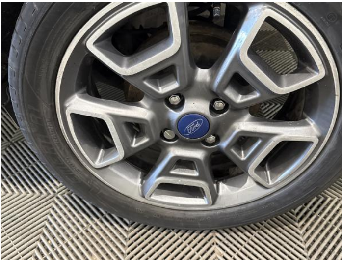
5: Wheel nsr Scratched Over 50mm