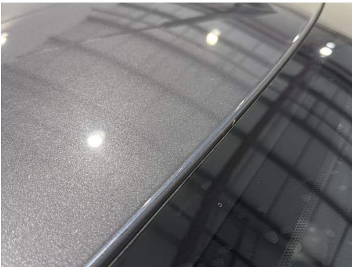
11: Roof Dented Between 10mm + 30mm