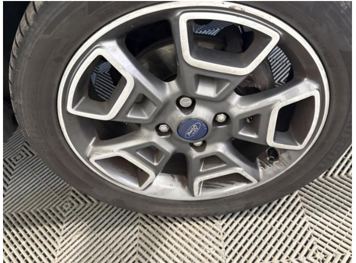
10: Wheel osf Scratched Over 50mm