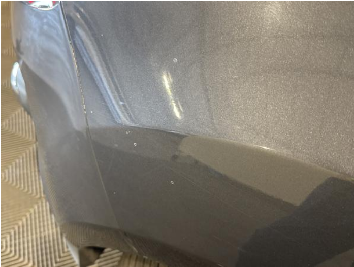
3: Wing nsf Poor Previous Repair Paint Flake