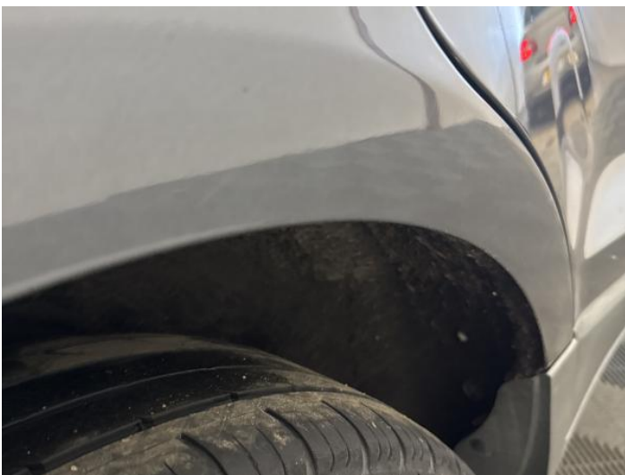
7: Qtr Panel osr Dented Between 10mm + 30mm