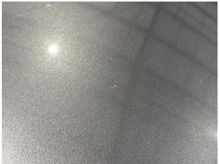
12: Roof Chipped 1 To 5