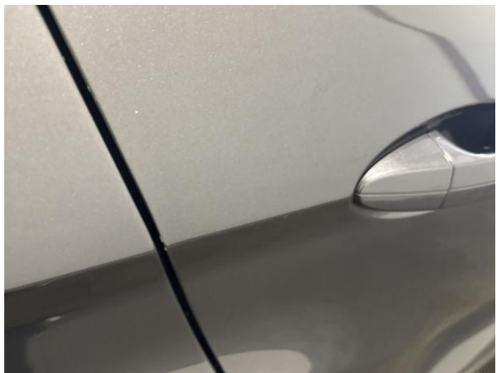
8: Door osr Chipped Edge Chip