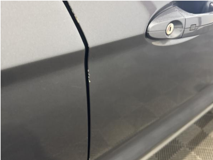
9: Door osf Chipped Edge Chip