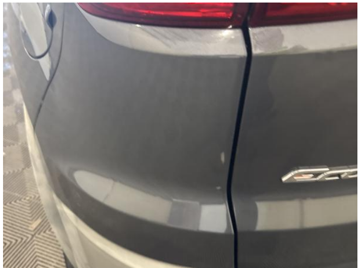
6: Bumper Rear Scratched 25 to 100mm Thru Paint