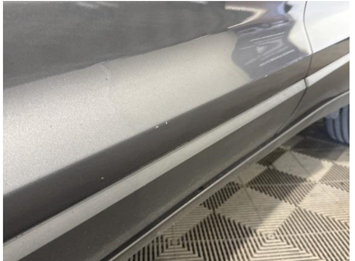
4: Door nsf Chipped Multiple Chips