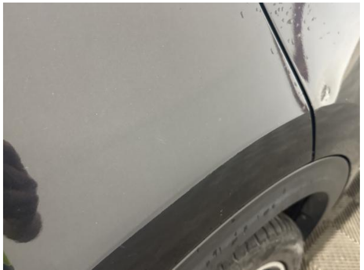
12: Qtr Panel osr Scratched Over 25mm Thru Paint