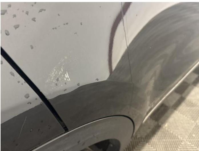
13: Door osr Dented With Paint Damage