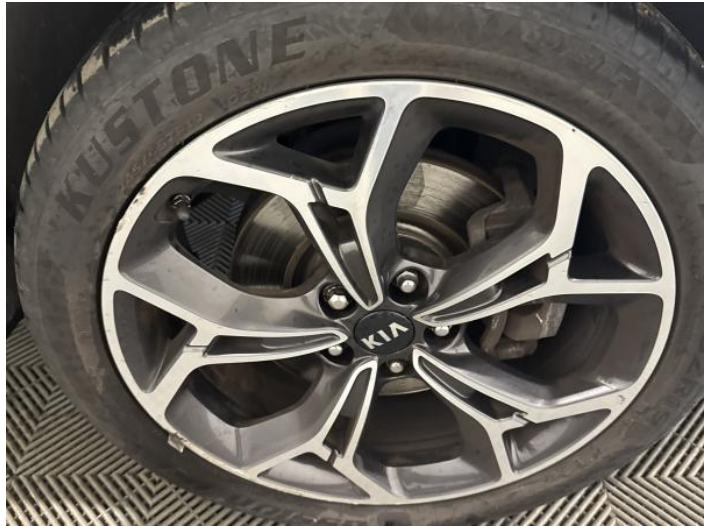
16: Wheel osf Scratched Over 50mm