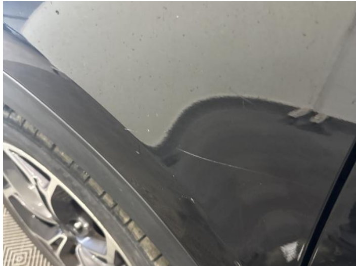
4: Wing nsf Scratched Over 25mm Thru Paint