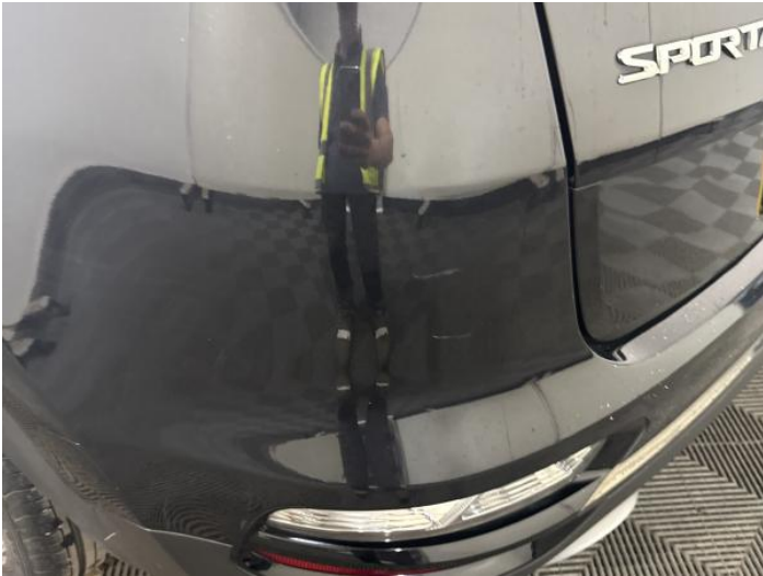
9: Bumper Rear Scratched 25 to 100mm Thru Paint