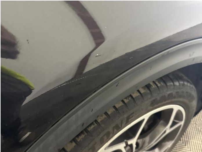
15: Wing osf Scratched Over 25mm Thru Paint