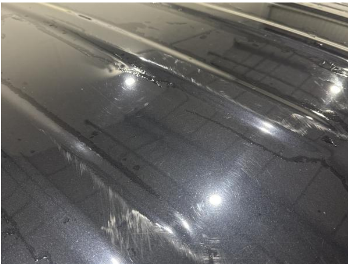
17: Roof Scratched Over 25mm Thru Paint