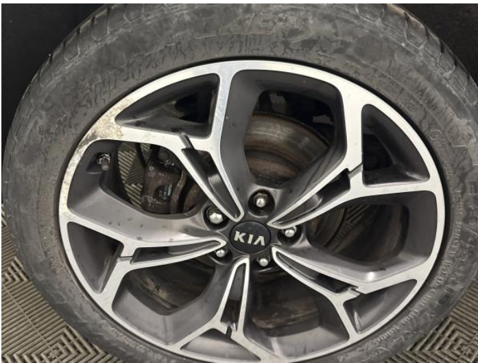
11: Wheel osr Scratched Over 50mm