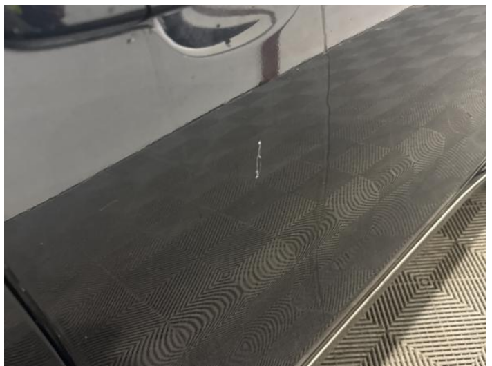
14: Door osf Scratched Over 25mm Thru Paint