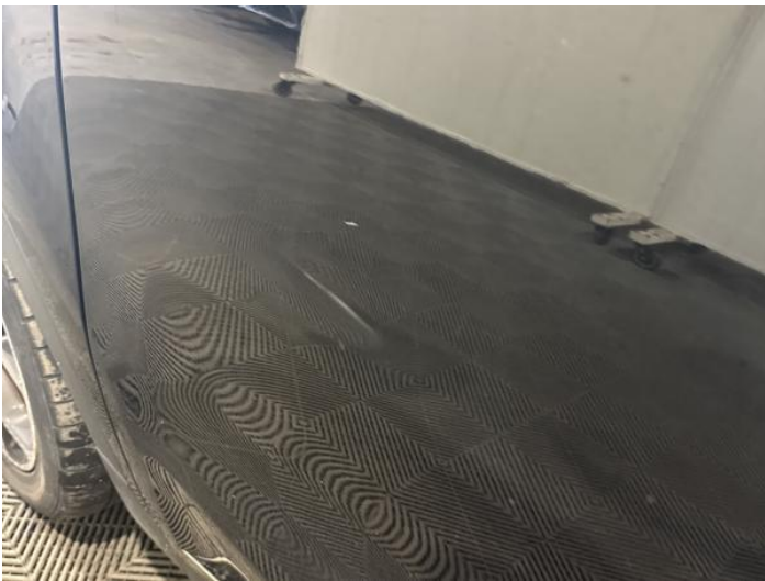
5: Door nsf Dented With Paint Damage