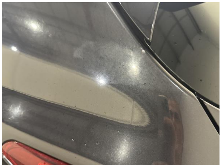
8: Qtr Panel nsr Poor Previous Repair Poor Paint