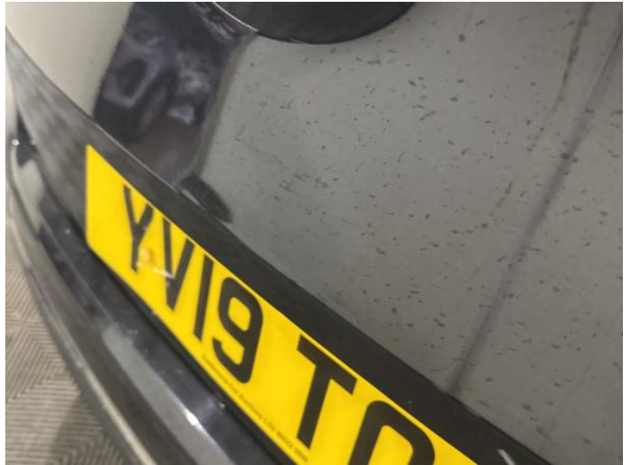
10: Tailgate Scratched Over 25mm Thru Paint