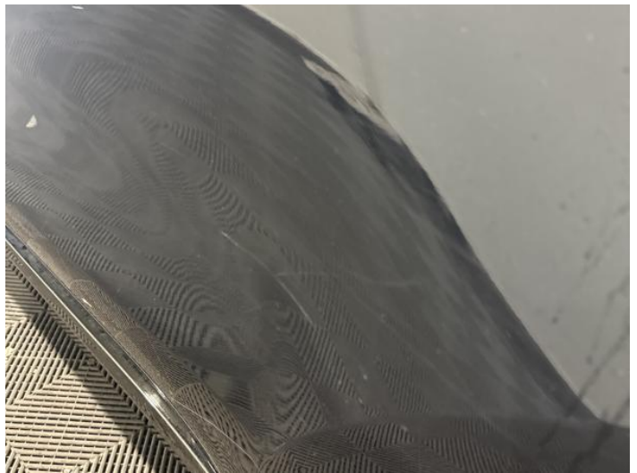
6: Door nsr Scratched Over 25mm Thru Paint