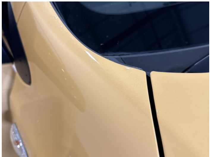
12: Wing osf Dented Between 10mm + 30mm