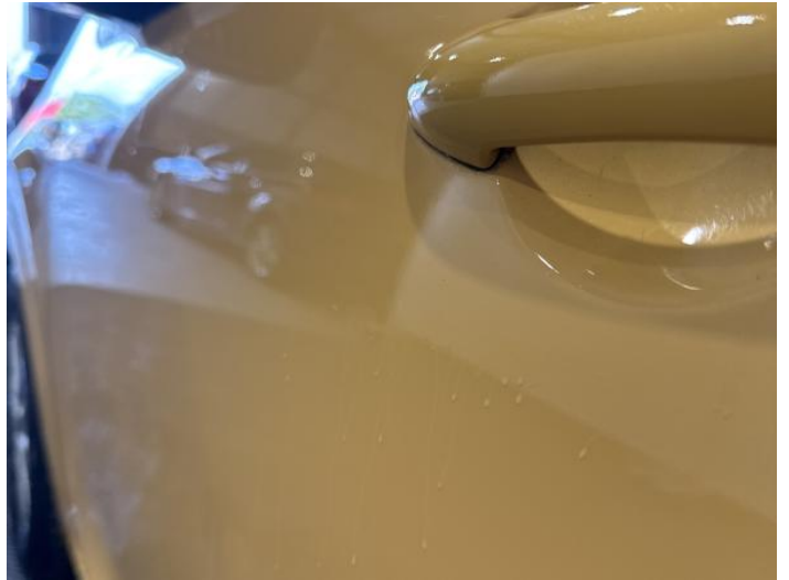
4: Door nsf Scratched Over 25mm Thru Paint