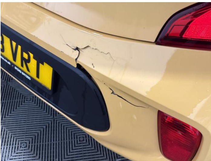
7: Bumper Rear Cracked Over 25mm