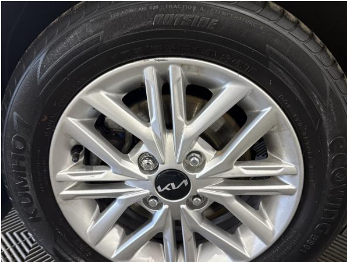
3: Wheel nsf Scratched Up To 50mm