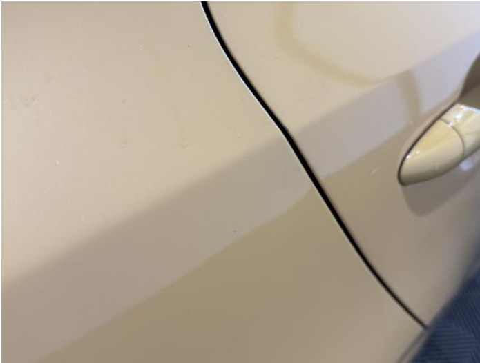
9: Qtr Panel osr Dented 2 Or Less UpTo 10mm