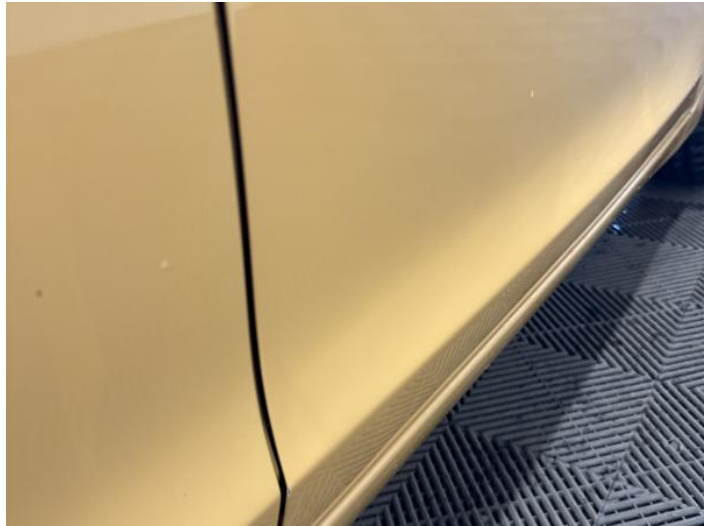
10: Door osf Chipped Edge Chip