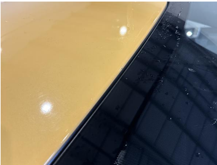
11: Roof Chipped Edge Chip