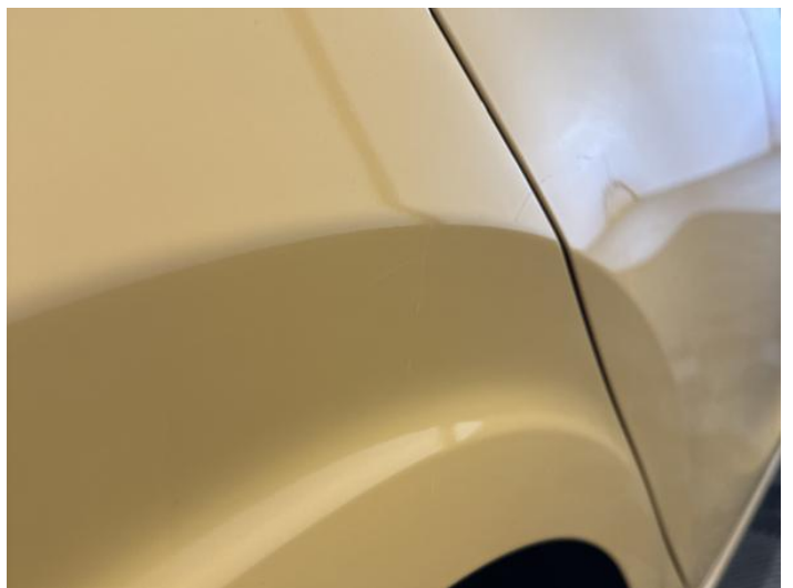
8: Qtr Panel osr Scratched Up To 25mm Thru Paint