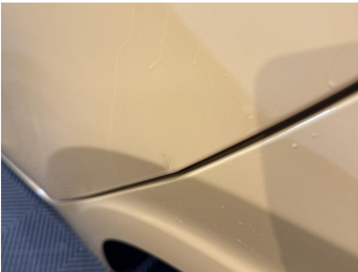
5: Door nsr Dented Between 10mm + 30mm