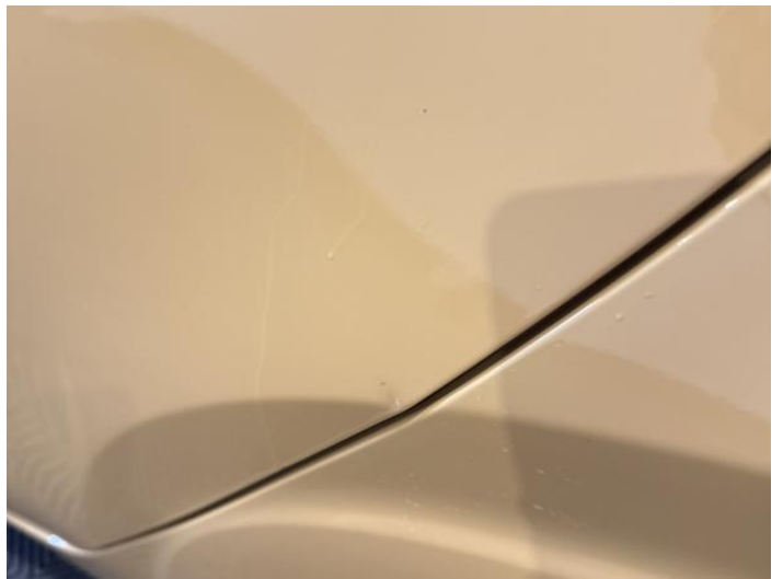
6: Door nsr Chipped 1 To 5