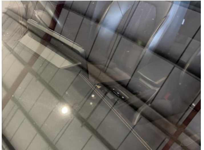
4: Screen Front Chipped UpTo 10mm