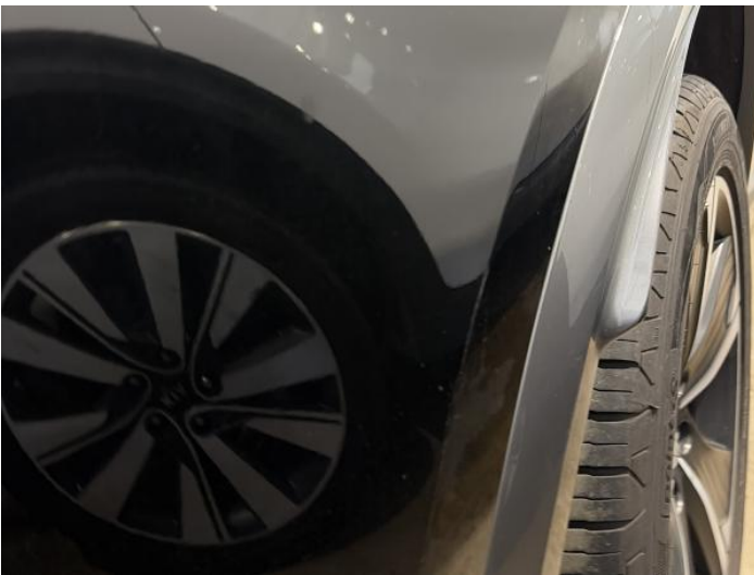
5: Bumper Rear Scratched 25 to 100mm Thru Paint