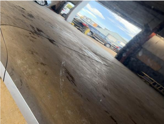
3: Door nsr Scratched Over 25mm Thru Paint