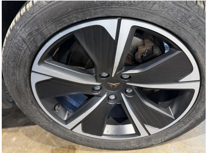
10: Wheel osf Scratched Up To 50mm