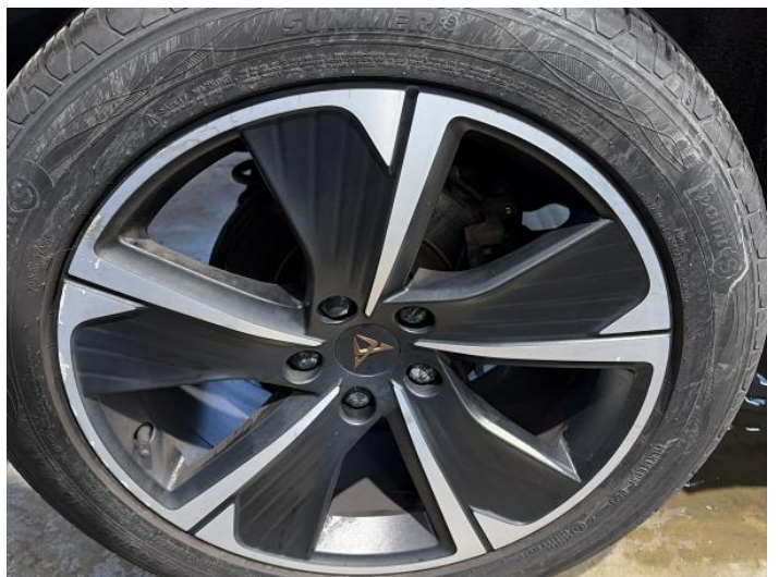
8: Wheel osr Scratched Over 50mm