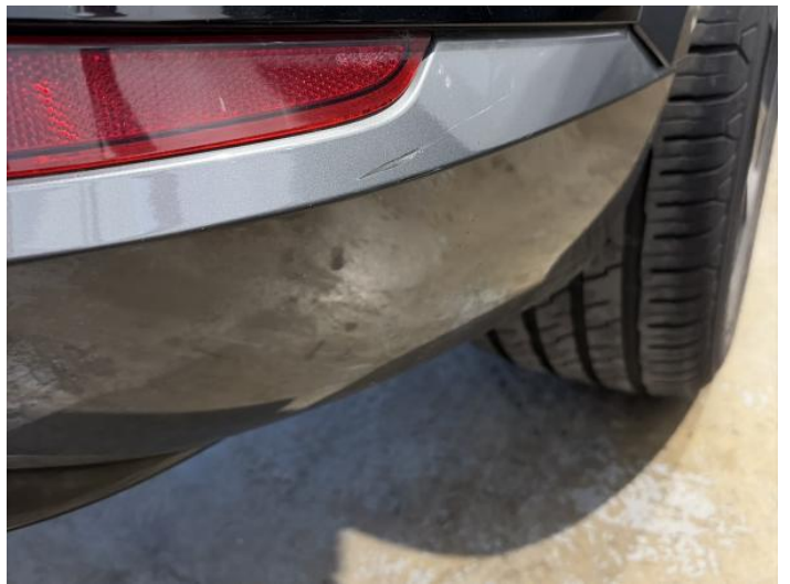
6: Bumper Rear Moulding Scratched (Painted) Over 25mm Thru Paint