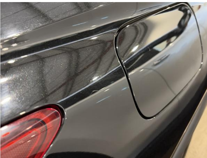
7: Qtr Panel osr Scratched UpTo 25mm Thru Paint