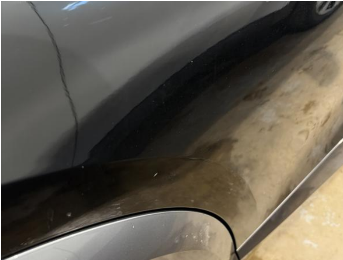
9: Door osr Chipped 1 To 5