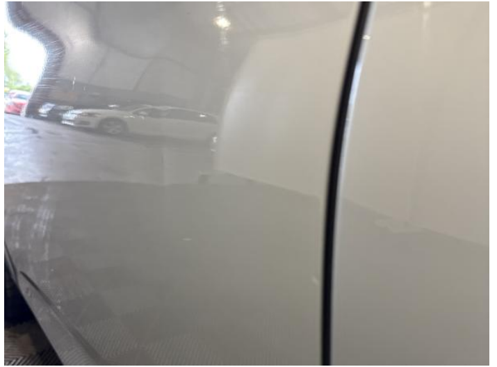
4: Door nsf Dented Over 30mm