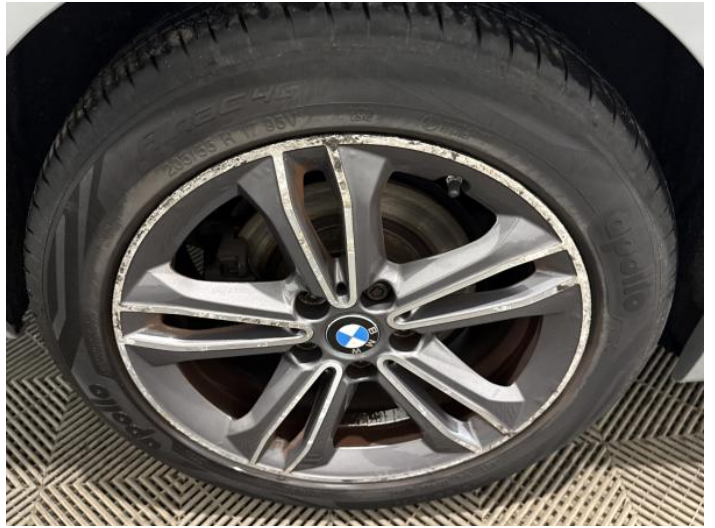
10: Wheel osr Scratched Over 50mm