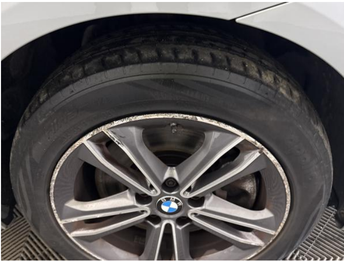
13: Wheel osf Scratched Over 50mm