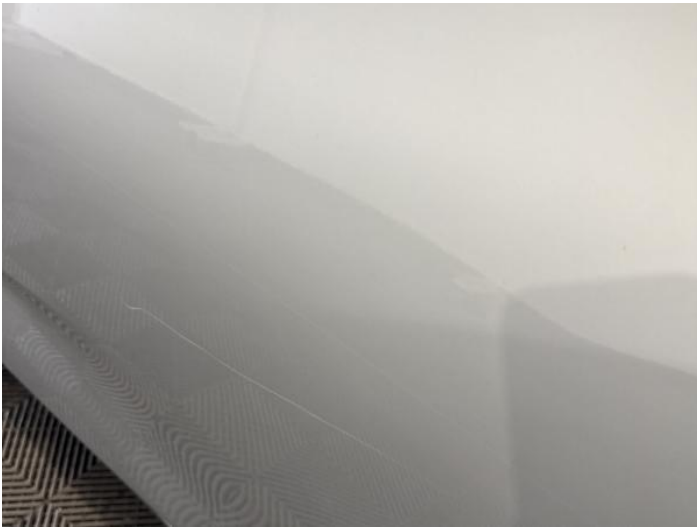
5: Door nsr Scratched Over 25mm Thru Paint