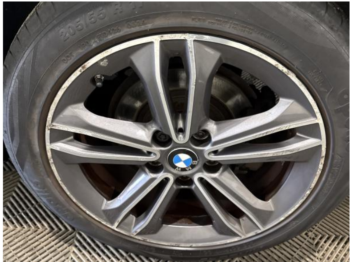
6: Wheel nsr Scratched Over 50mm