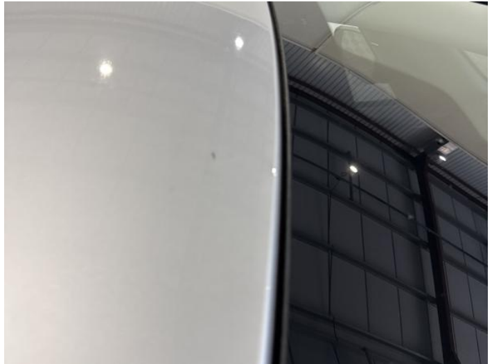
15: B Post os Scratched Over 25mm Thru Paint