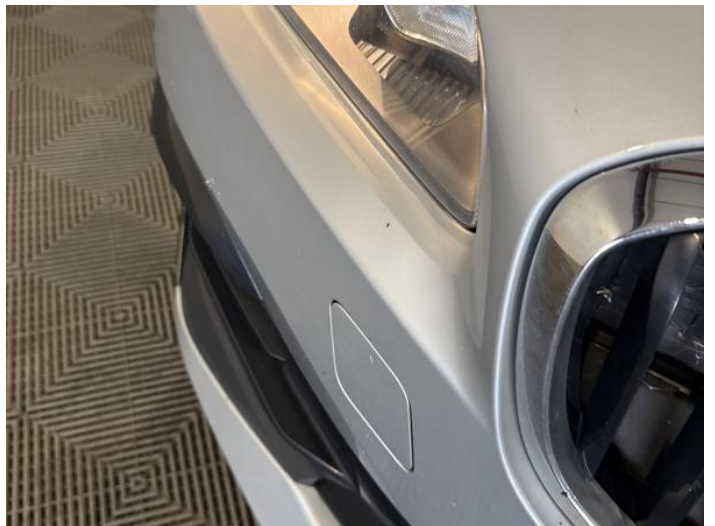
2: Bumper Front Dented With Paint Damage