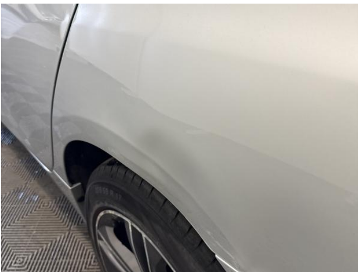
7: Qtr Panel nsr Dented With Paint Damage