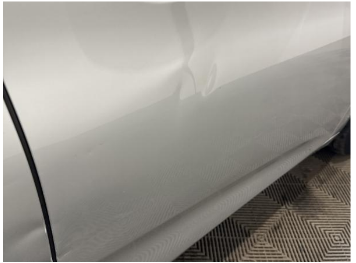
12: Door osf Dented With Paint Damage