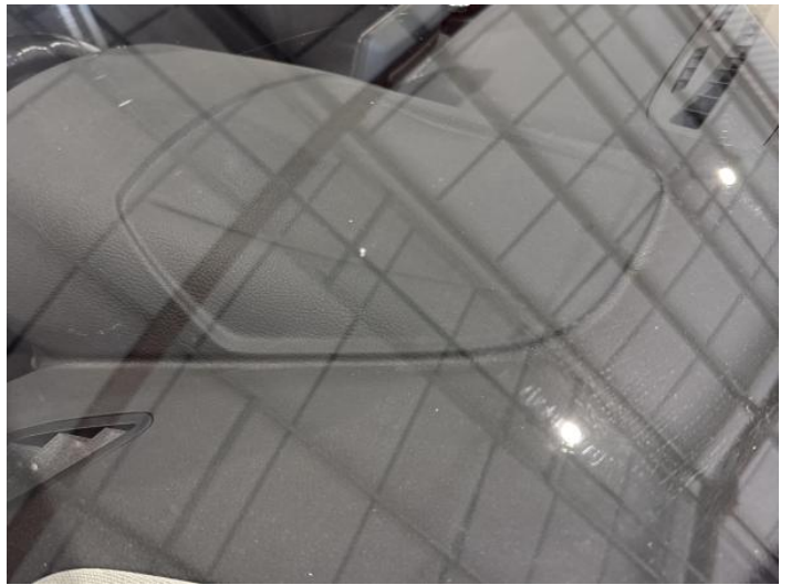
14: Screen Front Chipped UpTo 10mm