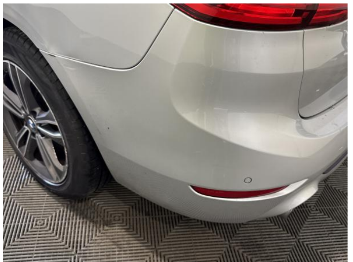
8: Bumper Rear Scratched Over 100mm Thru Paint