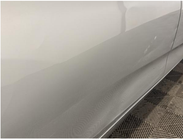
11: Door osr Dented With Paint Damage