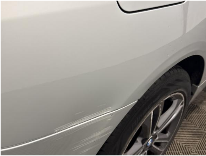
9: Qtr Panel osr Dented With Paint Damage