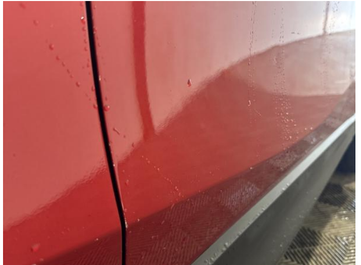
10: Door osf Scratched Over 25mm Thru Paint