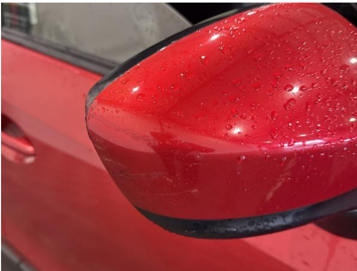
11: Door Mirror Assy osf Scratched (Painted) Over 25mm Thru Paint