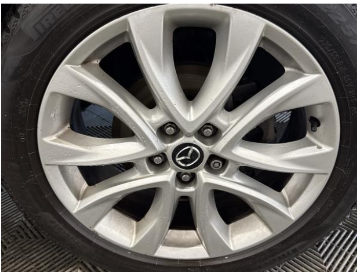
13: Wheel osf Scratched Over 50mm