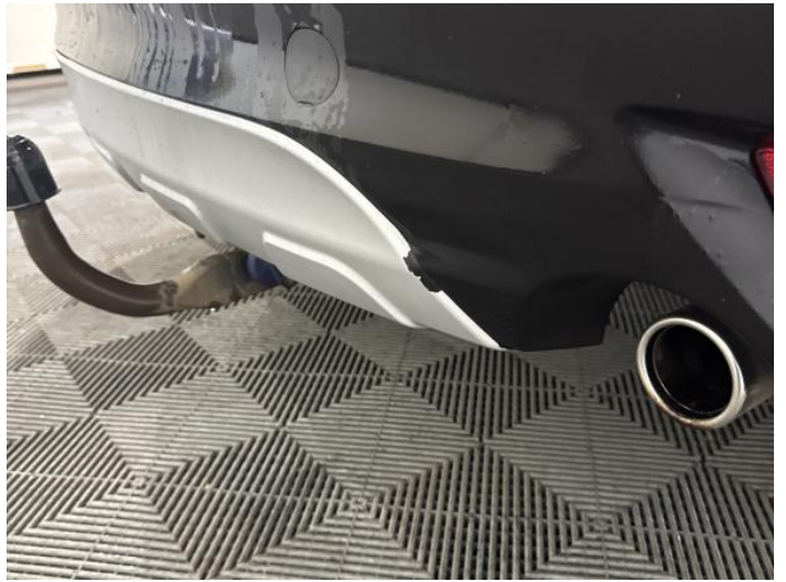
6: Bumper Rear Moulding Scratched (Painted) Over 25mm Thru Paint