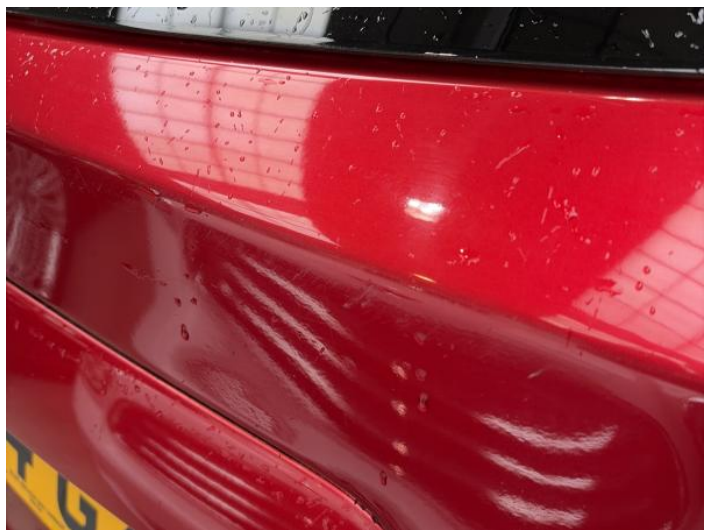
14: Tailgate Scratched Over 25mm Thru Paint