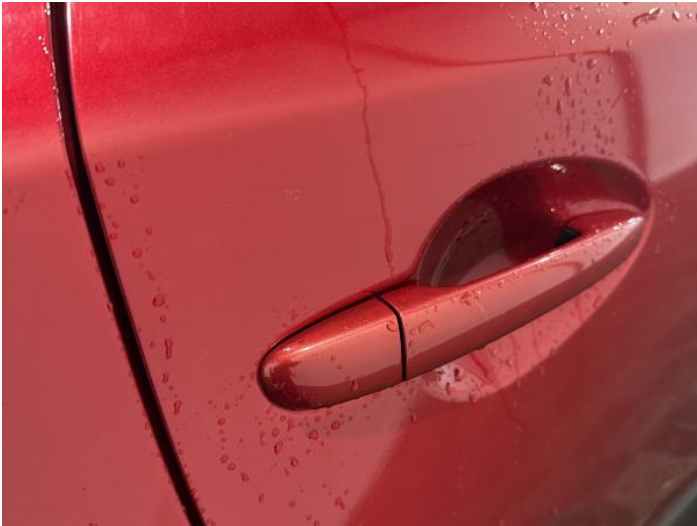
9: Door osr Poor Previous Repair Poor Paint