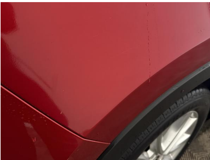
7: Qtr Panel osr Poor Previous Repair Poor Paint