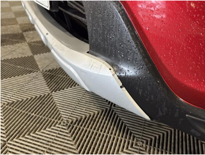
3: Bumper Front Moulding Scratched (Painted) Over 25mm Thru Paint