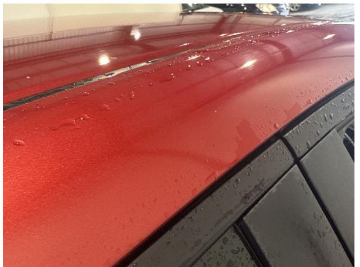
8: B Post os Poor Previous Repair Poor Paint