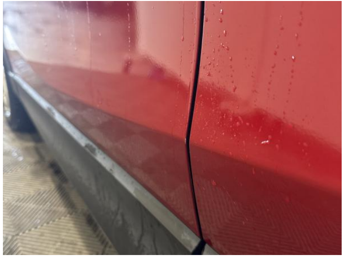
4: Door nsf Chipped Edge Chip