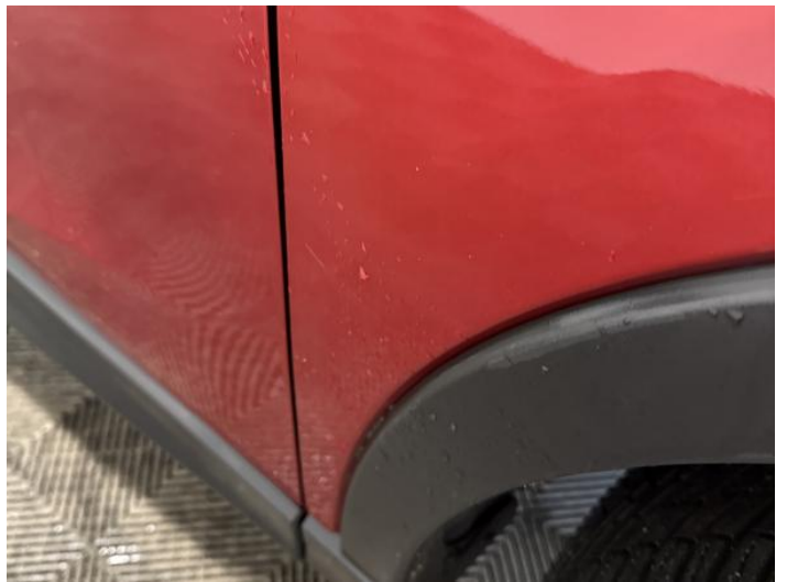
12: Wing osf Scratched Over 25mm Thru Paint