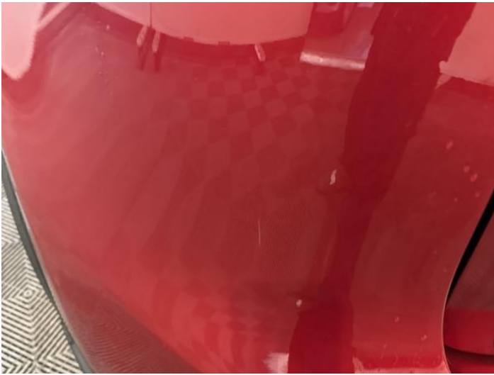
5: Bumper Rear Scratched Up To 25mm Thru Paint