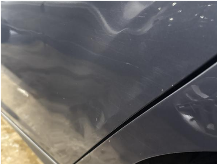
9: Door nsr Dented With Paint Damage