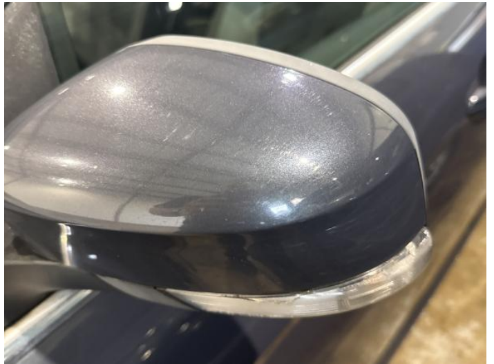
6: Door Mirror Assy nsf Scratched (Painted) UpTo 25mm Thru Paint