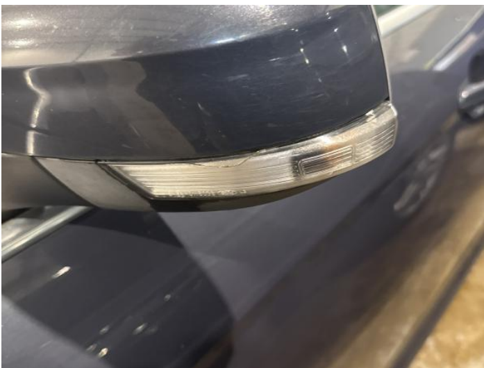
7: Flasher Side Repeater ns Broken Replace