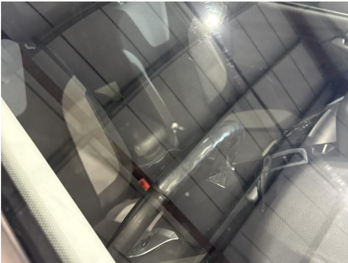
5: Screen Front Cracked Replace