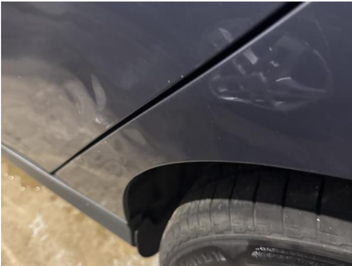
11: Qtr Panel nsr Dented Over 30mm