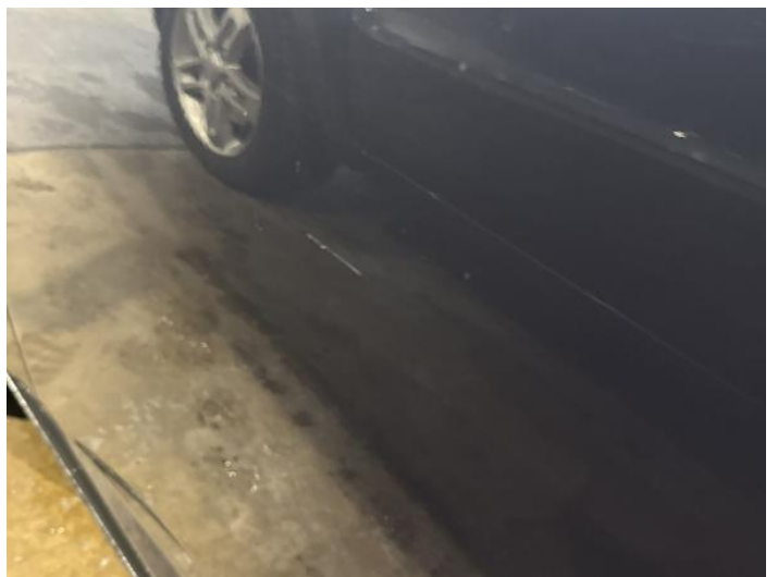
8: Door nsf Scratched UpTo 25mm Thru Paint