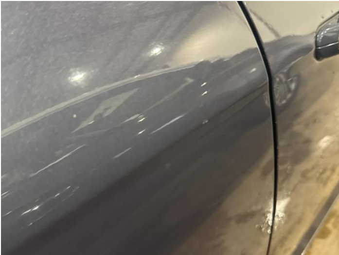
15: Door osr Chipped 1 To 5