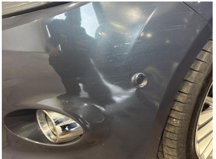
2: Bumper Front Poor Previous Repair Poor Paint