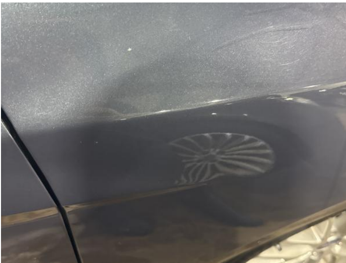
17: Wing osf Chipped 1 To 5