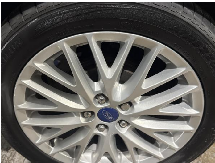
13: Wheel osr Scratched Up To 50mm