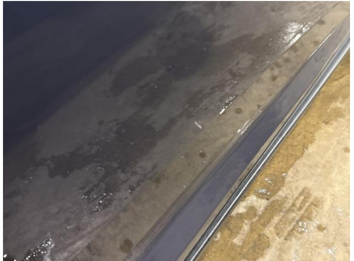
16: Door osf Scratched UpTo 25mm Thru Paint