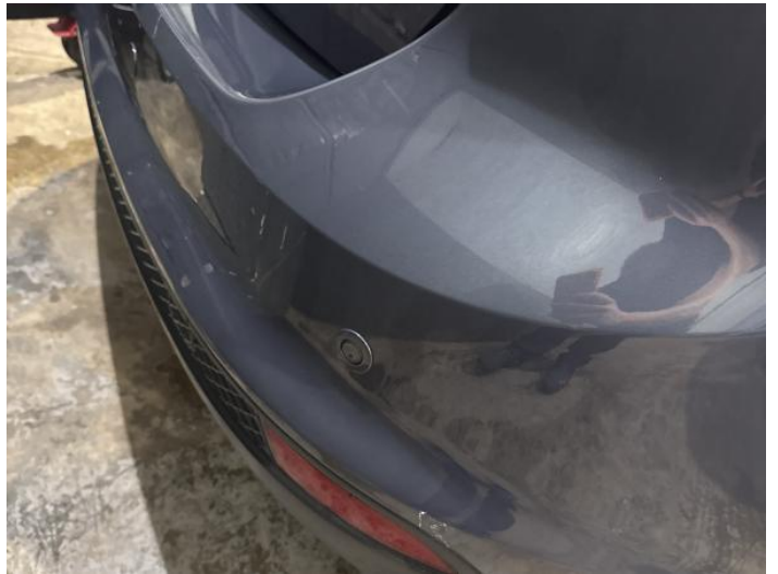
12: Bumper Rear Poor Previous Repair Poor Paint