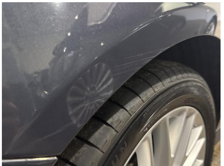
14: Qtr Panel osr Scratched Over 25mm Thru Paint