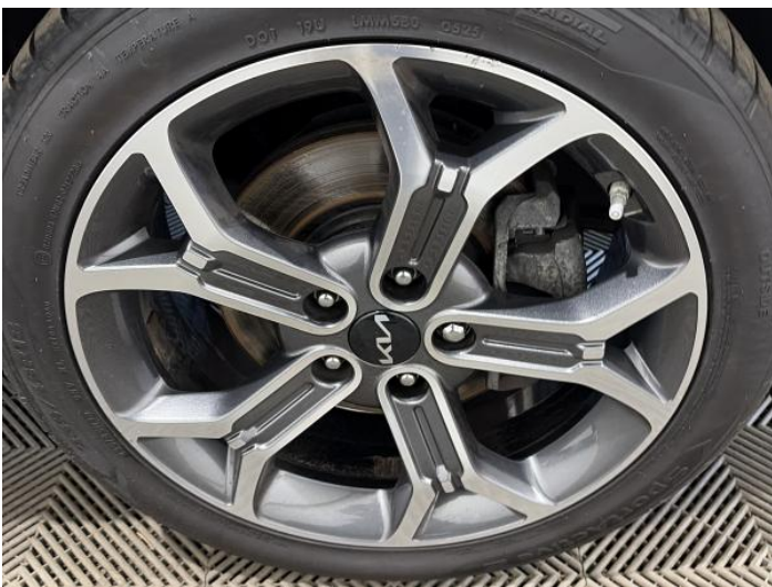
7: Wheel nsf Scratched Over 50mm