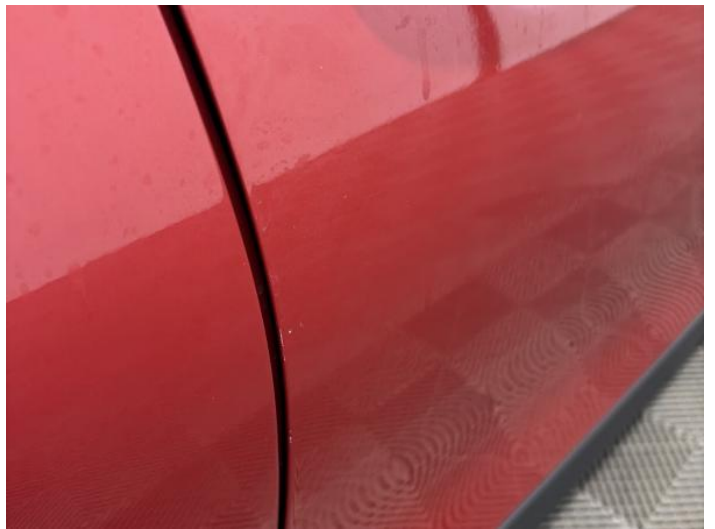
6: Door osf Chipped Edge Chip