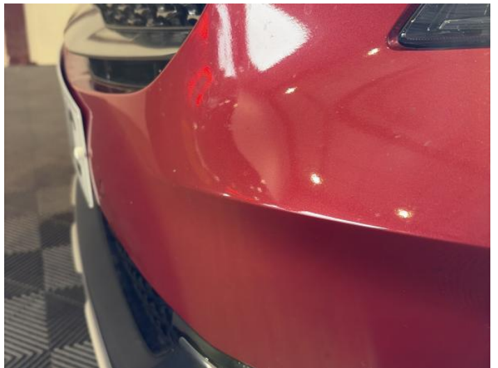
2: Bumper Front Chipped 1 To 5