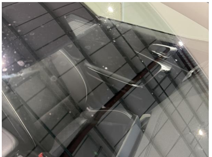
8: Screen Front Chipped UpTo 10mm