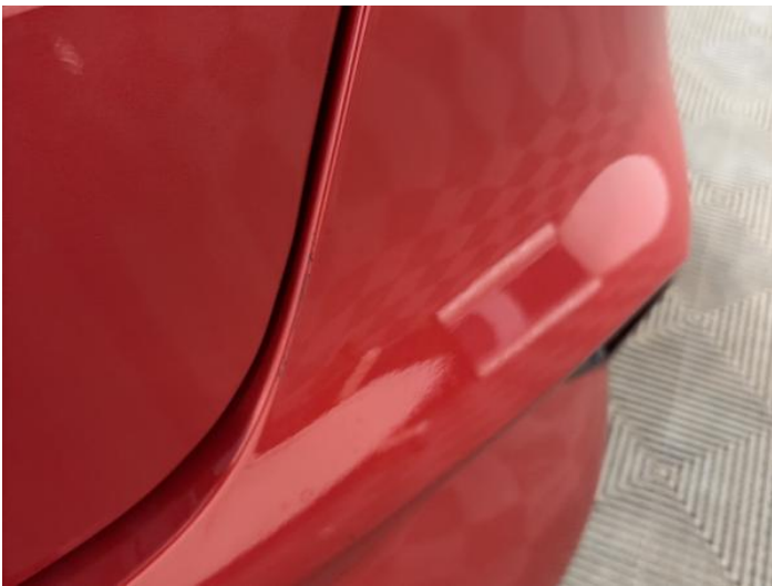
5: Bumper Rear Scratched 25 to 100mm Thru Paint