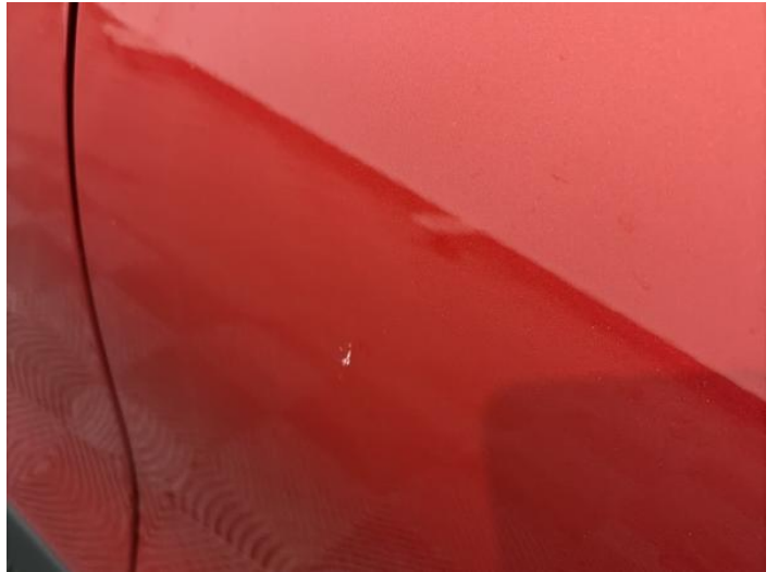
4: Door nsr Scratched UpTo 25mm Thru Paint