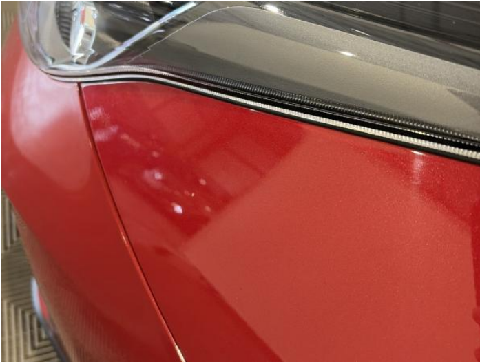
3: Wing nsf Chipped 1 To 5