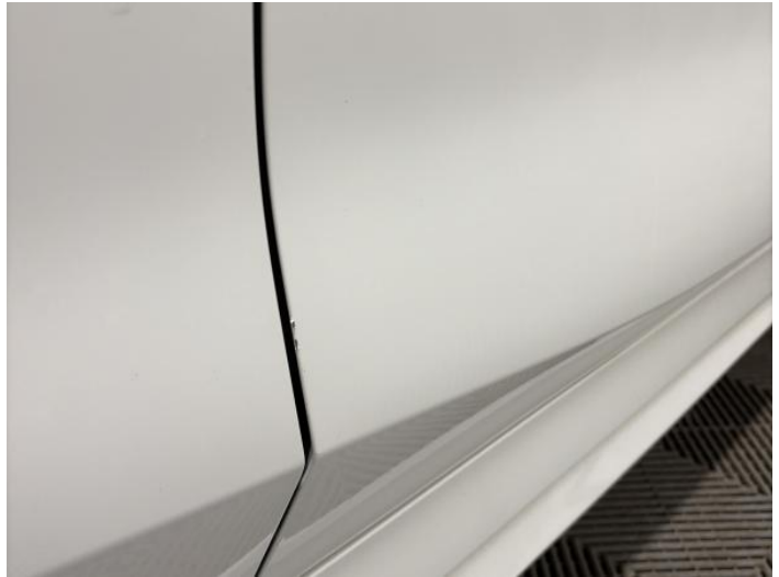
3: Qtr Panel nsr Scratched Over 25mm Thru Paint