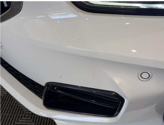
1: Bumper Front Chipped 1 To 5