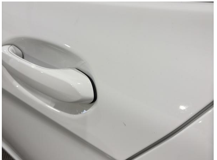
2: Door nsr Chipped 1 To 5