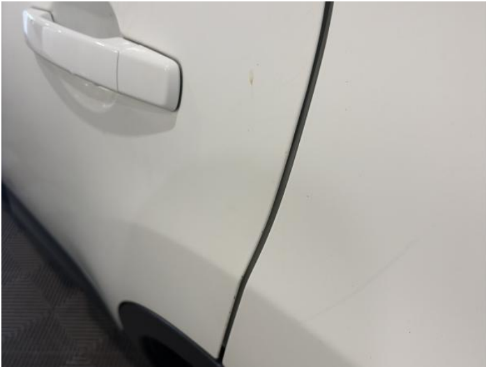
9: Door nsr Chipped Edge Chip