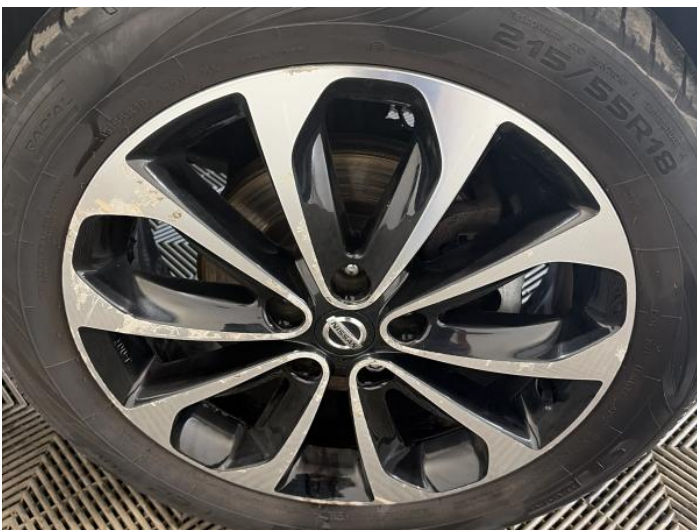
19: Wheel osf Scratched Over 50mm