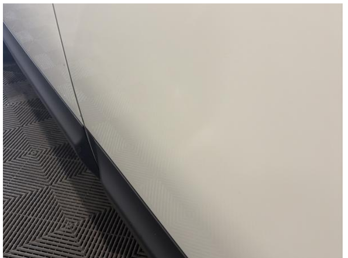
8: Door nsr Dented Between 10mm + 30mm