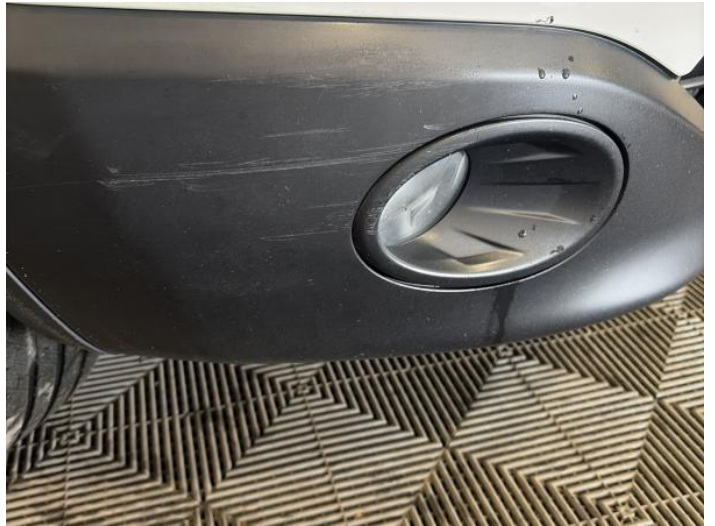
4: Bumper Front Moulding Scuffed (Unpainted) Over 100mm