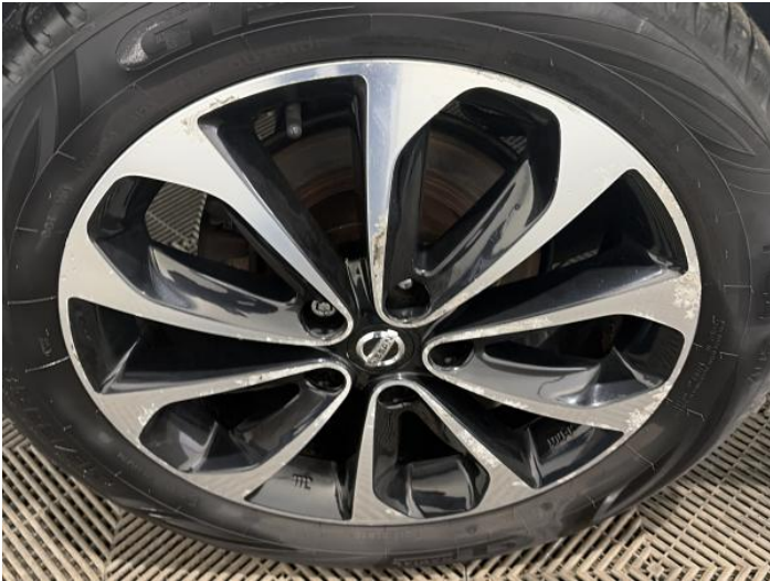
15: Wheel osr Scratched Over 50mm