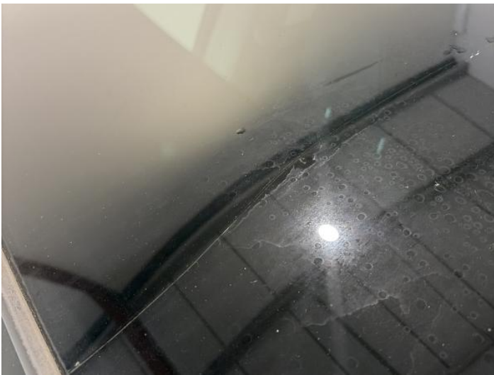
11: Glass Roof Cracked Replace