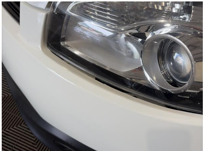
2: Bumper Front Insecure Action Required