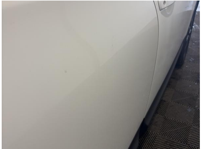
16: Door osr Dented Between 10mm + 30mm