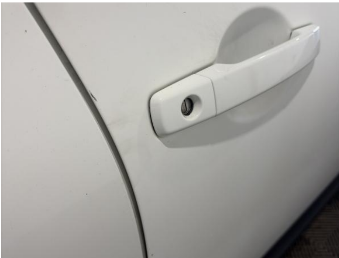
17: Door osf Scratched UpTo 25mm Thru Paint