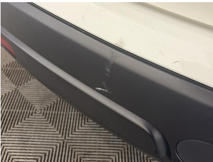
13: Bumper Rear Moulding Scuffed (Unpainted) UpTo 100mm