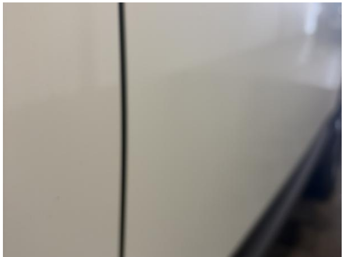
18: Door osf Dented 2 Or Less UpTo 10mm