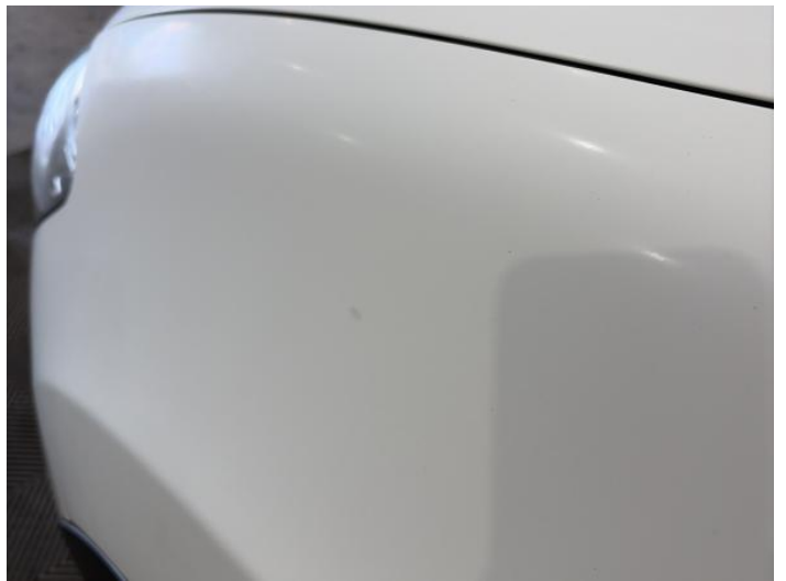
6: Wing nsf Scratched Up To 25mm Thru Paint