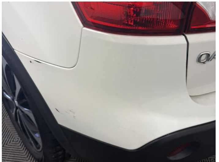
12: Bumper Rear Scratched 25 to 100mm Thru Paint