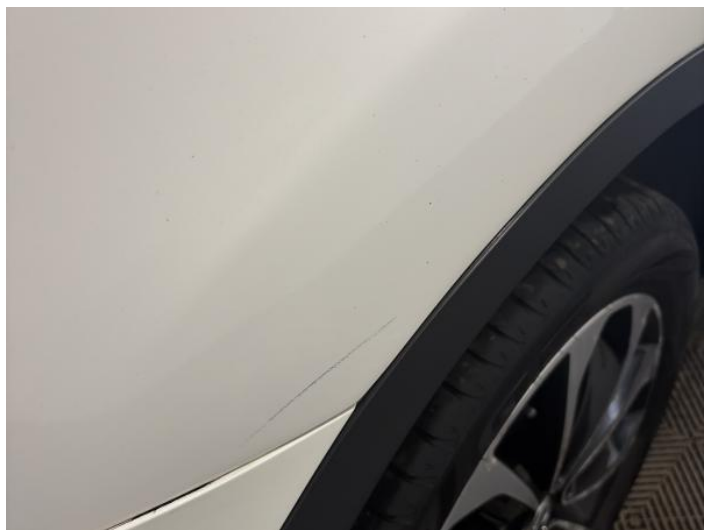
14: Qtr Panel osr Scratched Over 25mm Thru Paint