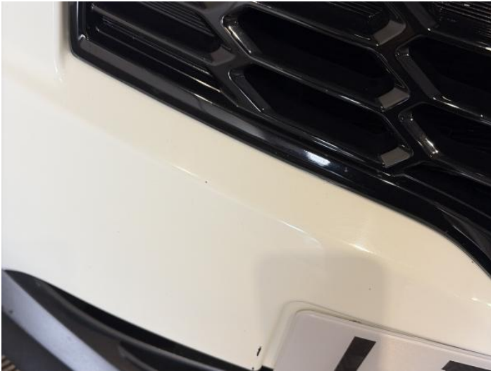
3: Bumper Front Poor Previous Repair Poor Paint