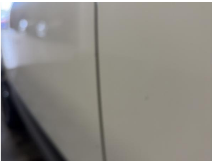
7: Door nsf Chipped Edge Chip