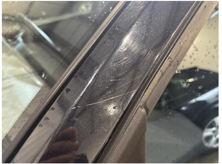
6: A Post ns Scratched Over 25mm Thru Paint