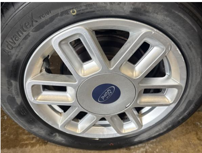
19: Wheel osr Scratched Over 50mm