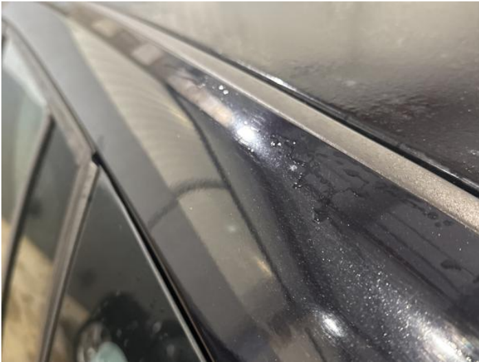
15: C Post ns Dented Between 10mm + 30mm