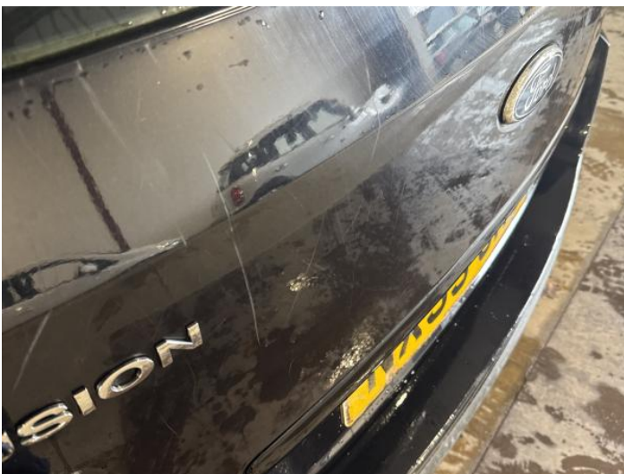
13: Tailgate Dented With Paint Damage