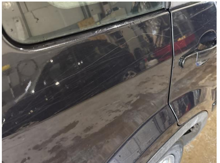
18: Qtr Panel osr Scratched Over 25mm Thru Paint