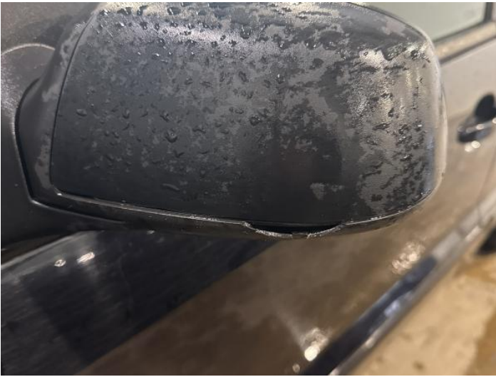
5: Door Mirror Assy nsf Broken Replace