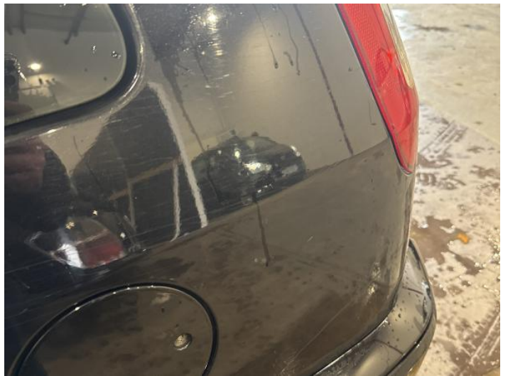
12: Qtr Panel nsr Scratched Over 25mm Thru Paint