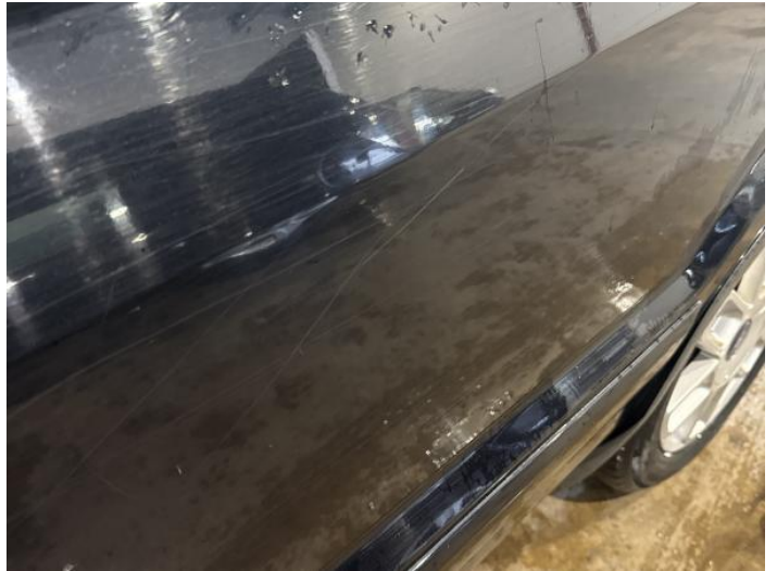
10: Door nsr Scratched Over 25mm Thru Paint