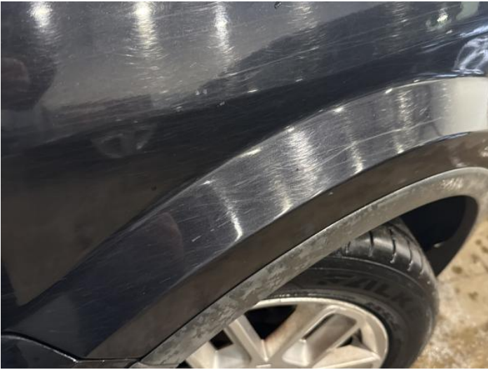
3: Wing nsf Scratched Over 25mm Thru Paint