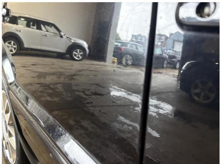
20: Door osr Dented Between 10mm + 30mm