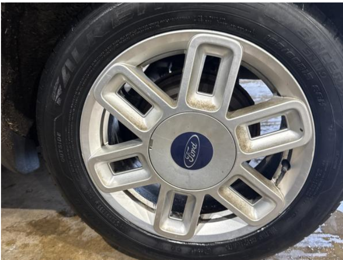
11: Wheel nsr Scratched Over 50mm