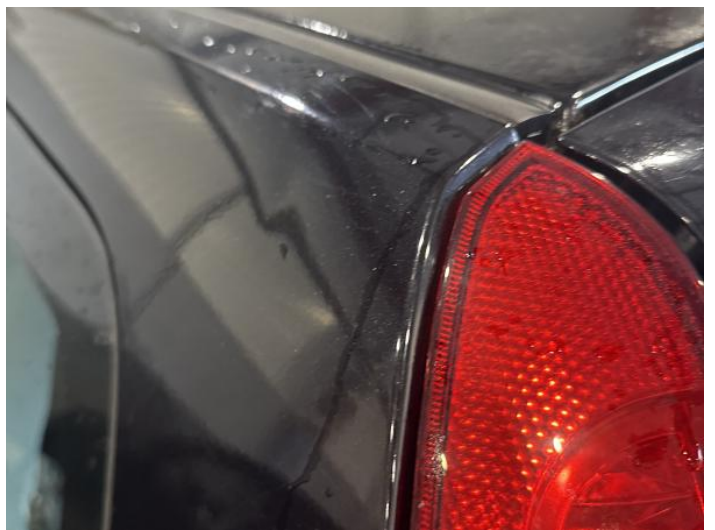
14: Qtr Panel osr Dented Between 10mm + 30mm