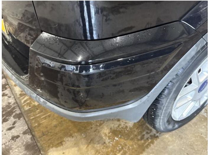
16: Bumper Rear Scratched Over 100mm Thru Paint