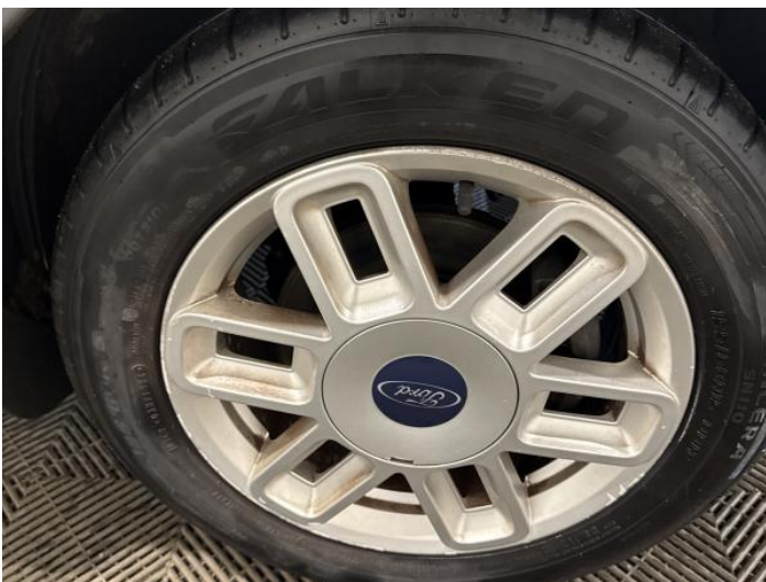
25: Wheel osf Scratched Over 50mm