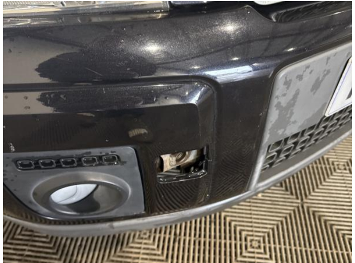
28: Front TowEye Cvr Missing Replace