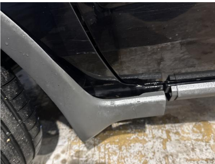
7: Wing Front Arch Extension ns Broken Replace