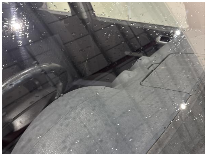
26: Screen Front Scratched Over 30mm