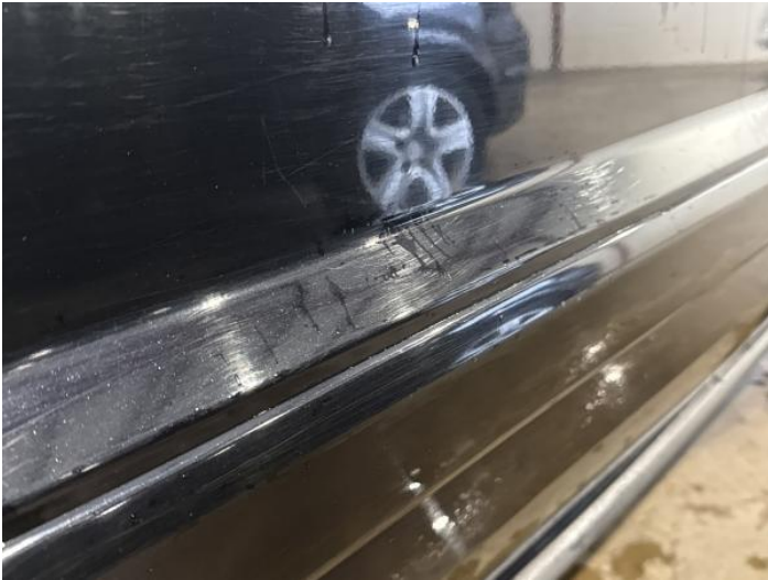
9: Door nsf Scratched Over 25mm Thru Paint