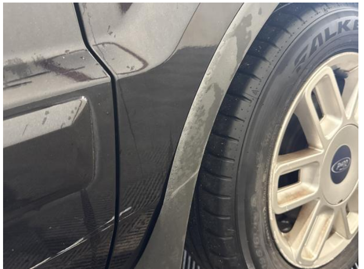
24: Wing osf Scratched Over 25mm Thru Paint