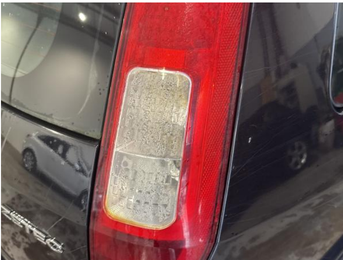
17: Other N/A N/A