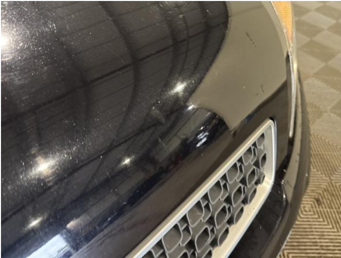
27: Bonnet Dented Between 10mm + 30mm