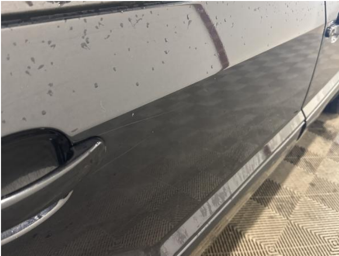
21: Door osr Scratched Over 25mm Thru Paint