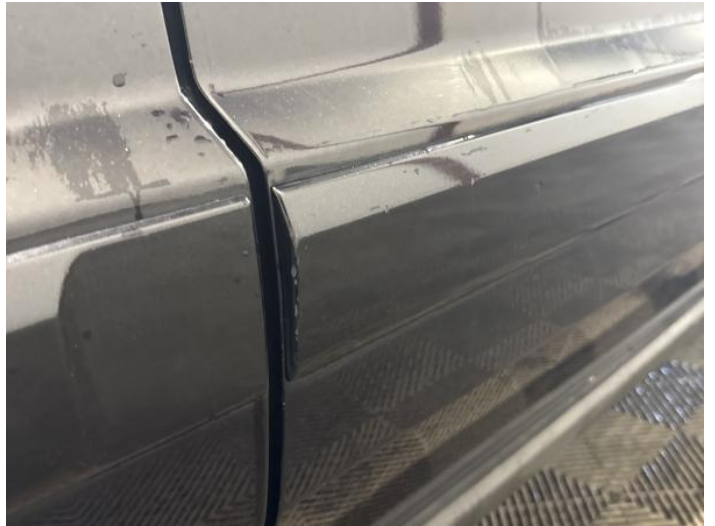
22: Door osf Chipped Edge Chip