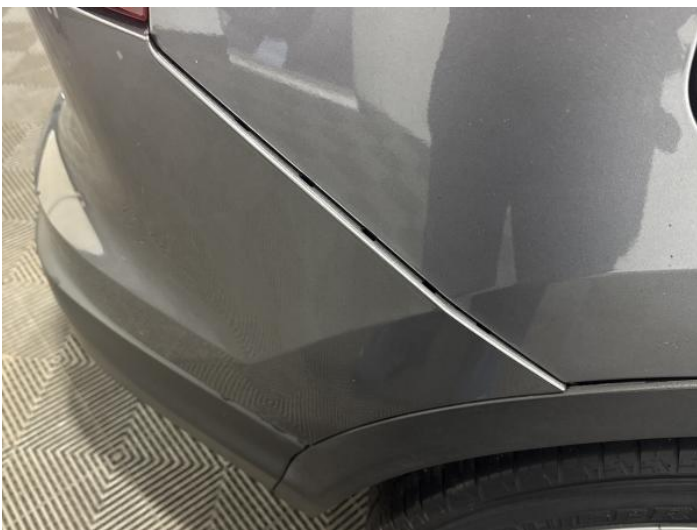
13: Bumper Rear Insecure Action Required