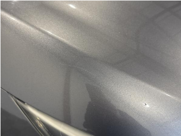
3: Bonnet Scratched Over 25mm Thru Paint