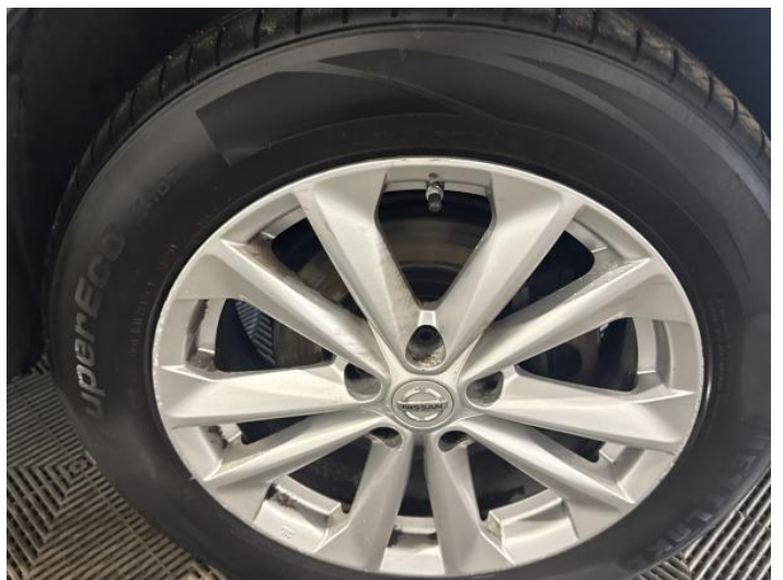
20: Wheel osf Scratched Over 50mm