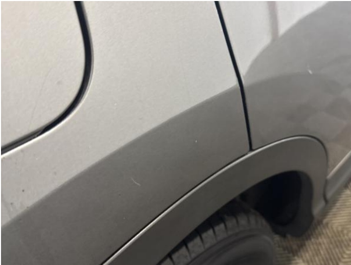
15: Qtr Panel osr Dented Between 10mm + 30mm