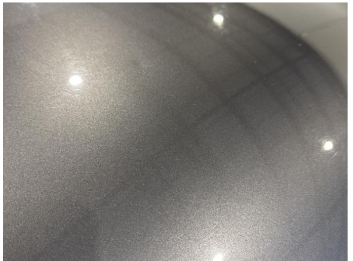
2: Bonnet Dented Between 10mm + 30mm