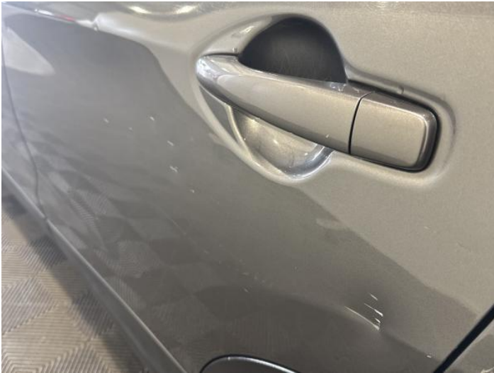
9: Door nsr Dented With Paint Damage