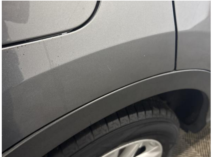
16: Qtr Panel osr Scratched UpTo 25mm Thru Paint