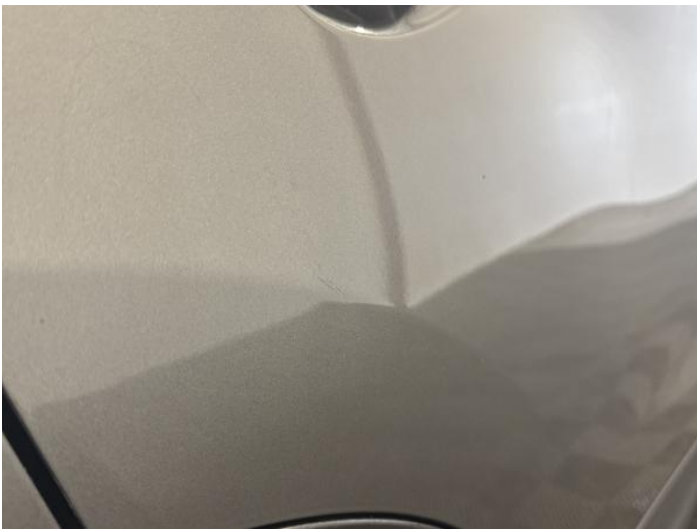
17: Door osr Dented Over 30mm