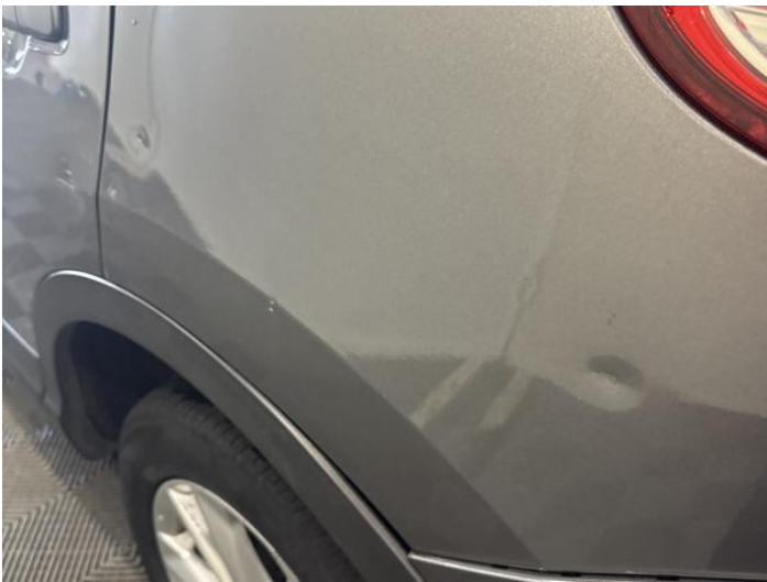
11: Qtr Panel osr Dented With Paint Damage