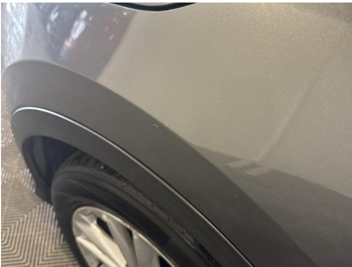
5: Wing nsf Scratched Over 25mm Thru Paint