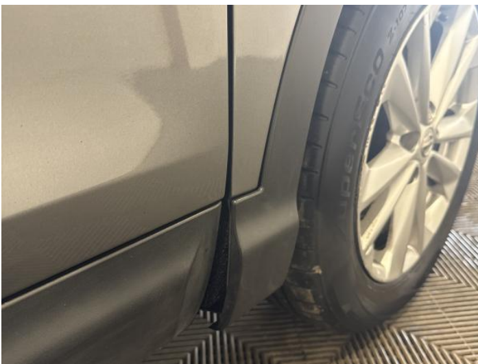
19: Wing osf Dented Over 30mm