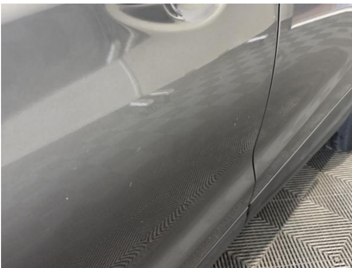
7: Door nsf Dented Over 30mm