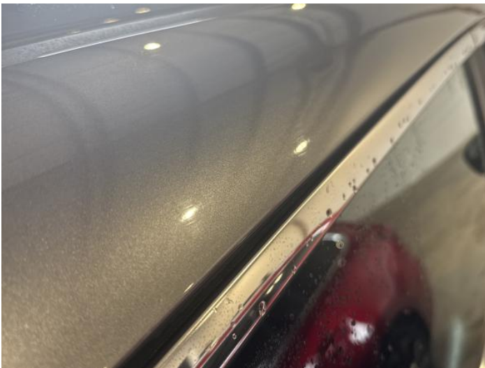
1: B Post os Dented Over 30mm