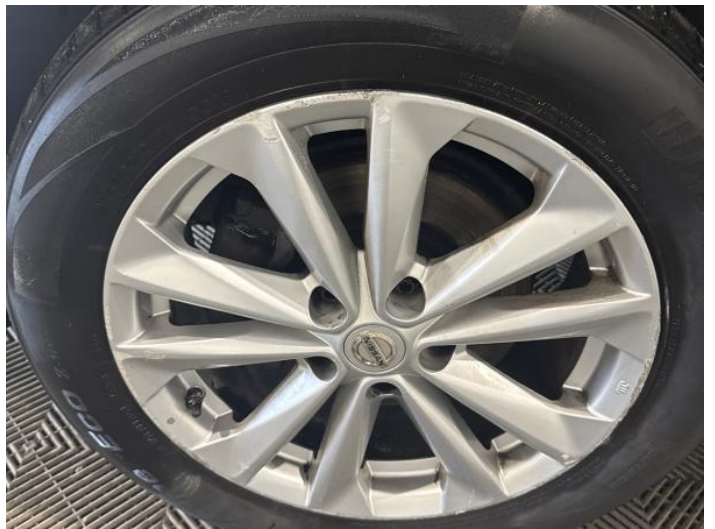
6: Wheel nsf Scratched Over 50mm