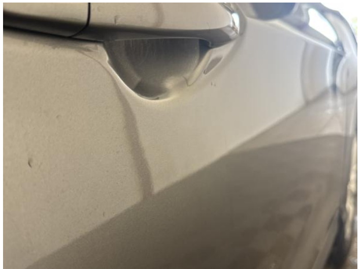
18: Door osf Dented Over 30mm