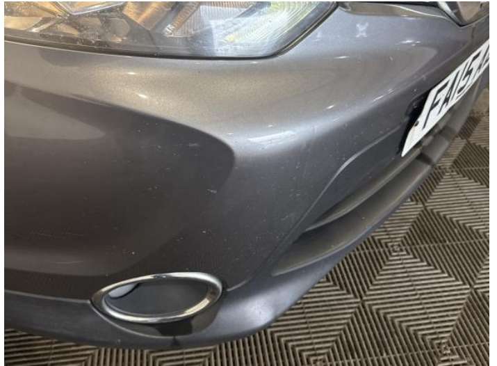
4: Bumper Front Chipped Multiple Chips