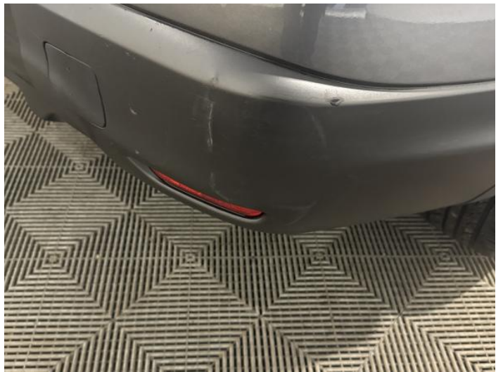
12: Bumper Rear Moulding Scuffed (Unpainted) Over 100mm