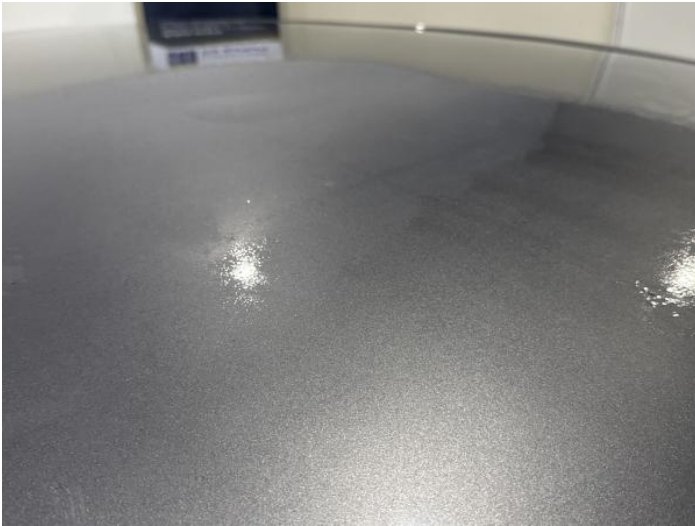
21: Roof Dented Over 30mm