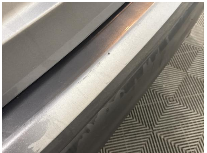
14: Bumper Rear Scratched 25 to 100mm Thru Paint