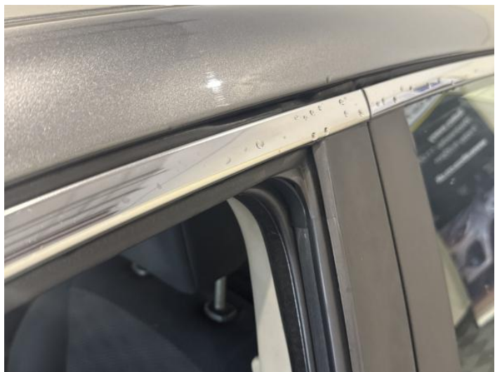
8: Aperture Seal nsf Broken Replace