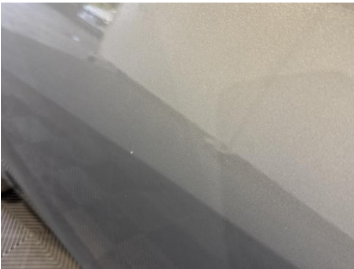
5: Door nsf Chipped 1 To 5