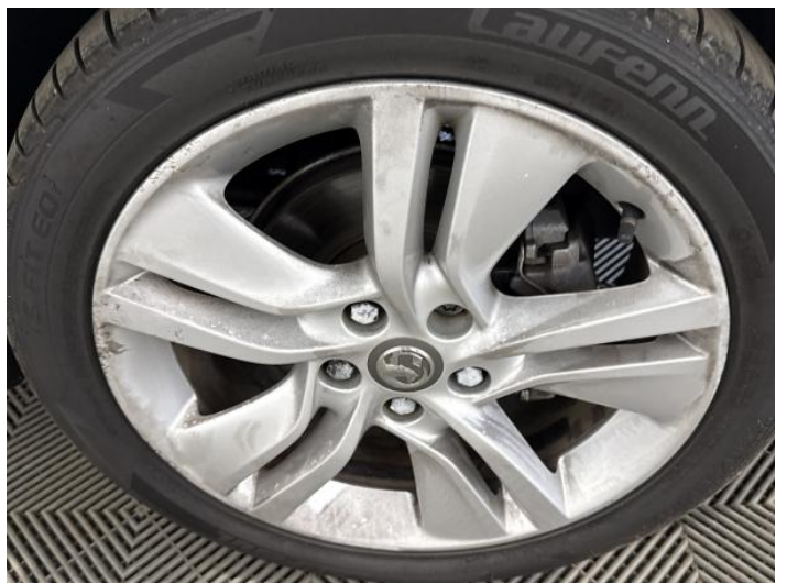
14: Wheel osf Scratched Over 50mm