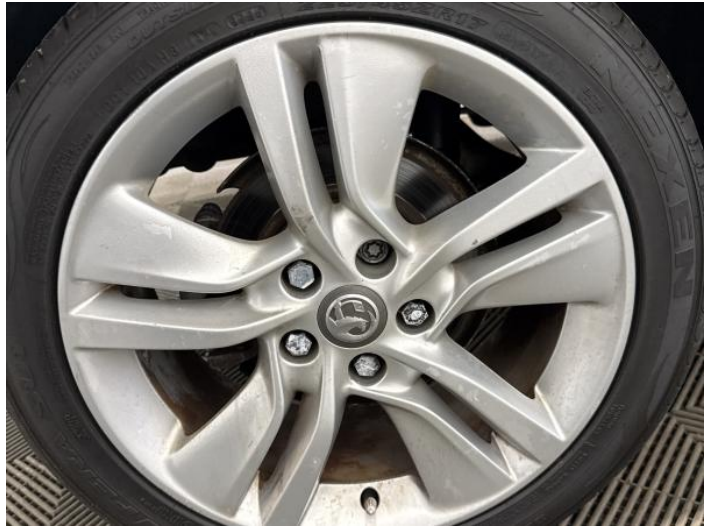
10: Wheel osr Scratched Over 50mm