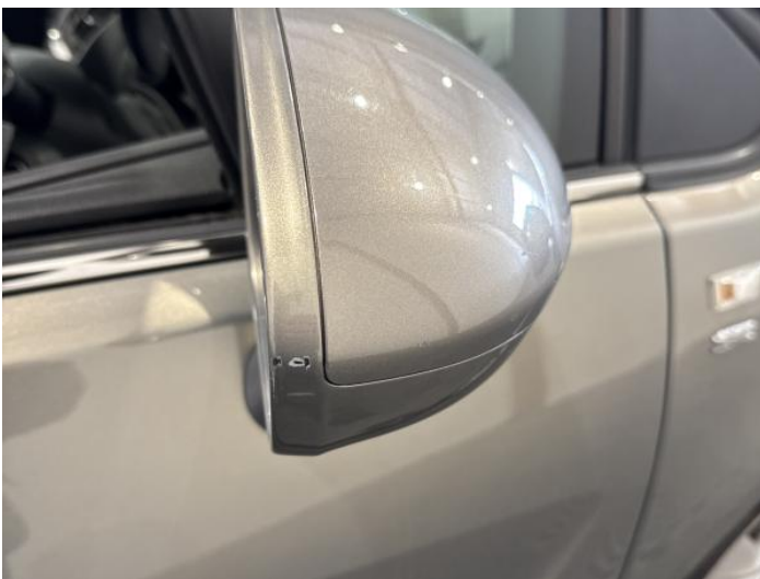
13: Door Mirror Assy osf Scratched (Painted) UpTo 25mm Thru Paint