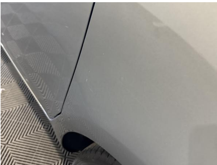
7: Qtr Panel nsr Chipped 1 To 5