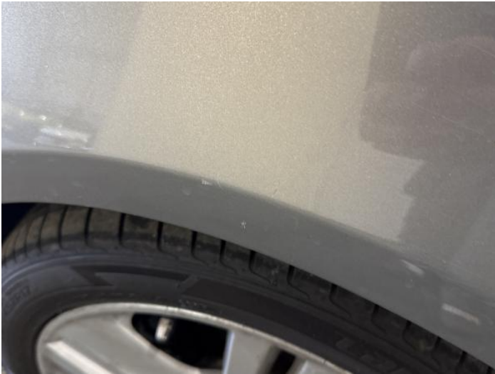
3: Wing nsf Chipped 1 To 5