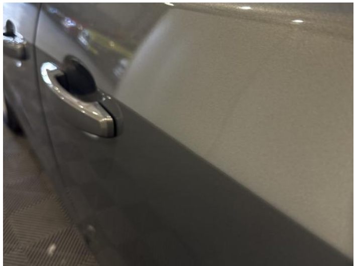
6: Door nsr Dented 2 Or Less Up To 10mm