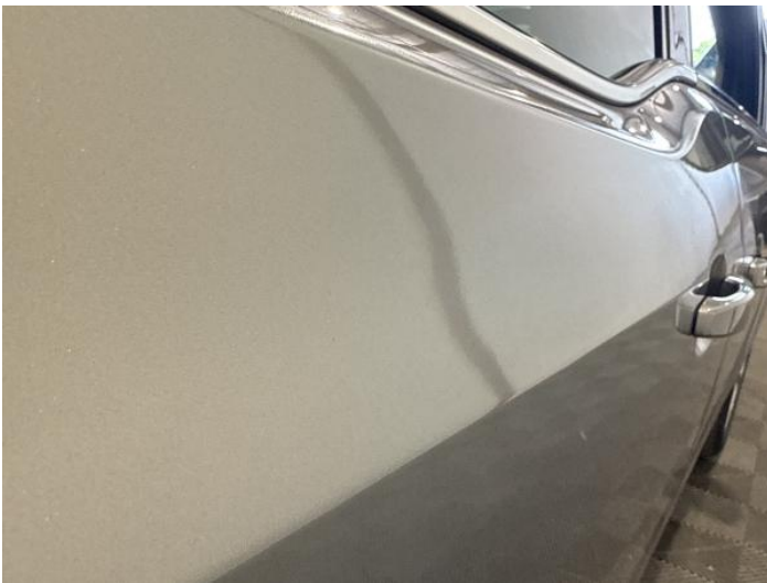
11: Door osr Poor Previous Repair Poor Paint