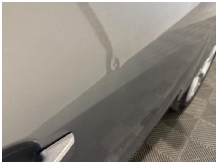
12: Door osf Dented Over 30mm