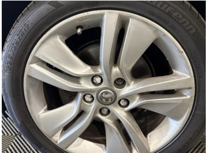
4: Wheel nsf Scratched Up To 50mm