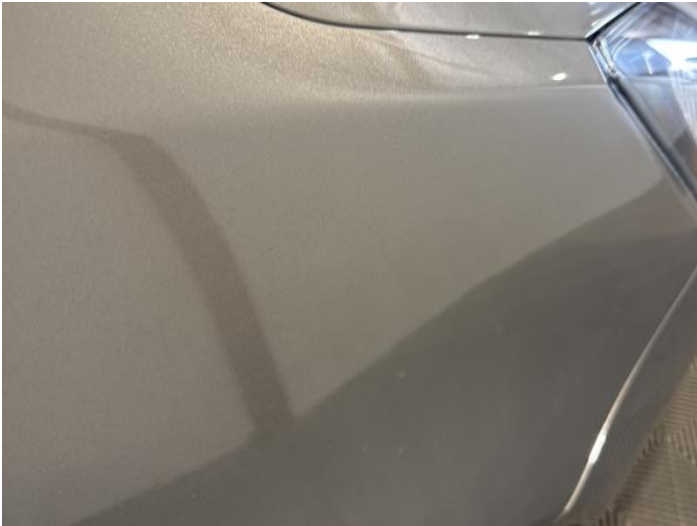
15: Wing osf Chipped 1 To 5