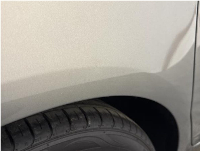
9: Qtr Panel osr Dented Between 10mm + 30mm