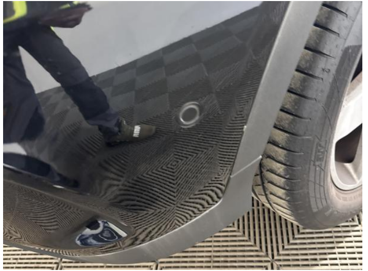
10: Bumper Rear Chipped 1 To 5