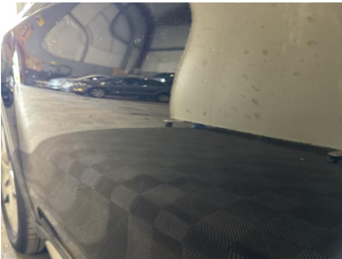
5: Door nsf Dented Between 10mm + 30mm