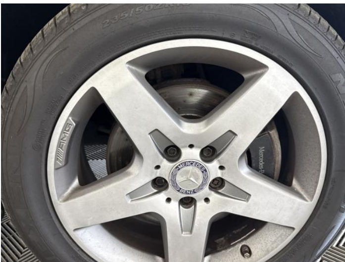
13: Wheel osf Scratched Over 50mm