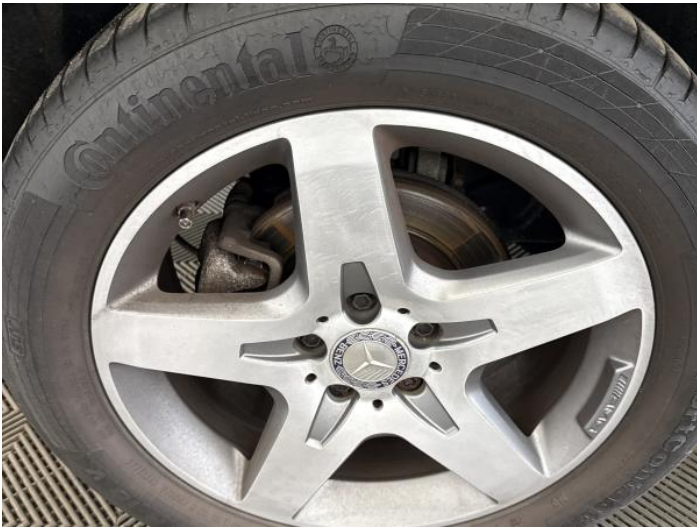
11: Wheel osr Scratched Over 50mm