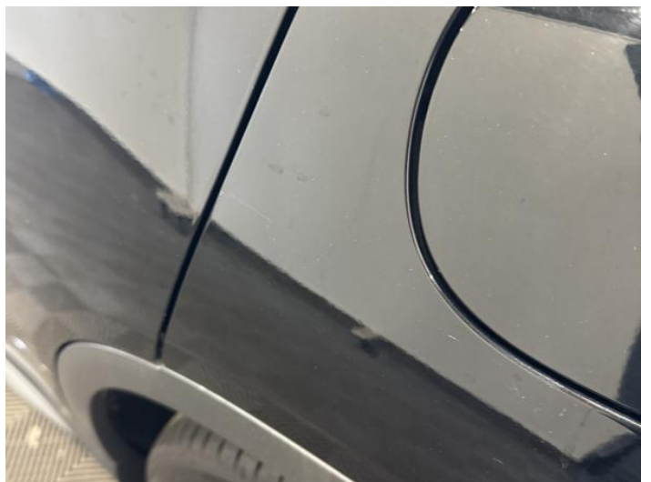
8: Qtr Panel nsr Scratched UpTo 25mm Thru Paint