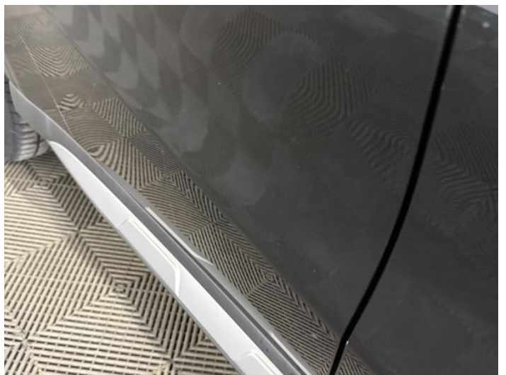
14: Door osr Dented Between 10mm + 30mm