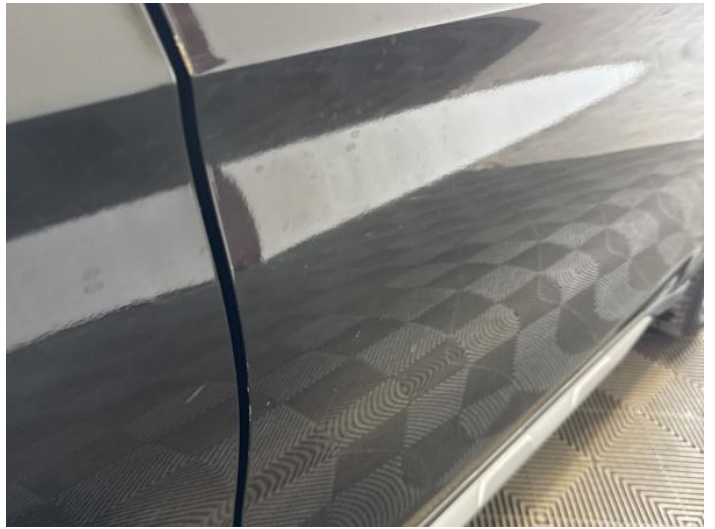
12: Door osf Chipped Edge Chip