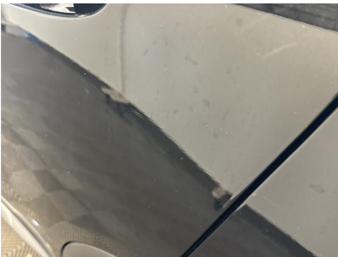
7: Door nsr Scratched UpTo 25mm Thru Paint