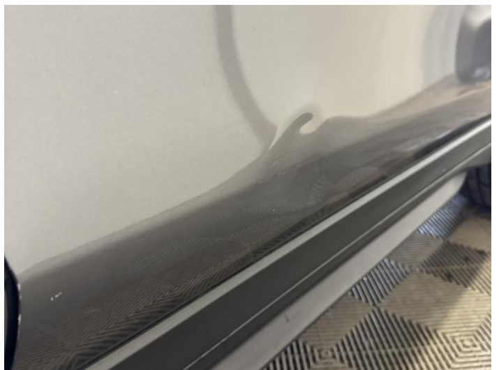
20: Door osf Dented Over 30mm