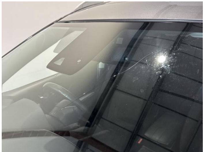
6: Screen Front Cracked Replace