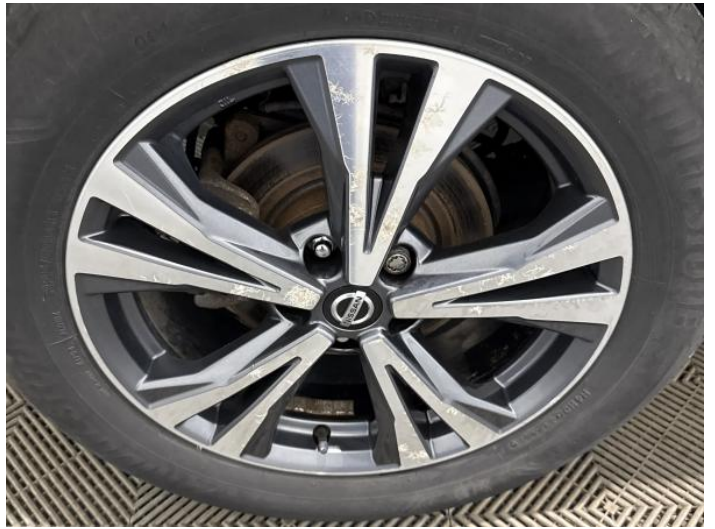
18: Wheel osr Scratched Over 50mm