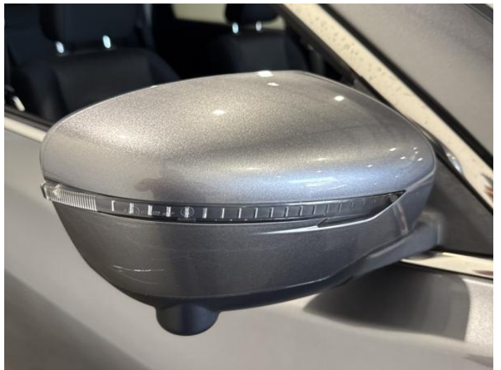
24: Door Mirror Assy osf Scratched (Painted) UpTo 25mm Thru Paint