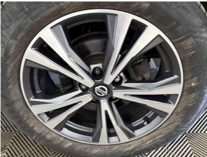
23: Wheel osf Scratched Up To 50mm