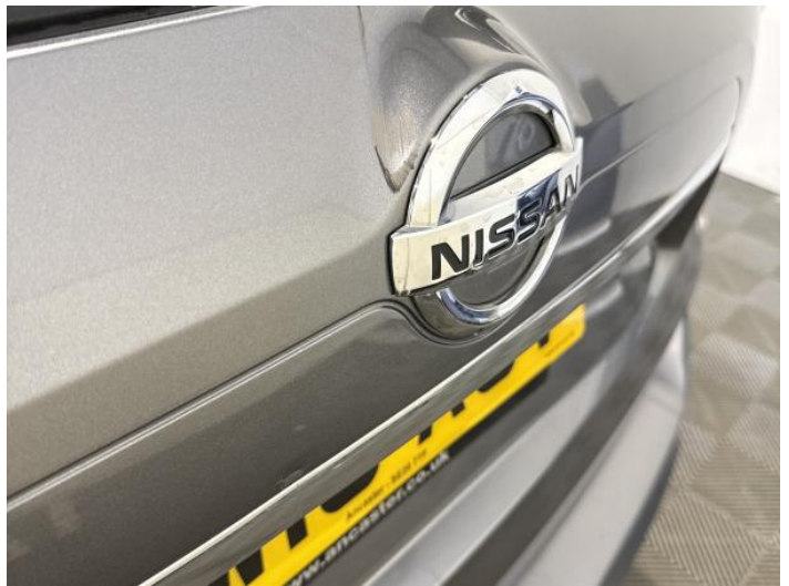
12: Tailgate Scratched Over 25mm Thru Paint