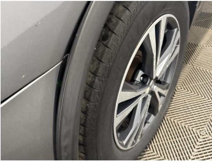
17: Qtr Panel Arch Extension os Scuffed (Unpainted) Over 100mm