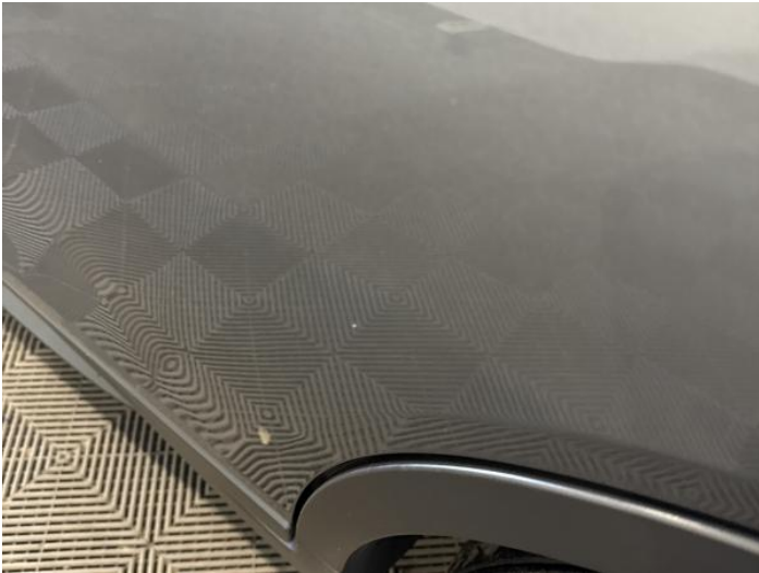
9: Door nsr Chipped 1 To 5