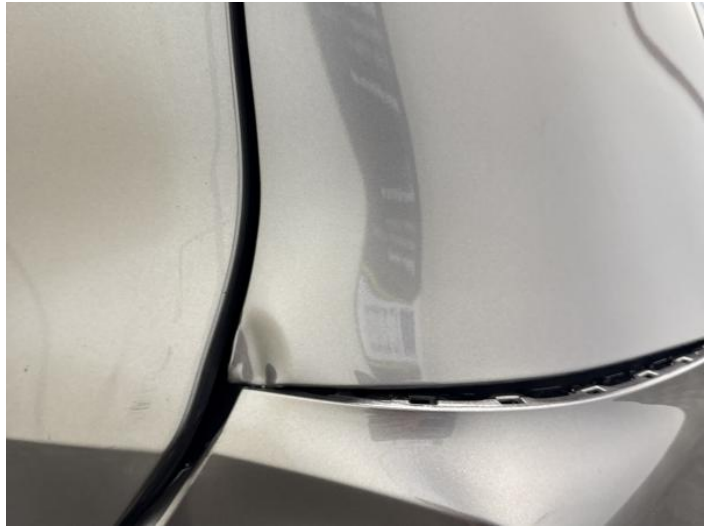
16: Qtr Panel osr Dented With Paint Damage