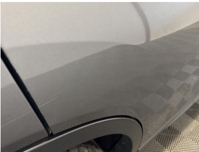
19: Door osr Scratched Over 25mm Thru Paint