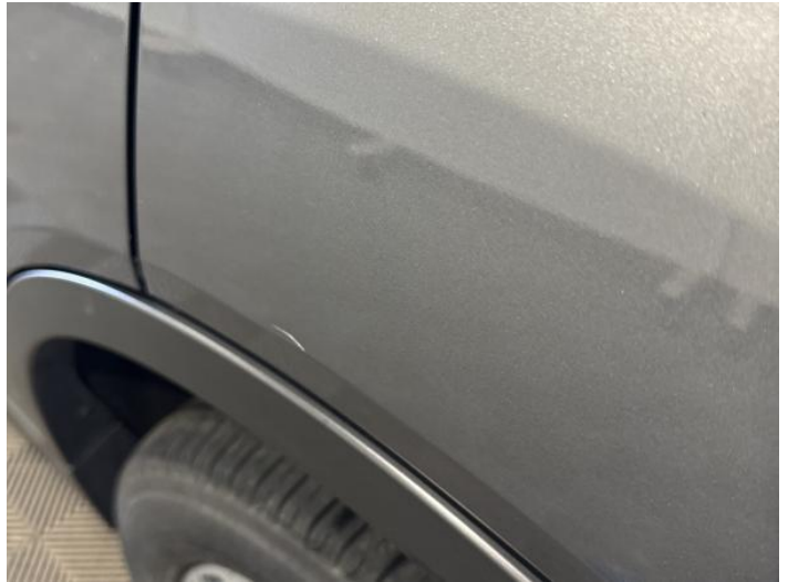
10: Qtr Panel nsr Scratched UpTo 25mm Thru Paint