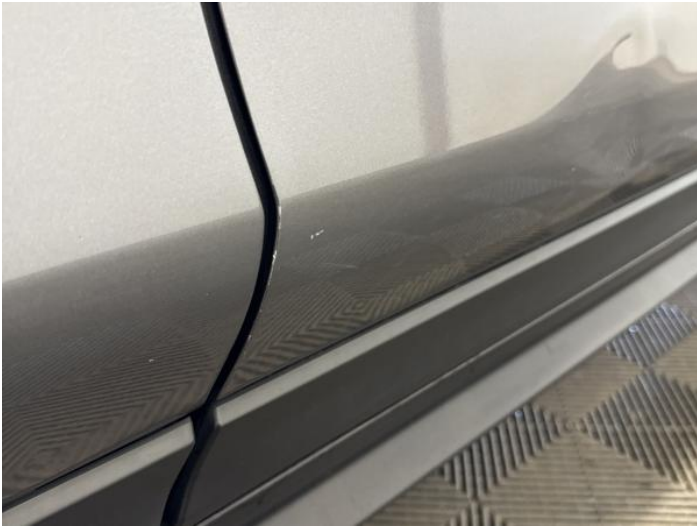
21: Door osf Chipped 1 To 5