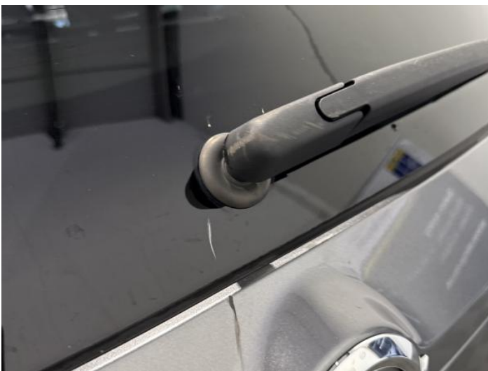
13: Screen Rear Scratched UpTo 30mm