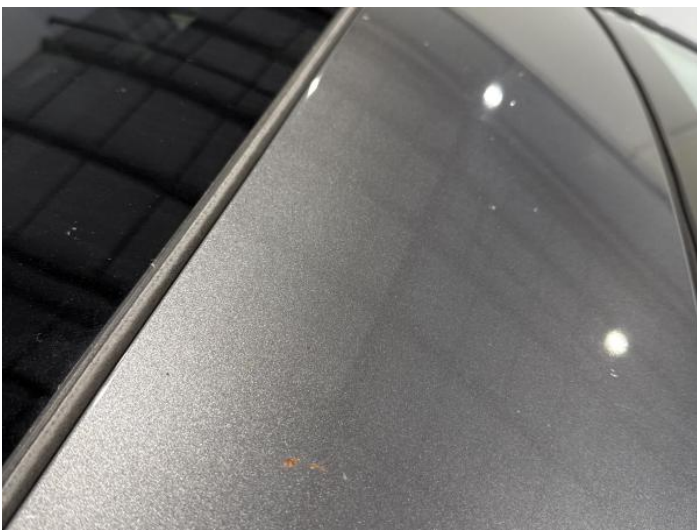
25: Roof Chipped 1 To 5