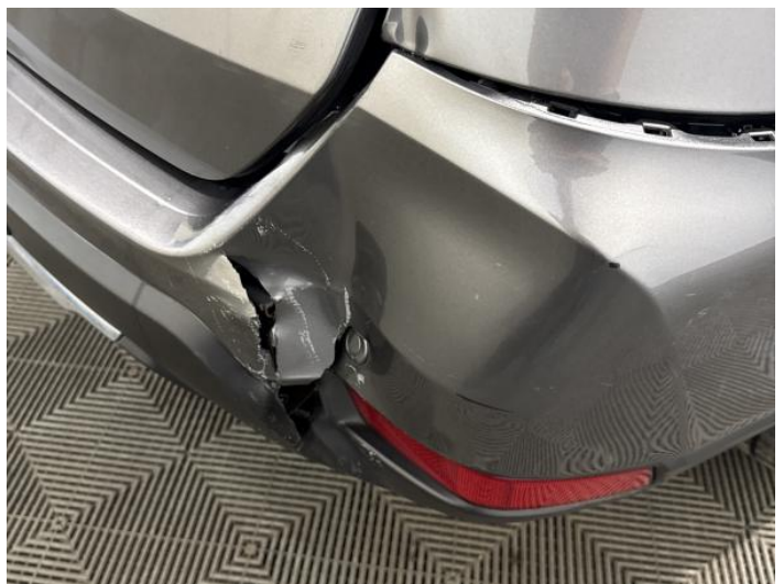
14: Bumper Rear Cracked Over 25mm