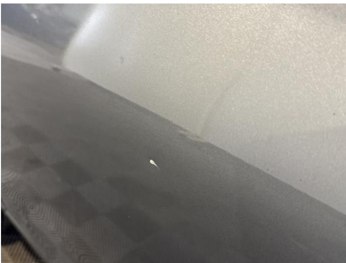
7: Door nsf Scratched UpTo 25mm Thru Paint