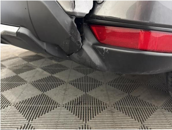
15: Bumper Rear Moulding Broken Replace