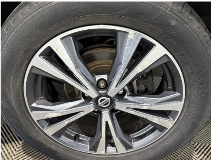
11: Wheel nsr Scratched Over 50mm