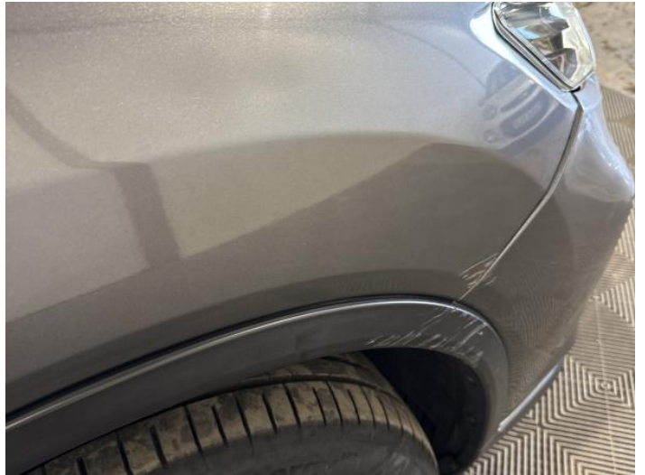
22: Wing osf Dented With Paint Damage