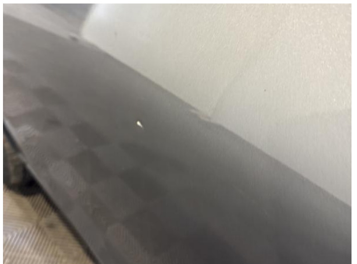
8: Door nsf Dented Between 10mm + 30mm