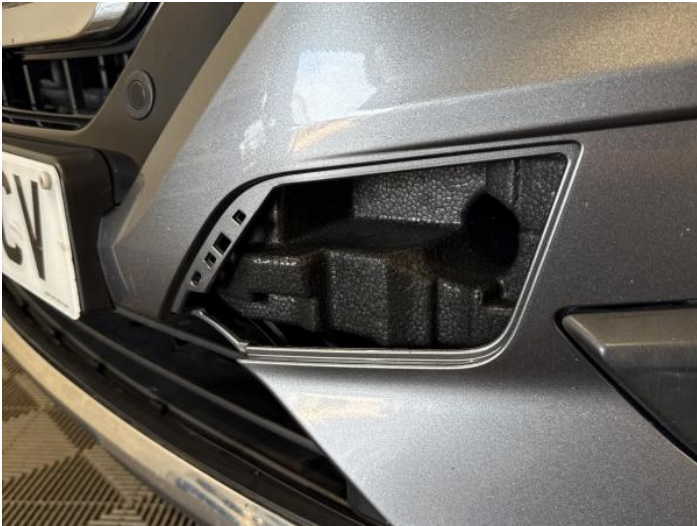
3: Front TowEye Cvr Missing Replace