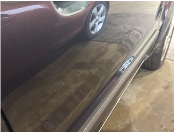
17: Door osf Dented Between 10mm + 30mm