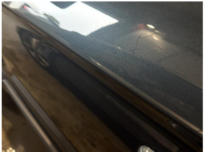
6: Door nsf Dented With Paint Damage