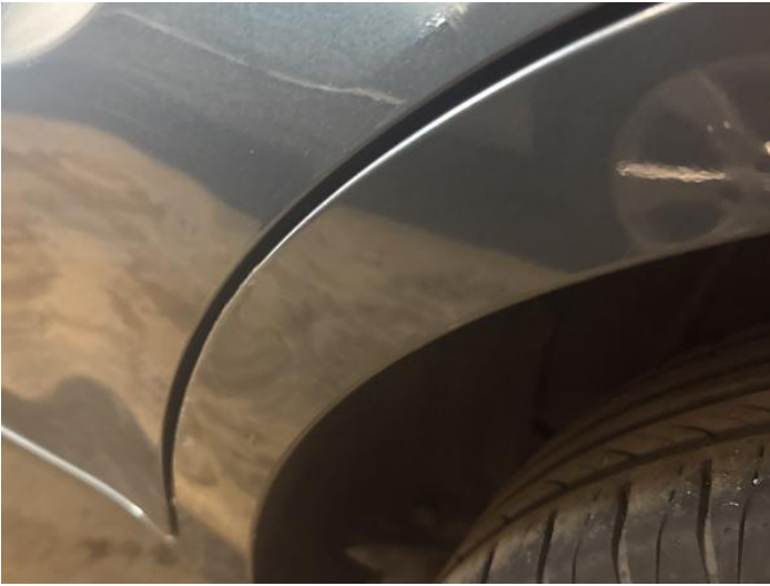
9: Qtr Panel nsr Dented Between 10mm + 30mm