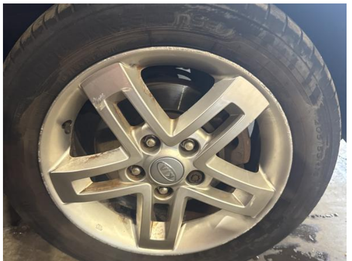
20: Wheel osf Scratched Over 50mm