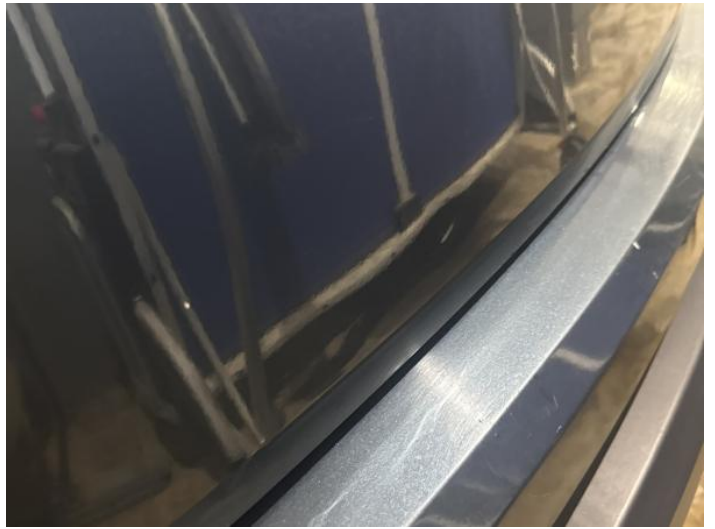
12: Tailgate Dented Over 30mm