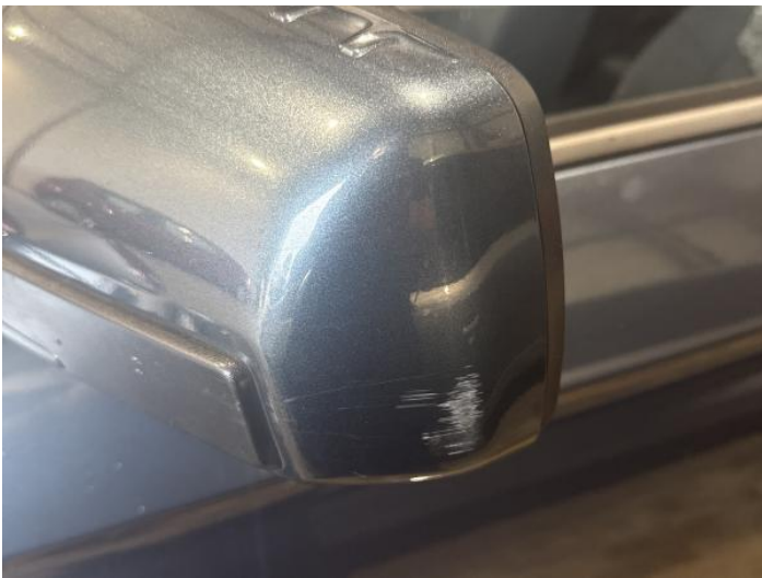
5: Door Mirror Assy nsf Scratched (Painted) Over 25mm Thru Paint