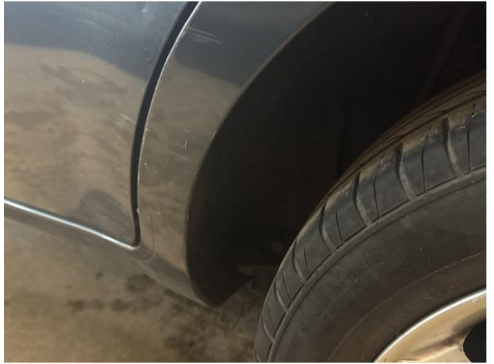
10: Qtr Panel nsr Scratched Over 25mm Thru Paint