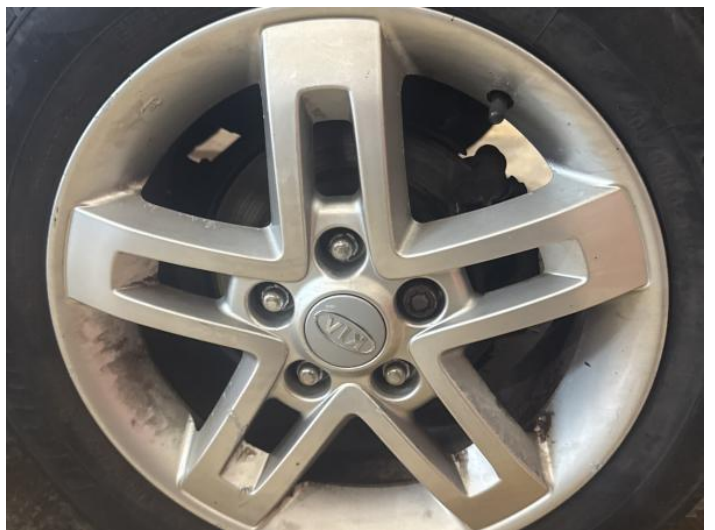
8: Wheel nsr Corroded Light