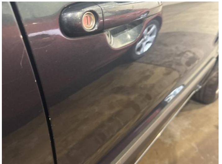
18: Door osf Chipped Edge Chip