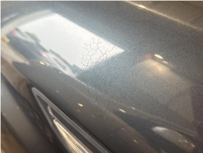
3: Wing nsf Poor Previous Repair Poor Paint