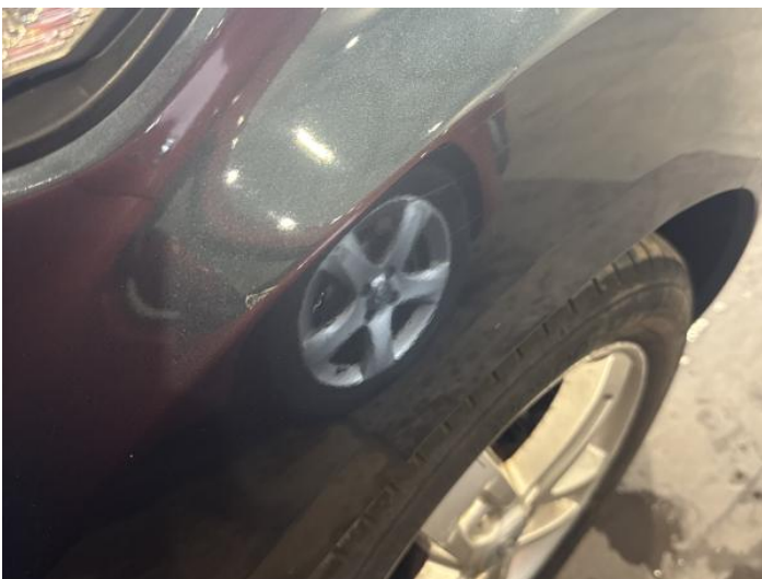
19: Wing osf Scratched Over 25mm Thru Paint