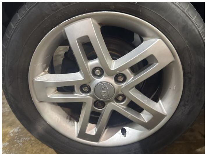
14: Wheel osr Scratched Over 50mm