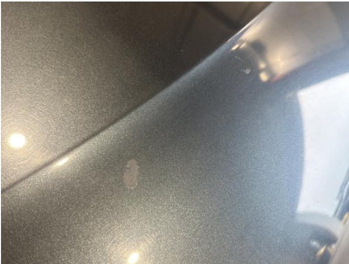
1: Bonnet Poor Previous Repair Paint Flake