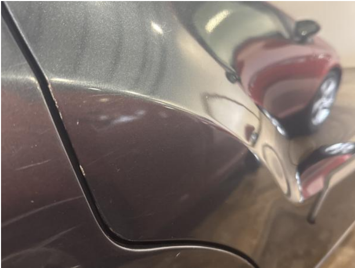
15: Door osr Scratched Over 25mm Thru Paint