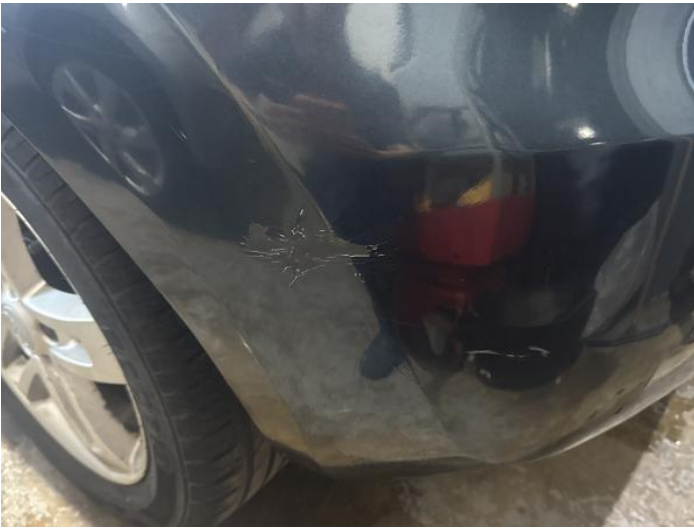
11: Bumper Rear Poor Previous Repair Poor Paint