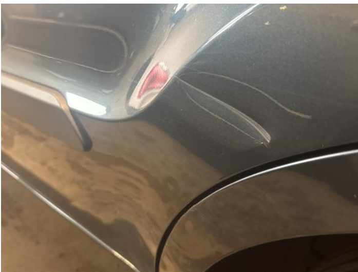
7: Door nsr Dented With Paint Damage