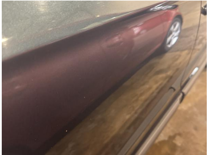
16: Door osr Dented Between 10mm + 30mm