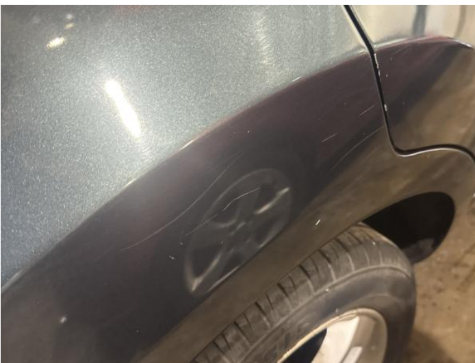
13: Qtr Panel osr Scratched Over 25mm Thru Paint