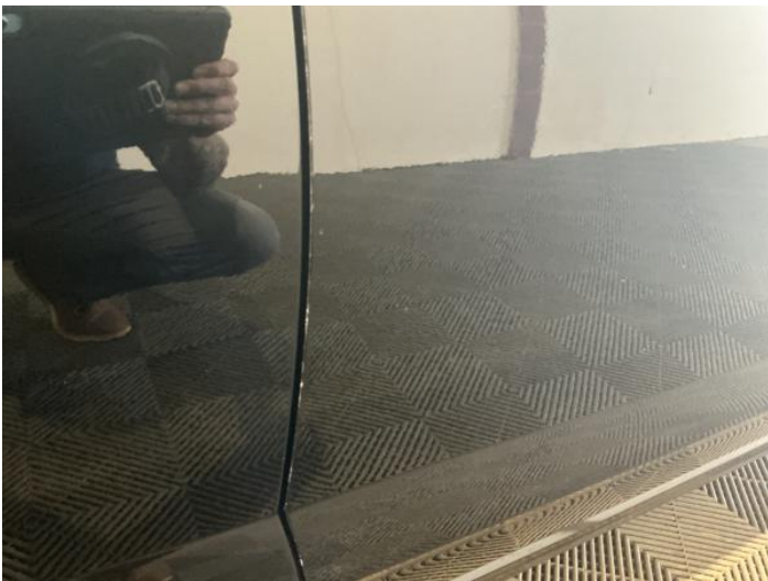
1: Door osf Chipped 1 To 5