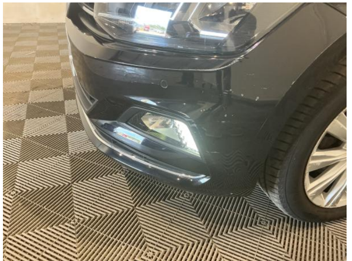
6: Bumper Front Scratched UpTo 25mm Thru Paint