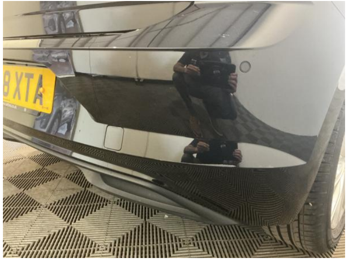
10: Bumper Rear Scratched 25 to 100mm Thru Paint