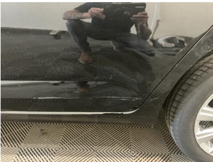
7: Door nsr Dented Over 30% Of Panel