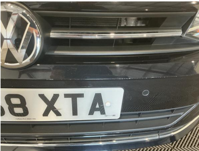
5: Bumper Front Scratched UpTo 25mm Thru Paint