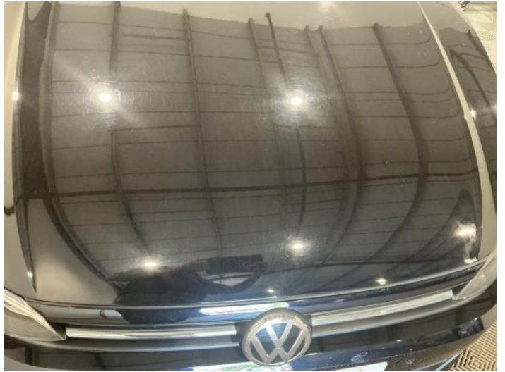
4: Bonnet Chipped 1 To 5