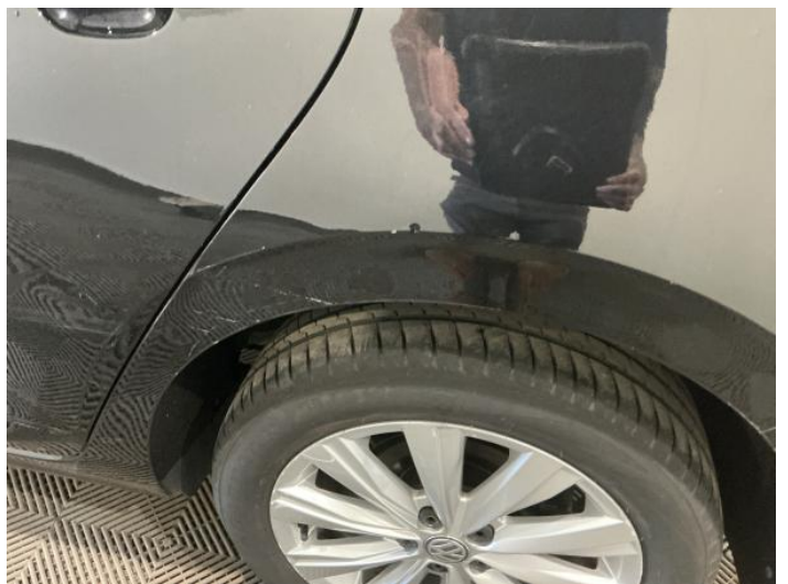
8: Qtr Panel nsr Scratched UpTo 25mm Thru Paint