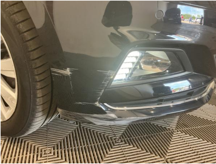
3: Bumper Front Scratched Over 100mm Thru Paint