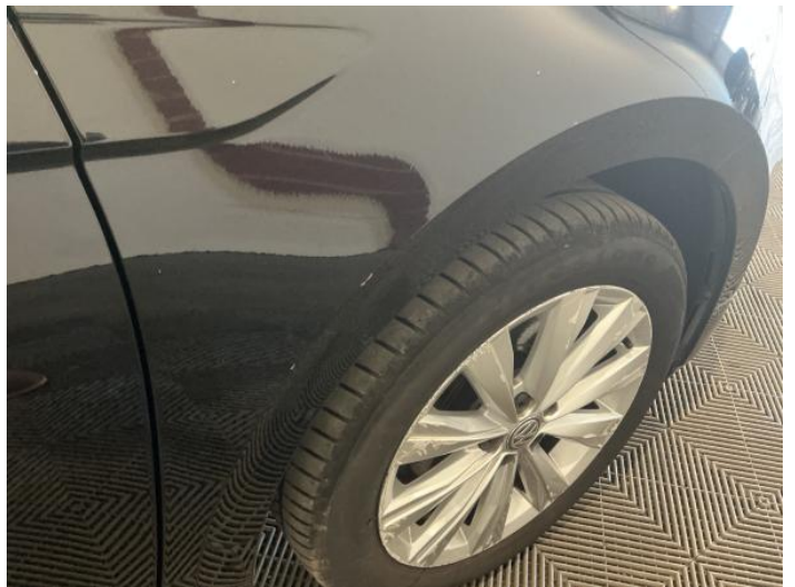
2: Wing osf Chipped 1 To 5