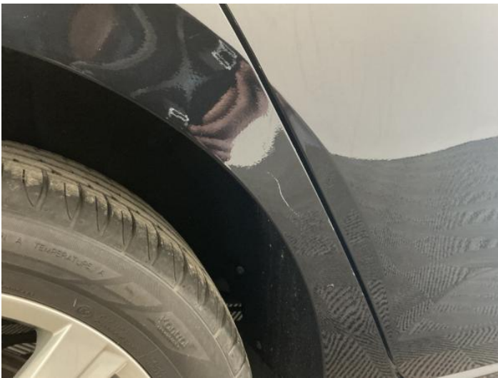
11: Qtr Panel osr Scratched UpTo 25mm Thru Paint