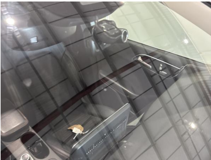
17: Screen Front Chipped Up To 10mm