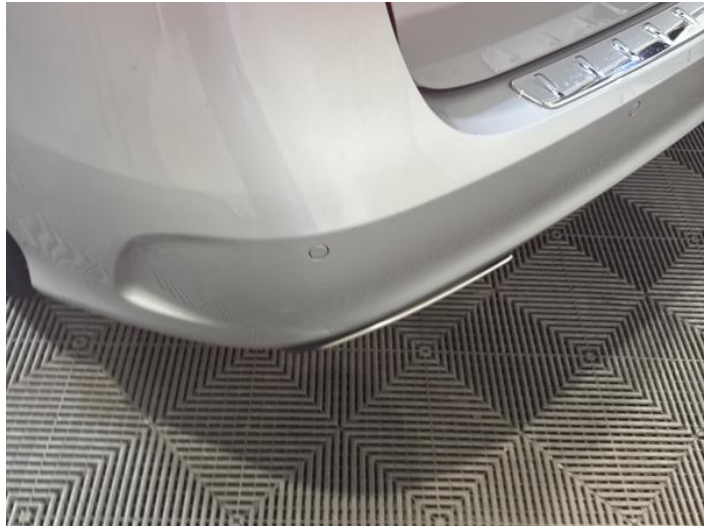
10: Bumper Rear Scratched 25 to 100mm Thru Paint