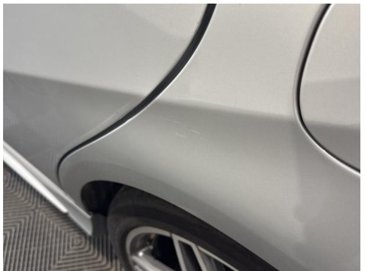
8: Qtr Panel nsr Scratched Over 25mm Thru Paint