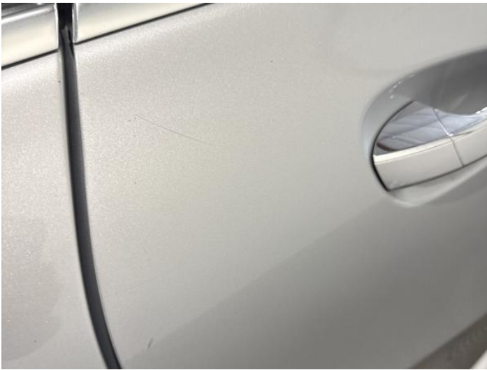
13: Door nsr Scratched Over 25mm Thru Paint