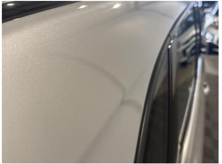
12: Qtr Panel nsr Dented Over 30mm