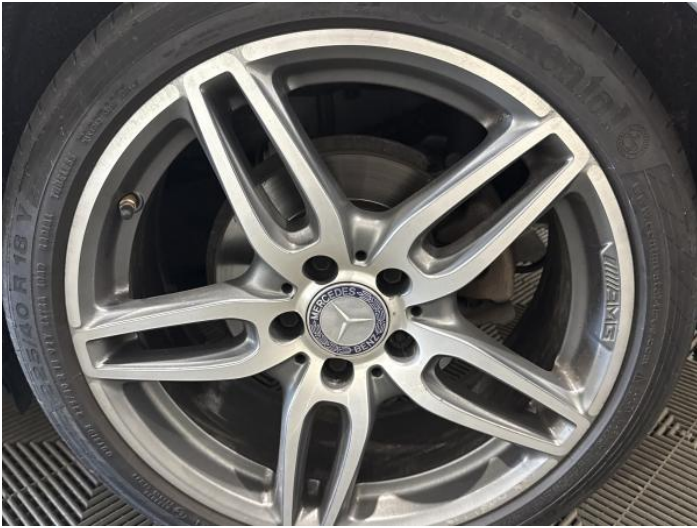
9: Wheel nsr Corroded Light