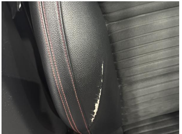
2: Seat Back Cover osf Scuffed Over 25mm