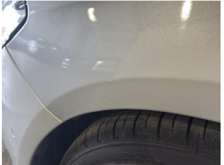
4: Wing nsf Poor Previous Repair Poor Paint