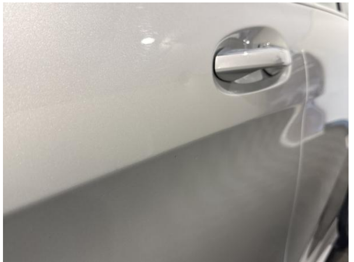
6: Door nsf Dented Between 10mm + 30mm