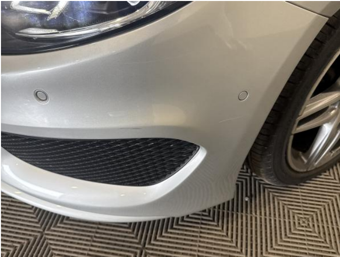
3: Bumper Front Scratched Over 100mm Thru Paint