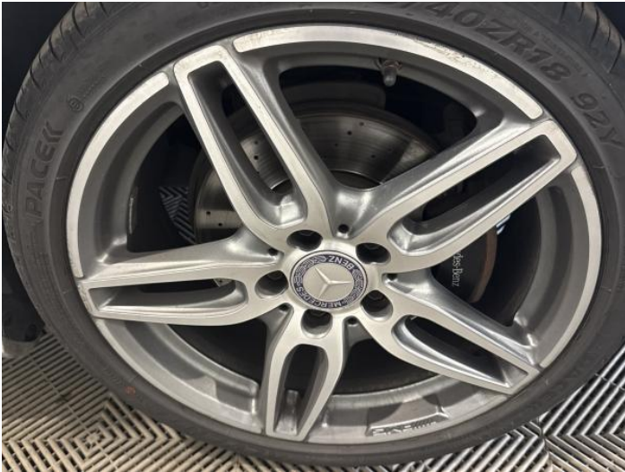
15: Wheel of Scratched Over 50mm