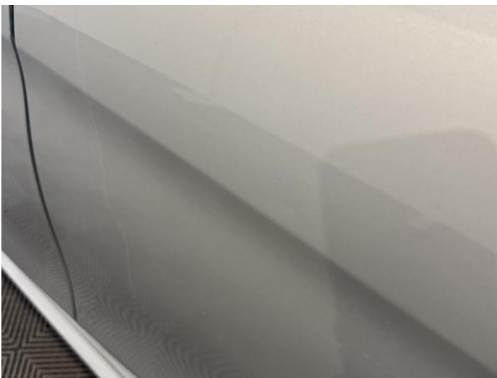
7: Door nsr Dented Between 10mm + 30mm