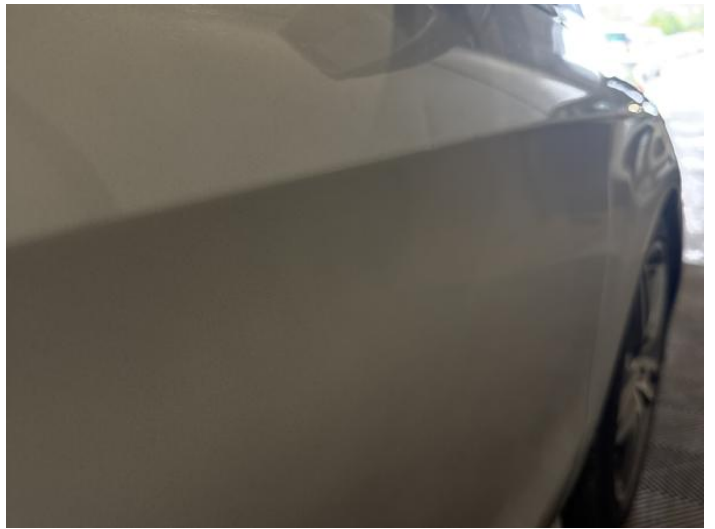
14: Door osf Dented Over 30mm