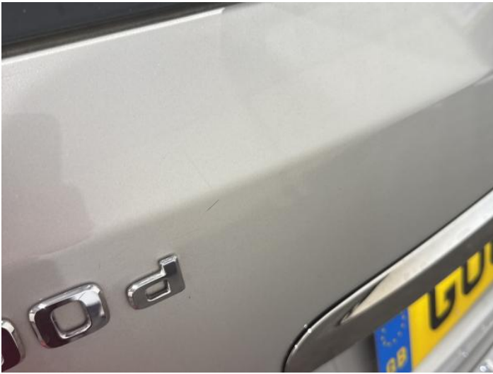
11: Tailgate Scratched UpTo 25mm Thru Paint