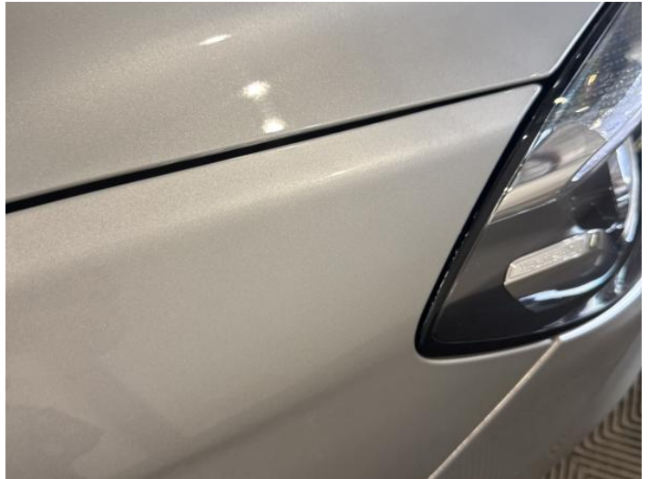
16: Wing of Chipped 1 To 5