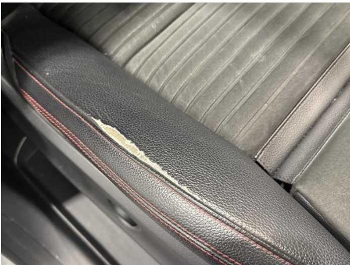
1: Seat Base Cover osf Torn Over 3mm