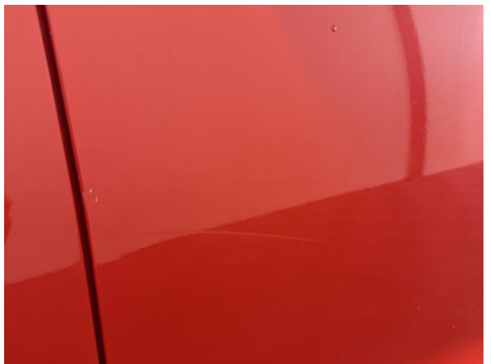
14: Door osf Chipped 1 To 5