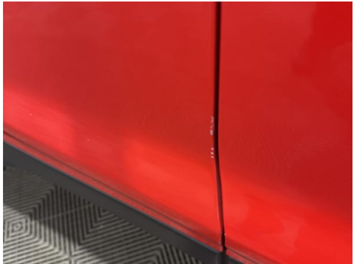
12: Door osr Chipped Edge Chip