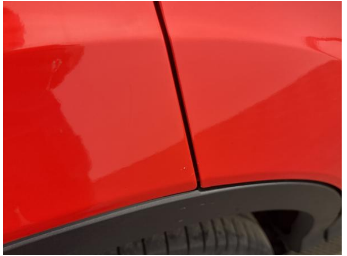
10: Qtr Panel osr Chipped 1 To 5