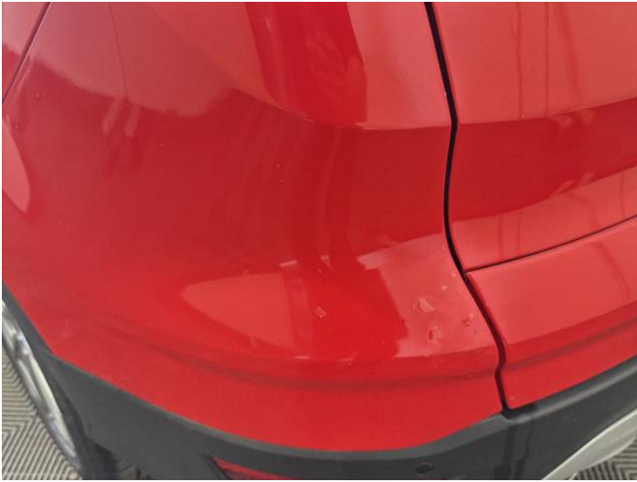
9: Bumper Rear Poor Previous Repair Poor Paint