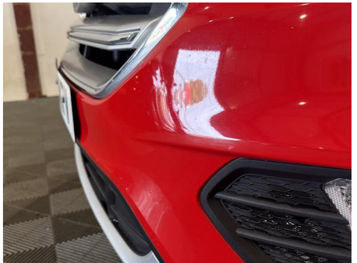
2: Bumper Front Chipped 1 To 5