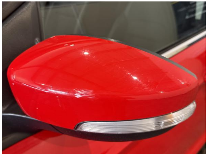
6: Door Mirror Assy nsf Scratched (Painted) UpTo 25mm Thru Paint