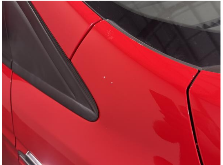
16: Wing osf Chipped 1 To 5