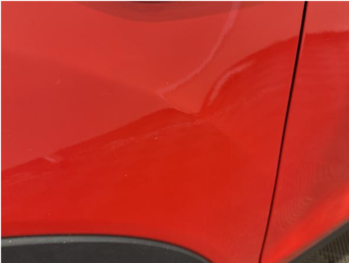
3: Wing nsf Scratched Over 25mm Thru Paint