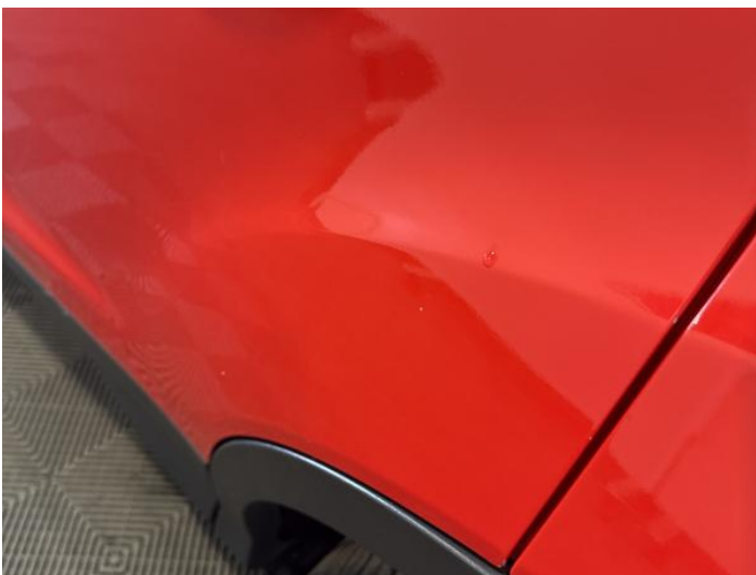
7: Door nsr Chipped 1 To 5