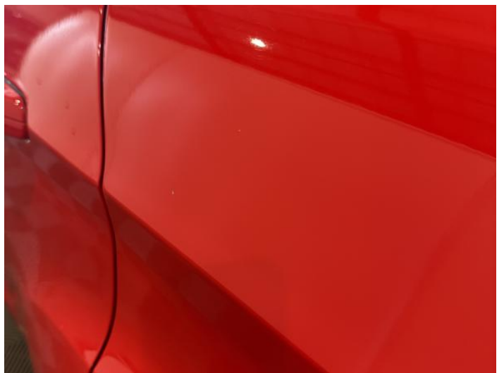
8: Qtr Panel nsr Chipped 1 To 5