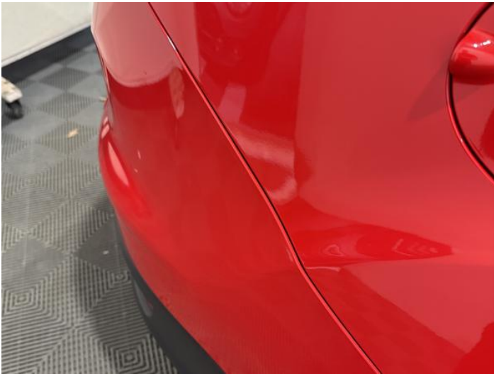
11: Bumper Rear Insecure Action Required