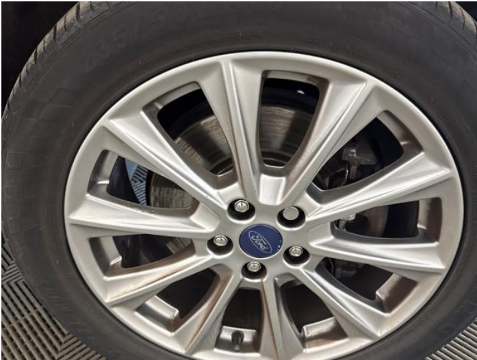
15: Wheel osf Corroded Light