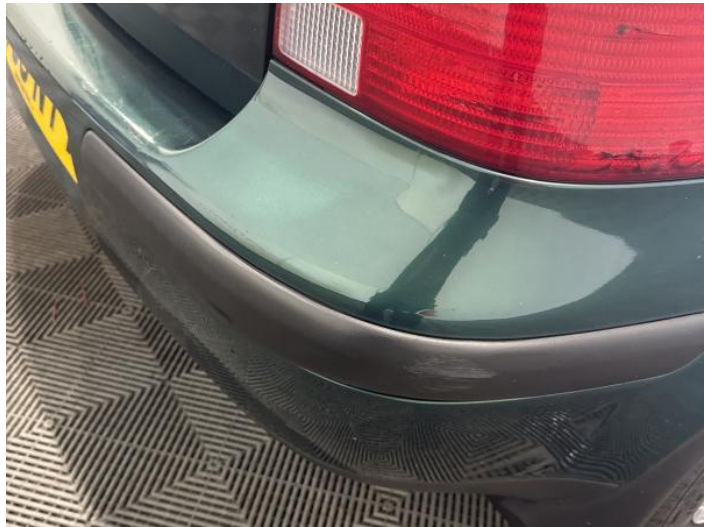
12: Bumper Rear Scratched 25 to 100mm Thru Paint