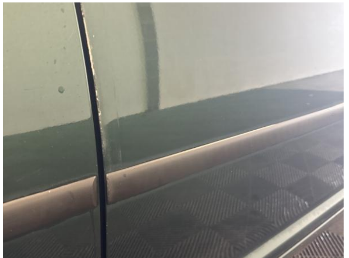
18: Door osf Chipped Edge Chip