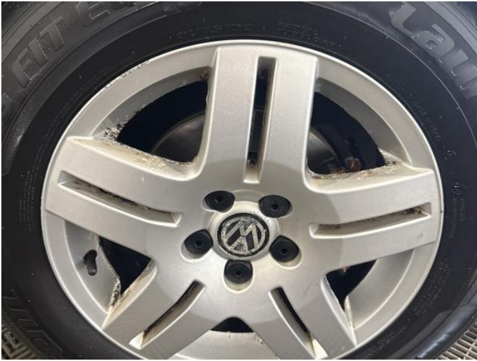
21: Wheel osf Corroded Light