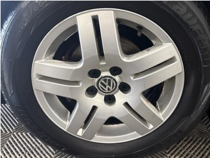
3: Wheel nsf Corroded Light