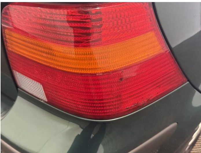
13: Lamp nsr Broken Replace