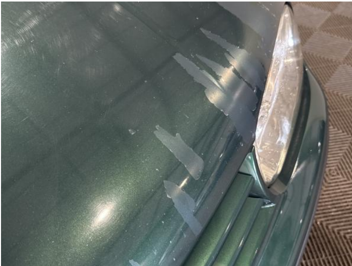
1: Bonnet Poor Previous Repair Paint Flake