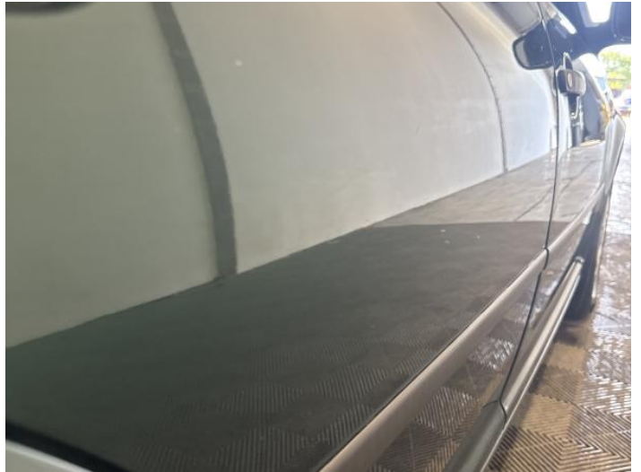
16: Door osr Dented Over 30mm