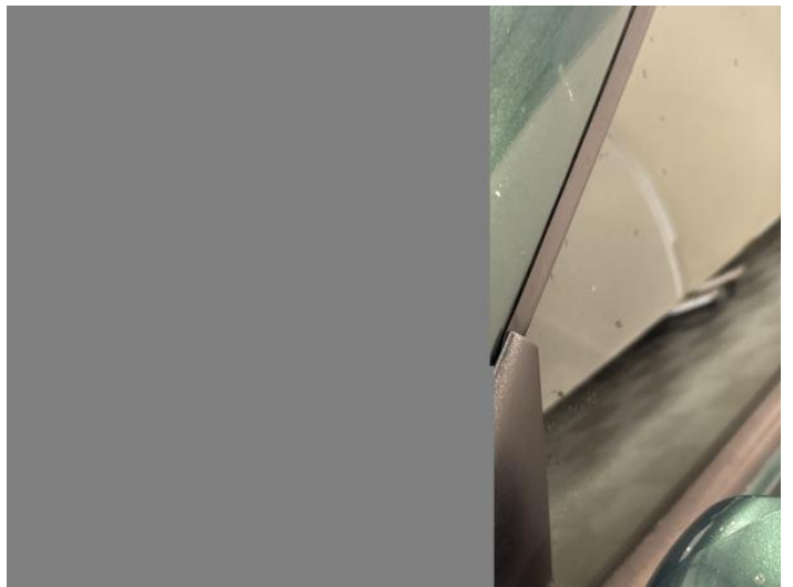
6: A Post ns Scratched Over 25mm Thru Paint