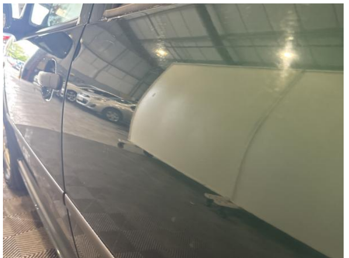
8: Door nsr Dented Between 10mm + 30mm