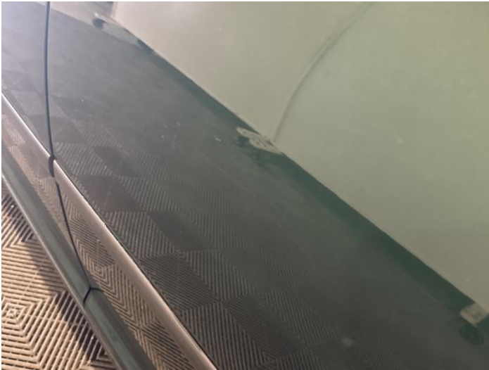
9: Door nsr Chipped Multiple Chips