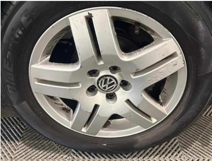
11: Wheel nsr Scratched Over 50mm