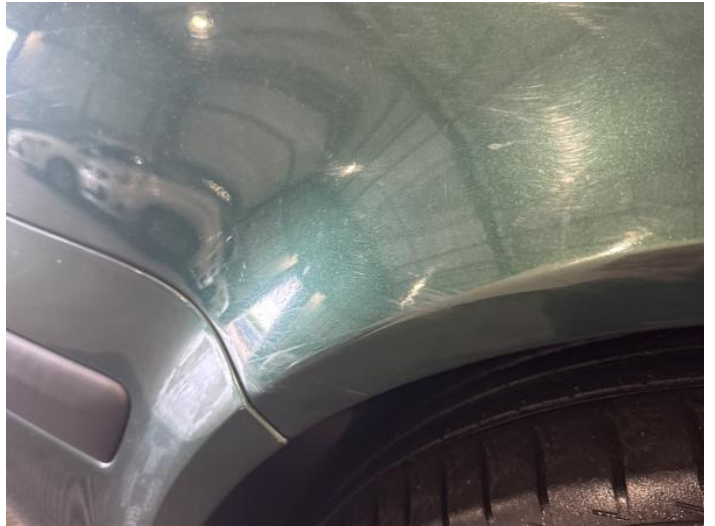
4: Wing nsf Scratched UpTo 25mm Thru Paint