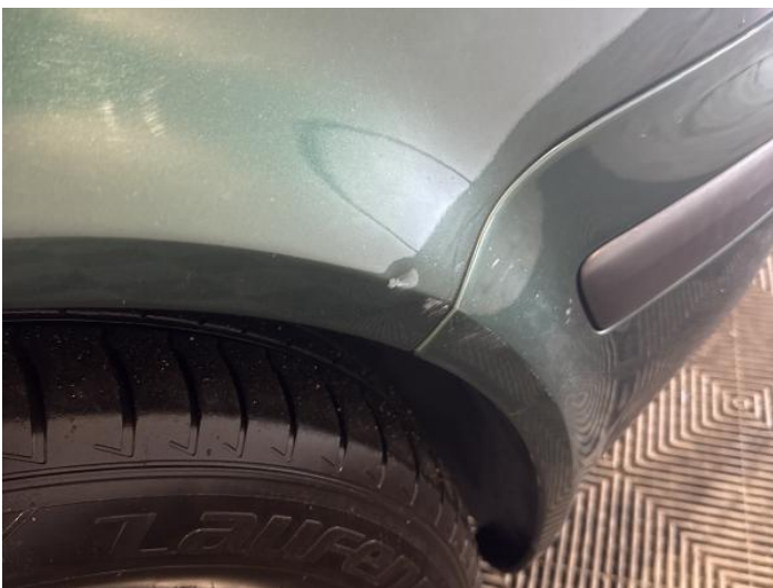
19: Wing osf Dented Between 10mm + 30mm