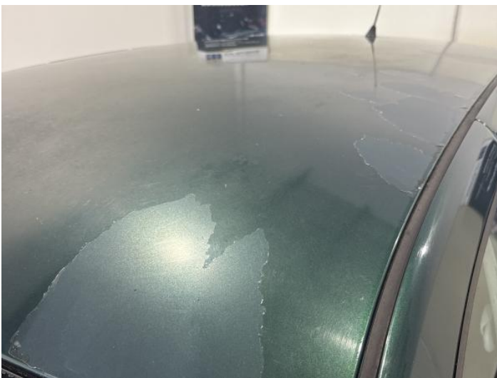
7: Roof Poor Previous Repair Paint Flake