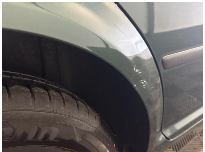
14: Qtr Panel osr Dented With Paint Damage