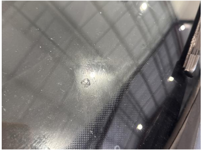
22: Screen Front Chipped Over 10mm