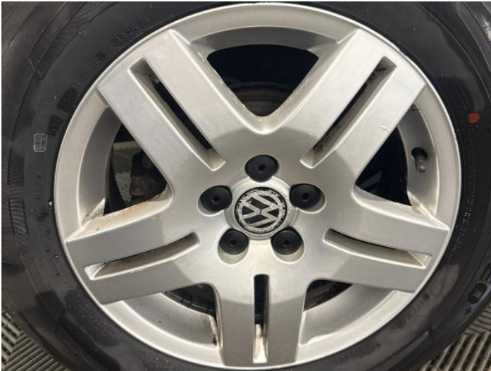
15: Wheel osr Corroded Light