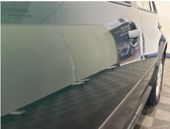
5: Door nsf Dented Over 30mm