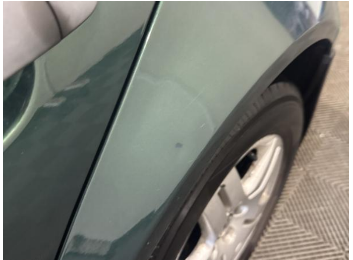
10: Qtr Panel nsr Dented Between 10mm + 30mm