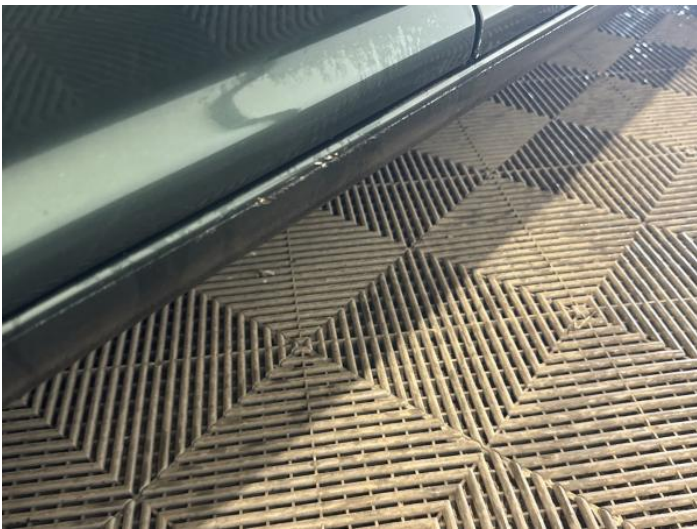
17: Sill os Scratched Over 25mm Thru Paint