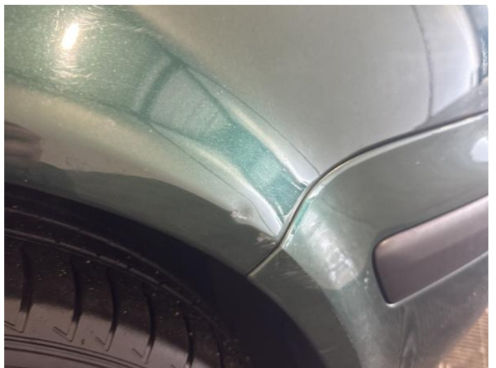
20: Wing osf Scratched Over 25mm Thru Paint