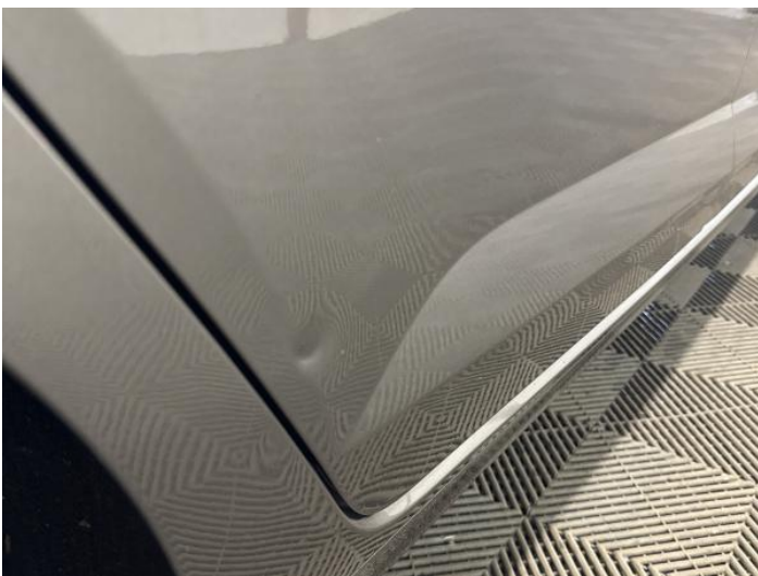
13: Door osr Dented Between 10mm + 30mm