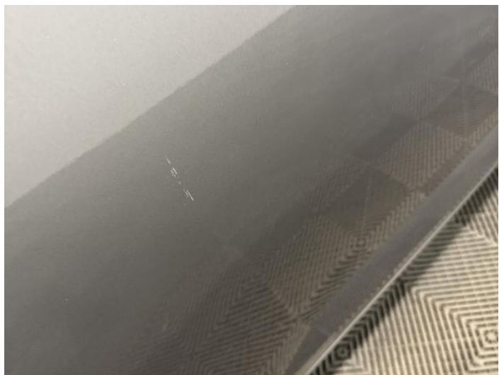
14: Door osr Scratched Over 25mm Thru Paint