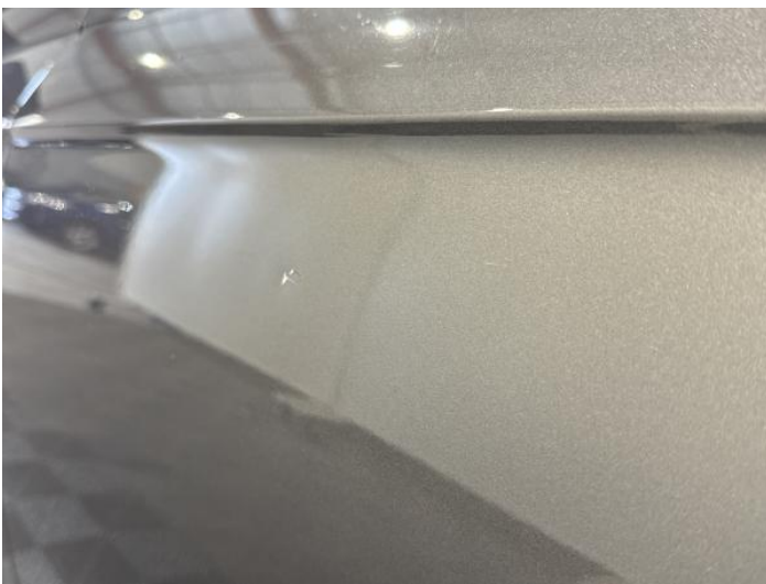
7: Door nsr Scratched UpTo 25mm Thru Paint