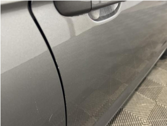
15: Door osf Chipped Edge Chip