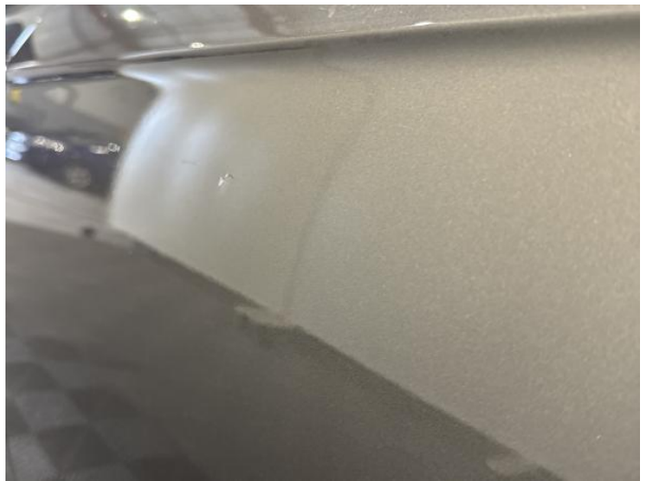
6: Door nsr Dented Between 10mm + 30mm