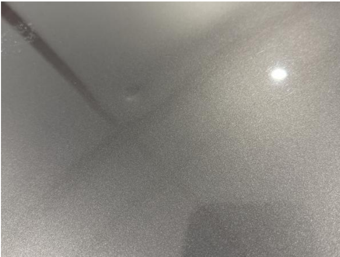
1: Bonnet Dented Between 10mm + 30mm