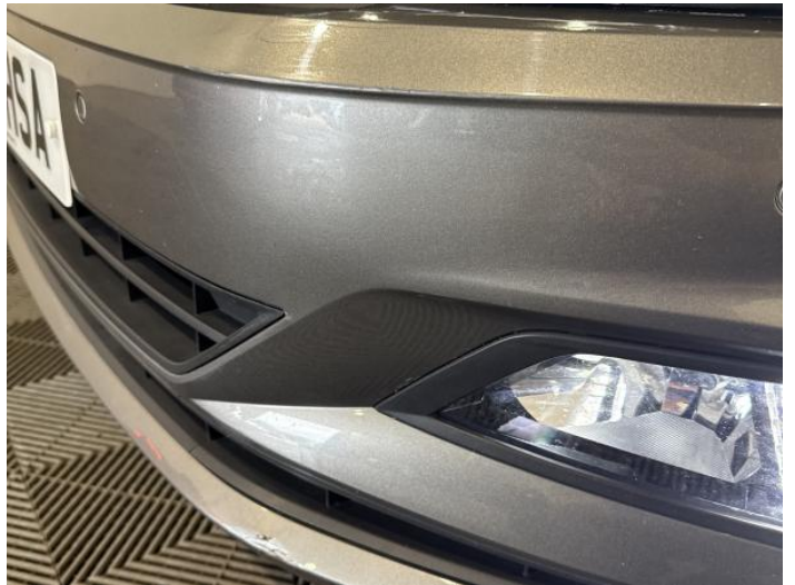
2: Bumper Front Dented With Paint Damage