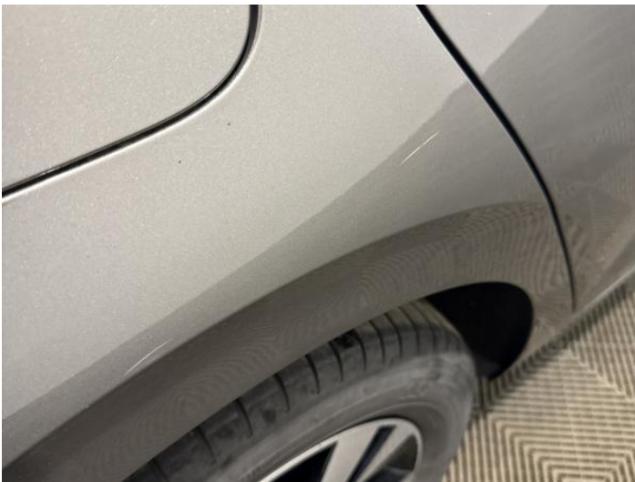
11: Qtr Panel osr Scratched Over 25mm Thru Paint