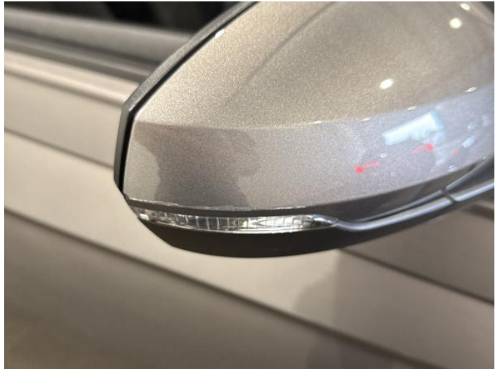
16: Door Mirror Assy osf Scratched (Painted) UpTo 25mm Thru Paint