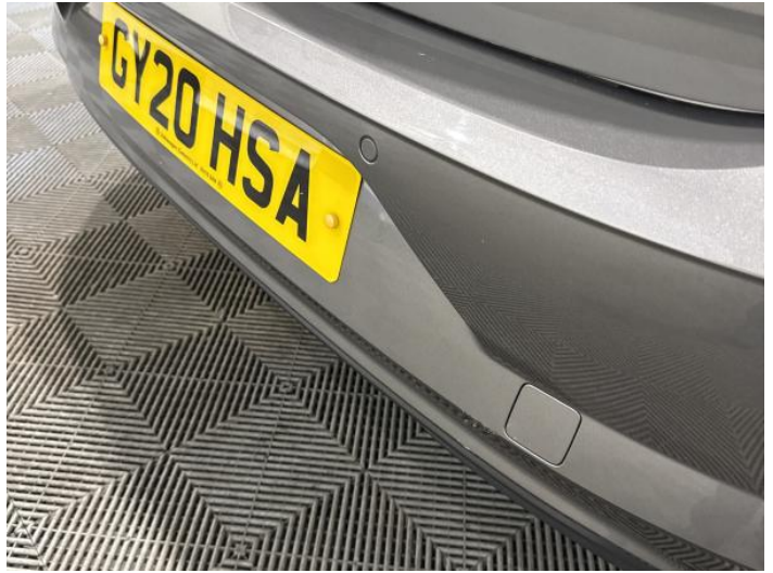
10: Bumper Rear Scratched 25 to 100mm Thru Paint