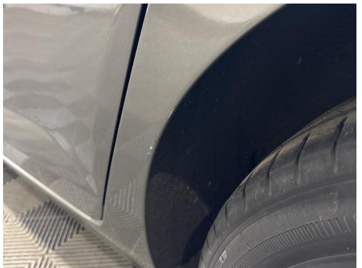
8: Qtr Panel nsr Scratched Over 25mm Thru Paint