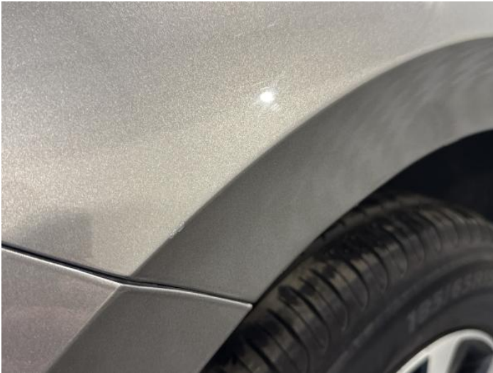
3: Wing nsf Scratched UpTo 25mm Thru Paint