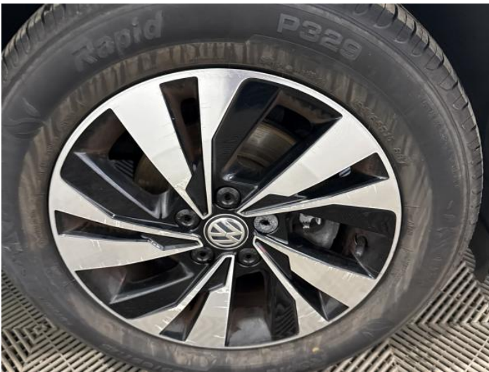
17: Wheel osf Scratched Over 50mm