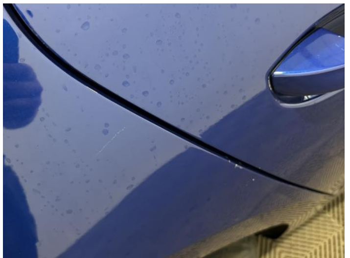
8: Qtr Panel osr Scratched Over 25mm Thru Paint