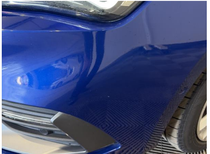
2: Bumper Front Chipped 1 To 5