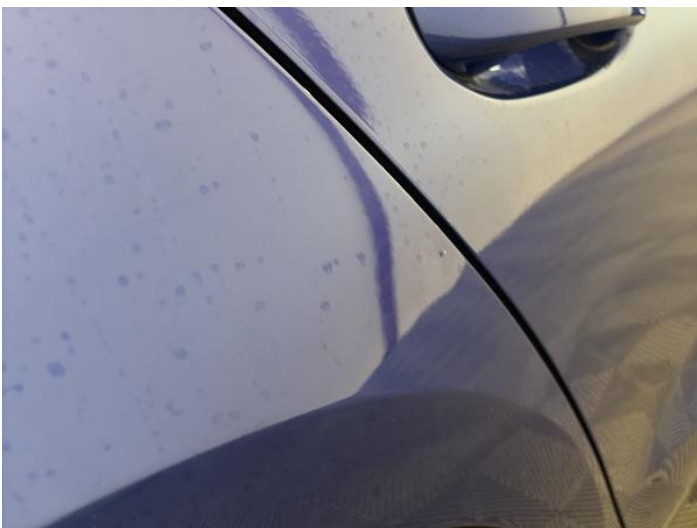
7: Qtr Panel osr Dented Between 10mm + 30mm