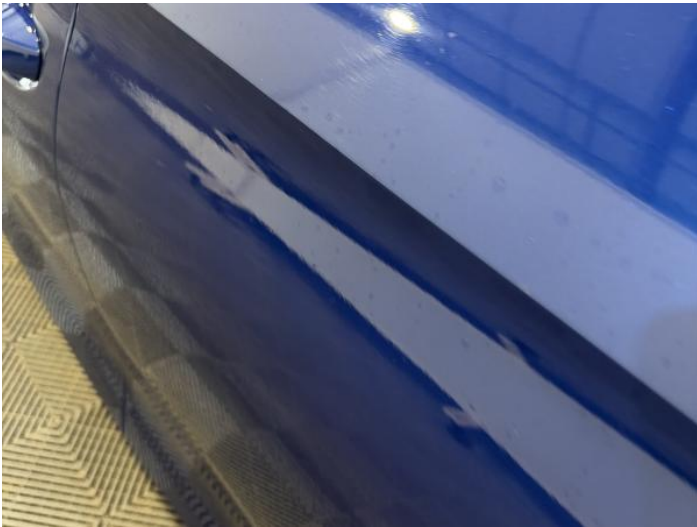
5: Door nsr Dented Between 10mm + 30mm