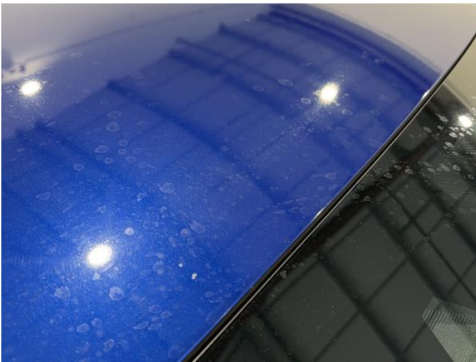
11: Roof Chipped 1 To 5