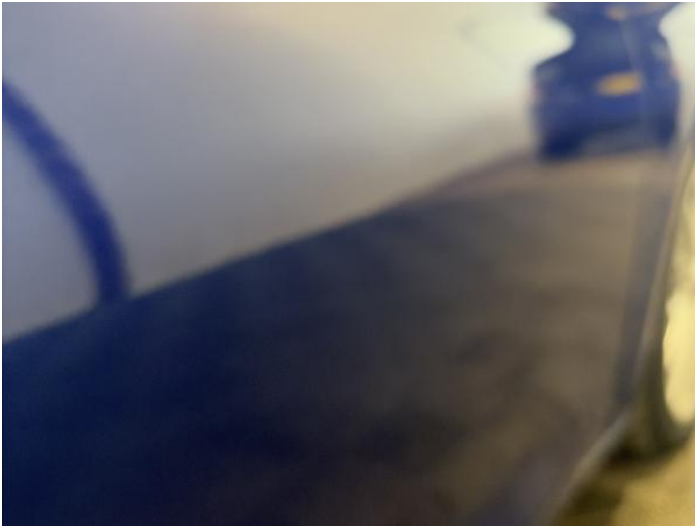
9: Door osf Dented Between 10mm + 30mm