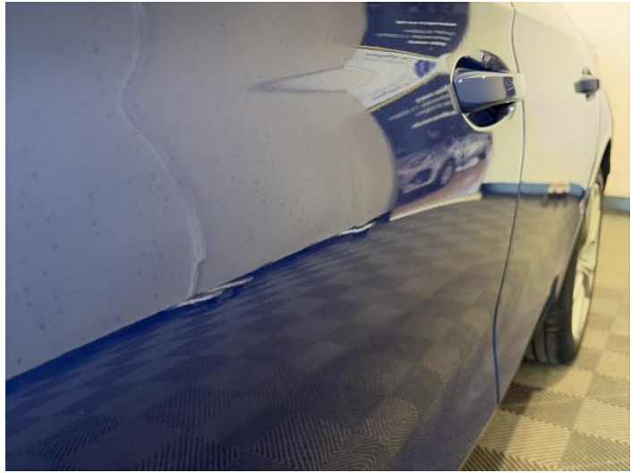
4: Door nsf Dented Over 30mm