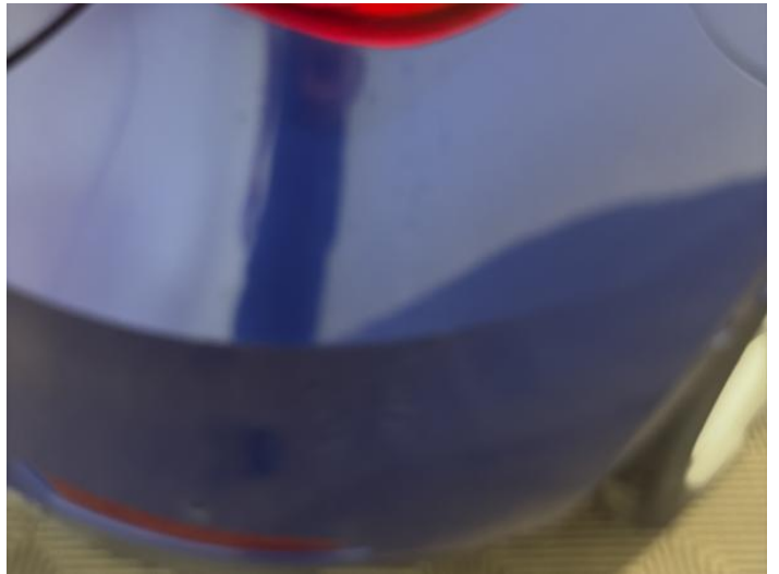
6: Bumper Rear Scratched 25 to 100mm Thru Paint