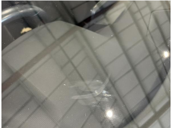
10: Screen Front Chipped UpTo 10mm