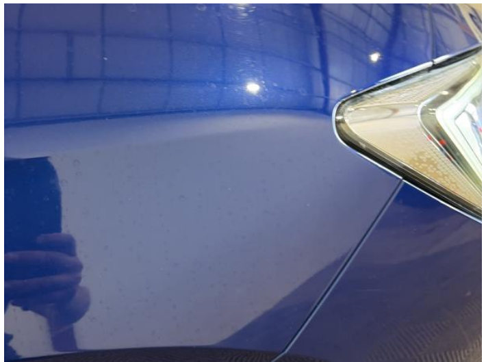
12: Wing osf Chipped 1 To 5