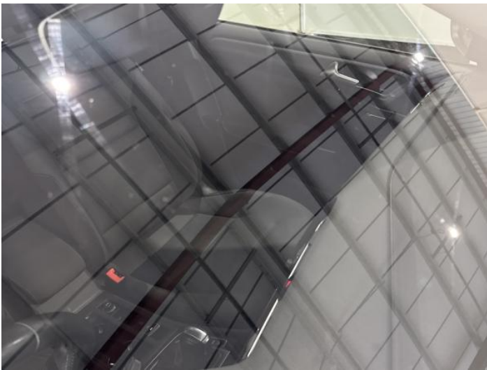
11: Screen Front Chipped UpTo 10mm