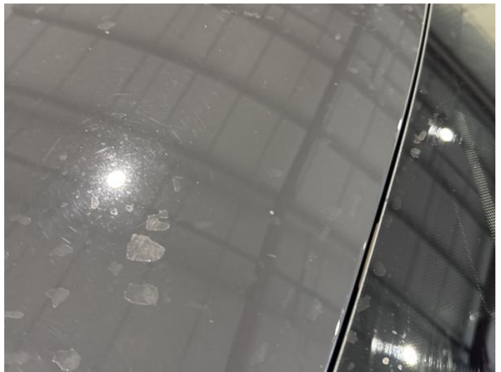
12: Roof Chipped 1 To 5