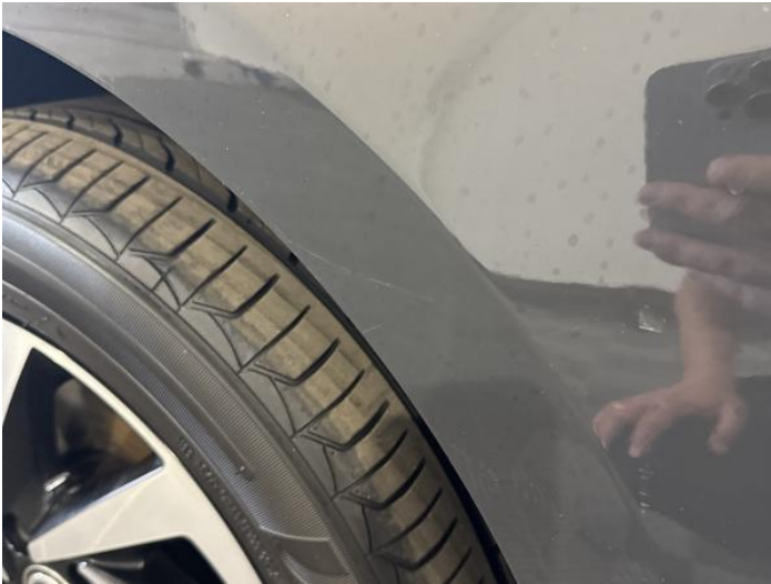
3: Wing nsf Scratched Over 25mm Thru Paint