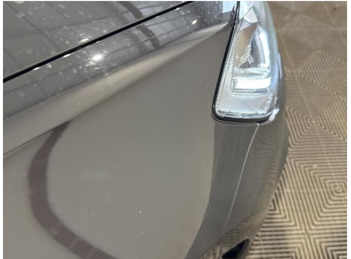
10: Wing osf Chipped 1 To 5