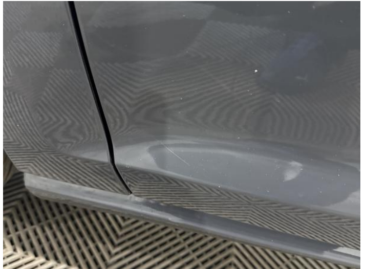
4: Door nsf Scratched UpTo 25mm Thru Paint