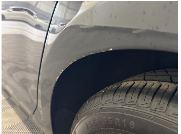
6: Qtr Panel nsr Scratched Rusted