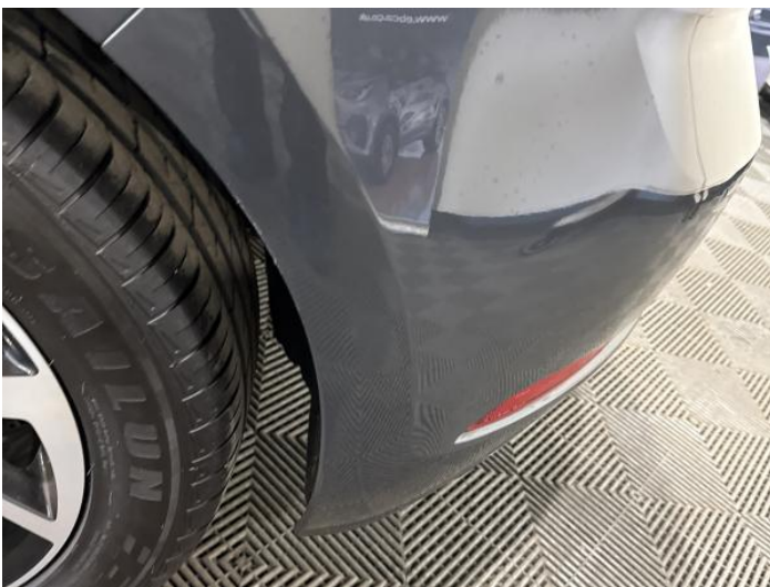
7: Bumper Rear Scratched 25 to 100mm Thru Paint