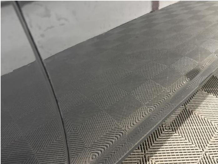
9: Door osf Scratched Over 25mm Thru Paint