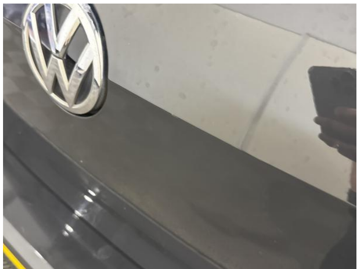
8: Tailgate Chipped 1 To 5