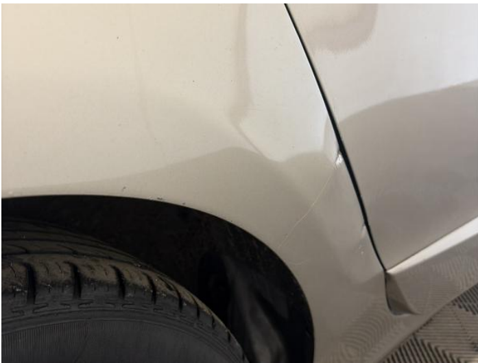
17: Qtr Panel osr Dented With Paint Damage