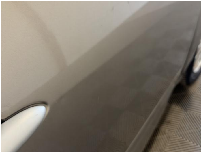
21: Door osf Dented 2 Or Less UpTo 10mm