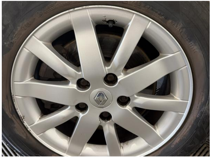
6: Wheel nsf Scratched Over 50mm