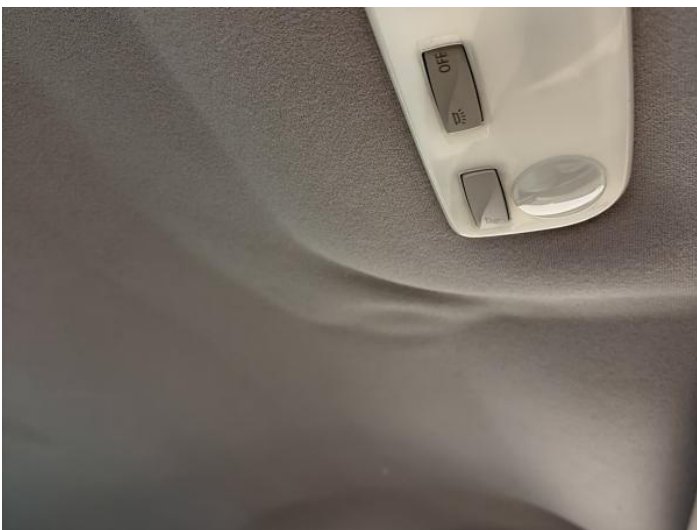
25: Roof Lining Scuffed Over 25mm