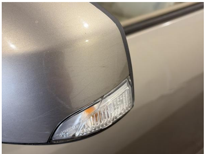
8: Flasher Side Repeater ns Broken Replace