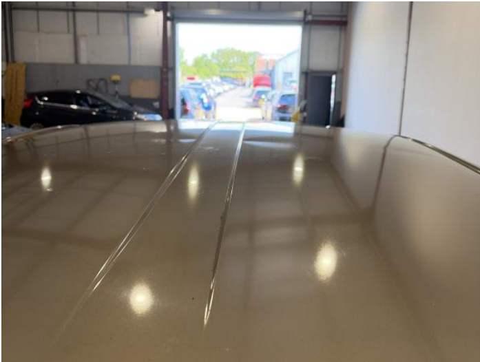
15: Roof Dented Over 30mm