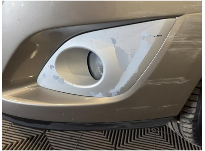
4: Fog Lamp Surround ns Scratched (Painted) Over 25mm Thru Paint