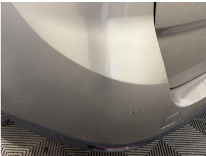
13: Bumper Rear Scratched 25 to 100mm Thru Paint