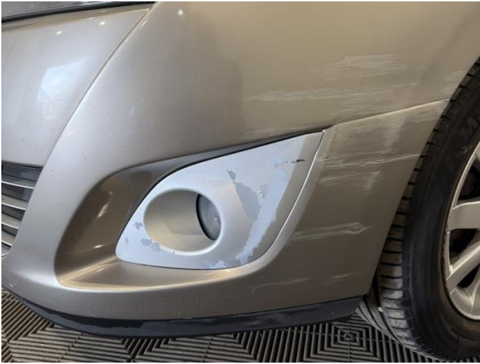
3: Bumper Front Scratched Over 100mm Thru Paint