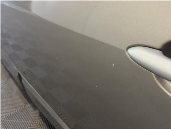
9: Door nsr Chipped Multiple Chips