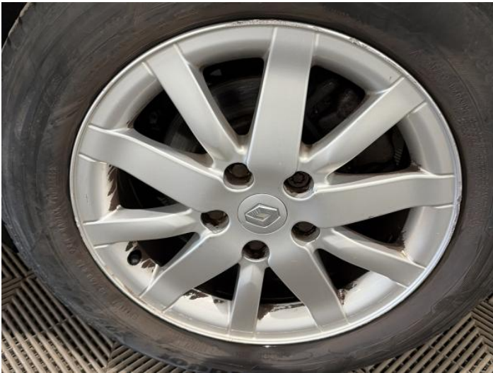
11: Wheel nsr Scratched Over 50mm