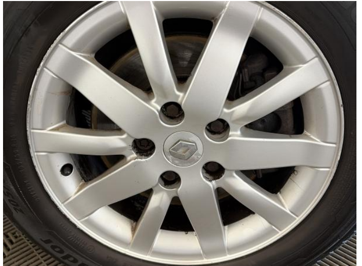
22: Wheel osf Scratched Over 50mm