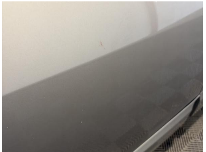
18: Door osr Chipped 1 To 5