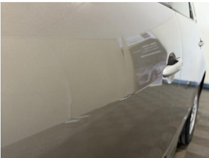
7: Door nsf Dented Over 30mm