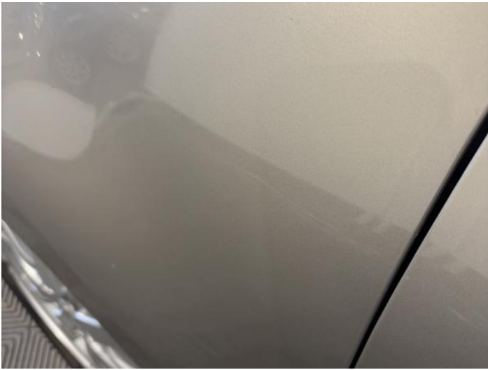
5: Wing nsf Scratched Over 25mm Thru Paint