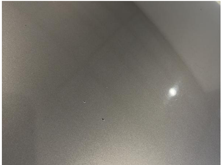
2: Bonnet Chipped 1 To 5