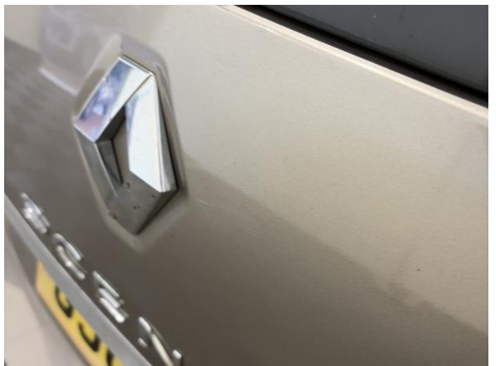
14: Tailgate Scratched UpTo 25mm Thru Paint