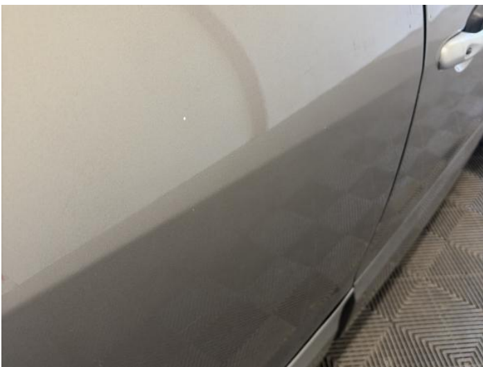
19: Door osr Dented Between 10mm + 30mm