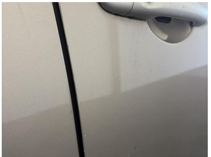
20: Door osf Chipped Edge Chip