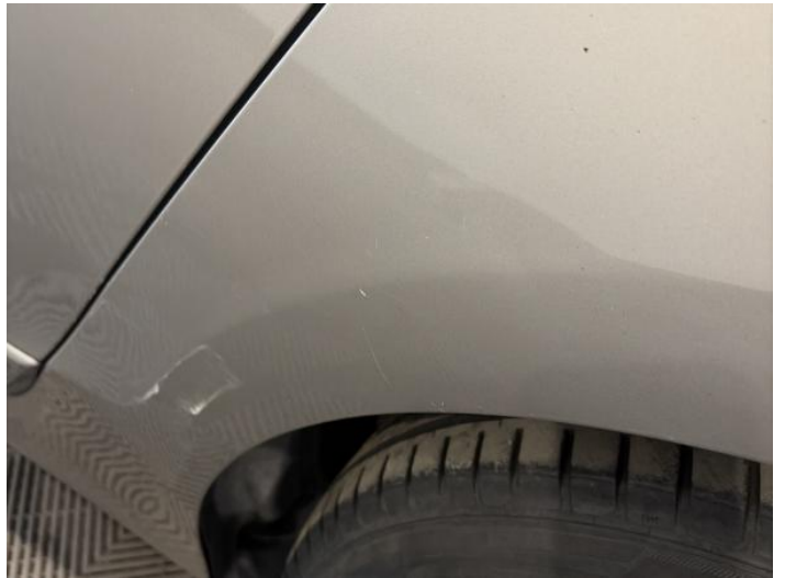
12: Qtr Panel nsr Dented With Paint Damage