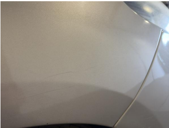
23: Wing osf Scratched Over 25mm Thru Paint