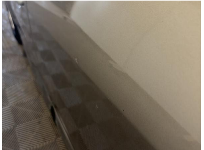
10: Door nsr Dented Between 10mm + 30mm