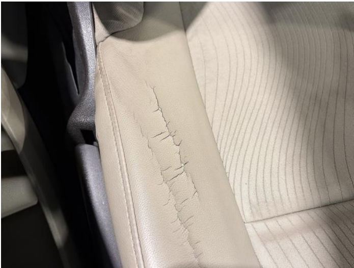
1: Seat Base Cover osf Scuffed Over 25mm