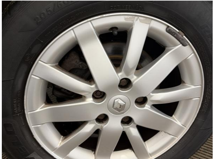
16: Wheel osr Scratched Over 50mm