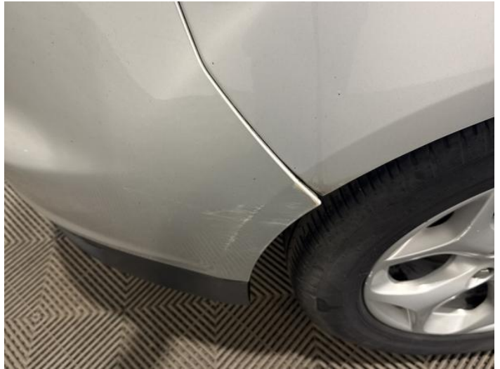
10: Bumper Rear Insecure Action Required