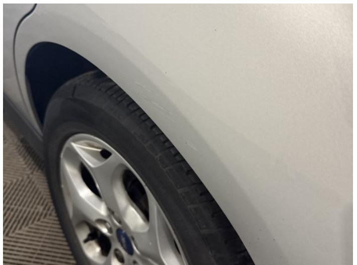
8: Qtr Panel nsr Scratched Over 25mm Thru Paint