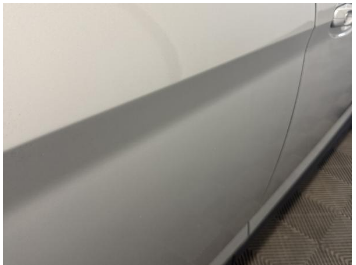
14: Door osr Dented 2 Or Less UpTo 10mm