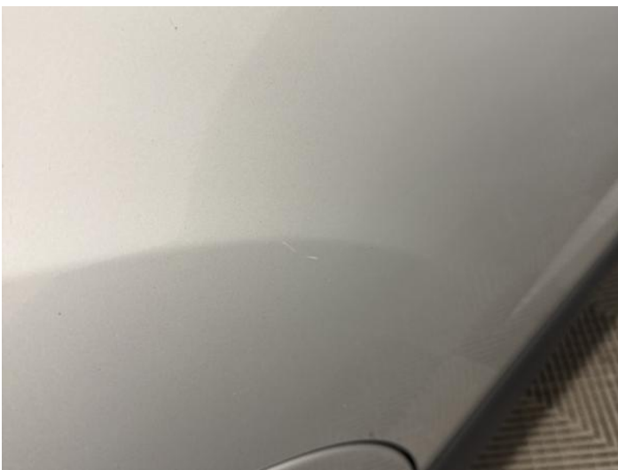
13: Door osr Scratched UpTo 25mm Thru Paint