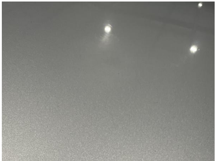
18: Roof Scratched Over 25mm Thru Paint