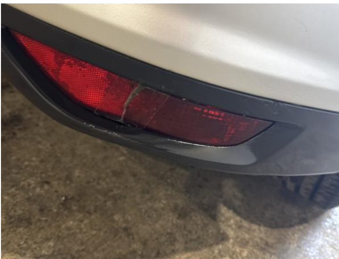
19: Bumper Reflector osr Broken Replace