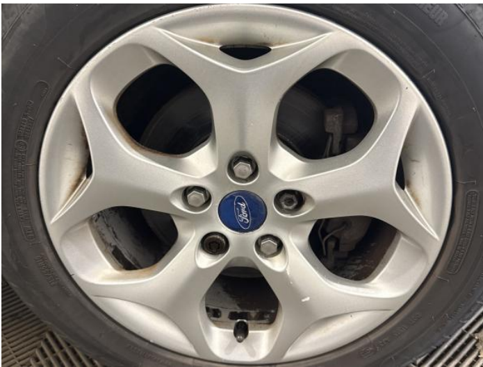
17: Wheel osf Scratched Up To 50mm