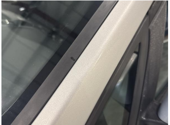
4: A Post ns Chipped 1 To 5