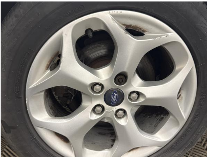
11: Wheel osr Scratched Over 50mm