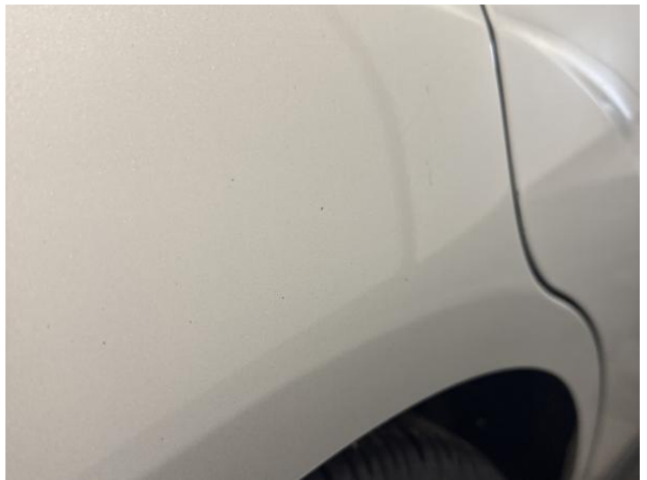
12: Qtr Panel osr Dented 2 Or Less UpTo 10mm