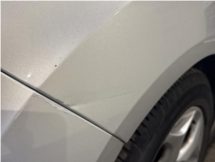
3: Wing nsf Dented With Paint Damage