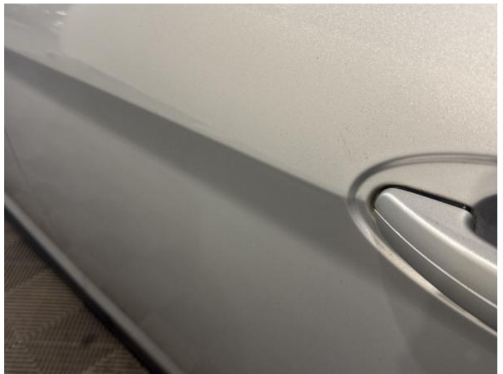
6: Door nsr Chipped 1 To 5