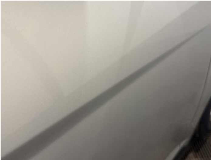
15: Door osf Dented Between 10mm + 30mm