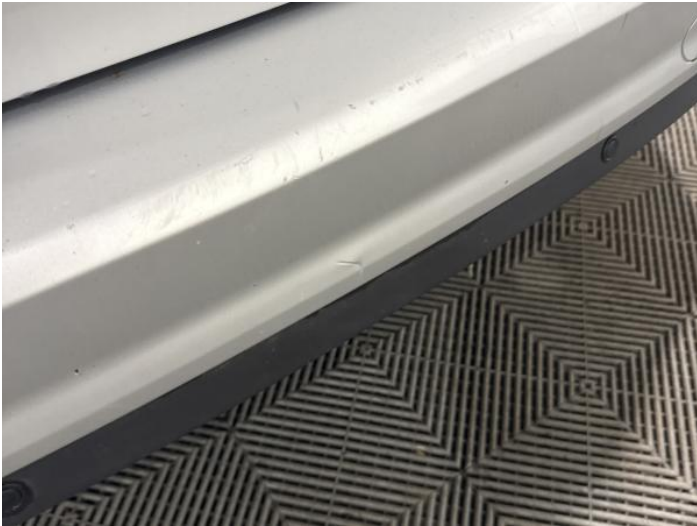
9: Bumper Rear Scratched Over 100mm Thru Paint