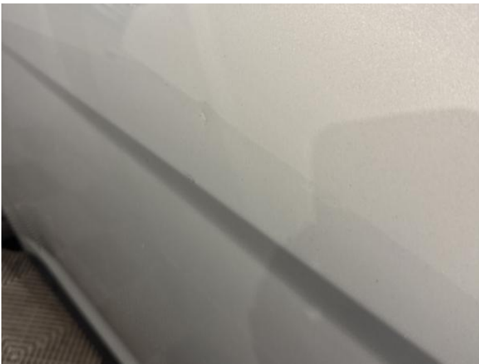
5: Door nsf Dented With Paint Damage