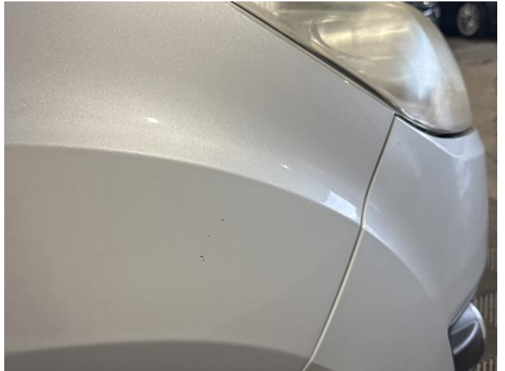
16: Wing osf Chipped 1 To 5