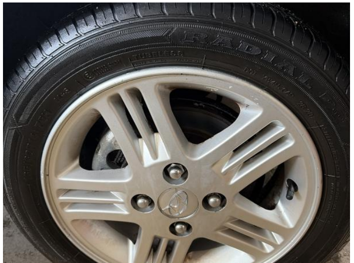
12: Wheel nsr Scratched Up To 50mm