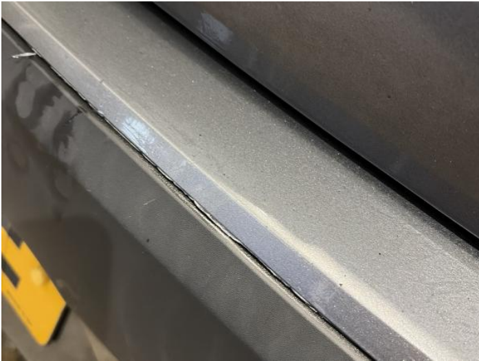
9: Bumper Rear Poor Previous Repair Poor Paint