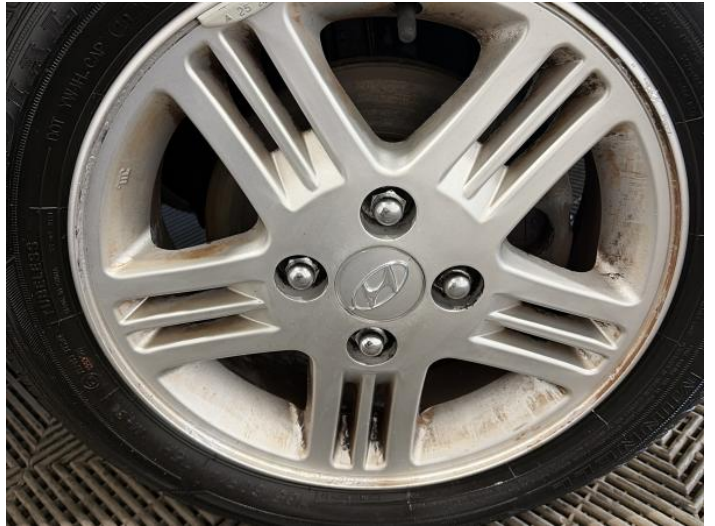
16: Wheel of Scratched Over 50mm