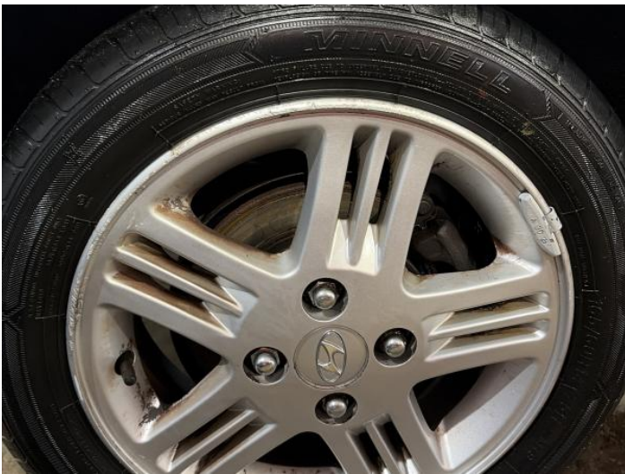
11: Wheel osr Scratched Over 50mm