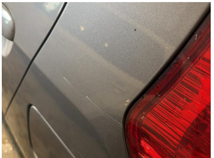
8: Qtr Panel nsr Scratched Over 25mm Thru Paint