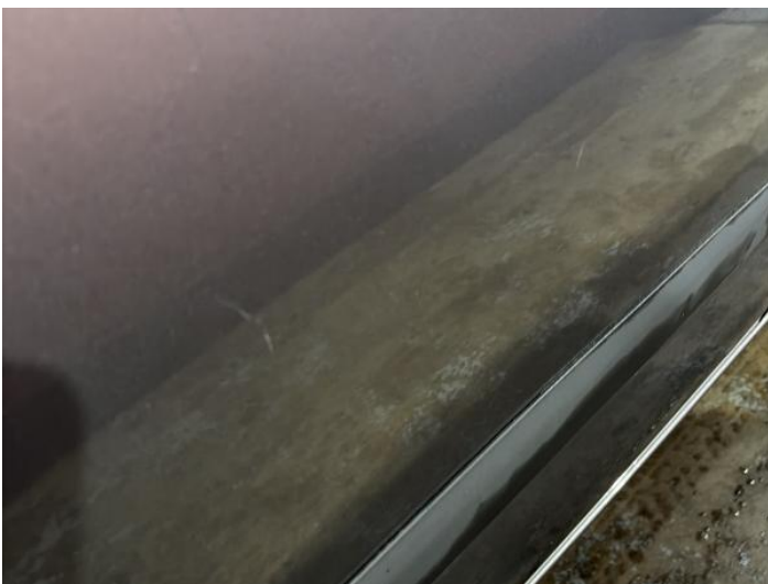
13: Door osr Scratched Over 25mm Thru Paint