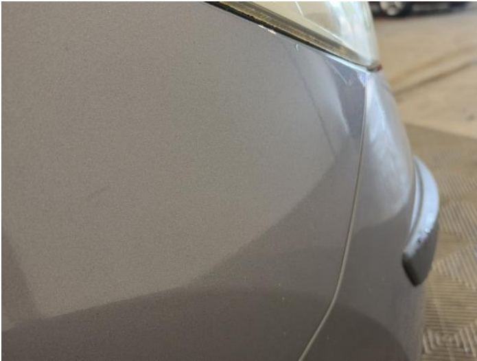
15: Wing of Chipped 1 To 5