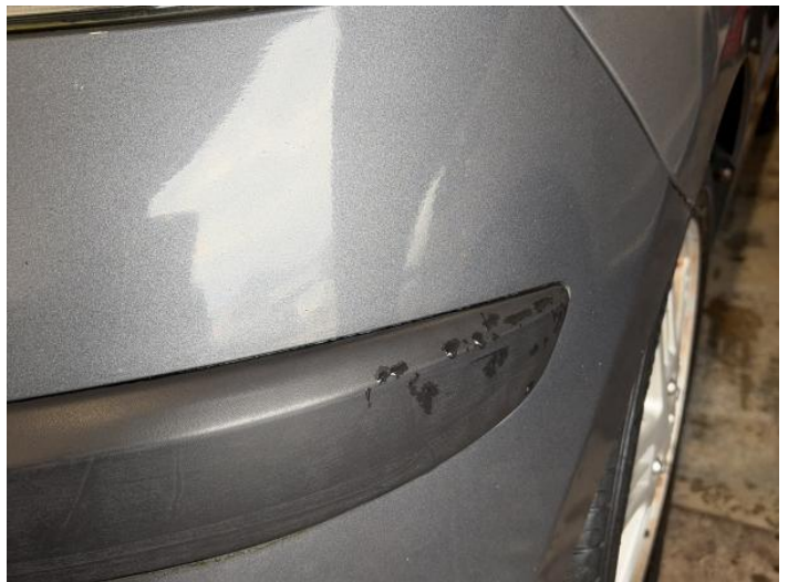
2: Bumper Front Poor Previous Repair Poor Paint