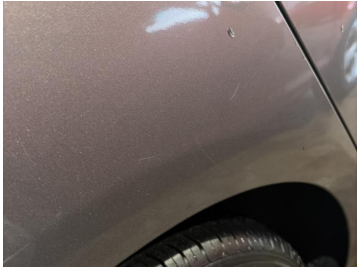
10: Qtr Panel osr Scratched Over 25mm Thru Paint