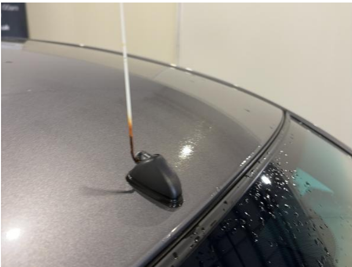
17: Aerial Broken Replace