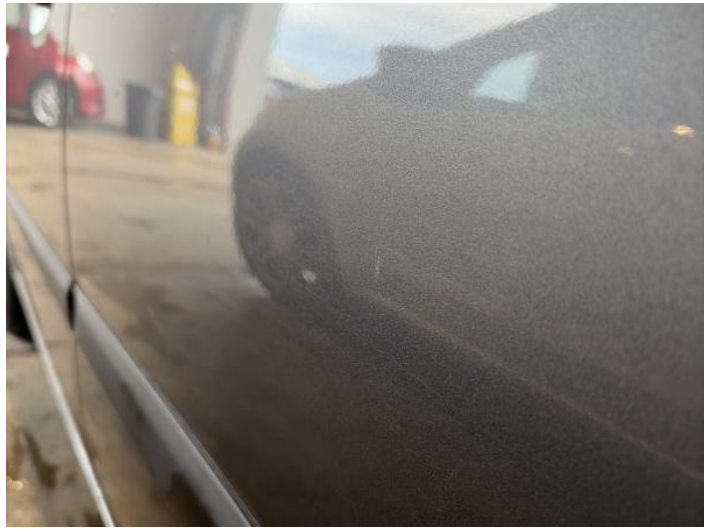
6: Door nsr Dented 2 Or Less UpTo 10mm