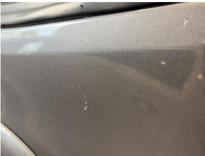
7: Door nsr Chipped 1 To 5