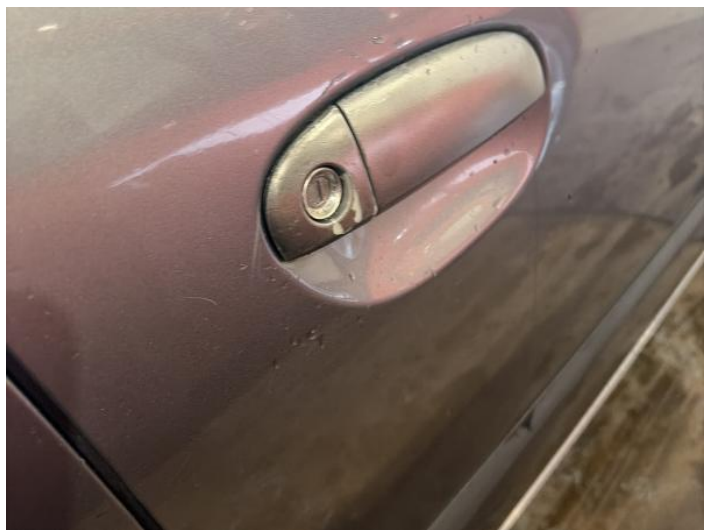
14: Door osf Scratched Over 25mm Thru Paint