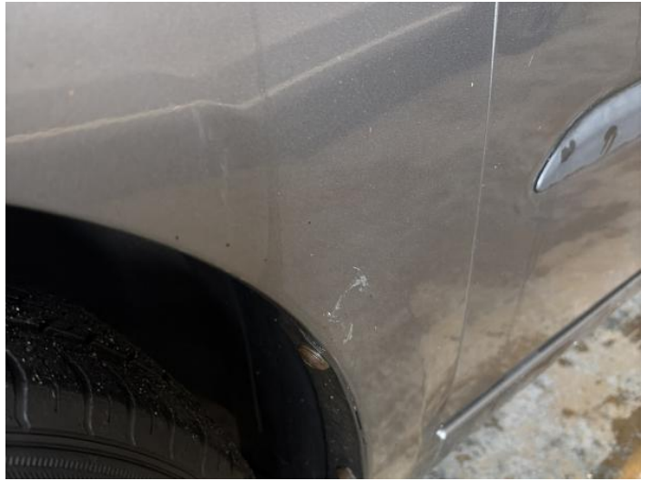
4: Wing nsf Scratched Over 25mm Thru Paint