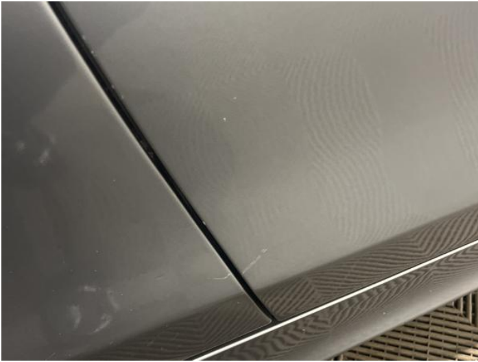
15: Door osf Scratched Over 25mm Thru Paint