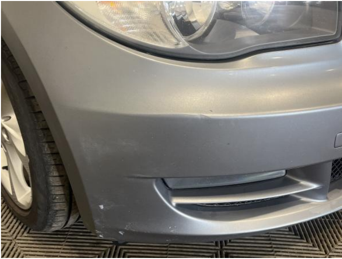
3: Bumper Front Poor Previous Repair Poor Paint