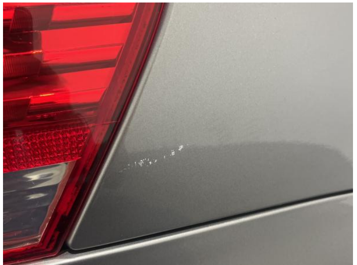
12: Qtr Panel osr Scratched Over 25mm Thru Paint