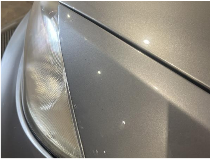
5: Wing nsf Chipped 1 To 5