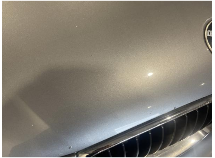
4: Bonnet Chipped Multiple Chips