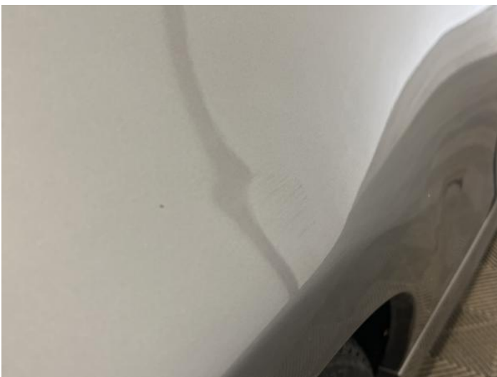
13: Qtr Panel osr Dented Over 30mm