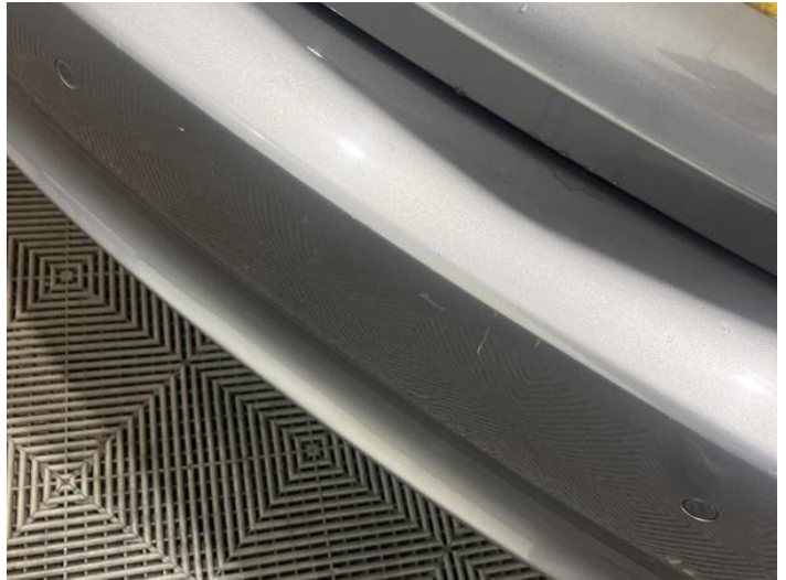
10: Bumper Rear Scratched 25 to 100mm Thru Paint