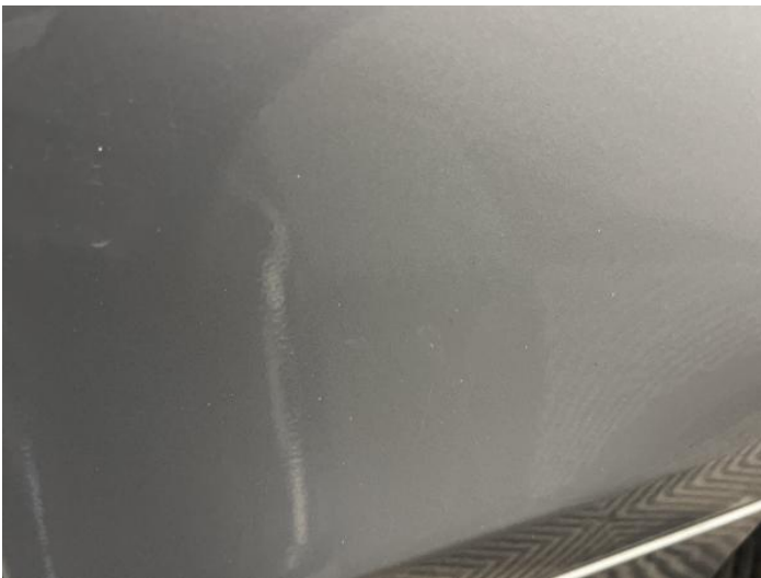
1: Wing of Scratched Up To 25mm Thru Paint