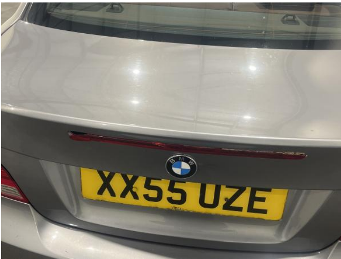
11: Reflector nsr Broken Replace