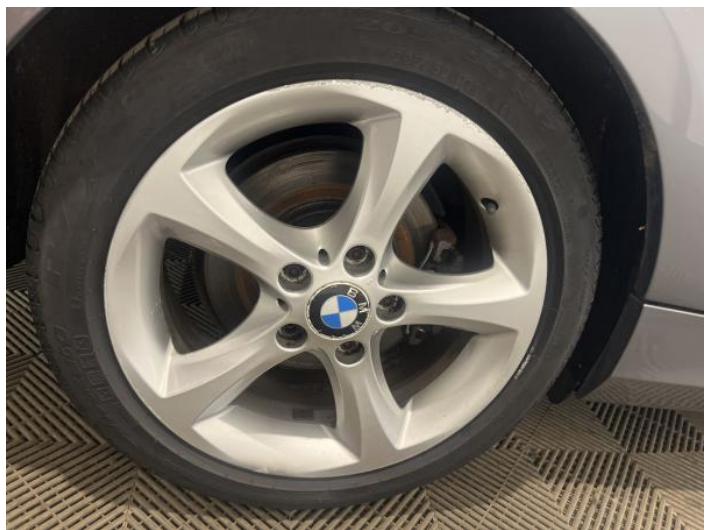
14: Wheel osr Scratched Over 50mm