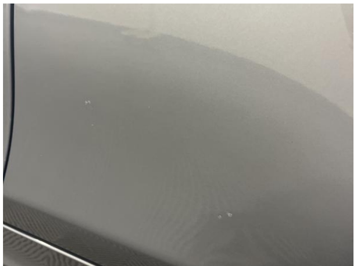
8: Qtr Panel nsr Chipped Multiple Chips