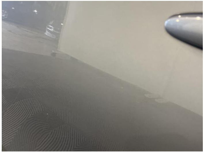
6: Door nsf Chipped Multiple Chips