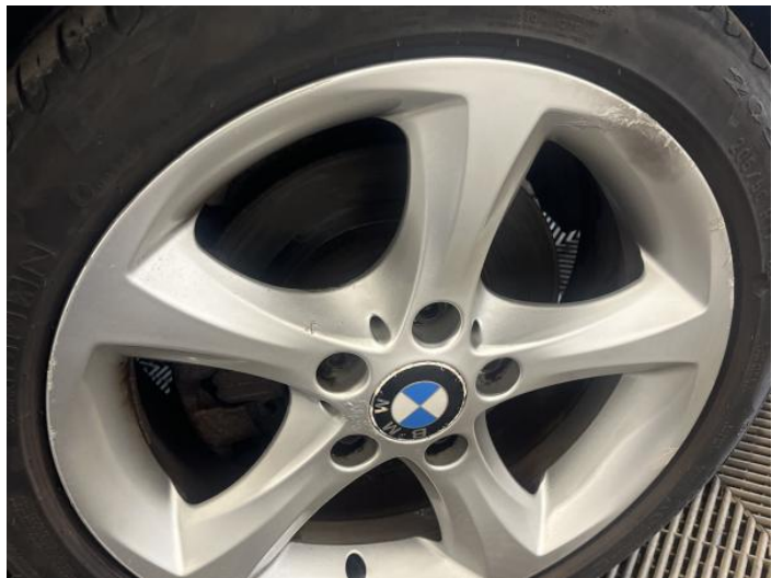
2: Wheel of Scratched Up To 50mm