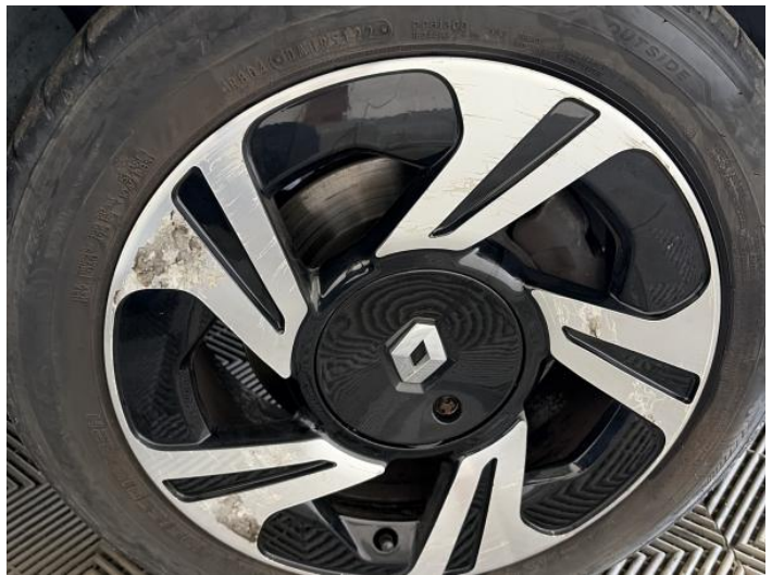
12: Wheel osf Scratched Over 50mm