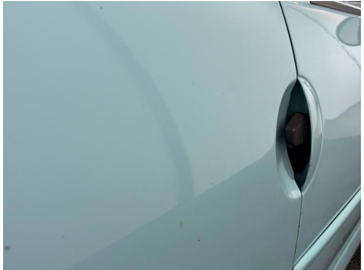
10: Qtr Panel osr Dented Between 10mm + 30mm