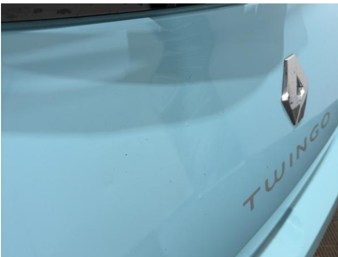
7: Tailgate Dented Between 10mm + 30mm