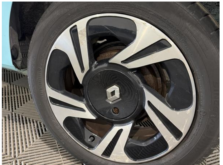
6: Wheel nsr Scratched Over 50mm