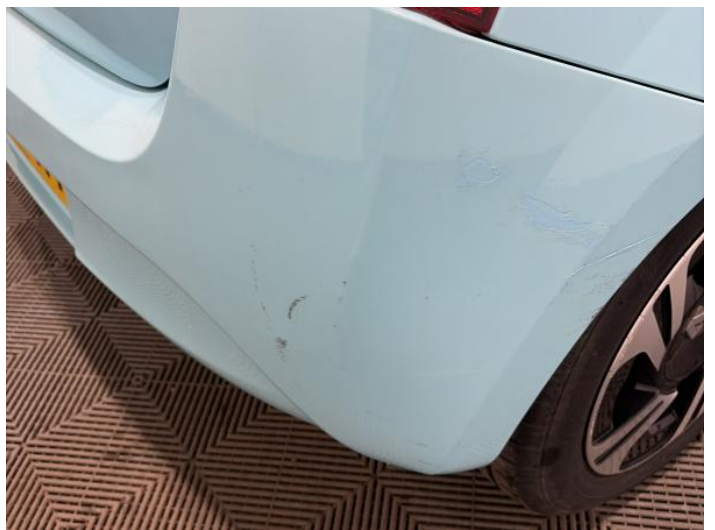
8: Bumper Rear Dented With Paint Damage