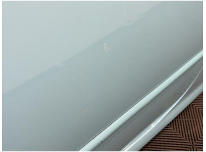
4: Door nsf Scratched Rusted