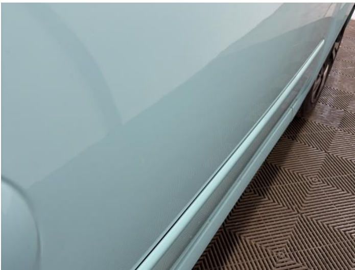
11: Door osf Poor Previous Repair Rippled UpTo 30%