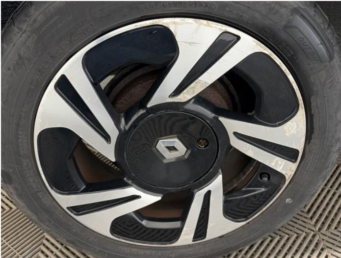
9: Wheel osr Scratched Over 50mm