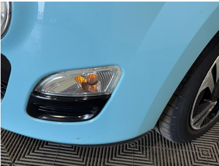
1: Bumper Front Scratched 25 to 100mm Thru Paint