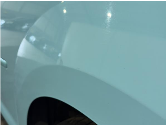
5: Qtr Panel nsr Dented Between 10mm + 30mm