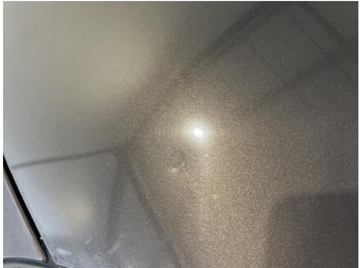
4: Bonnet Dented With Paint Damage