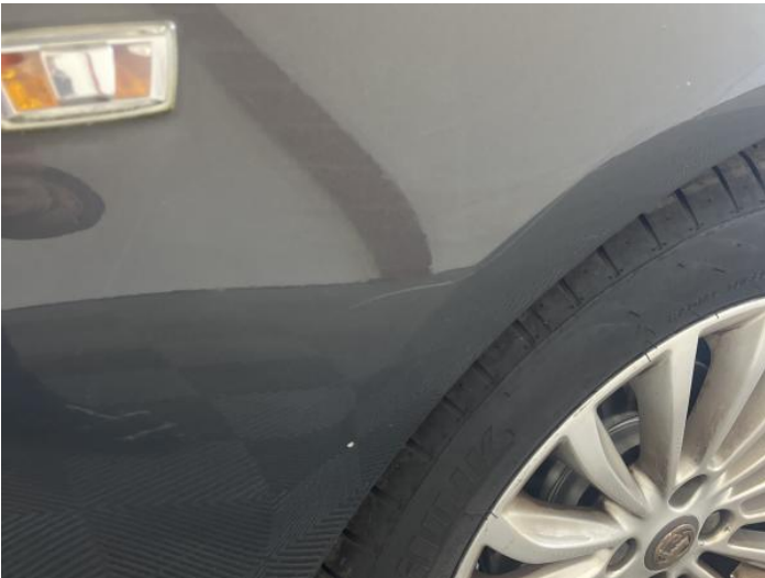
1: Wing of Scratched Over 25mm Thru Paint