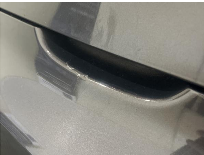
7: Bumper Rear Poor Previous Repair Paint Flake