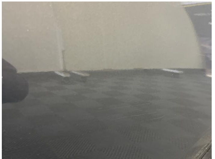
6: Qtr Panel nsr Scratched Over 25mm Thru Paint