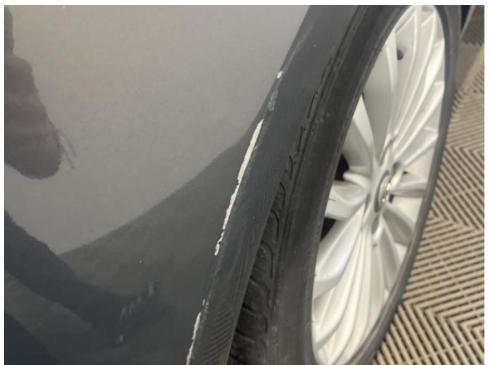
8: Bumper Rear Scratched Over 100mm Thru Paint