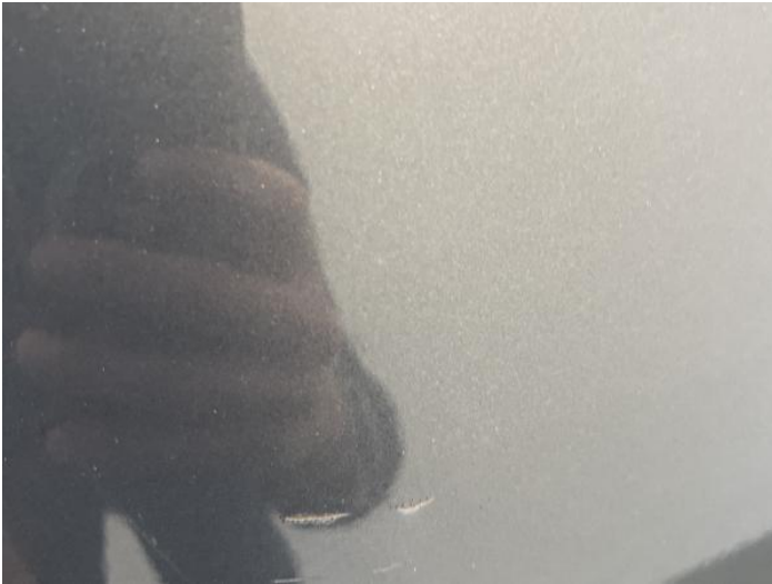
9: Qtr Panel osr Scratched Over 25mm Thru Paint