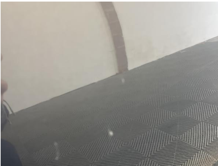
11: Door osf Scratched UpTo 25mm Thru Paint