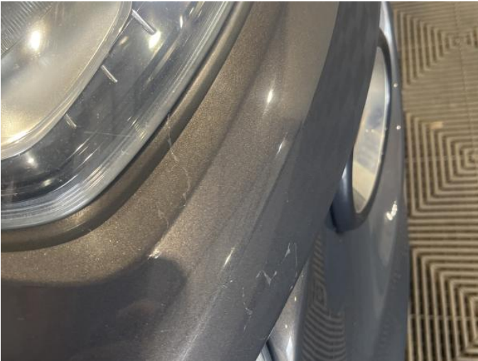
3: Bumper Front Poor Previous Repair Paint Flake