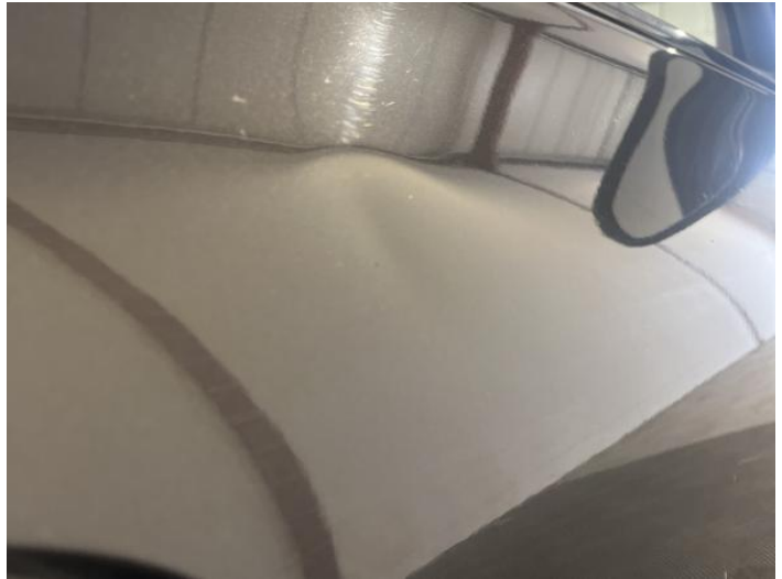
10: Door osf Dented Over 30mm