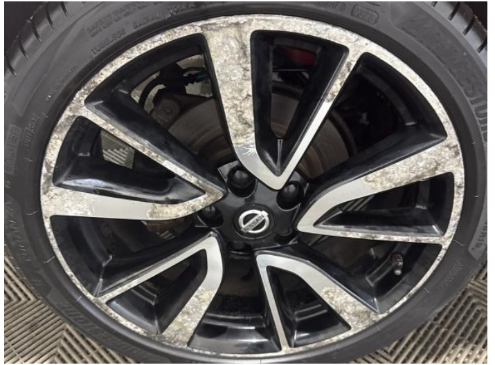
10: Wheel osr Scratched Over 50mm