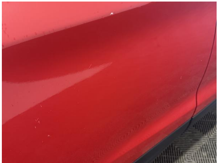
12: Door osf Chipped Multiple Chips