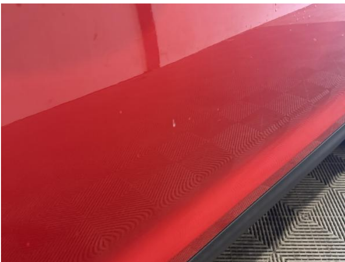
13: Door osf Dented Between 10mm + 30mm