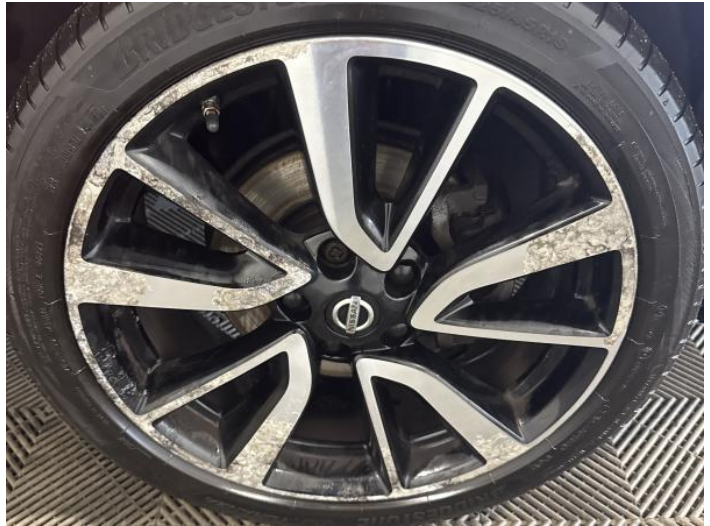
15: Wing of Chipped Multiple Chips