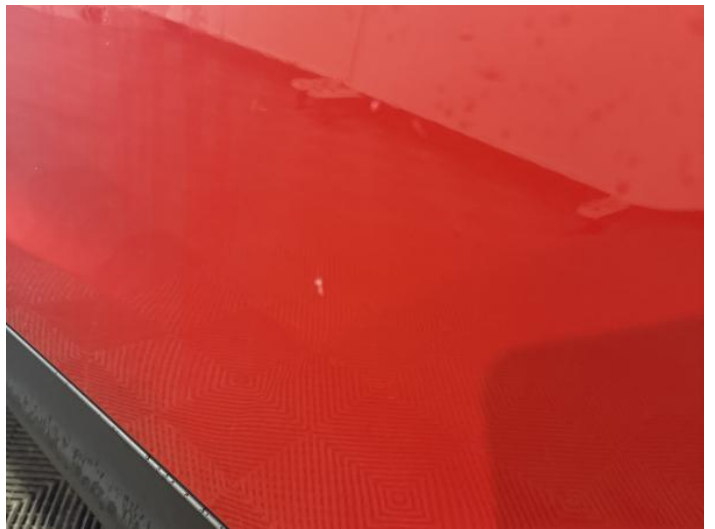
6: Door nsr Scratched Over 25mm Thru Paint