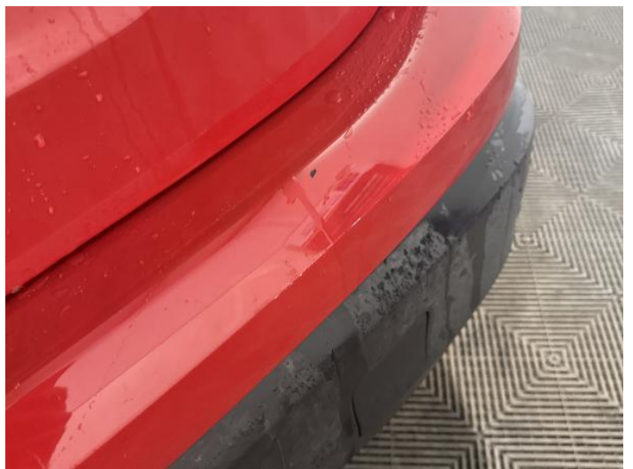
8: Bumper Rear Scratched 25 to 100mm Thru Paint