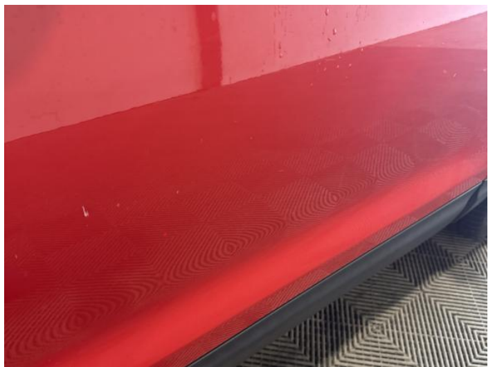
14: Door osf Chipped Multiple Chips