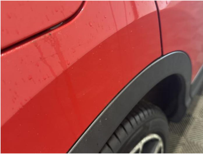
9: Qtr Panel osr Scratched UpTo 25mm Thru Paint