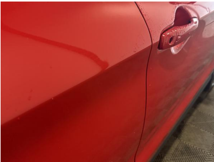
11: Door osr Dented Between 10mm + 30mm