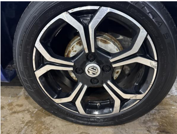
11: Wheel nsr Scratched Over 50mm