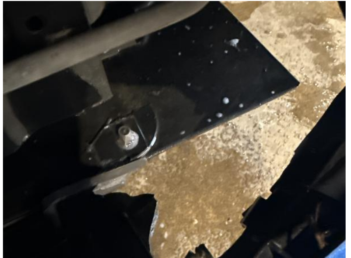
4: Bumper Front Moulding Broken Replace