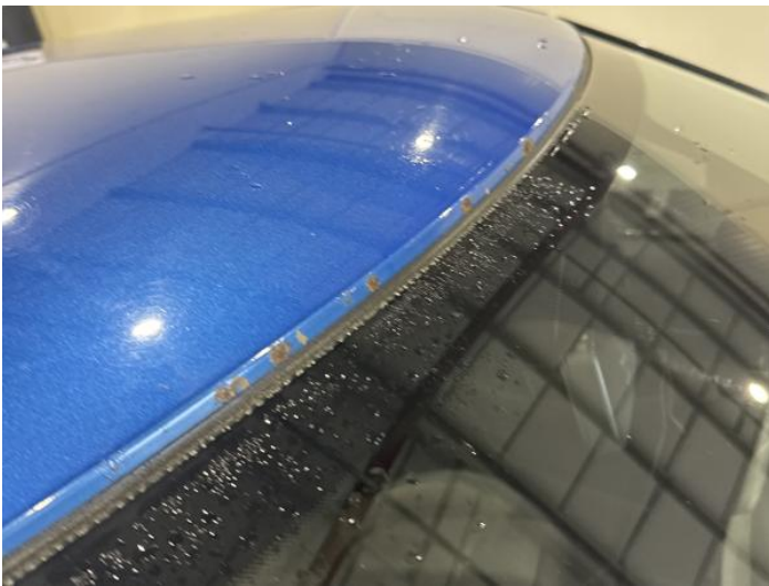
23: Roof Rusted Over 5mm