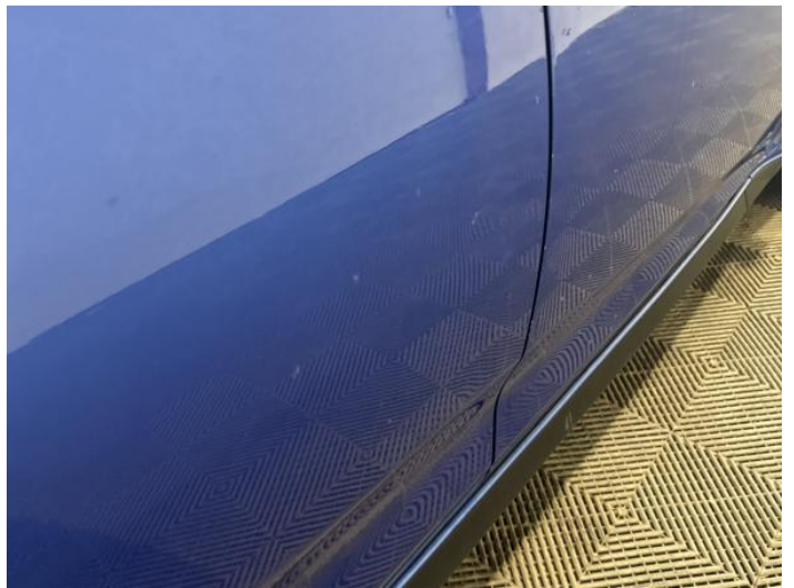
18: Door osr Dented With Paint Damage