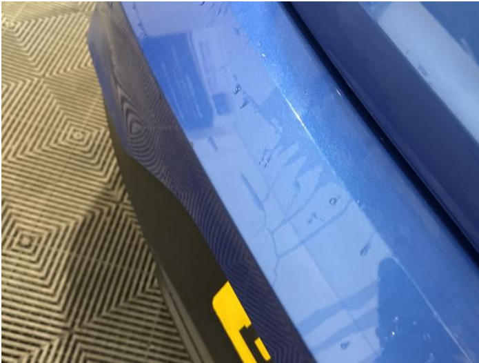
15: Bumper Rear Chipped 1 To 5