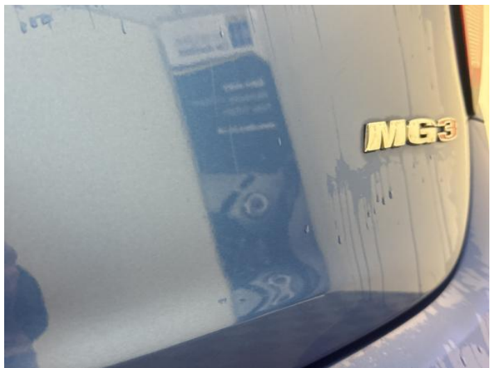
14: Tailgate Scratched Over 25mm Thru Paint