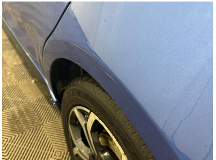
12: Qtr Panel nsr Scratched Over 25mm Thru Paint