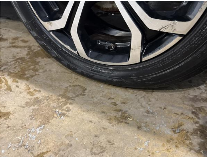
1: Tyre nsr Damaged Replace