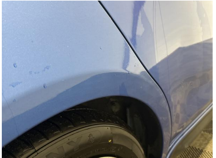
16: Qtr Panel osr Scratched Over 25mm Thru Paint