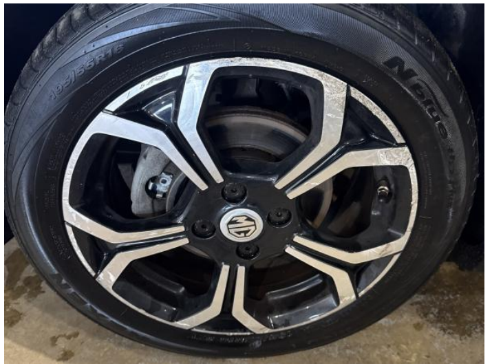
6: Wheel nsf Scratched Over 50mm