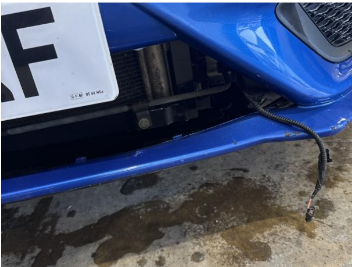
5: Bumper Front Grill Missing Replace