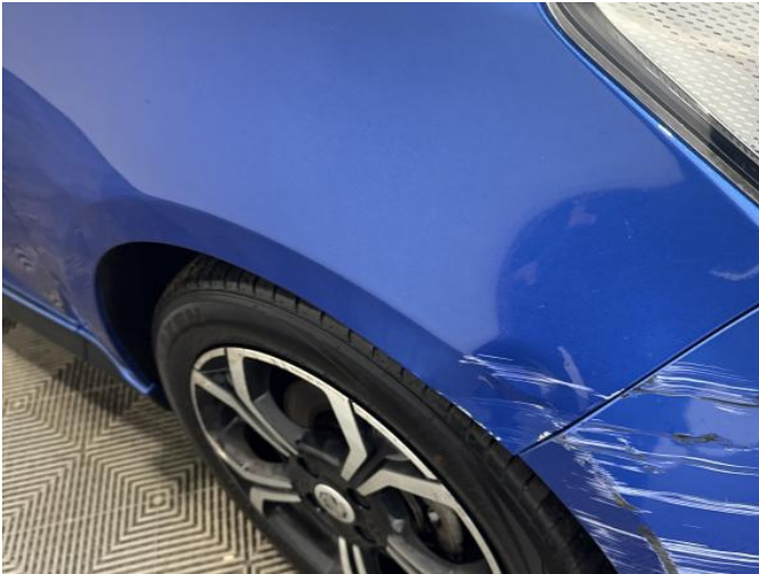
21: Wing of Dented With Paint Damage