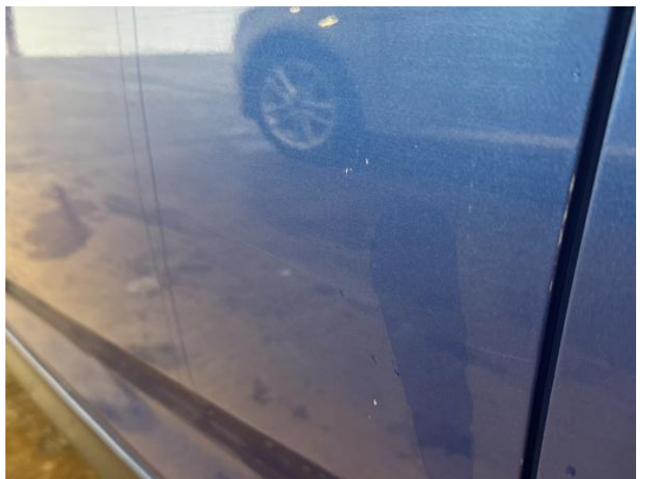
8: Door nsf Chipped 1 To 5