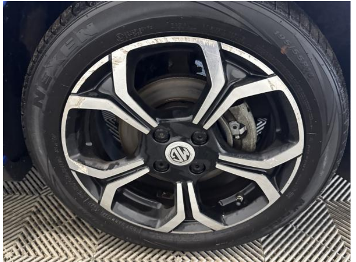
22: Wheel of Scratched Over 50mm