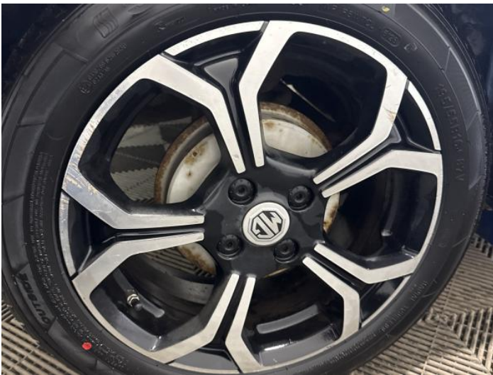
17: Wheel osr Scratched Over 50mm