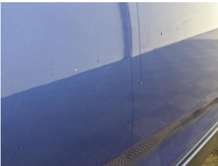
19: Door osf Chipped 1 To 5