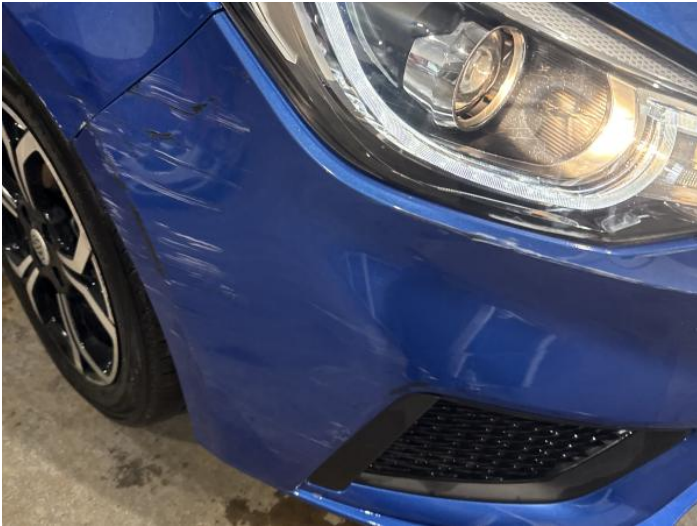
3: Bumper Front Scratched Over 100mm Thru Paint