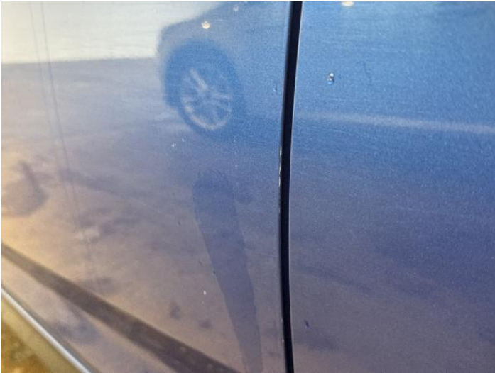
9: Door nsf Chipped Edge Chip