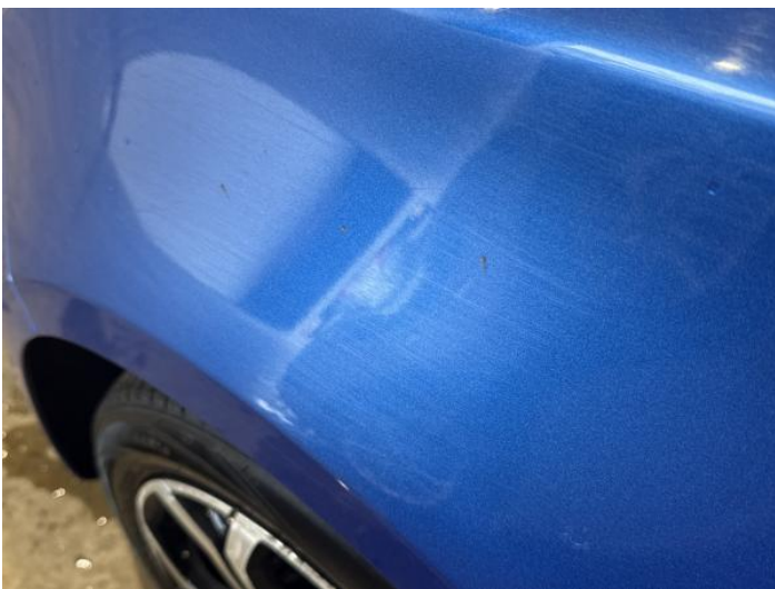
7: Wing nsf Chipped 1 To 5