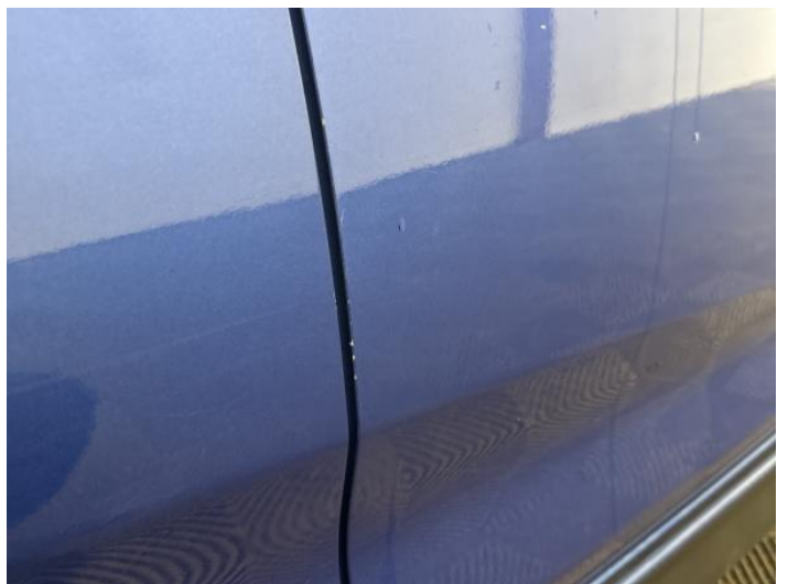
20: Door osf Chipped Edge Chip