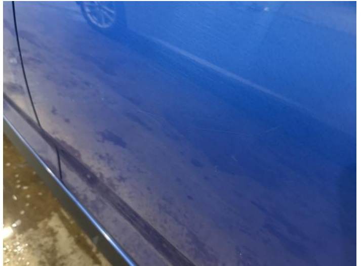
10: Door nsr Scratched Over 25mm Thru Paint