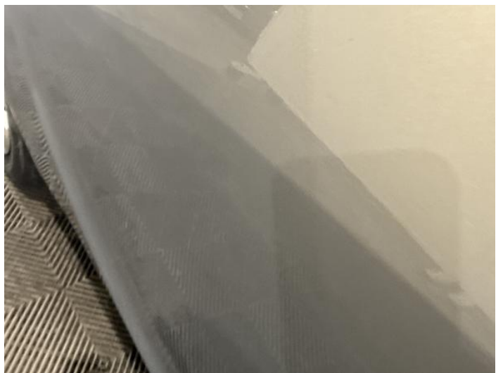
8: Door osf Chipped 1 To 5