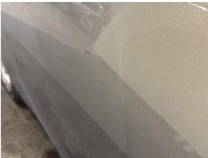
7: Door nsf Dented Between 10mm + 30mm