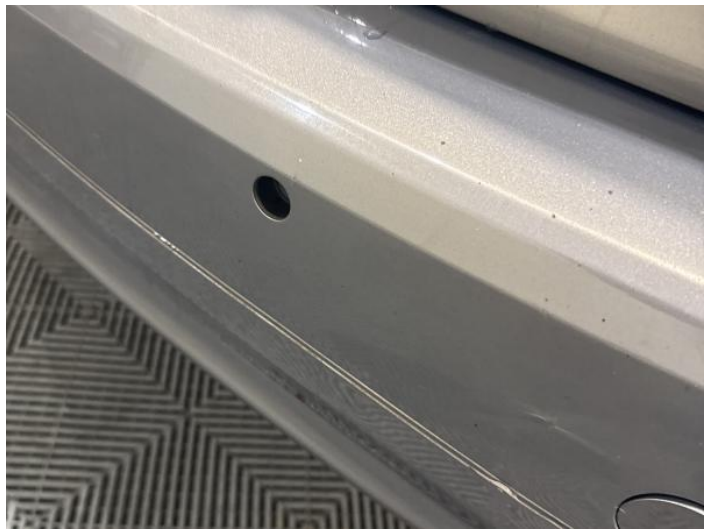
12: Parking Sensor Rear Missing Replace