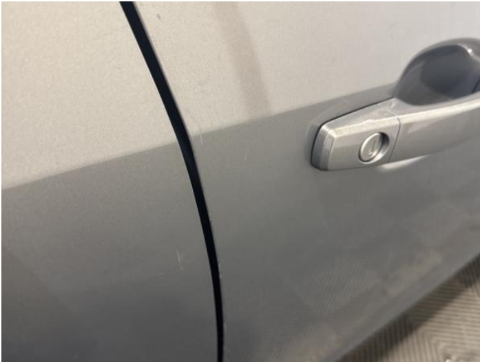
15: Door osf Scratched UpTo 25mm Thru Paint