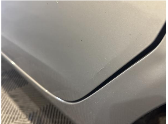
10: Door nsr Dented With Paint Damage