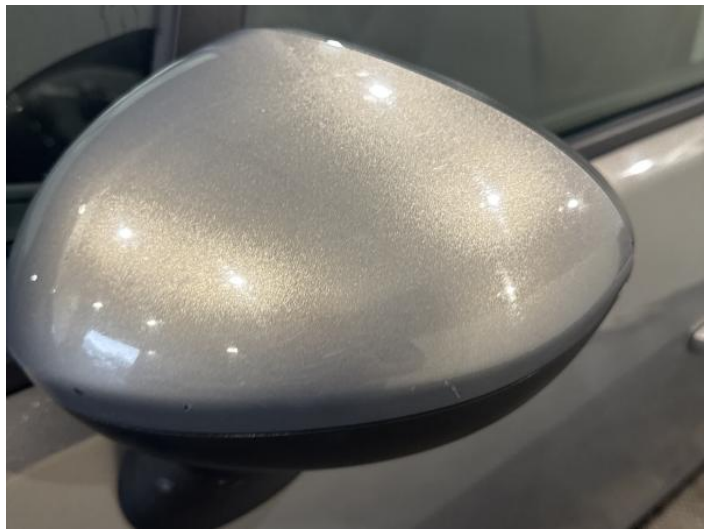
6: Door Mirror Assy nsf Scratched (Painted) UpTo 25mm Thru Paint