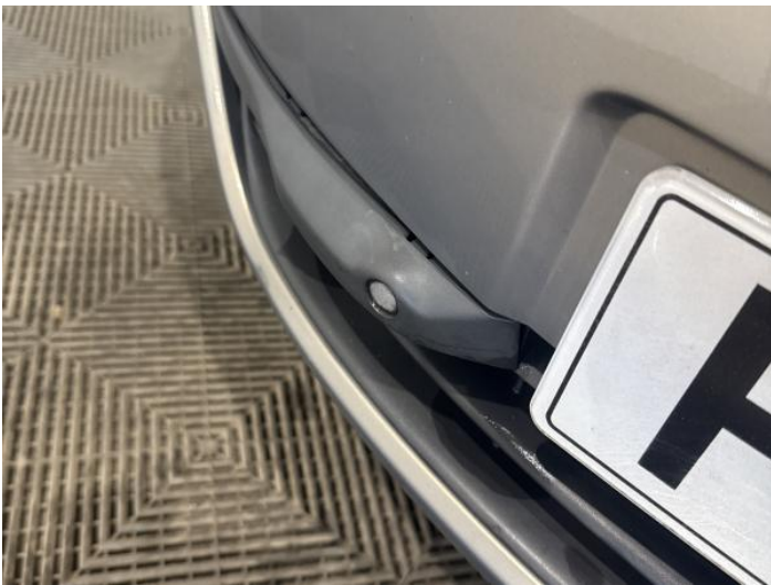
5: Bumper Front Moulding Scuffed (Unpainted) Over 100mm