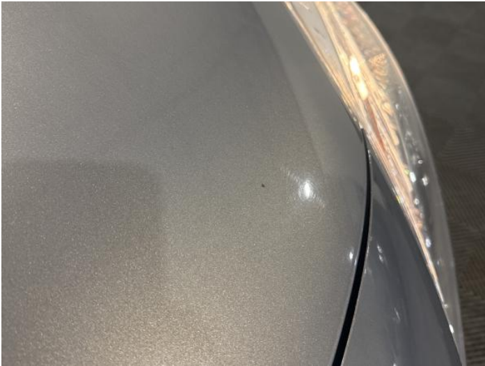
3: Bonnet Chipped 1 To 5