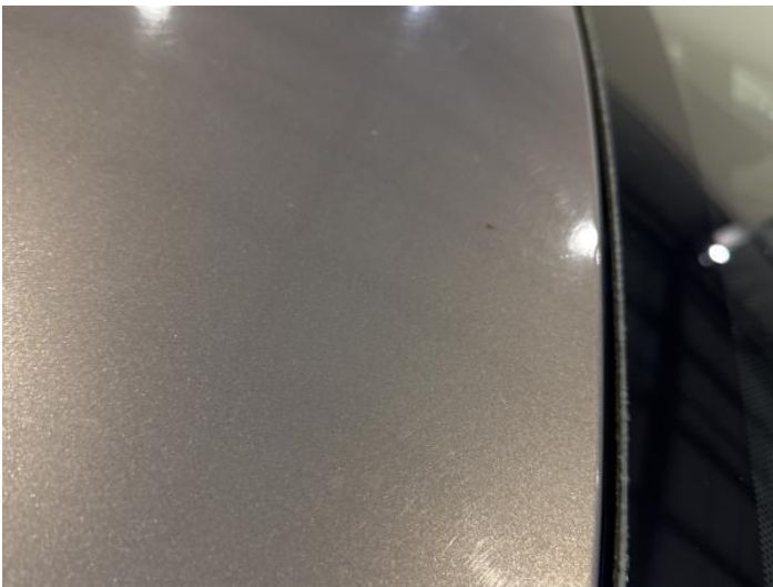
17: Roof Chipped 1 To 5