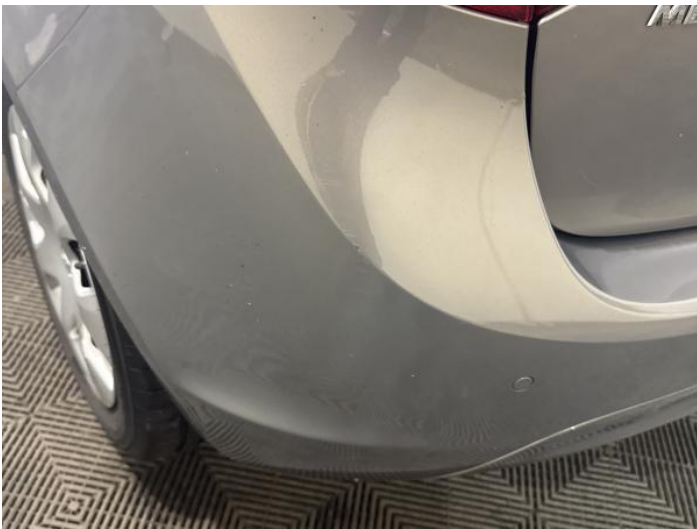
11: Bumper Rear Scratched 25 to 100mm Thru Paint