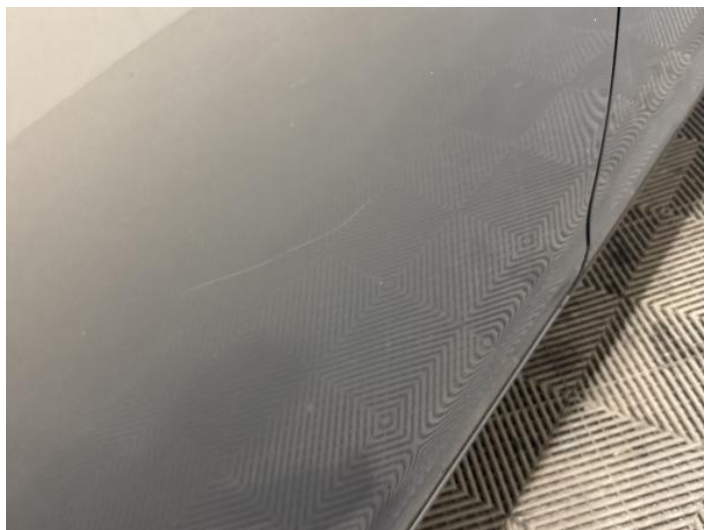
14: Door osr Scratched Over 25mm Thru Paint