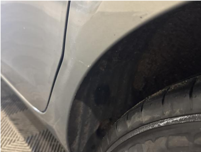
9: Qtr Panel nsr Dented Over 30mm