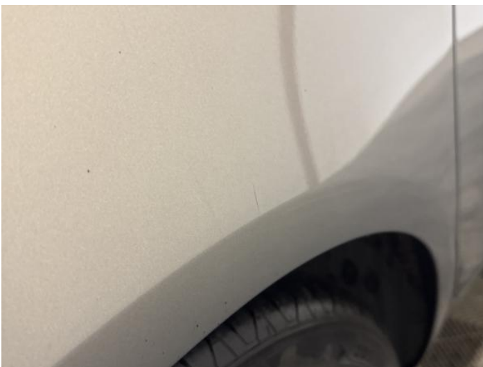
13: Qtr Panel osr Scratched UpTo 25mm Thru Paint