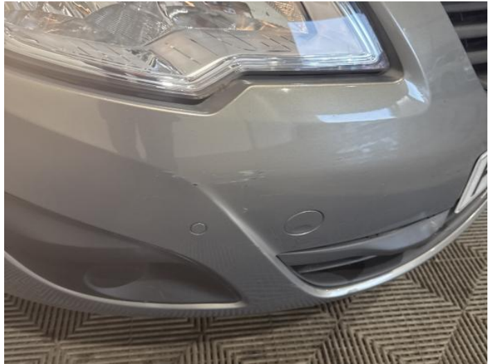
4: Bumper Front Scratched 25 to 100mm Thru Paint