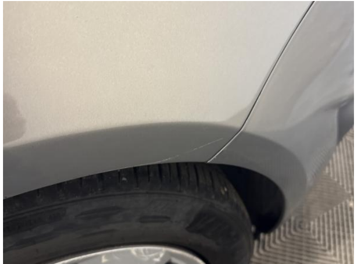
16: Wing nsf Scratched Over 25mm Thru Paint