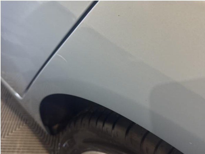
9: Qtr Panel nsr Scratched UpTo 25mm Thru Paint