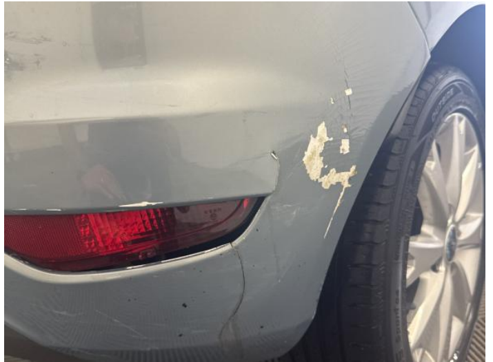
10: Bumper Rear Cracked Over 25mm