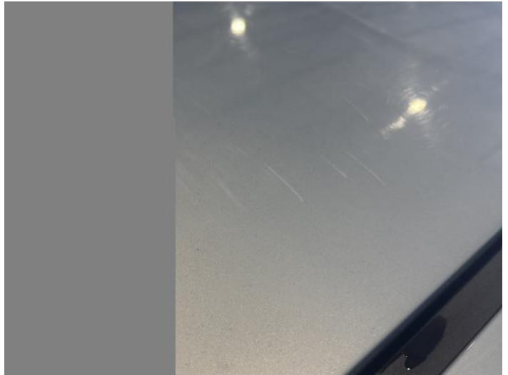
22: Roof Scratched Over 25mm Thru Paint