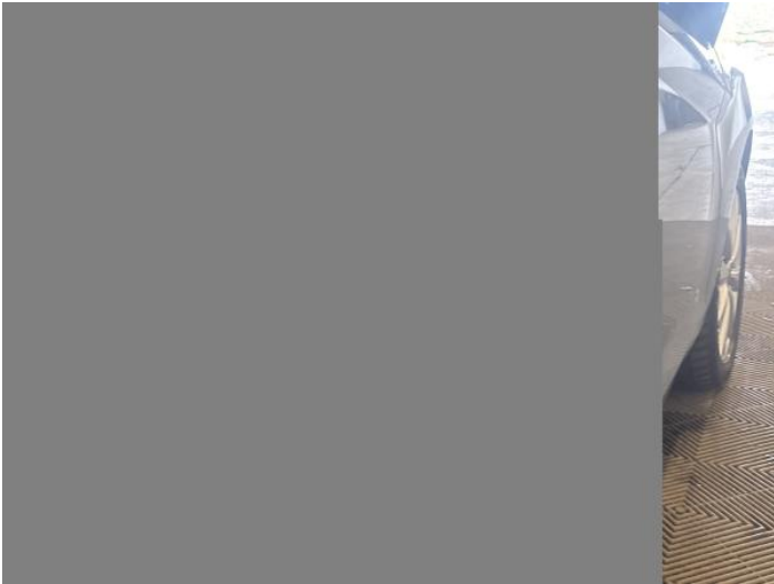
15: Door osr Dented Between 10mm + 30mm