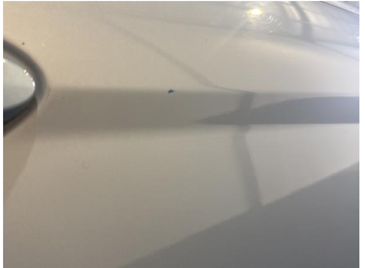
16: Door osr Chipped 1 To 5