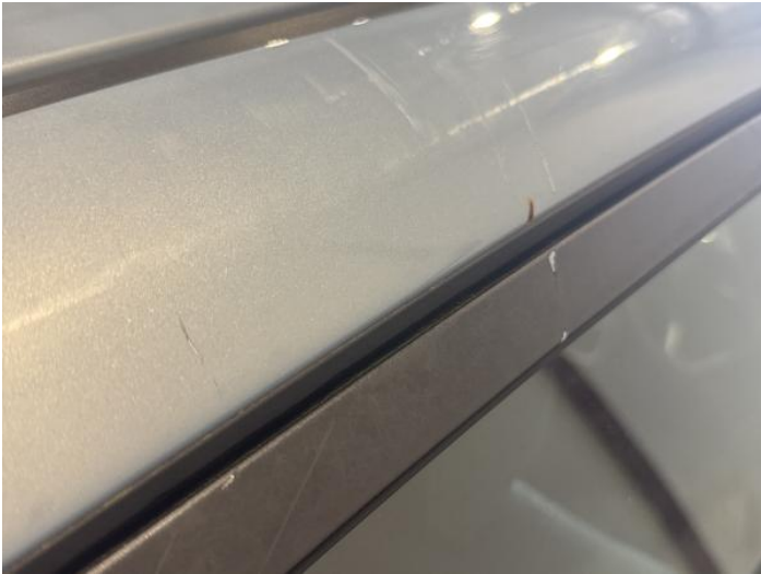
21: B Post os Scratched Rusted