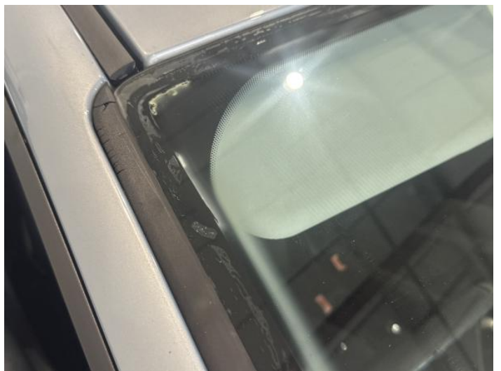
20: Other N/A N/A