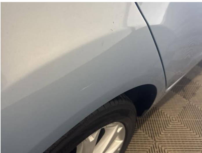
13: Qtr Panel osr Scratched UpTo 25mm Thru Paint