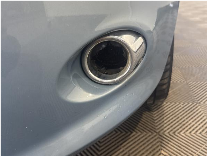
3: Fogdriving Lamp nsf Broken Replace