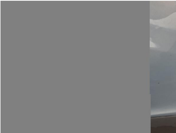
11: Reflector nsr Broken Replace