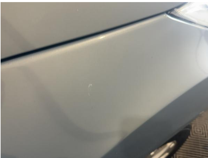
19: Wing osf Chipped 1 To 5