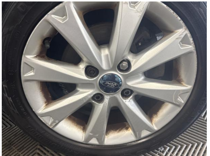
18: Wheel osf Scratched Over 50mm