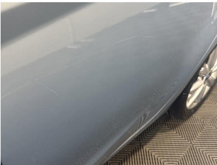
7: Door nsr Scratched Over 25mm Thru Paint