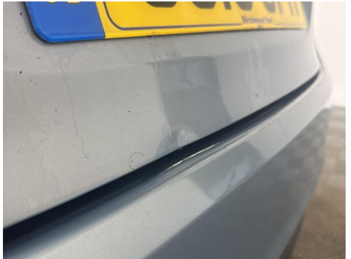
12: Tailgate Dented Over 30mm