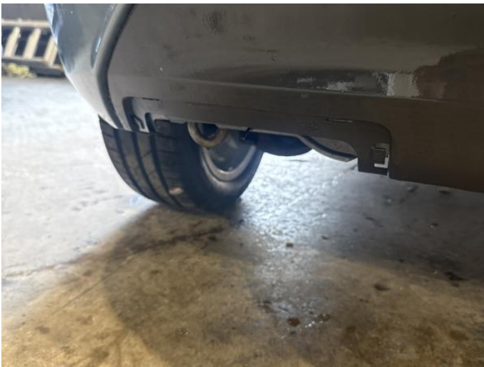
23: Rear TowEye Cvr Missing Replace