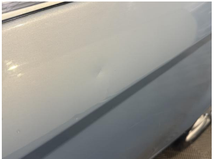
6: Door nsr Dented Between 10mm + 30mm