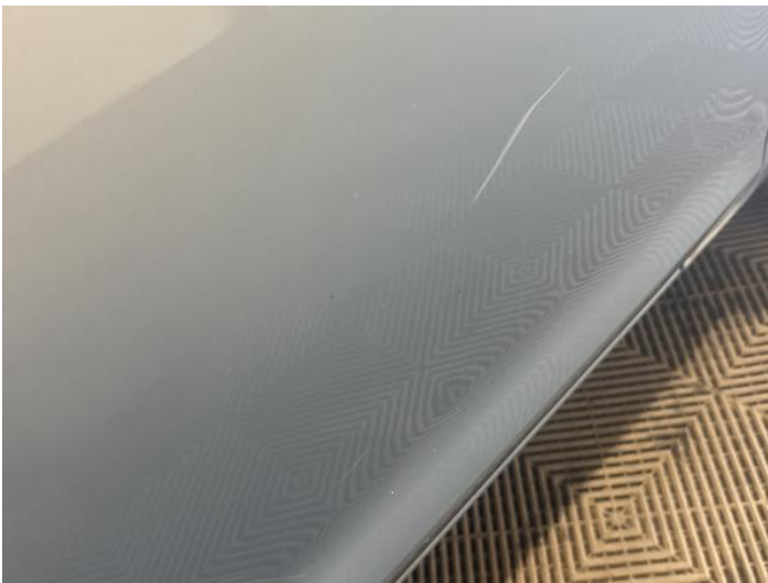
17: Door osf Scratched Over 25mm Thru Paint