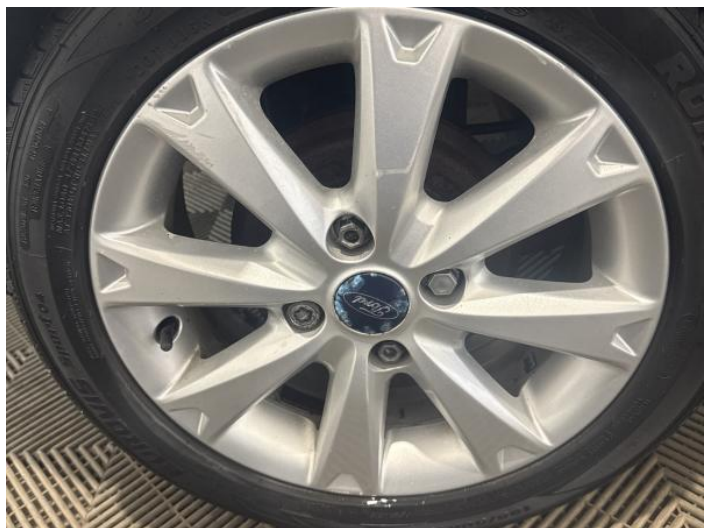
14: Wheel nsr Scratched Over 50mm