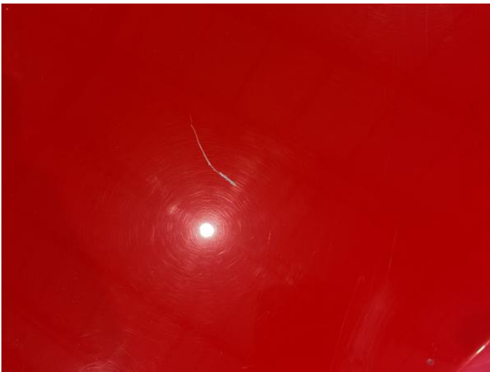
17: Bonnet Scratched Over 25mm Thru Paint