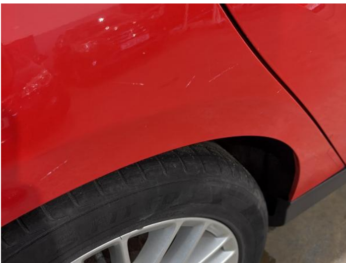
7: Qtr Panel osr Scratched Over 25mm Thru Paint