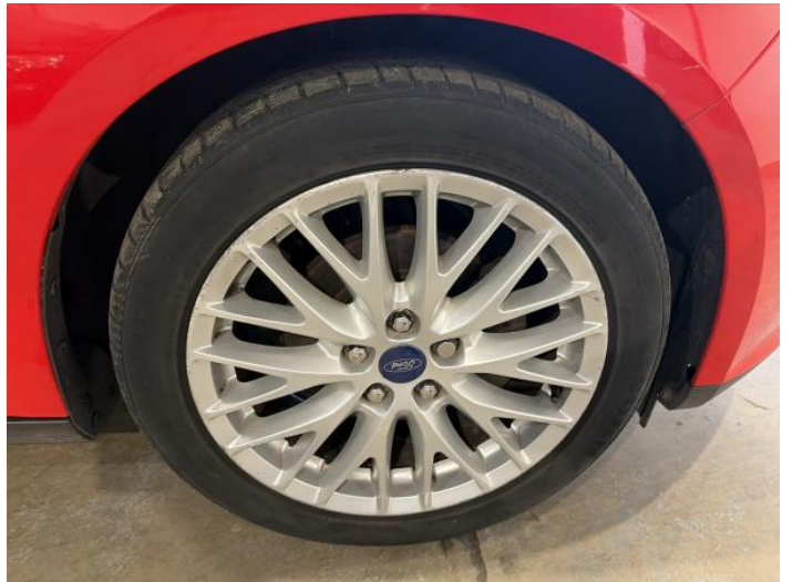
2: Wheel ofsf Scratched Over 50mm