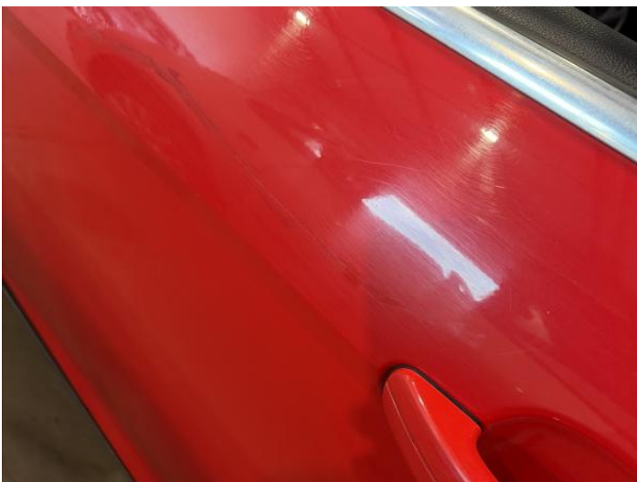
13: Door nsf Scratched Over 25mm Thru Paint