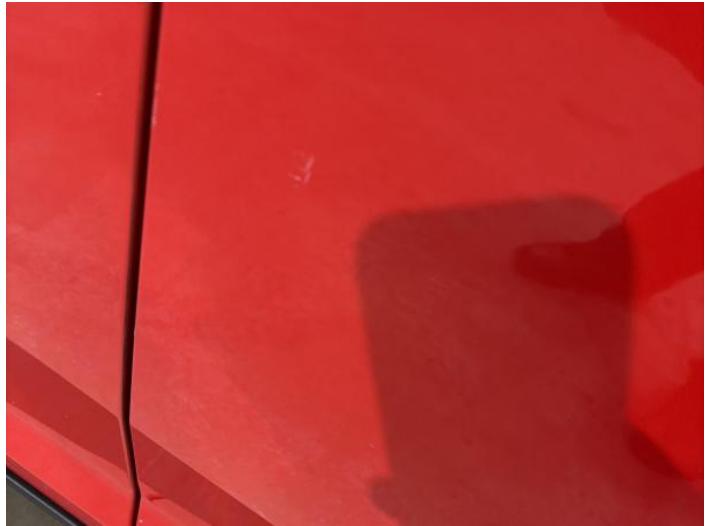
4: Door osf Chipped 1 To 5