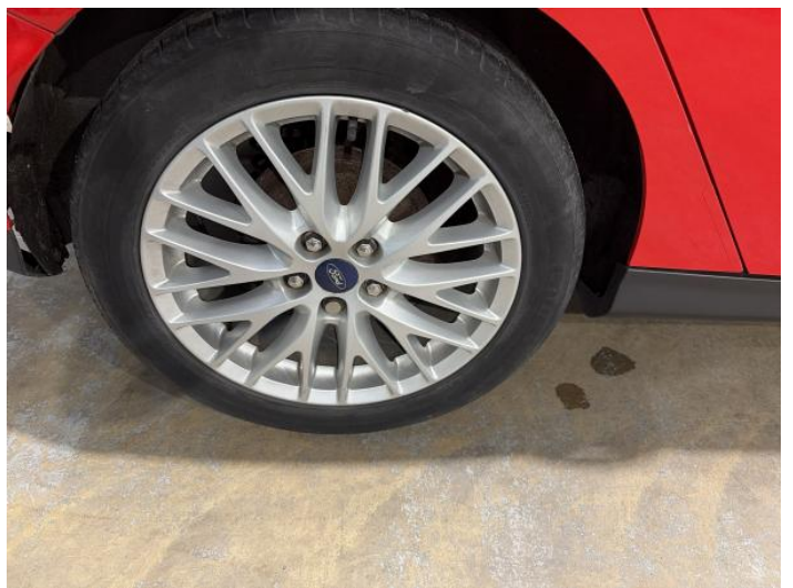
8: Wheel osr Scratched Up To 50mm