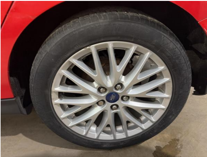
11: Wheel nsr Scratched Over 50mm