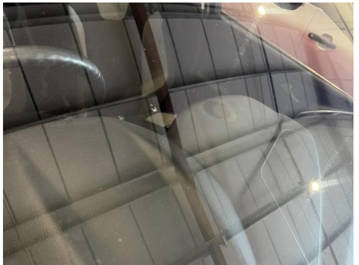
18: Screen Front Chipped UpTo 10mm