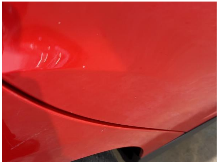
6: Door osr Chipped 1 To 5