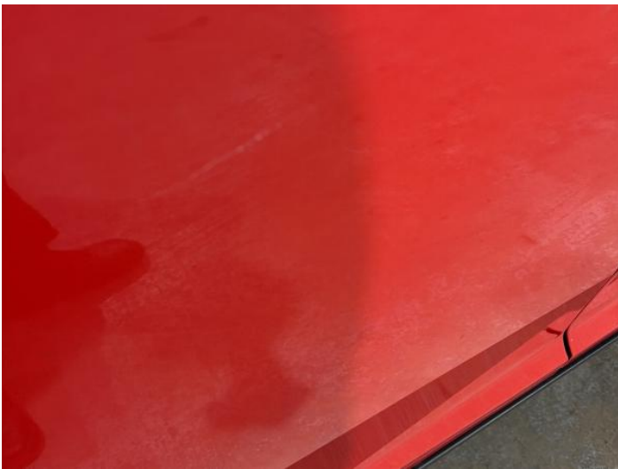
5: Door osr Scratched UpTo 25mm Thru Paint