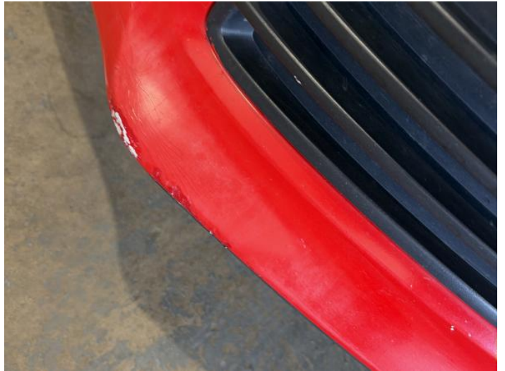
16: Bumper Front Poor Previous Repair Poor Paint