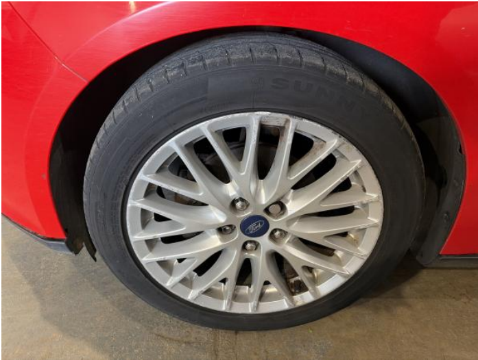
15: Wheel nsf Scratched Over 50mm