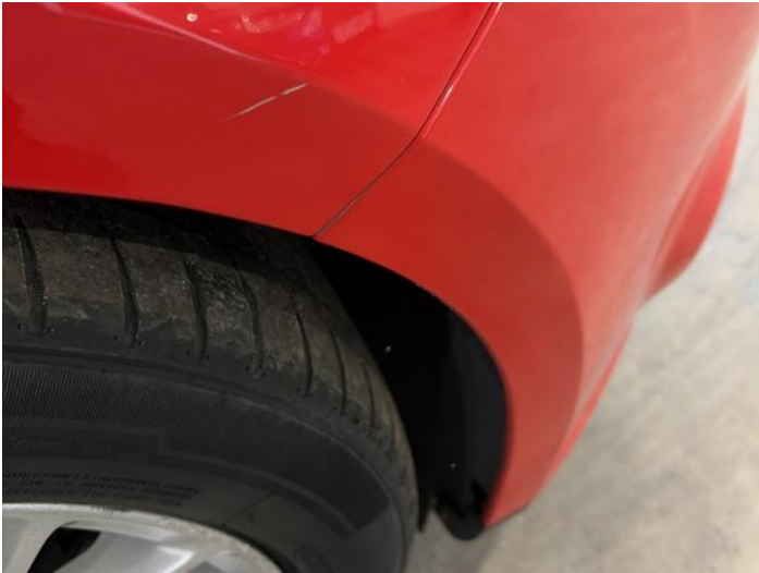
3: Wing osf Scratched UpTo 25mm Thru Paint