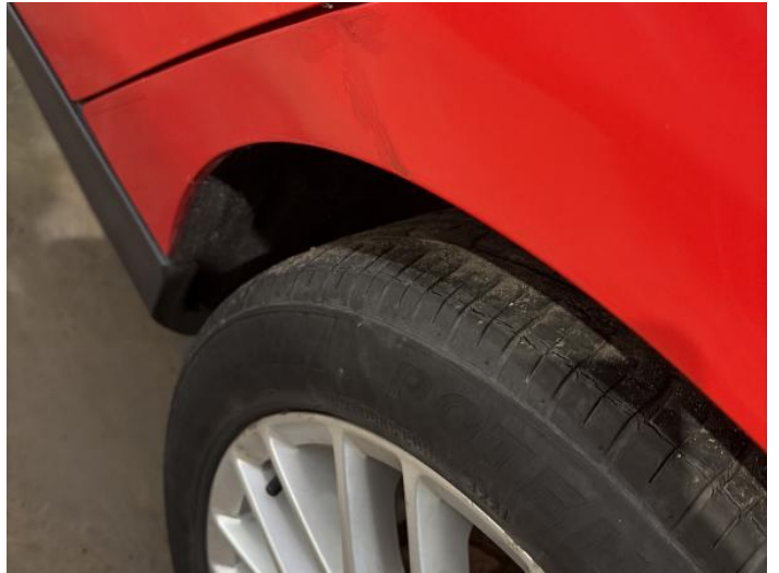
10: Qtr Panel nsr Dented With Paint Damage