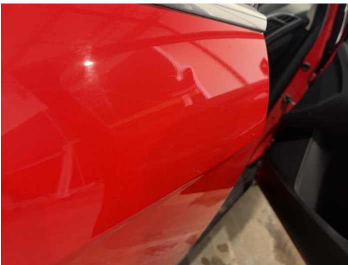
19: Door osr Dented Between 10mm + 30mm