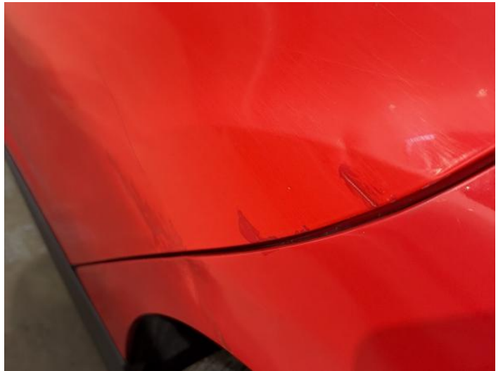
12: Door nsr Dented With Paint Damage