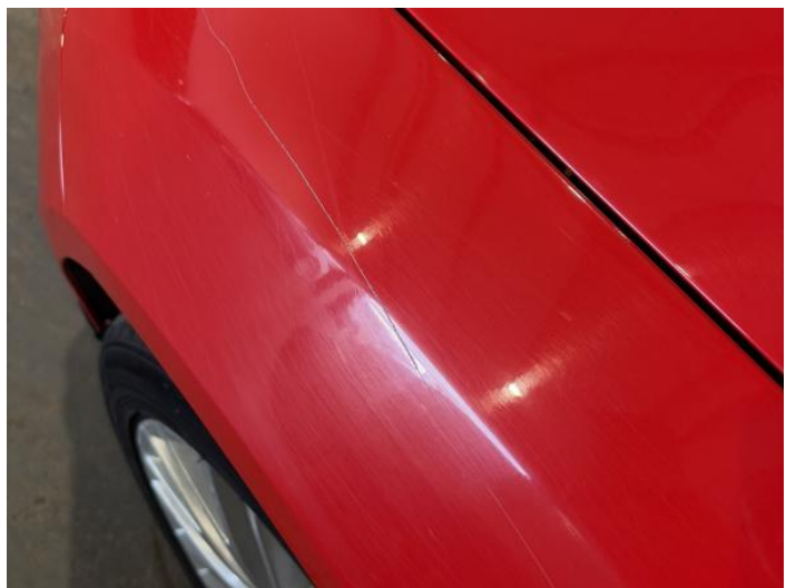
14: Wing nsf Dented With Paint Damage