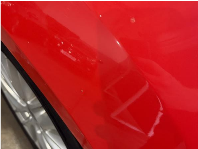
1: Wing ofsf Chipped 1 To 5