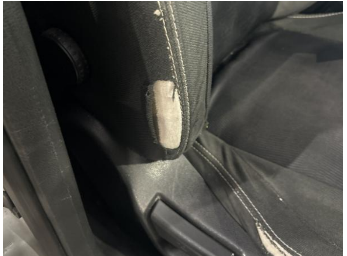
16: Seat Back Cover osf Torn Over 3mm