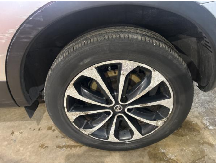
9: Wheel nsr Corroded Light