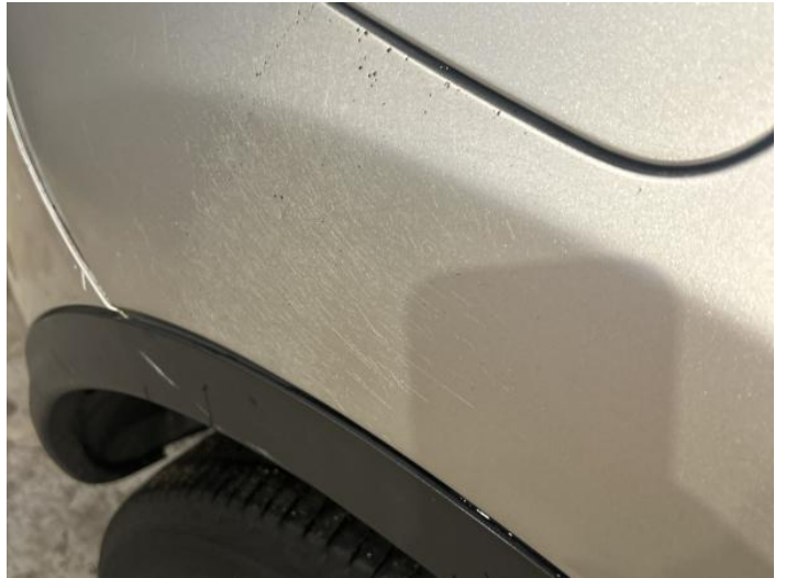
4: Qtr Panel osr Poor Previous Repair Paint Flake