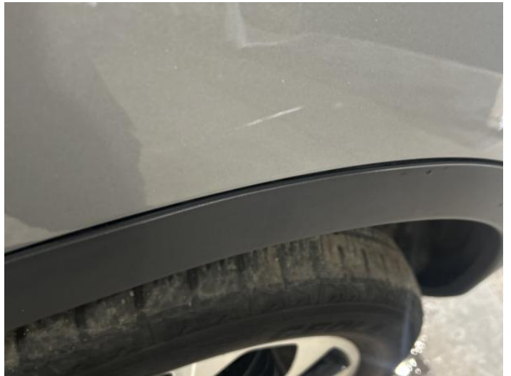
2: Wing of Scratched Up To 25mm Thru Paint