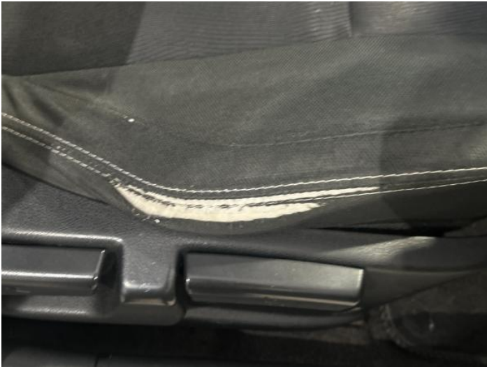
15: Seat Base Cover osf Torn Over 3mm