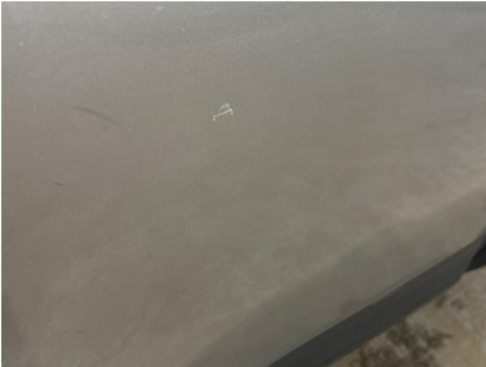
3: Door osr Scratched UpTo 25mm Thru Paint