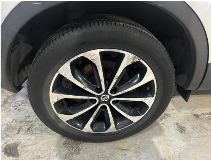
5: Wheel osr Corroded Light