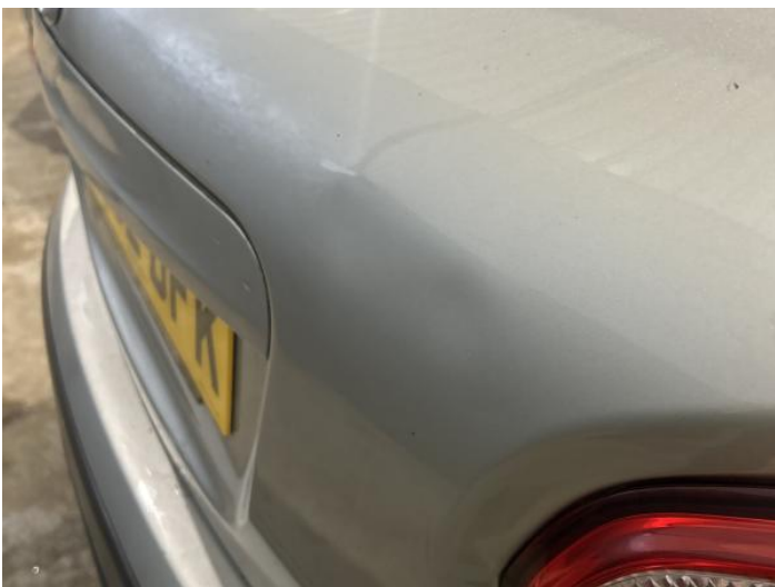
7: Tailgate Dented Over 30mm