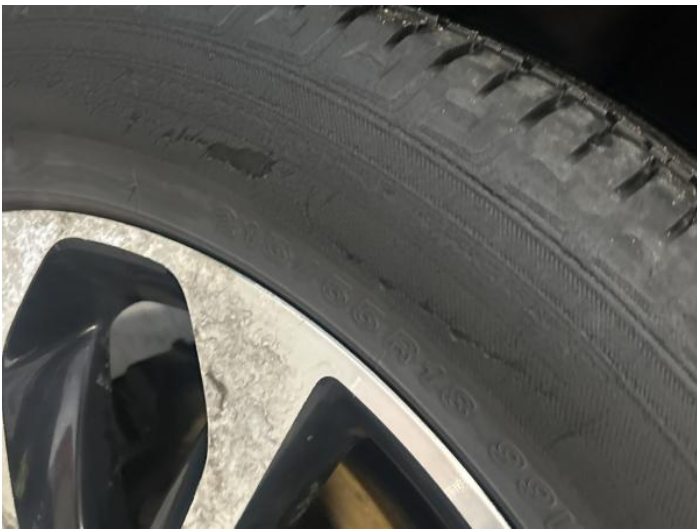
17: Tyre osr Damaged Replace