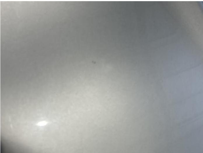
13: Bonnet Chipped 1 To 5