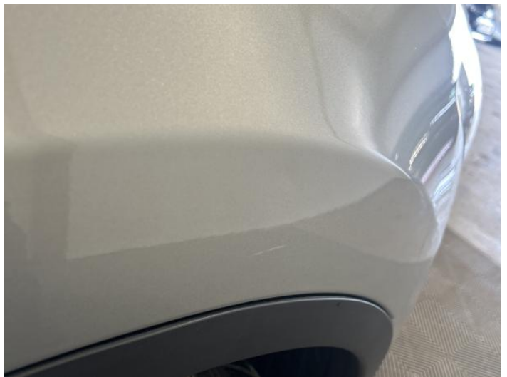
18: Wing osf Dented 2 Or Less UpTo 10mm