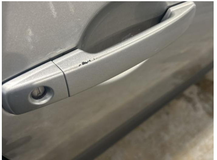
14: Other N/A N/A