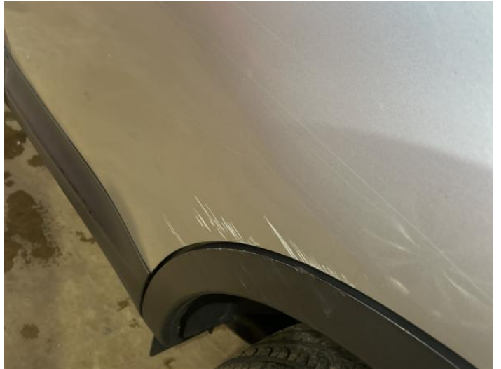
10: Door nsr Dented With Paint Damage