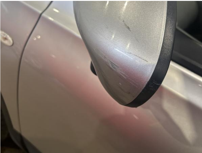
11: Door Mirror Assy nsf Scratched (Painted) Over 25mm Thru Paint