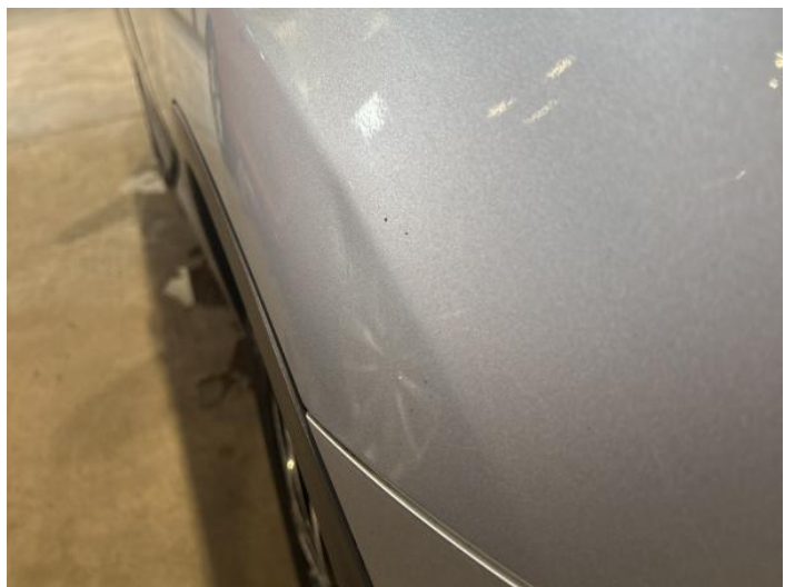
8: Qtr Panel nsr Dented Between 10mm + 30mm