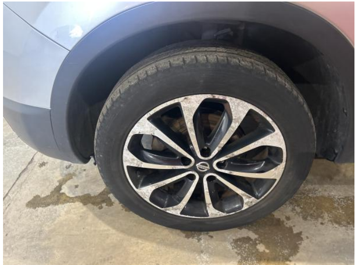
12: Wheel nsf Corroded Light