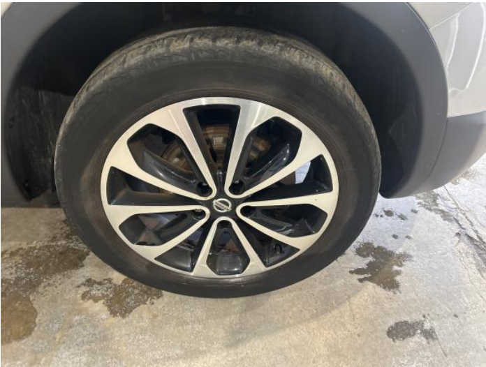
1: Wheel of Corroded Light