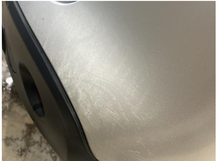
6: Bumper Rear Poor Previous Repair Poor Paint