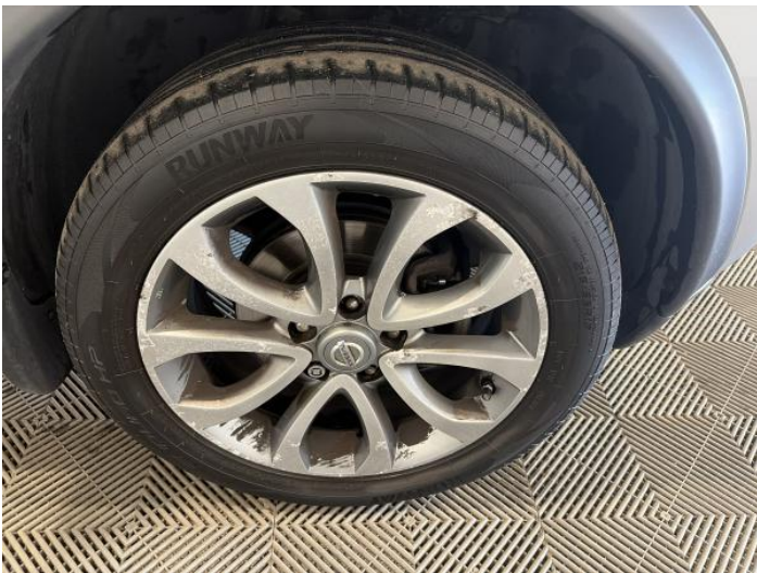
1: Wheel of Corroded Light