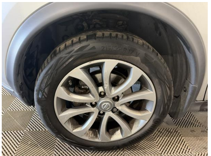
8: Wheel nsf Corroded Light