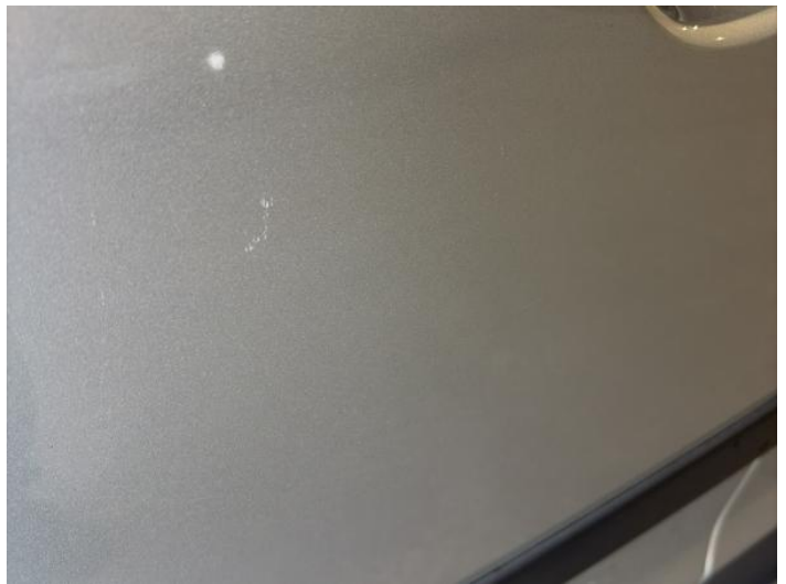
12: Door nsf Chipped 1 To 5