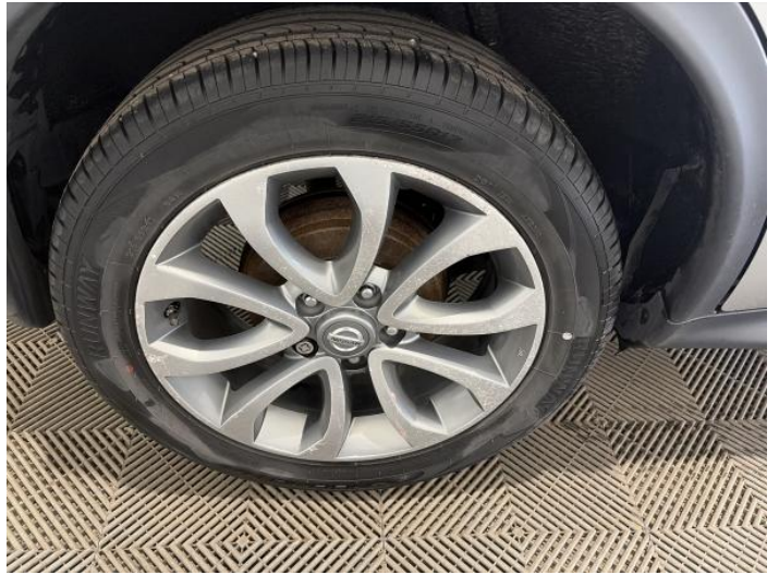
4: Wheel osr Corroded Light