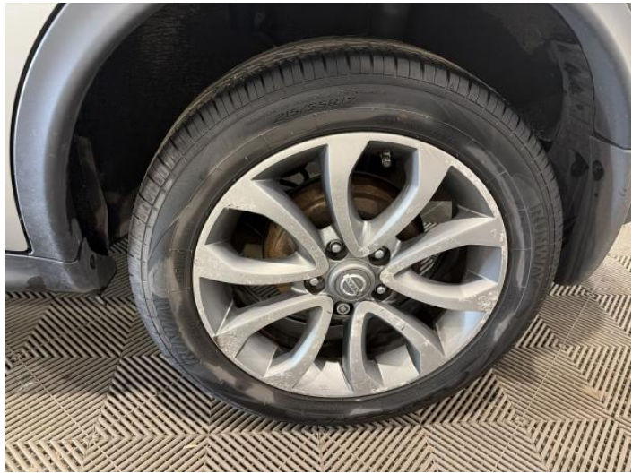
6: Wheel nsr Corroded Light