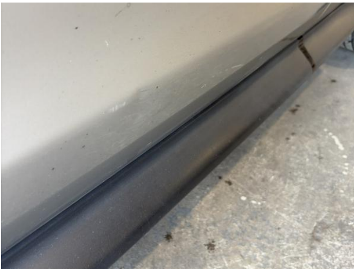
11: Door nsf Dented Between 10mm + 30mm