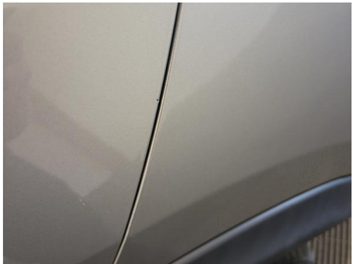
2: Wing of Chipped 1 To 5