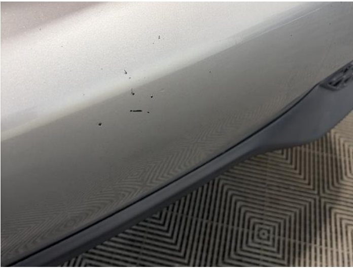
5: Bumper Rear Chipped Multiple Chips