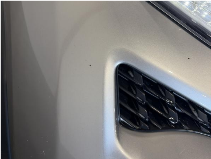
9: Bumper Front Chipped Multiple Chips