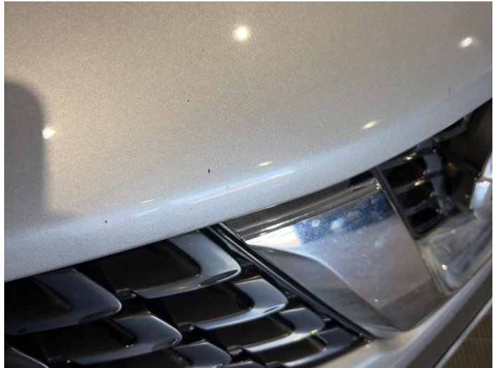
10: Bonnet Chipped 1 To 5