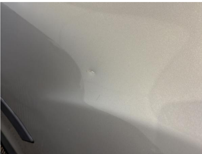
7: Door nsr Dented With Paint Damage