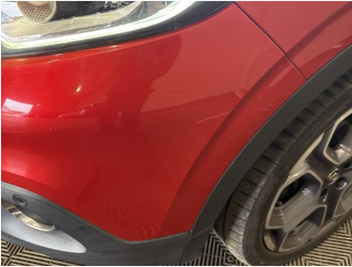
3: Bumper Front Scratched 25 to 100mm Thru Paint