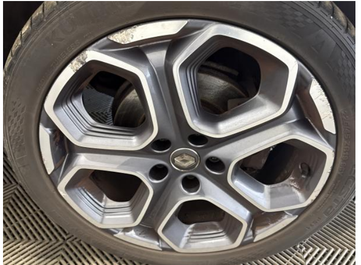
16: Wheel of Scratched Over 50mm