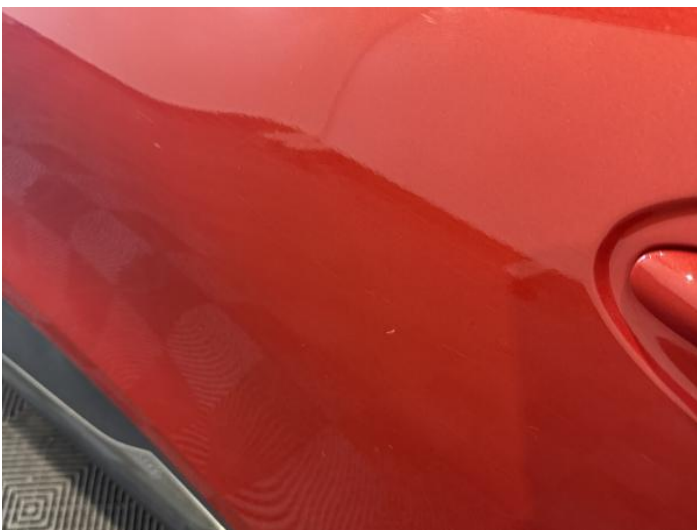
7: Door nsr Chipped 1 To 5