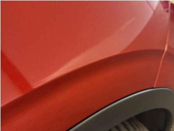
15: Wing of Scratched Up To 25mm Thru Paint