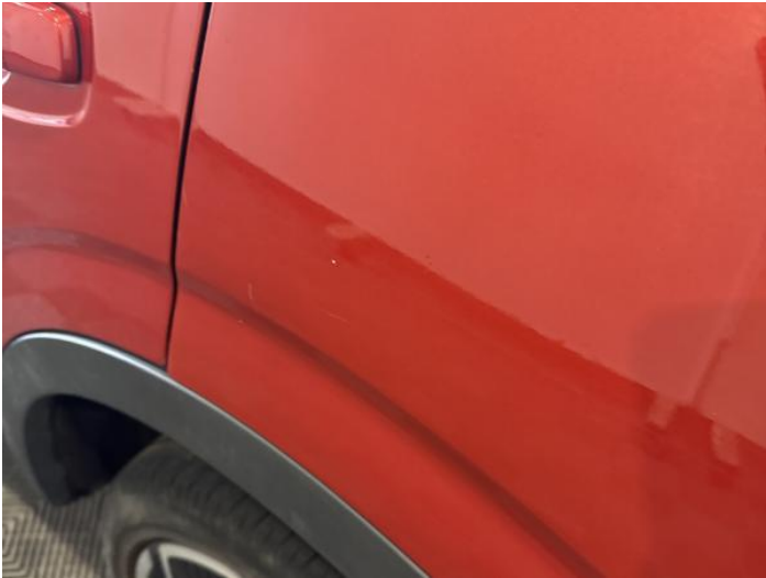
9: Qtr Panel nsr Chipped 1 To 5