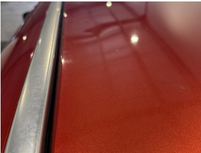
17: Roof Dented Over 30mm