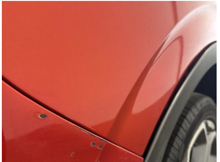
12: Qtr Panel osr Scratched Up To 25mm Thru Paint