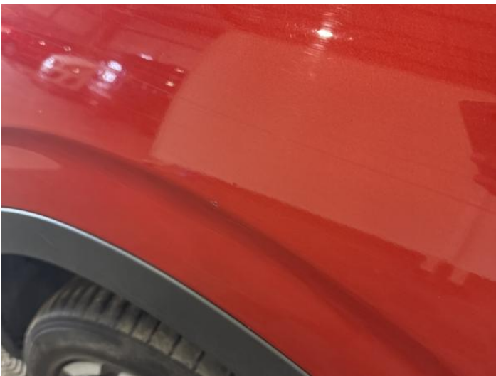
5: Wing nsf Chipped 1 To 5