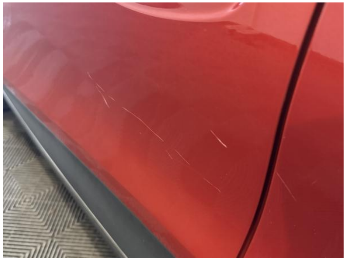
6: Door nsf Dented With Paint Damage