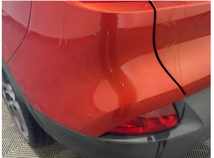
10: Bumper Rear Scratched Over 100mm Thru Paint