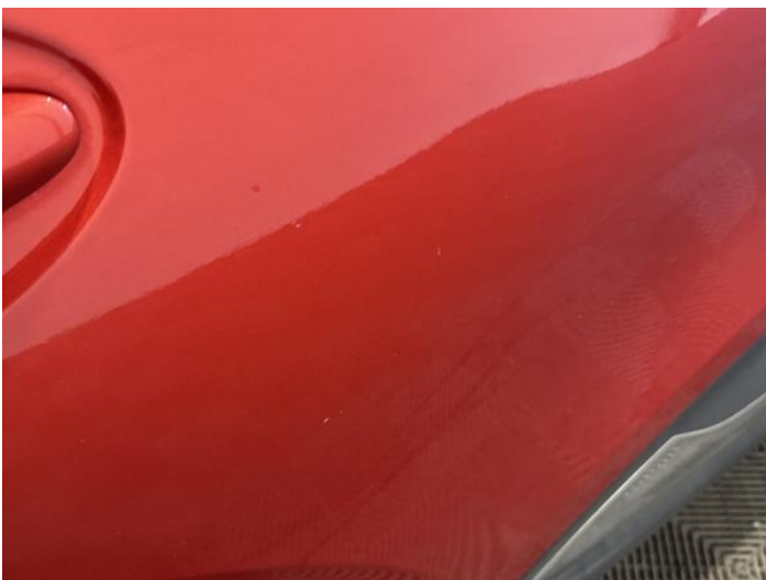
13: Door osr Chipped 1 To 5