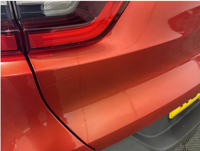
11: Tailgate Dented With Paint Damage