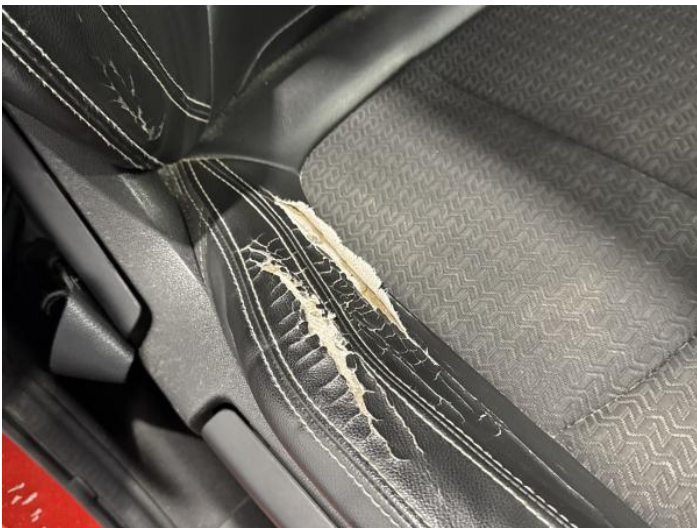
1: Seat Base Cover of Torn Over 3mm