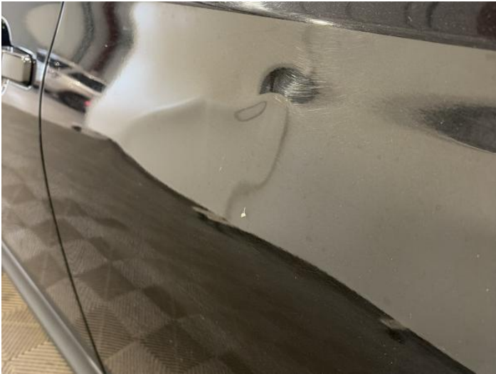
9: Door nsr Dented With Paint Damage