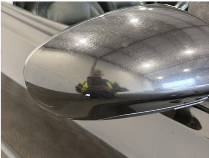
23: Door Mirror Assy osf Scratched (Painted) UpTo 25mm Thru Paint