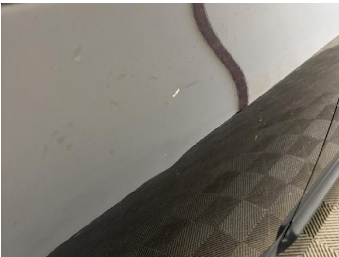
19: Door osr Dented Between 10mm + 30mm