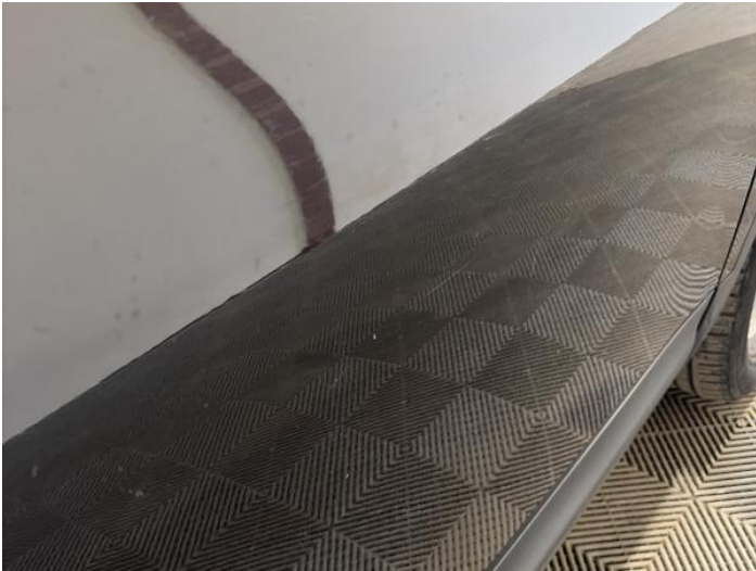
21: Door osf Scratched Over 25mm Thru Paint