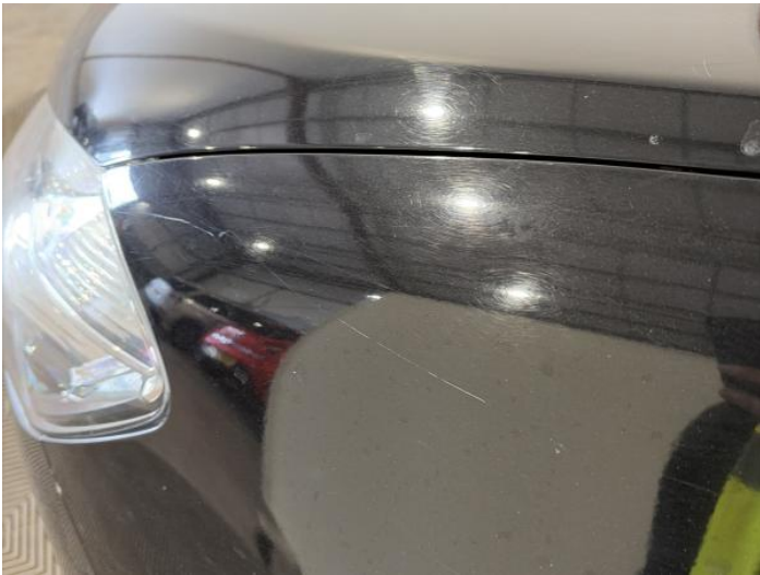
5: Wing nsf Scratched Over 25mm Thru Paint