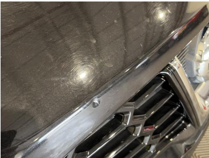
1: Bonnet Dented Between 10mm + 30mm