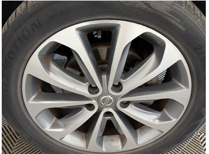
22: Wheel osf Scratched Up To 50mm