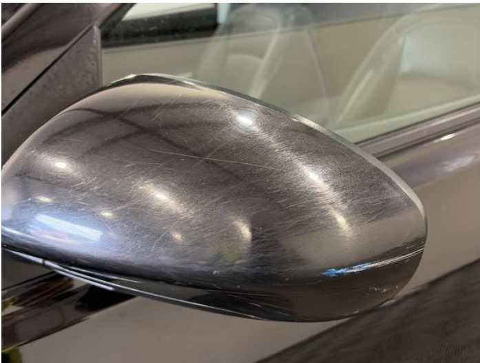
7: Door Mirror Assy nsf Scratched (Painted) Over 25mm Thru Paint