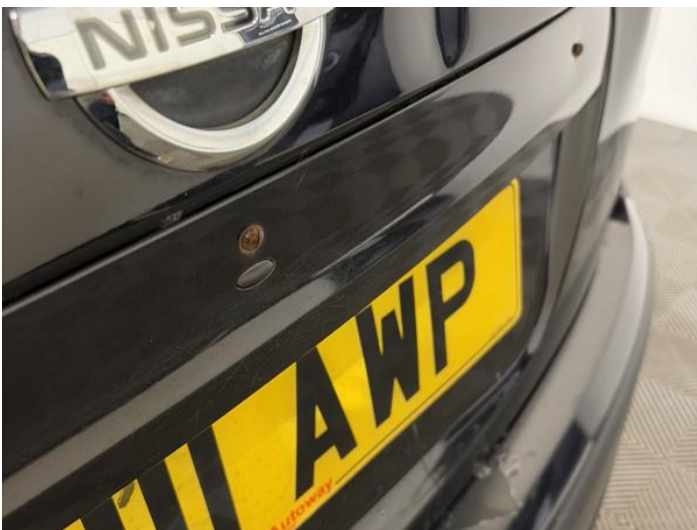
13: Tailgate Trim Panel Broken Replace