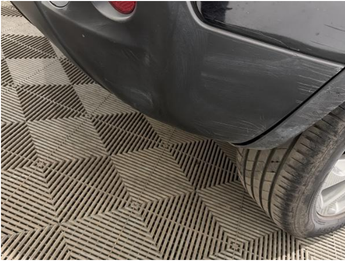
15: Bumper Rear Moulding Scuffed (Unpainted) Over 100mm