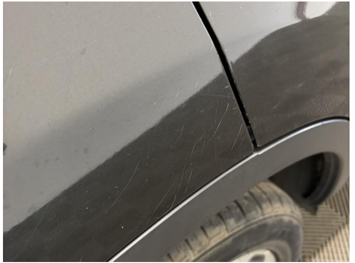
18: Qtr Panel osr Scratched Over 25mm Thru Paint