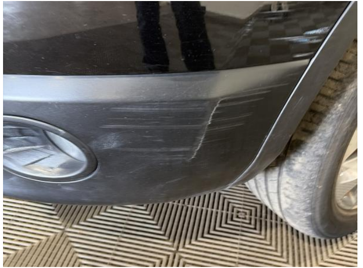
4: Bumper Front Moulding Scuffed (Unpainted) Over 100mm