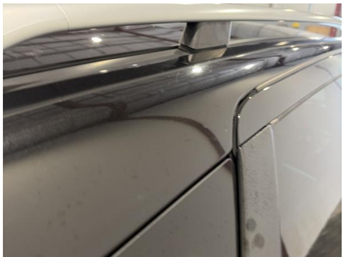
14: C Post os Dented Between 10mm + 30mm