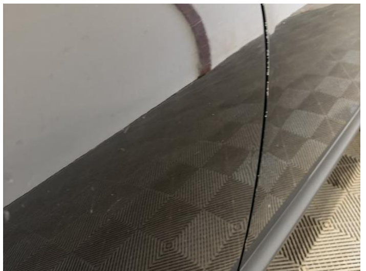
20: Door osr Scratched Over 25mm Thru Paint