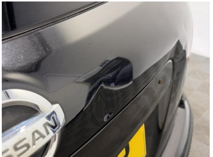
12: Tailgate Dented Over 30mm