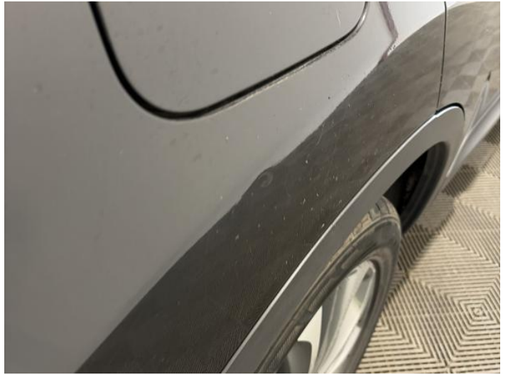
16: Qtr Panel osr Dented Between 10mm + 30mm