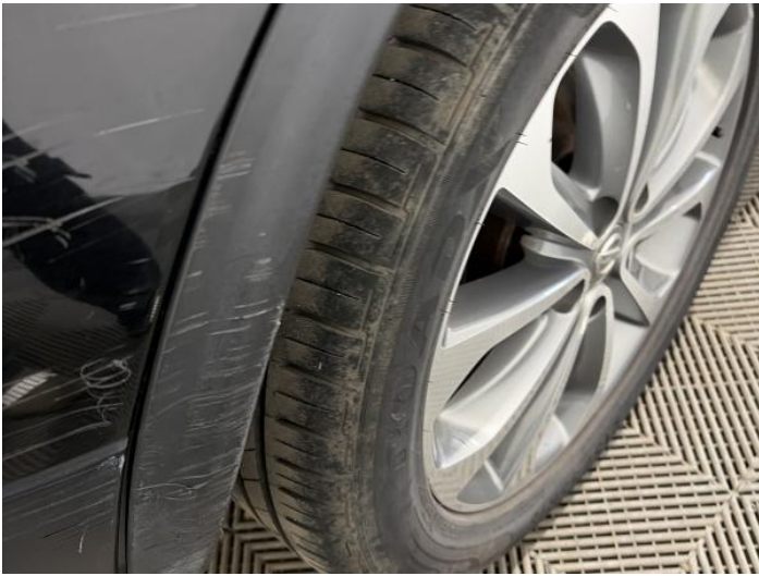
17: Qtr Panel Arch Extension os Scuffed (Unpainted) Over 100mm