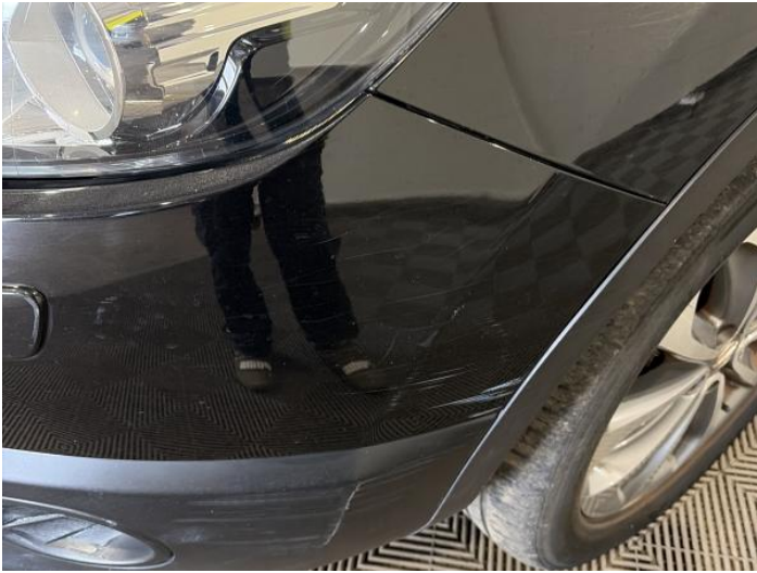
3: Bumper Front Scratched 25 to 100mm Thru Paint