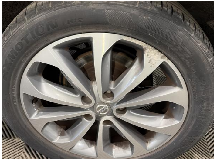
10: Wheel nsr Corroded Light