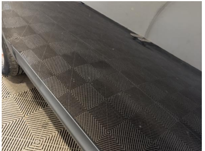
8: Door nsf Scratched Over 25mm Thru Paint