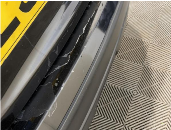
11: Bumper Rear Poor Previous Repair Paint Flake