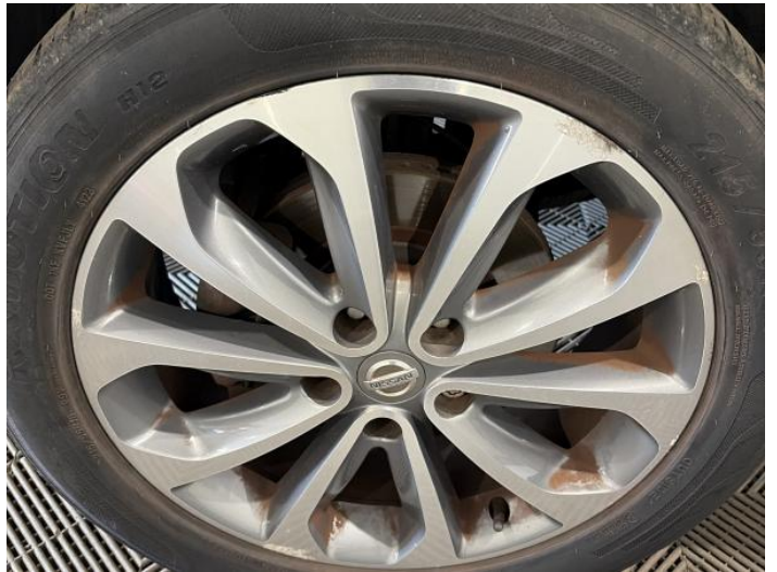
6: Wheel nsf Scratched Over 50mm