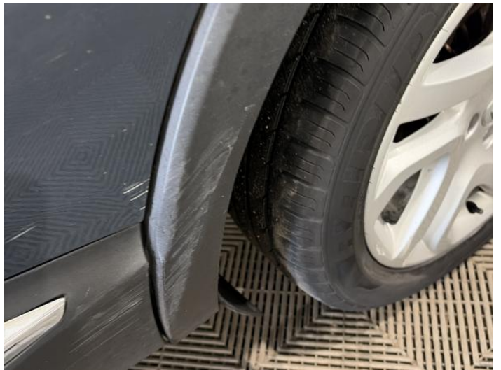
12: Qtr Panel Arch Extension ns Scuffed (Unpainted) Over 100mm