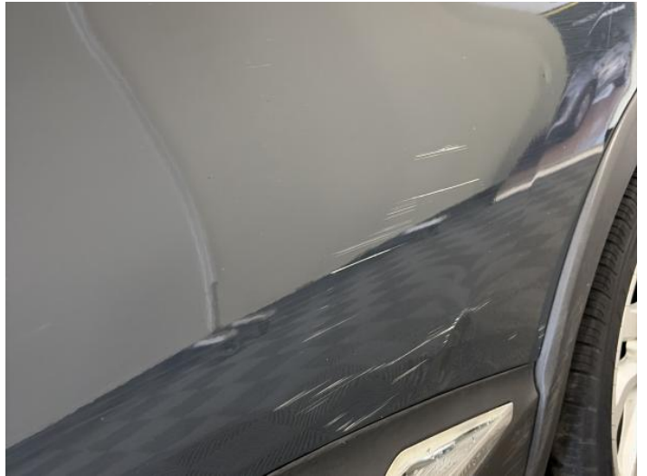
10: Door nsr Dented With Paint Damage