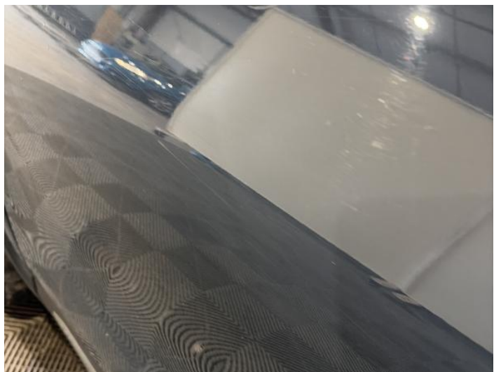
8: Door nsf Dented Between 10mm + 30mm