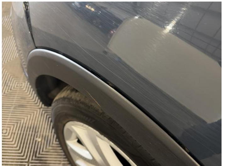
6: Wing Front Arch Extension ns Scuffed (Unpainted) Over 100mm