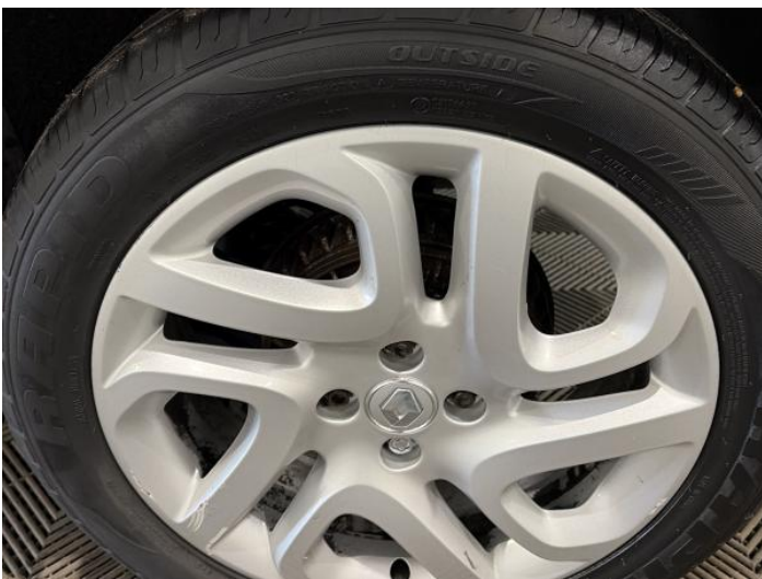
13: Wheel nsr Scratched Over 50mm