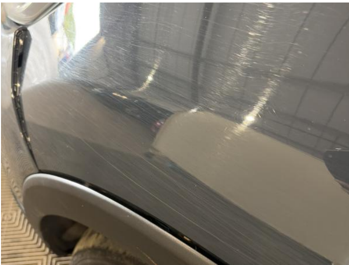
5: Wing nsf Scratched Over 25mm Thru Paint