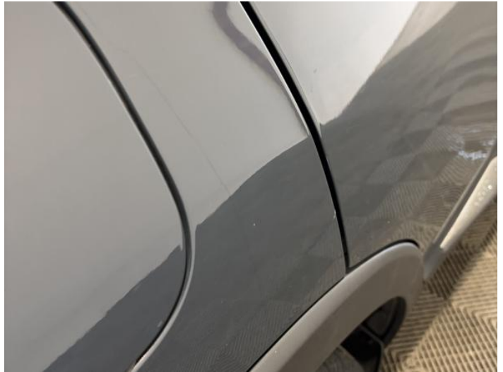
16: Qtr Panel osr Dented Between 10mm + 30mm