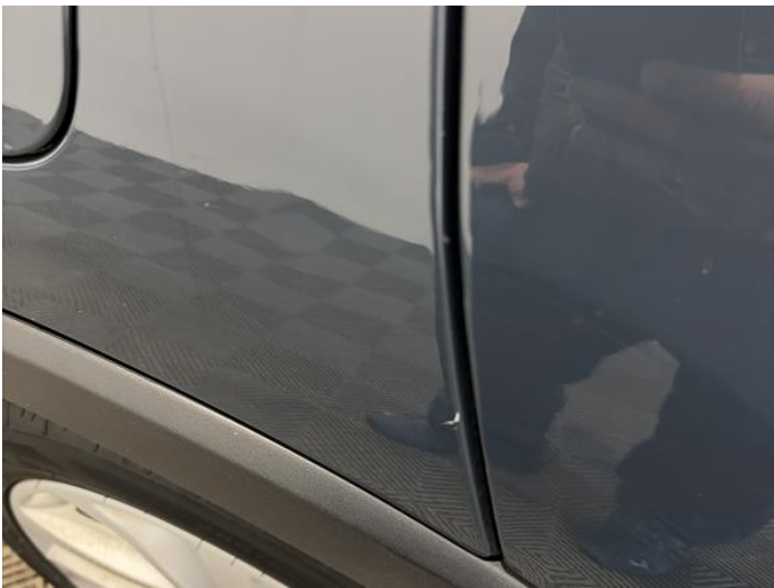
17: Qtr Panel osr Scratched UpTo 25mm Thru Paint