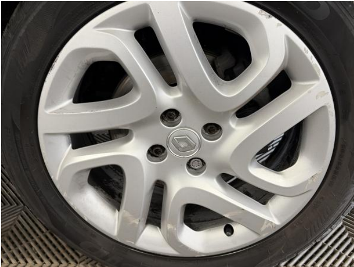
21: Wheel osf Scratched Over 50mm