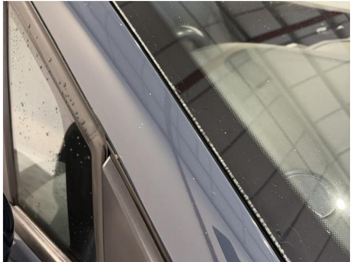
22: A Post os Chipped 1 To 5