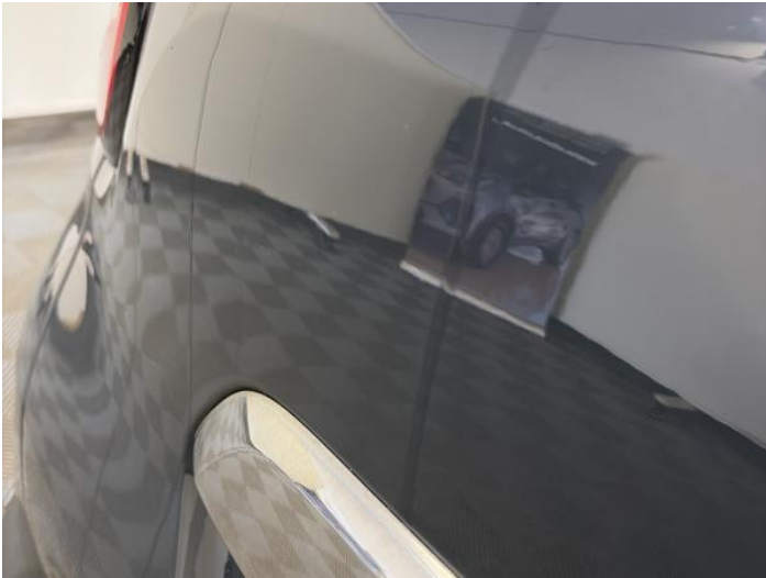
15: Tailgate Dented Between 10mm + 30mm