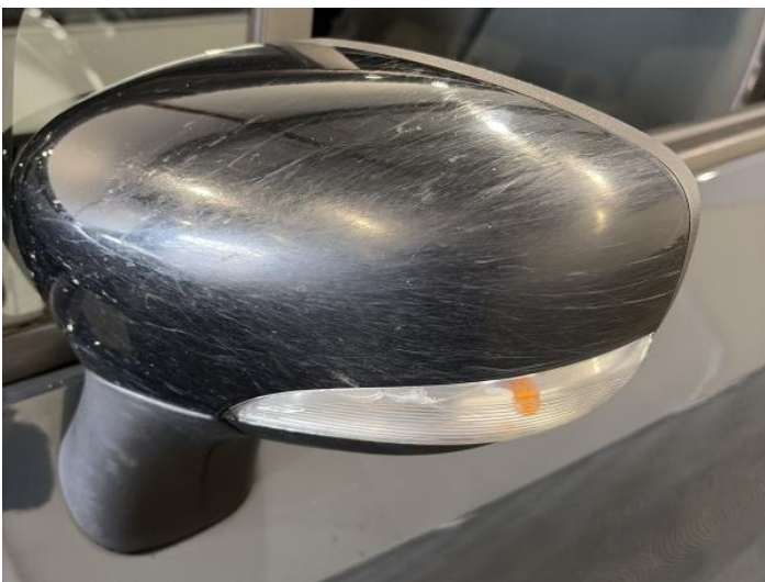
7: Flasher Side Repeater ns Broken Replace