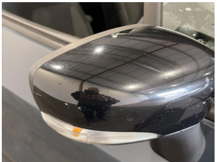
20: Door Mirror Assy osf Scratched (Painted) UpTo 25mm Thru Paint