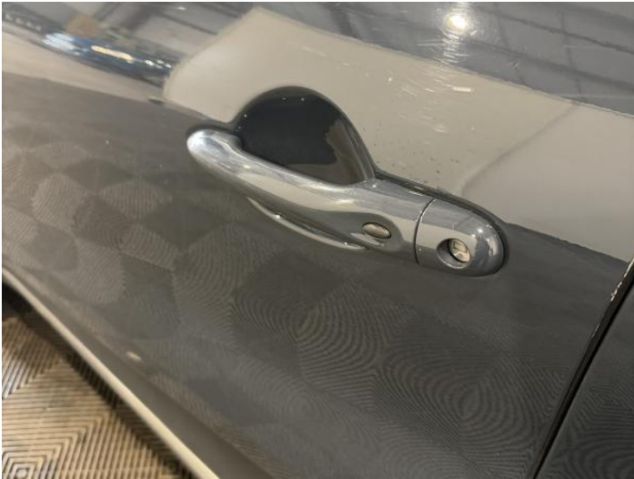
9: Door nsf Chipped Multiple Chips