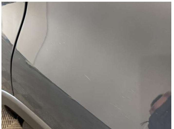
14: Qtr Panel nsr Scratched UpTo 25mm Thru Paint