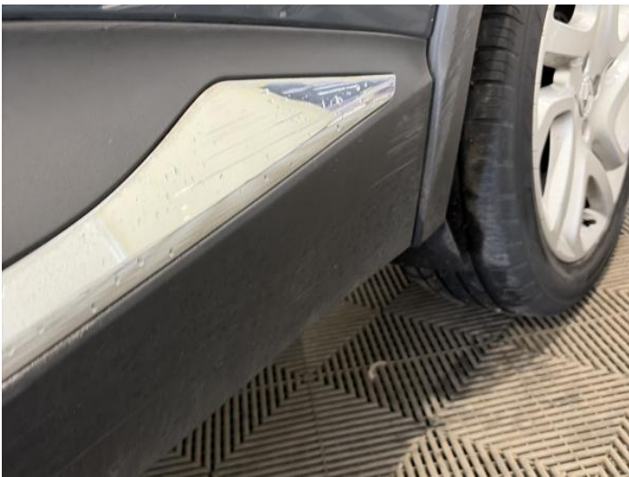
11: Door Moulding nsr Scuffed (Unpainted) Over 100mm