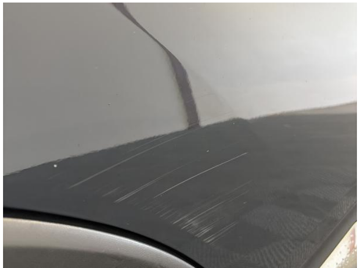
18: Door osr Scratched Over 25mm Thru Paint