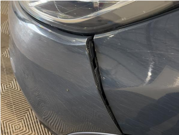
3: Bumper Front Insecure Action Required