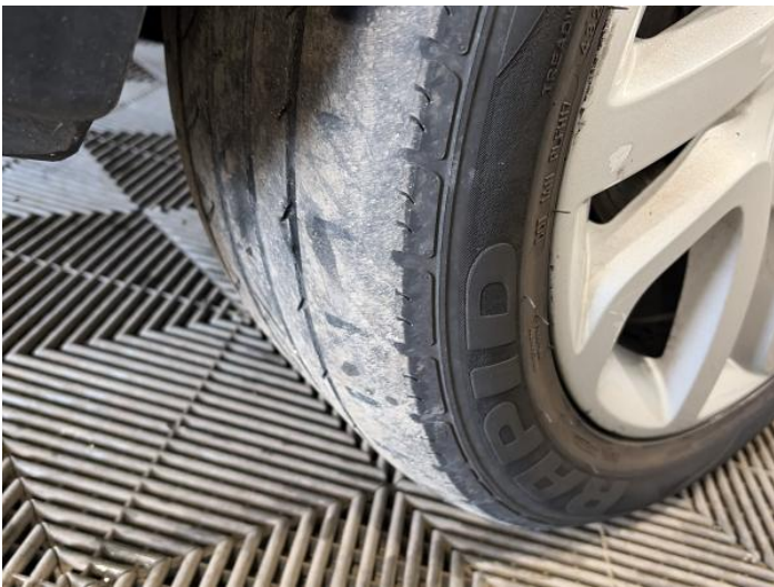
23: Tyre nsf Damaged Replace