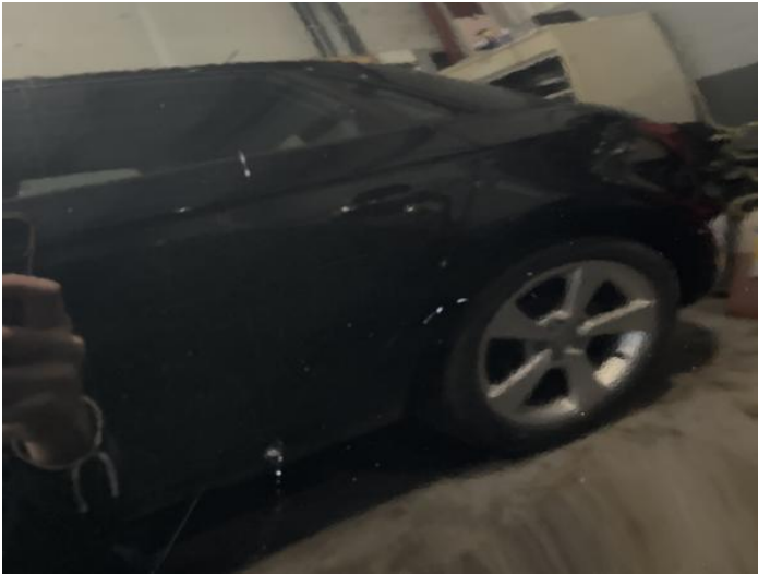
9: Door nsr Scratched Over 25mm Thru Paint