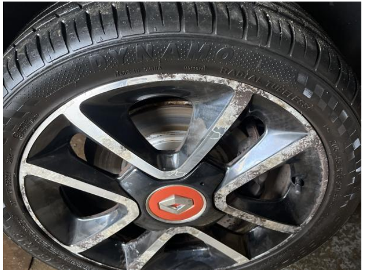
6: Wheel nsf Scratched Over 50mm