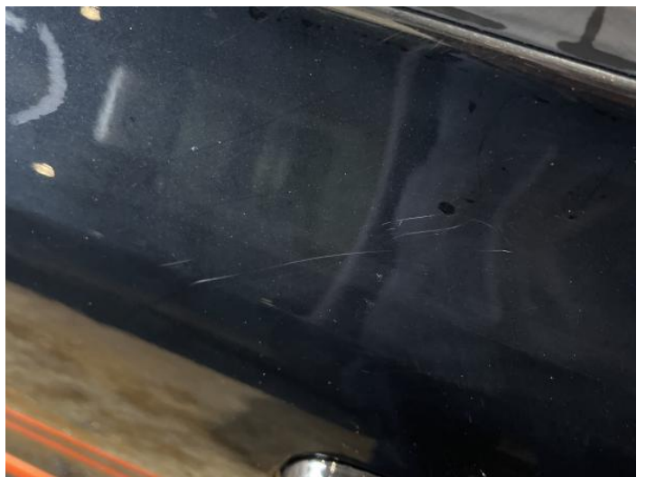
8: Door nsf Scratched Over 25mm Not Thru Paint