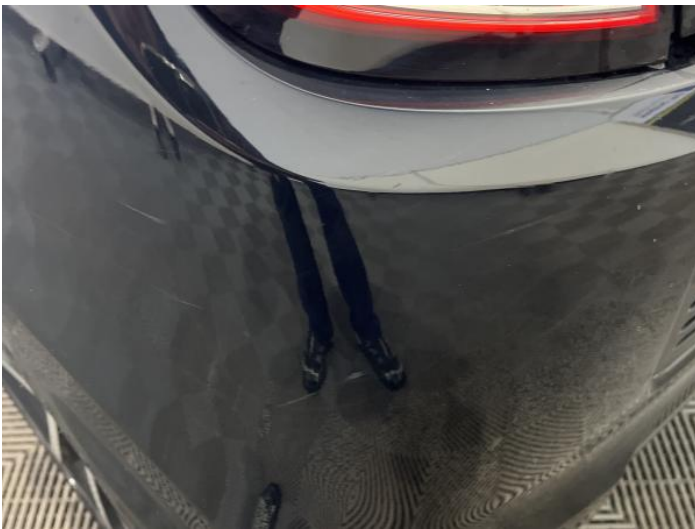
11: Bumper Rear Scratched 25 to 100mm Thru Paint