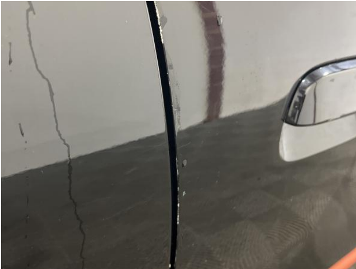
15: Door osf Chipped Edge Chip