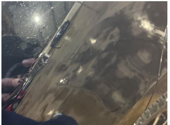
2: Wing osf Chipped 1 To 5