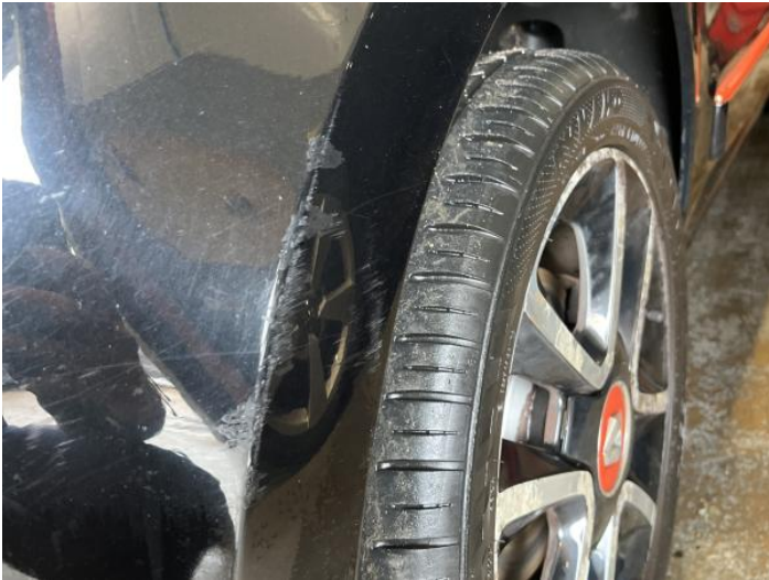
3: Bumper Front Scratched Over 100mm Thru Paint