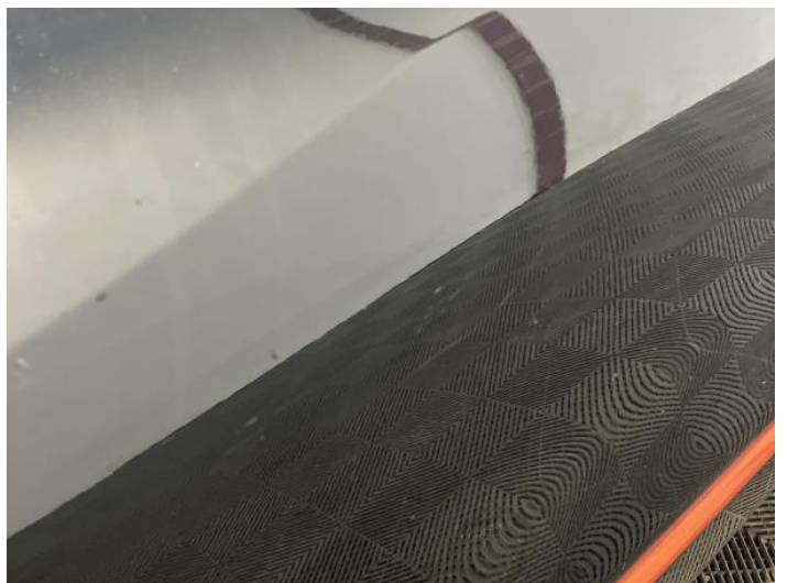
14: Door osr Scratched Over 25mm Thru Paint