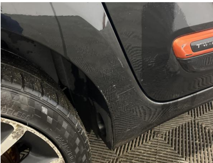
13: Qtr Panel osr Scratched Over 25mm Thru Paint