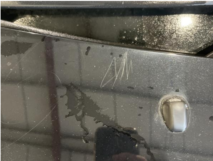
5: Bonnet Scratched Over 25mm Thru Paint