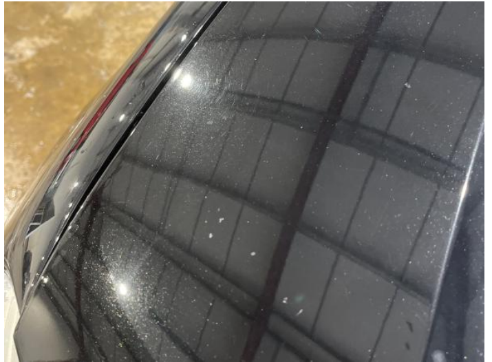
4: Bonnet Chipped Multiple Chips