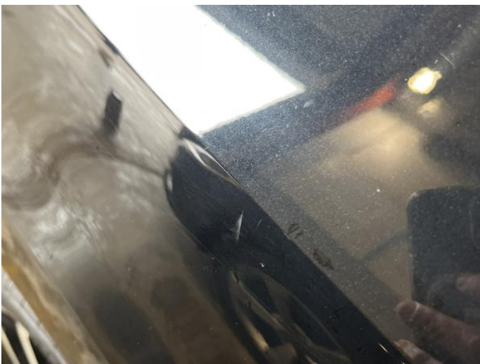
7: Wing nsf Scratched Over 25mm Not Thru Paint