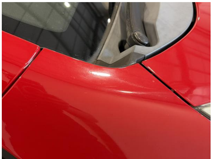
14: Wing osf Chipped 1 To 5