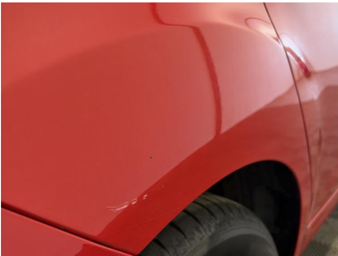
11: Qtr Panel osr Scratched Over 25mm Thru Paint