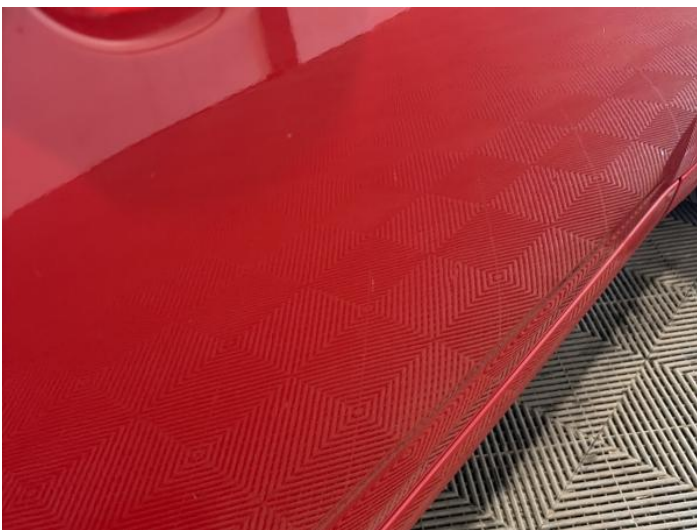
13: Door osf Scratched UpTo 25mm Thru Paint