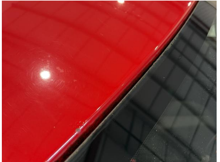
16: Roof Chipped Edge Chip