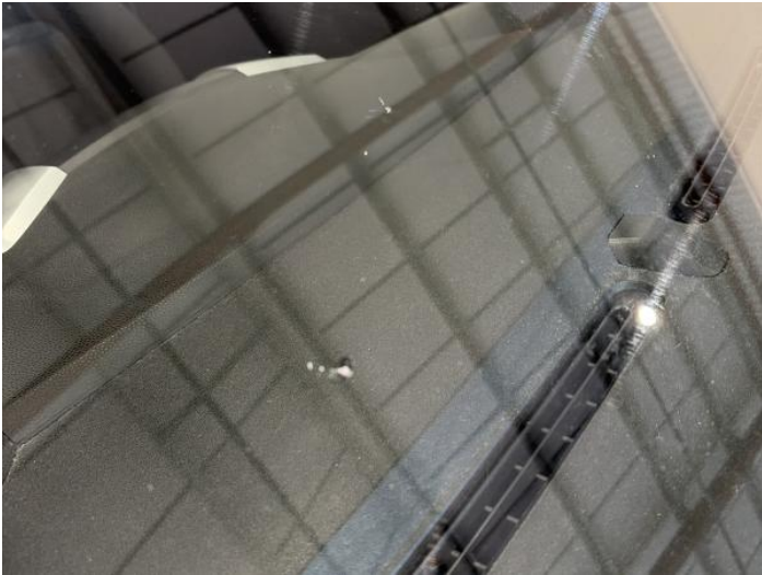
15: Screen Front Chipped Over 10mm