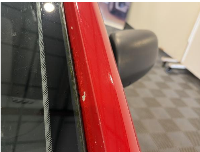
19: A Post ns Scratched Over 25mm Thru Paint