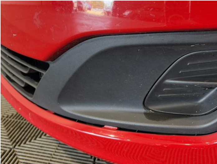
3: Bumper Front Moulding Scuffed (Unpainted) Over 100mm