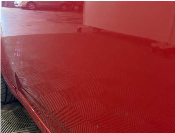
5: Door nsf Dented Between 10mm + 30mm