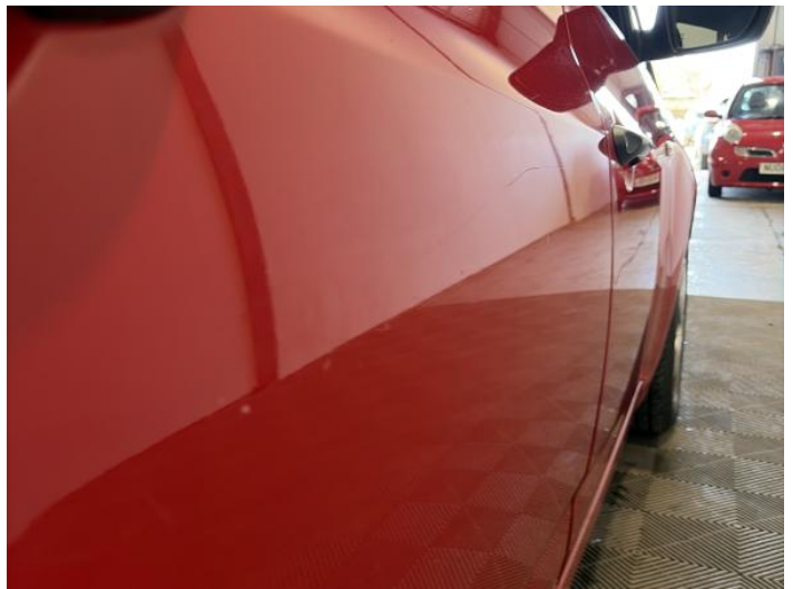
12: Door osr Scratched Over 25mm Thru Paint