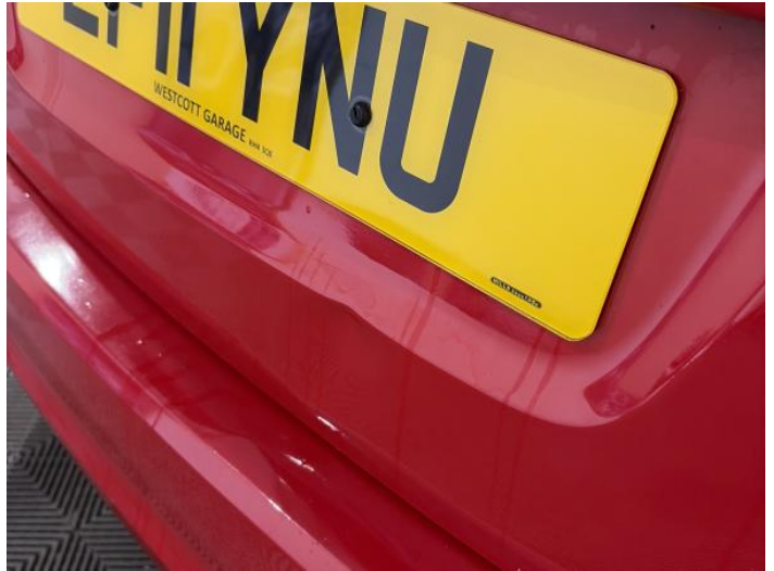
10: Tailgate Dented Over 30mm