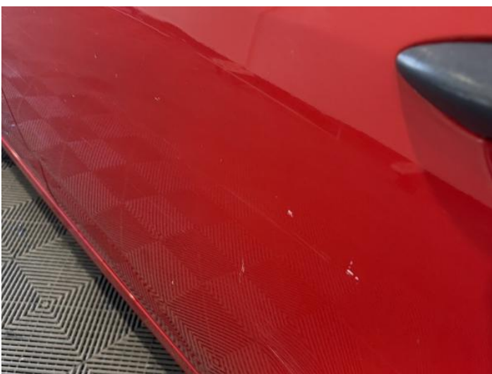
7: Door nsr Dented With Paint Damage