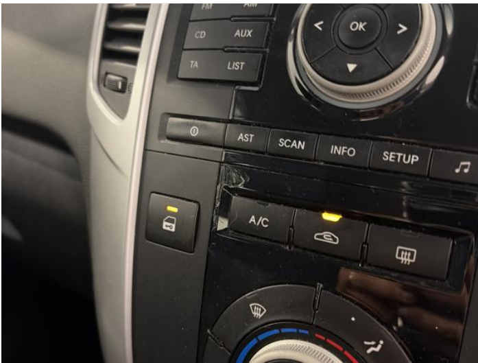
17: Centre Console Front Scuffed Over 25mm