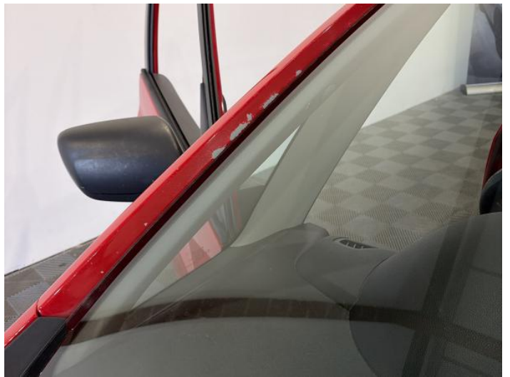
18: A Post os Scratched Over 25mm Thru Paint