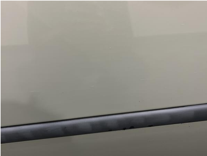
9: Door nsf Scratched Over 25mm Thru Paint