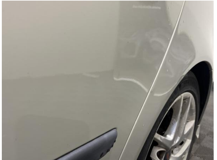
10: Door nsr Dented Between 10mm + 30mm