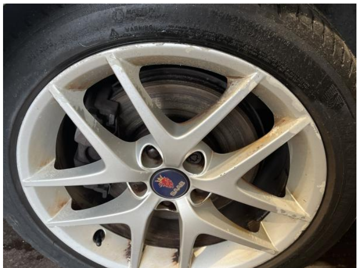
8: Wheel nsf Scratched Over 50mm