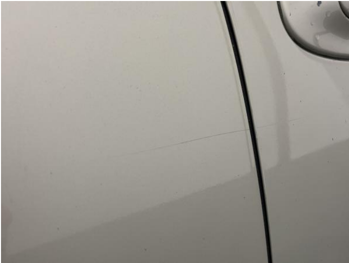
15: Door osr Scratched Over 25mm Thru Paint