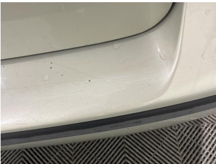
13: Bumper Rear Scratched Over 100mm Thru Paint