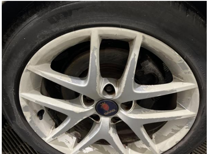
12: Wheel nsr Corroded Light