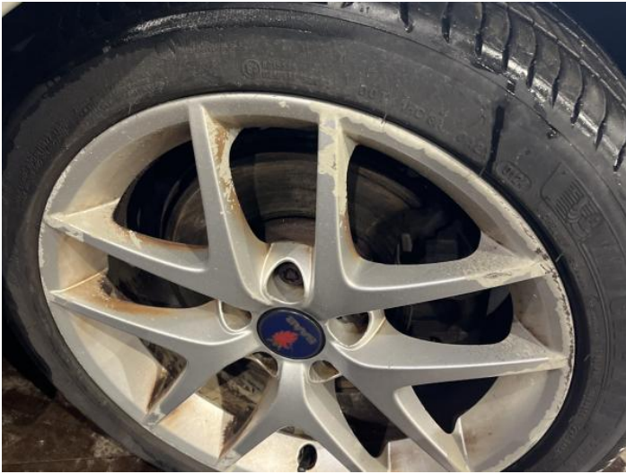
3: Wheel osf Scratched Over 50mm