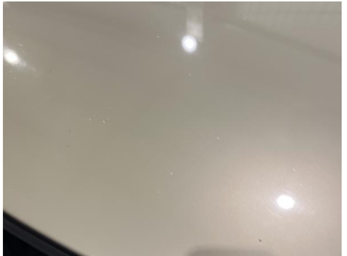
6: Roof Chipped Multiple Chips