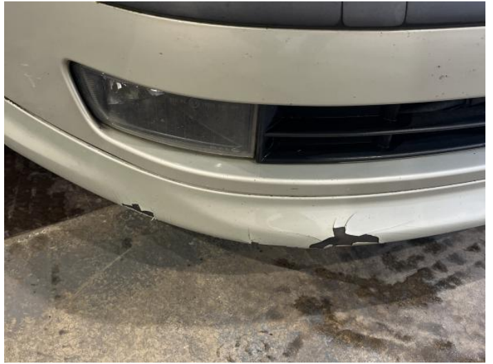
4: Bumper Front Scratched Over 100mm Thru Paint