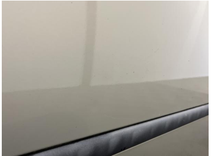
16: Door osf Dented Between 10mm + 30mm