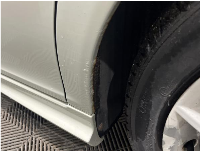
11: Qtr Panel nsr Rusted Over 5mm