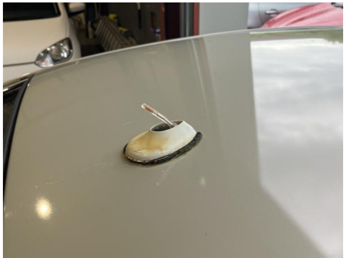
18: Aerial Missing Replace