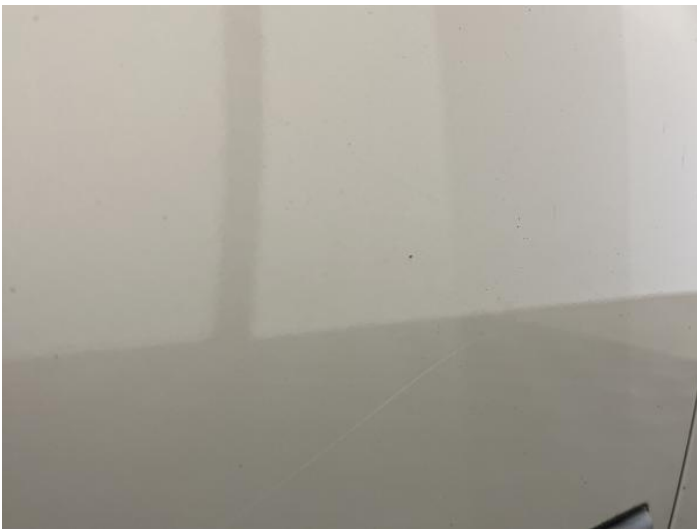
17: Door osf Scratched Over 25mm Thru Paint