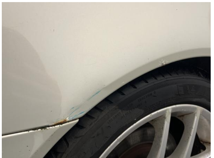
14: Qtr Panel osr Rusted Over 5mm