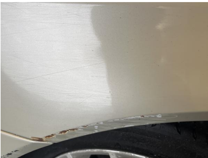
7: Wing nsf Scratched Rusted