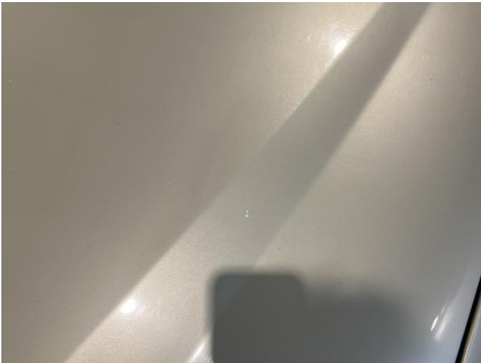
5: Bonnet Chipped Multiple Chips