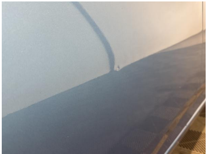
12: Door osr Chipped 1 To 5