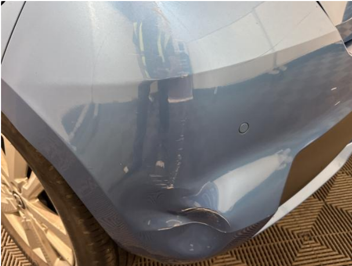
9: Bumper Rear Dented With Paint Damage