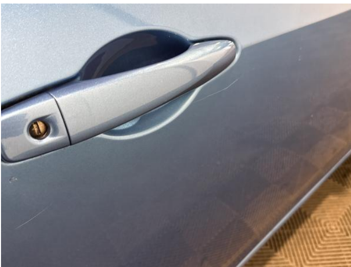
13: Door osf Scratched Over 25mm Thru Paint