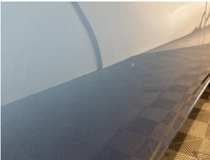
11: Door osr Dented Between 10mm + 30mm