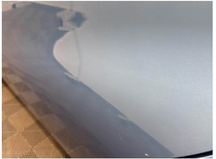
6: Door nsr Scratched Over 25mm Thru Paint