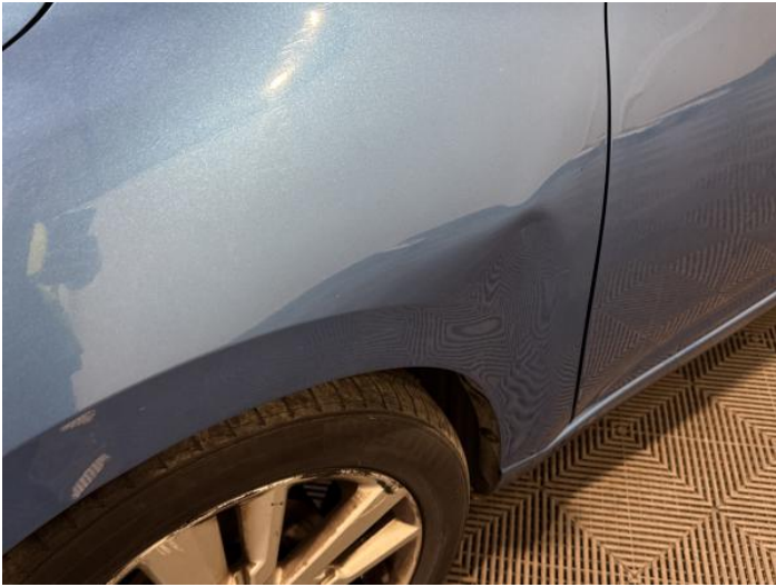
3: Wing nsf Dented With Paint Damage