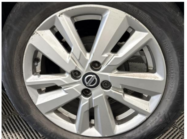
8: Wheel nsr Scratched Up To 50mm