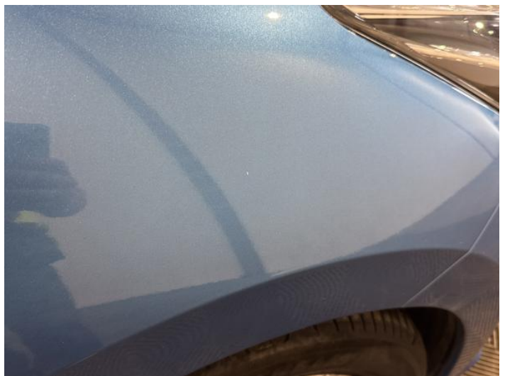
14: Wing osf Chipped 1 To 5