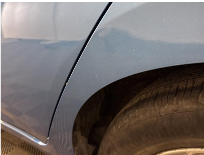
7: Qtr Panel nsr Scratched Up To 25mm Thru Paint