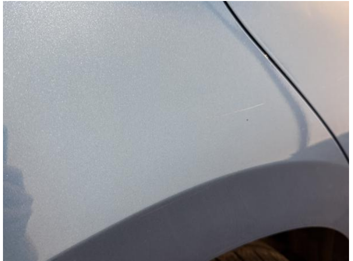
10: Qtr Panel osr Scratched Over 25mm Thru Paint