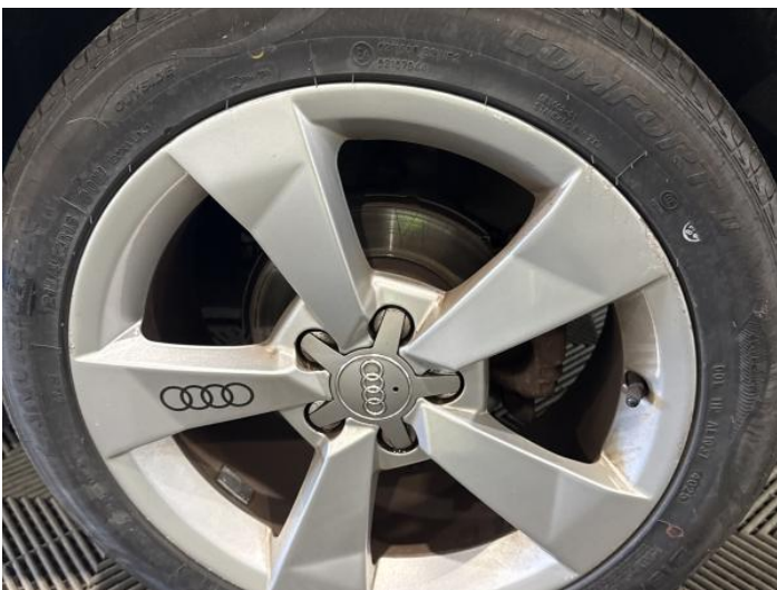
7: Wheel nsr Scratched Up To 50mm