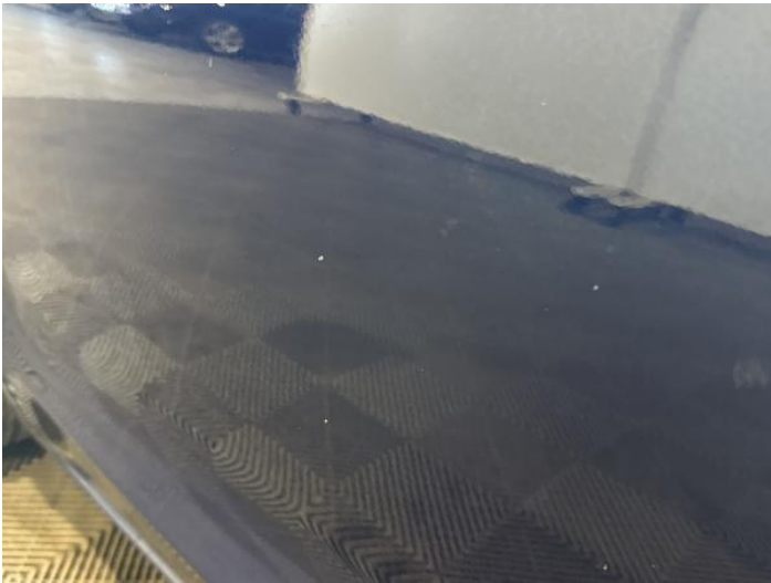
5: Door nsf Chipped 1 To 5