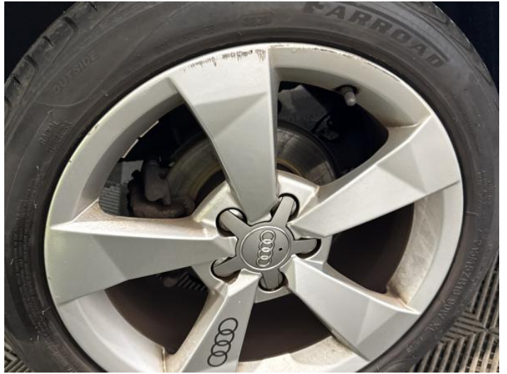
10: Wheel osf Scratched Over 50mm