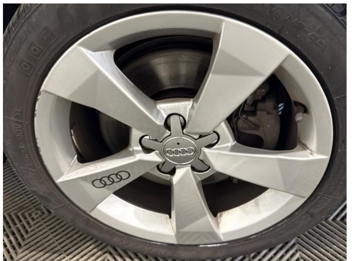
14: Wheel osf Scratched Over 50mm