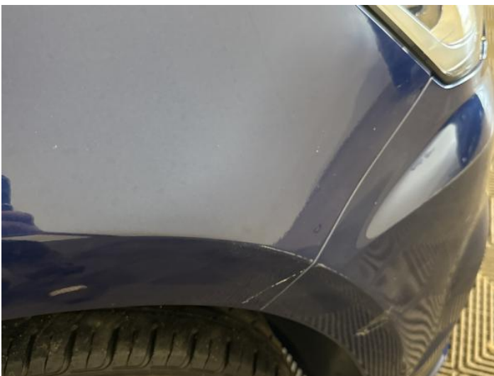
13: Wing osf Scratched Over 25mm Thru Paint