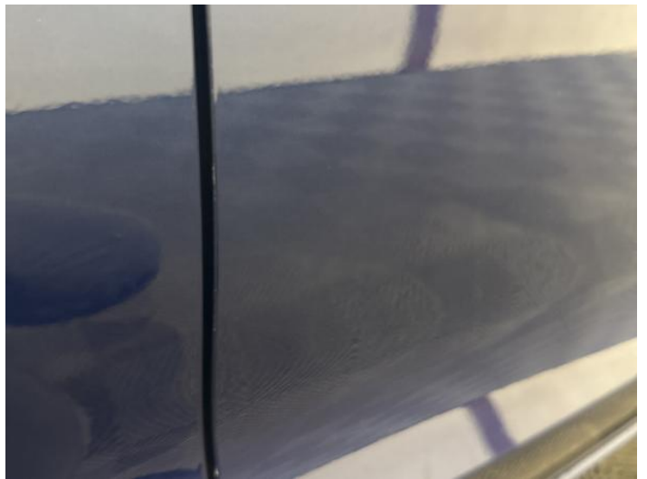
12: Door osf Chipped Edge Chip