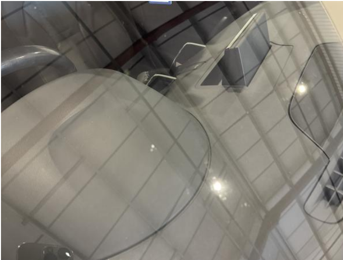
15: Screen Front Chipped UpTo 10mm