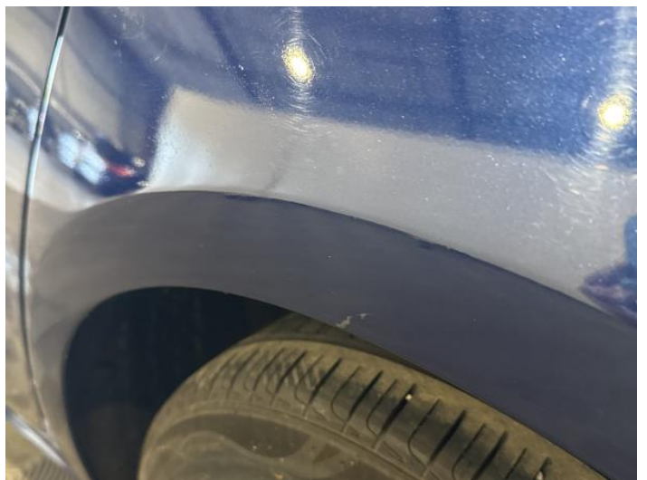
8: Qtr Panel nsr Poor Previous Repair Poor Paint