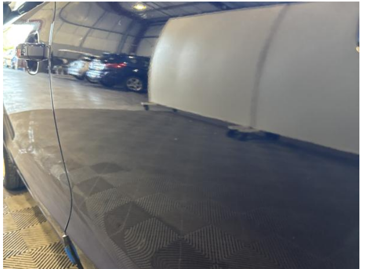
6: Door nsr Dented Between 10mm + 30mm