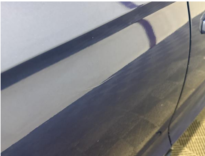
11: Door osf Scratched Over 25mm Thru Paint