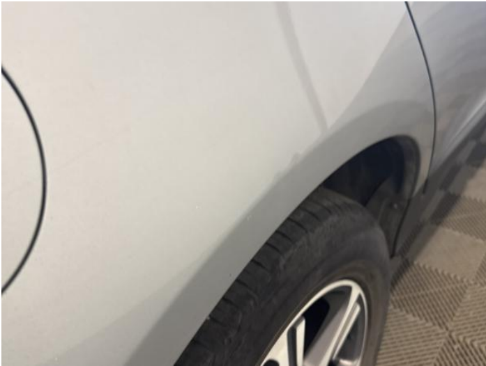
15: Qtr Panel osr Chipped 1 To 5