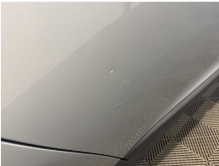
17: Door osr Scratched Over 25mm Thru Paint