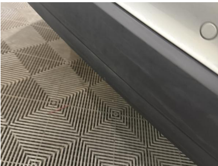
13: Bumper Rear Moulding Scuffed (Unpainted) Over 100mm