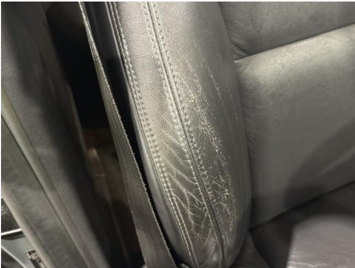
1: Seat Back Cover osf Scuffed Over 25mm