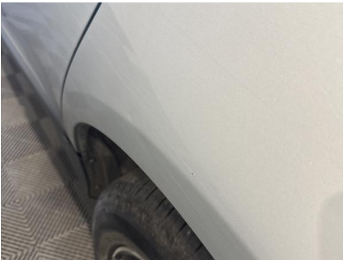
11: Qtr Panel nsr Dented Between 10mm + 30mm