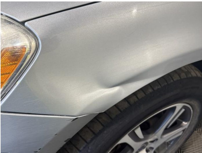
5: Wing nsf Dented Over 30mm