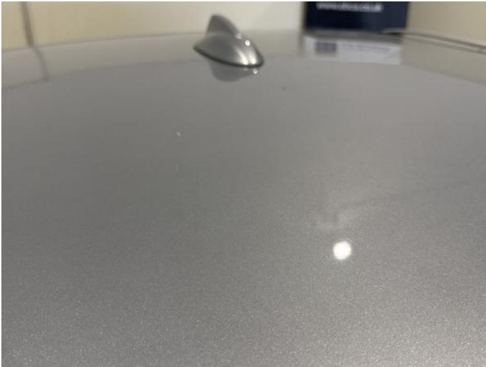
21: Roof Dented Over 30mm