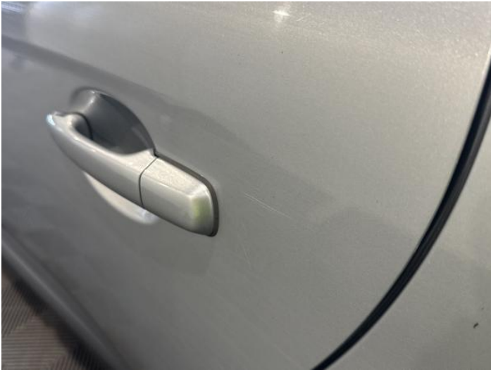
9: Door nsr Scratched Over 25mm Thru Paint