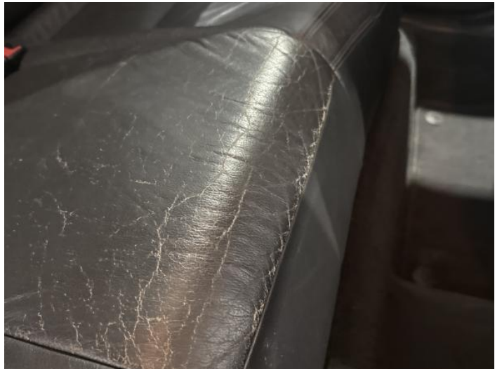
2: Seat Back Cover osr Scuffed Over 25mm