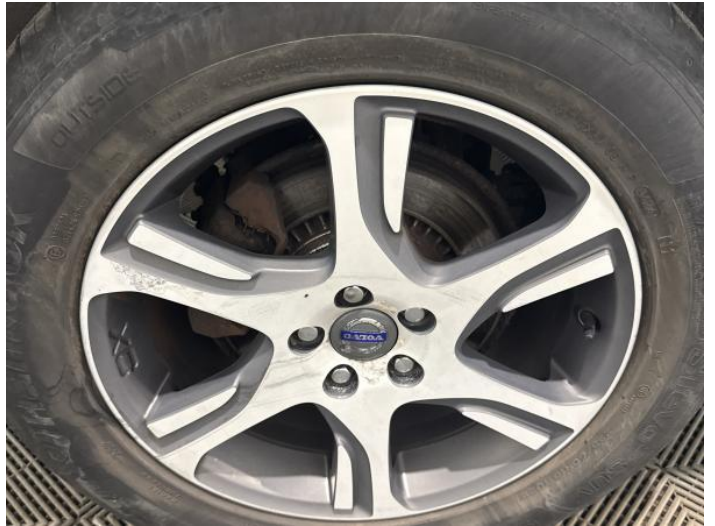
16: Wheel osr Scratched Over 50mm