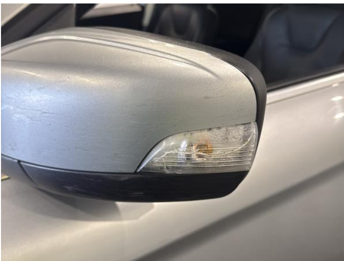
7: Flasher Side Repeater ns Broken Replace