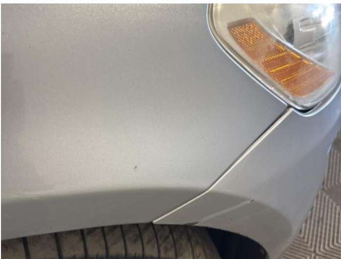
19: Wing osf Chipped 1 To 5