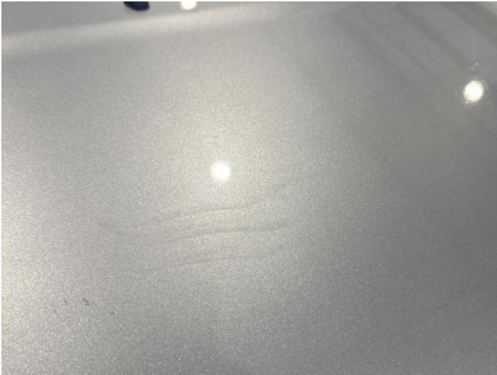
3: Bonnet Scratched Over 25mm Thru Paint