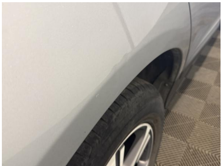
14: Qtr Panel osr Dented Between 10mm + 30mm