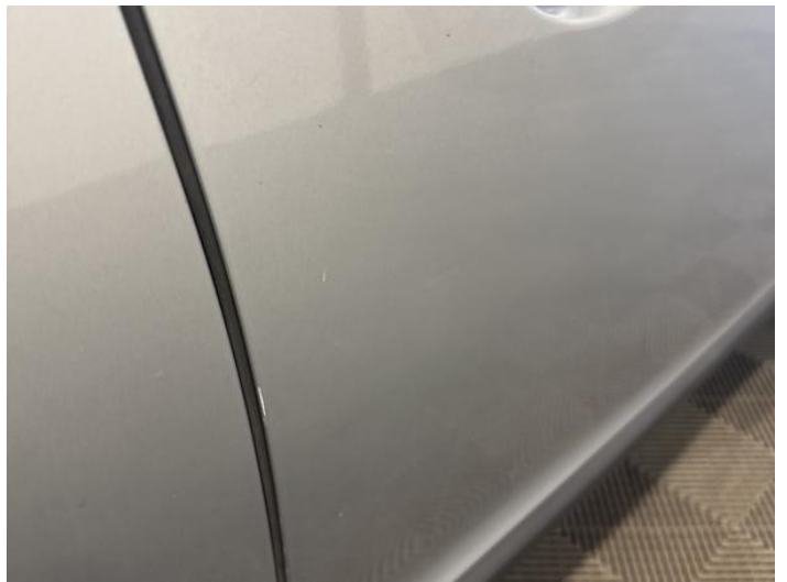
18: Door osf Chipped Edge Chip