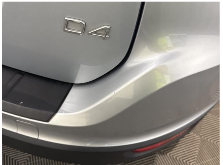
12: Bumper Rear Chipped 1 To 5