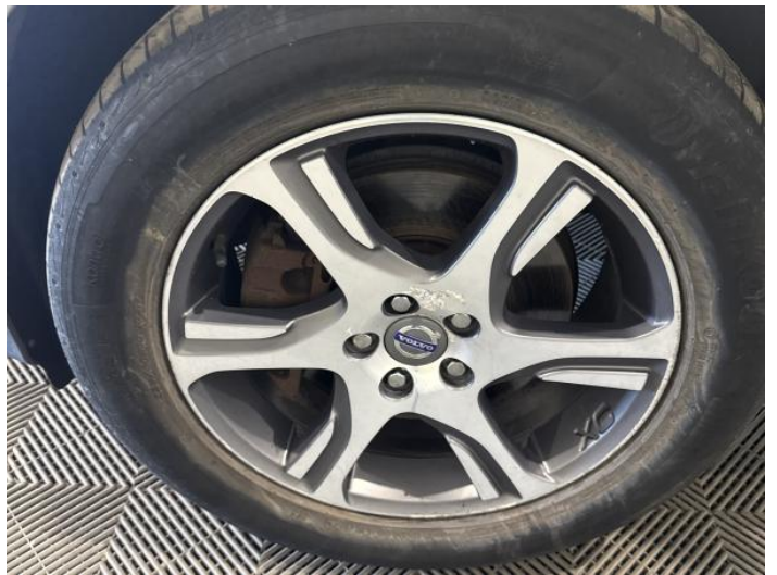
6: Wheel nsf Scratched Over 50mm