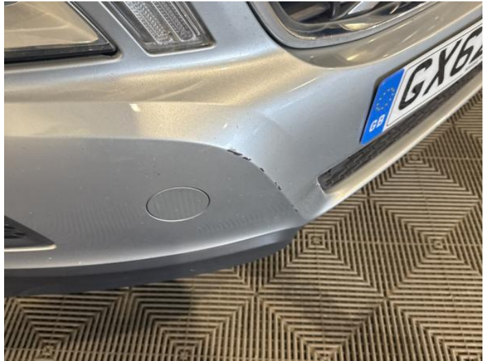
4: Bumper Front Scratched Over 100mm Thru Paint