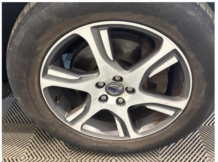
20: Wheel osf Scratched Over 50mm