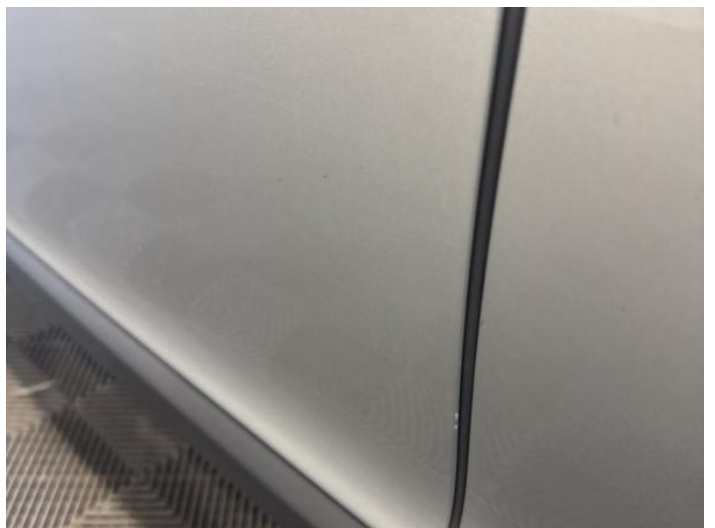
8: Door nsf Chipped Edge Chip