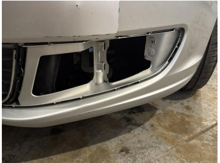
4: Fog Lamp Surround ns Missing Replace