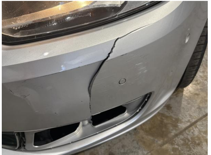
2: Bumper Front Cracked Over 25mm