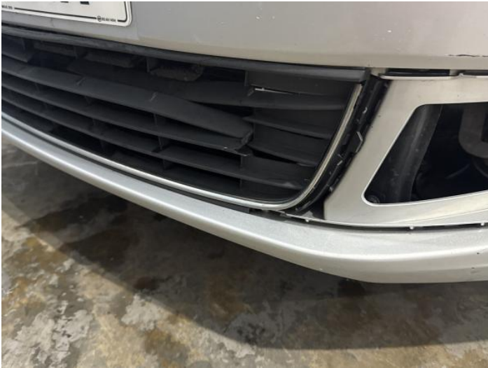
3: Bumper Front Grill Broken Replace