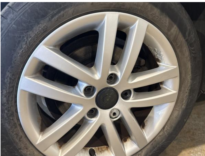
13: Wheel osr Corroded Light