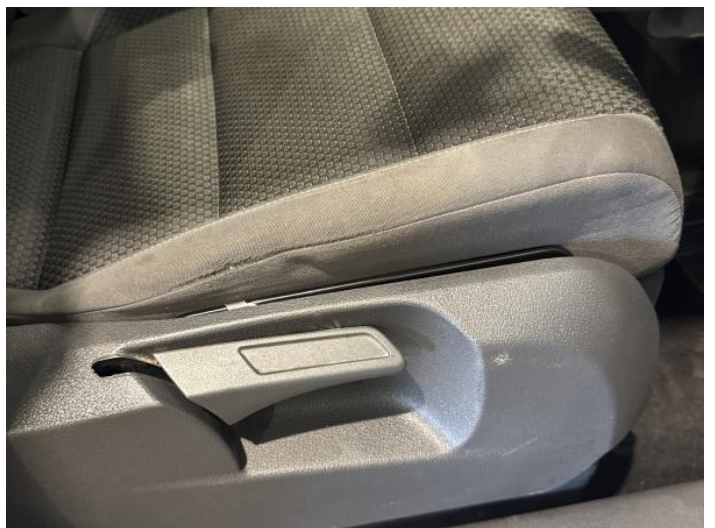
20: Fascia Trim Damaged Replace