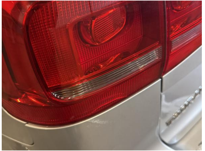
10: Lamp nsr Broken Replace