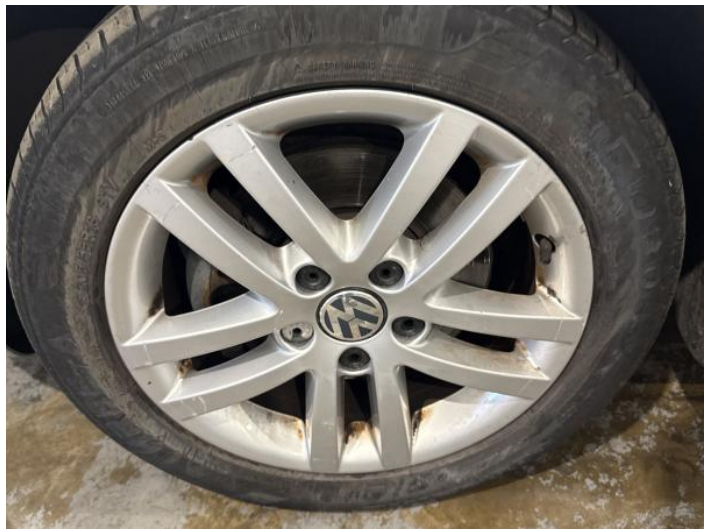
6: Wheel nsf Scratched Over 50mm