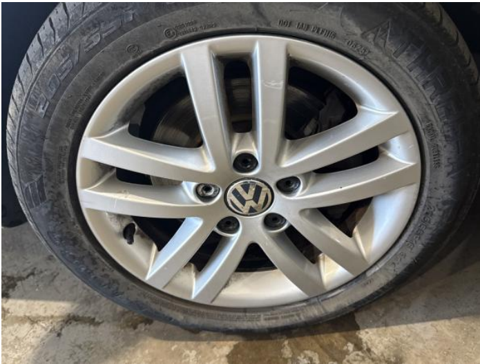
17: Wheel osf Scratched Over 50mm