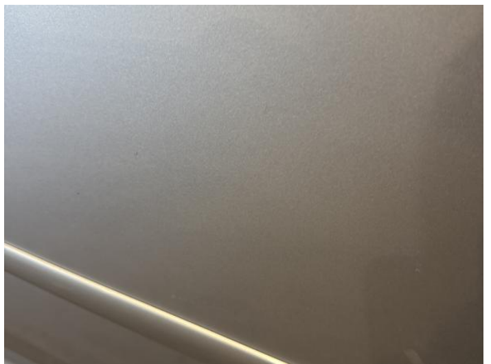
14: Door osr Chipped 1 To 5