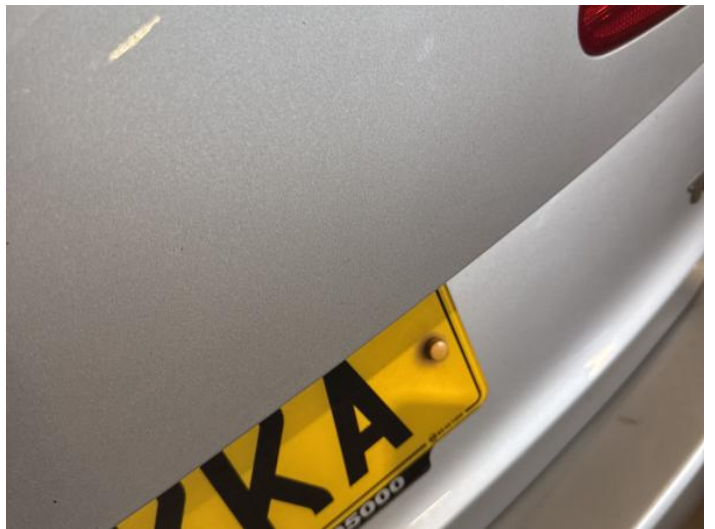
12: Tailgate Scratched Up To 25mm Thru Paint