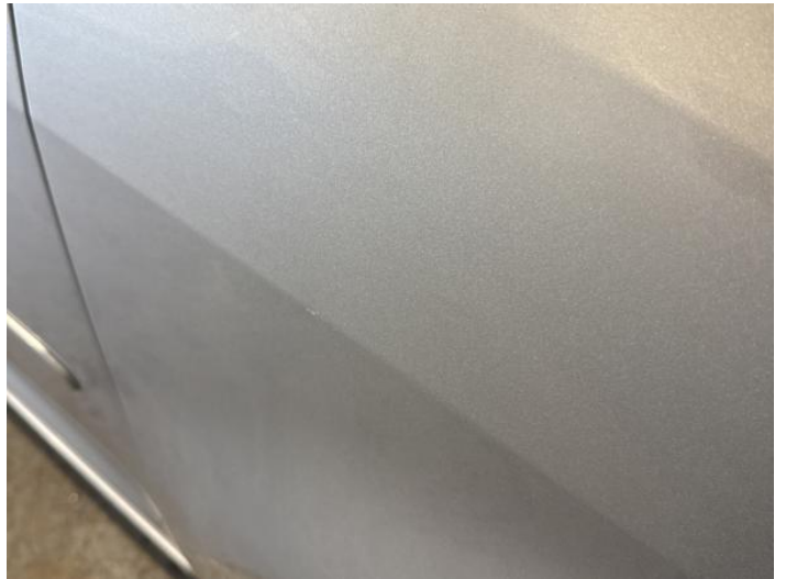
18: Wing osf Chipped 1 To 5