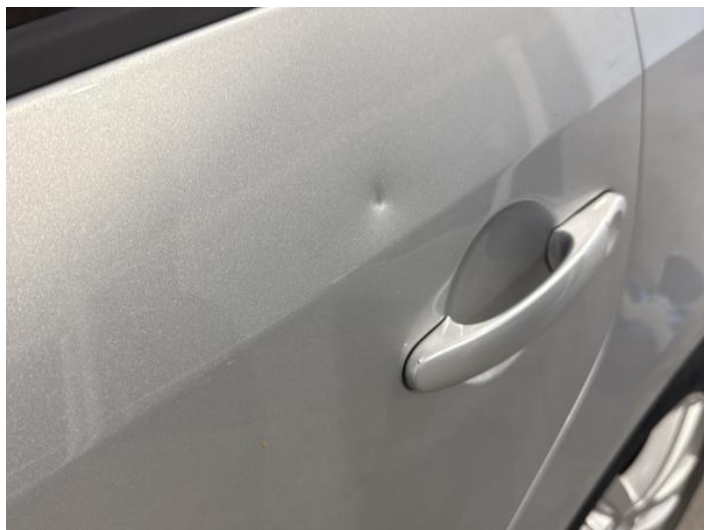
8: Door nsr Dented Between 10mm + 30mm