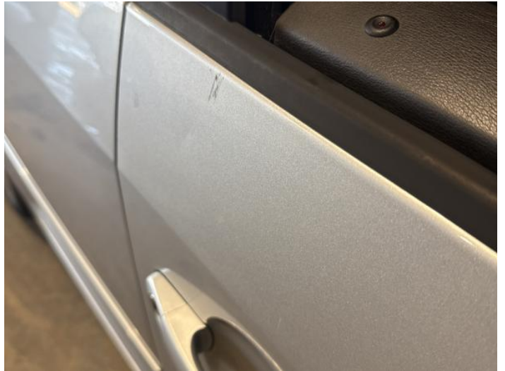
16: Door osf Dented Over 30mm