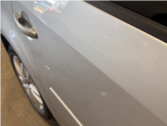
15: Door osr Dented 2 Or Less UpTo 10mm