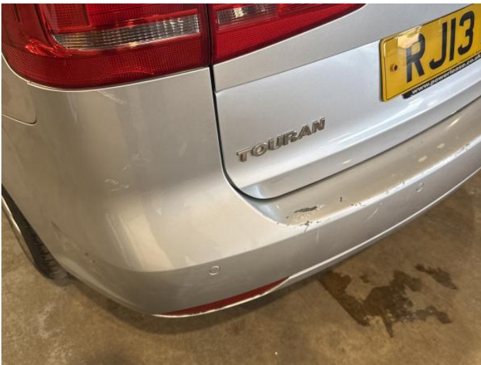
11: Bumper Rear Dented With Paint Damage