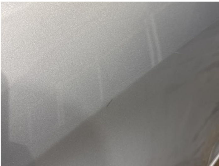
5: Wing nsf Scratched UpTo 25mm Thru Paint