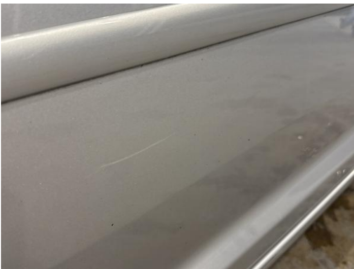
7: Door nsf Scratched Over 25mm Thru Paint