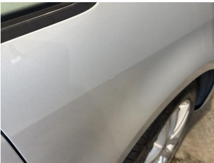
19: Wing osf Dented 2 Or Less UpTo 10mm