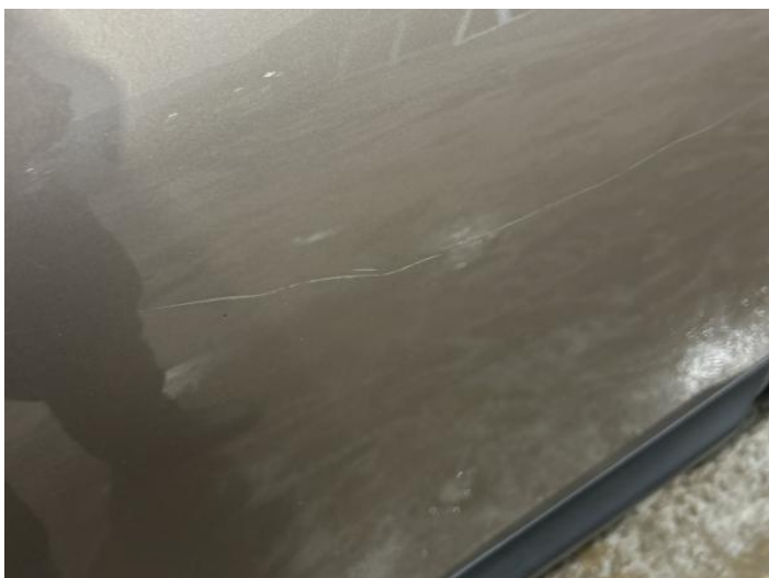
5: Door osr Scratched Over 25mm Thru Paint