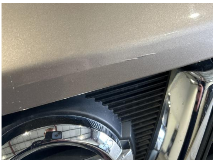
17: Bonnet Scratched Over 25mm Thru Paint