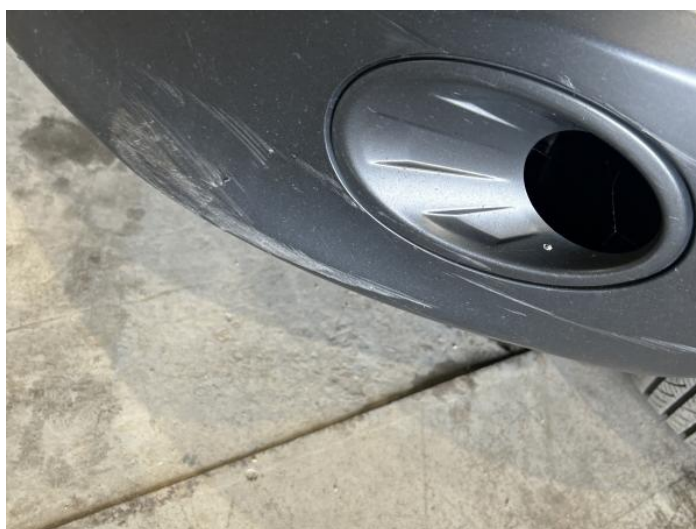
18: Bumper Front Moulding Scuffed (Unpainted) Over 100mm