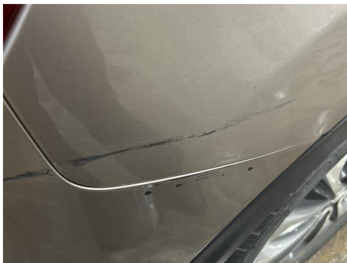
6: Qtr Panel osr Scratched Over 25mm Thru Paint