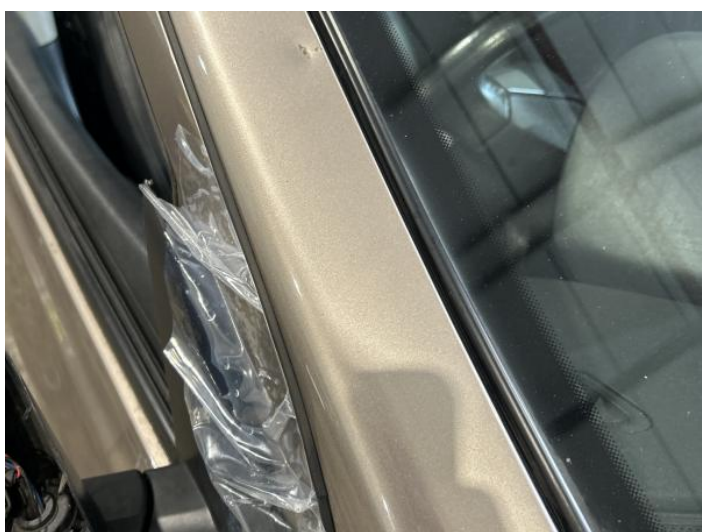
19: A Post os Dented With Paint Damage