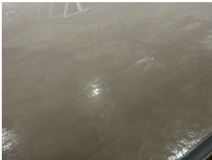
4: Door osf Scratched Over 25mm Thru Paint