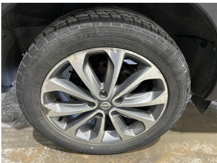
7: Wheel osr Corroded Light