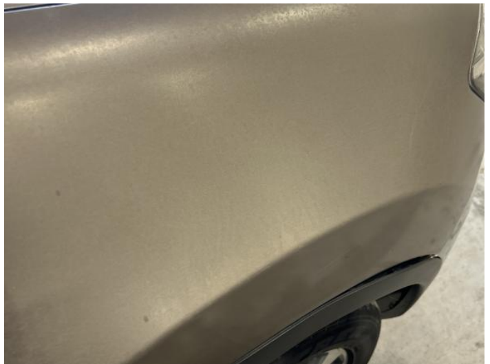
2: Wing osf Poor Previous Repair Poor Paint