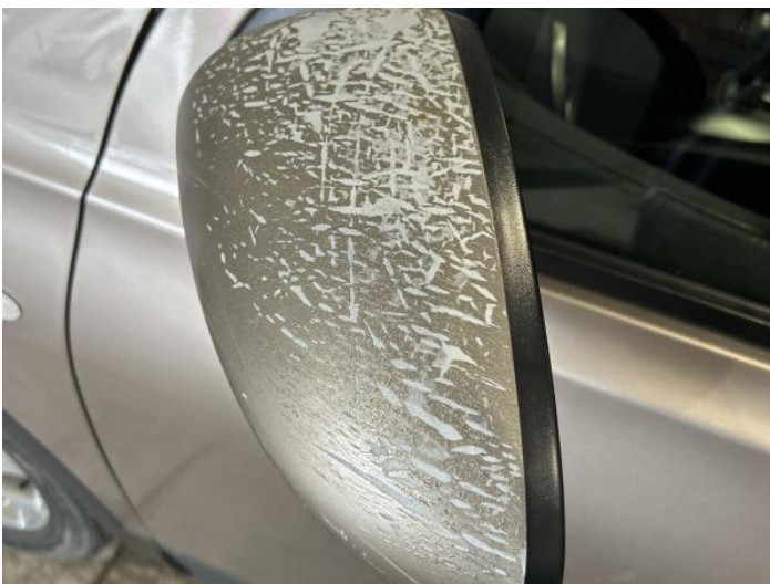
13: Door Mirror Assy nsf Scratched (Painted) Over 25mm Thru Paint