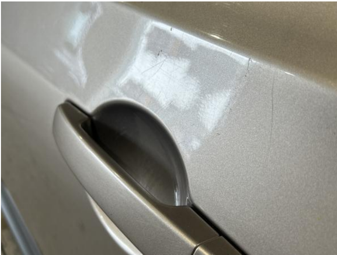
11: Door nsr Scratched Over 25mm Not Thru Paint