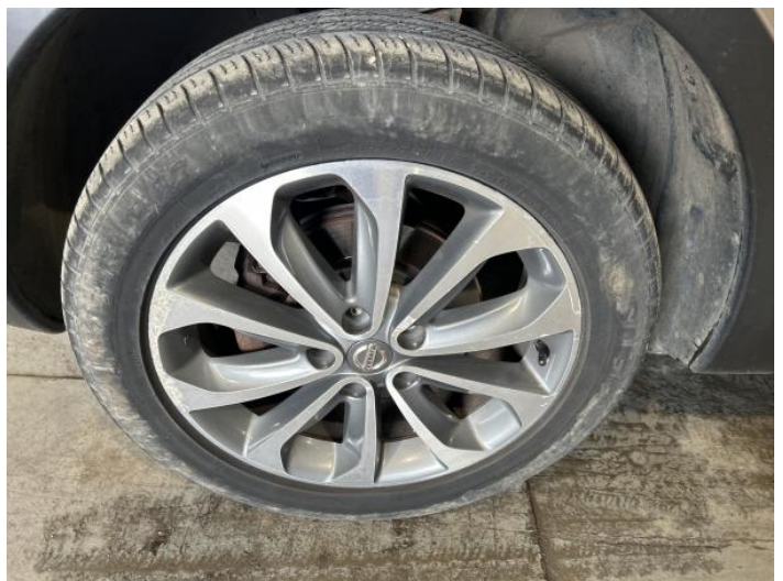
14: Wheel nsf Corroded Light