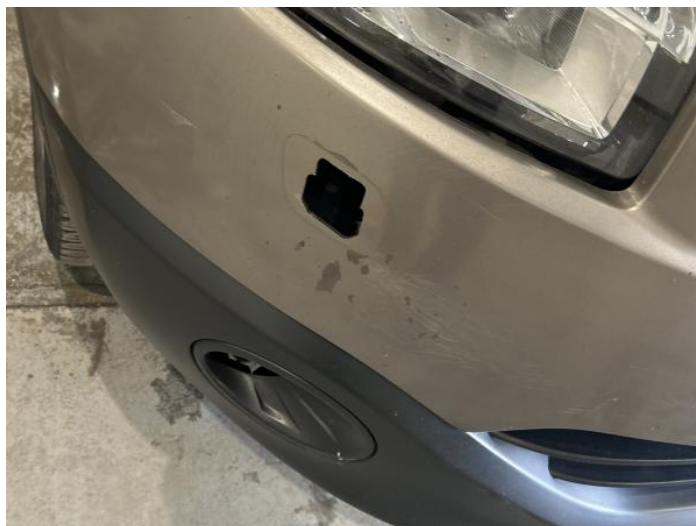
16: Bumper Front Scratched Over 100mm Thru Paint