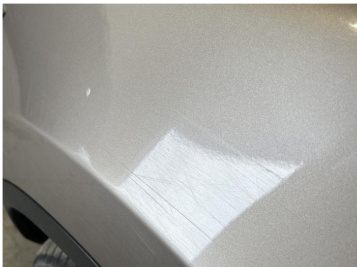
15: Wing nsf Scratched Over 25mm Not Thru Paint