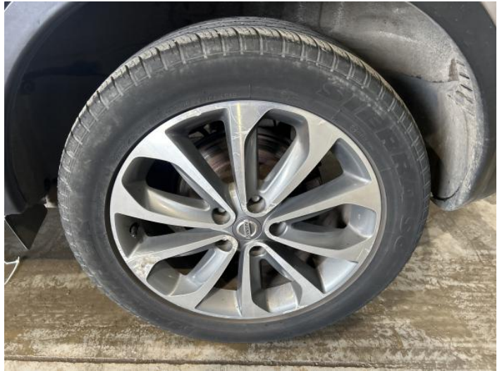
10: Wheel nsr Corroded Light