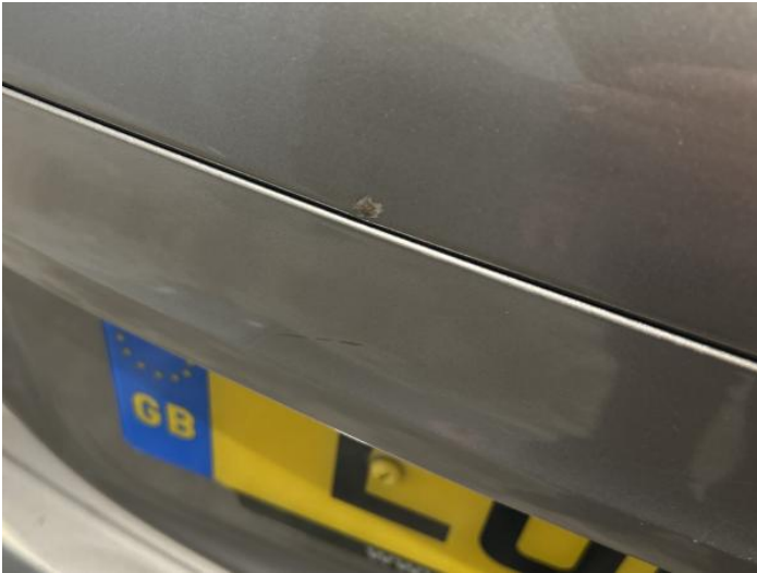
9: Tailgate Chipped 1 To 5