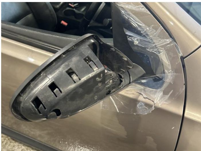
3: Door Mirror Assy osf Broken Replace