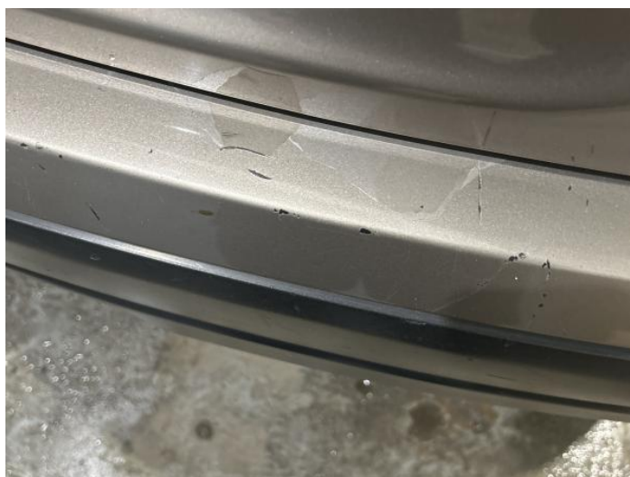
8: Bumper Rear Poor Previous Repair Paint Flake