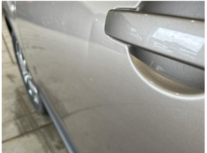
12: Door nsf Dented Over 30mm