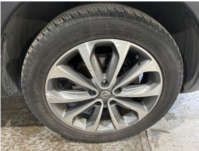
1: Wheel osf Corroded Light